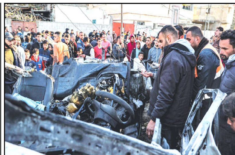
People gather to inspect the remains of a wrecked police vehicle that was destroyed by reported Israeli bombardment at Rafah in the southern Gaza Strip.