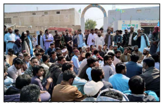
NASEERABAD: Members of Jamote Quami Movement are holding protest demonstration against Returning Officer of the Constituency PB-13, held outside Polling Station in Naseerabad.