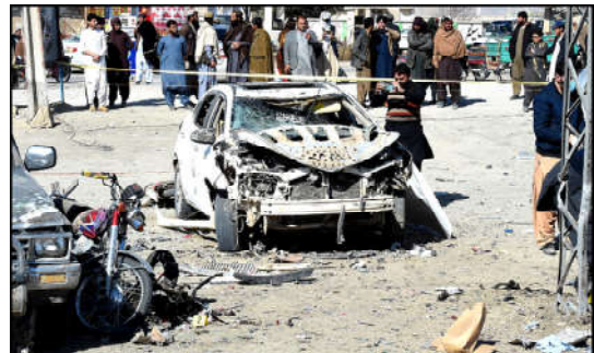
QUETTA: Scenes of devastation after a bomb exploded near the election office of an independent candidate in Khanozai Pishin, Quetta, while security officials are collecting evidence.