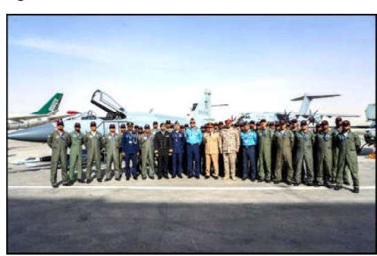
RIYADH: Deputy Chief of the Air Staff (Operations), Air Marshal Abdul Moeed Khan in a group photo along with Foreign dignitaries and Pakistan Air Force (PAF) contingent during World Defence Air Show 2024 held in Riyadh.

He said that it also becomes national duty of all political parties and masses to ensure free and fair elections, besides the government and its concerned departments.