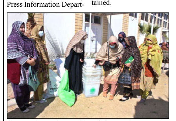
QUETTA: Polling staff receiving polling material at distribution Centre for General Elections 2024.

He also urged the people to cooperate with security forces to maintain peace in the area.