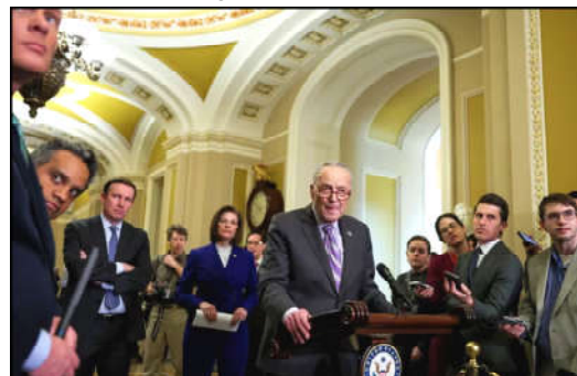
U.S. Senate Majority Leader Chuck Schumer (D-NY) listens to questions during the weekly Democratic Caucus lunch press conference at the U.S. Capitol building in Washington, U.S.

The Hamas offer, the contents of which were first reported by Reuters, is a response to an earlier proposal drawn up by U.S. and Israeli spy chiefs and delivered to Hamas last week by Qatari and Egyptian mediators. U.S. Secretary of State Antony Blinken discussed the offer with Netanyahu after arriving in Israel following talks with the leaders of Qatar and Egypt, the countries that have acted as mediators in the conflict. There remain major gaps between the two sides: Israel has previously said it will not pull its troops out of Gaza or end the war until Hamas is wiped out. But sources described Hamas as taking a new approach to its longstanding demand to end the war, now proposing this as an issue to be resolved in future talks rather than a pre-condition for the truce. A source close to the negotiations said the Hamas counterproposal did not require a guarantee of a permanent ceasefire at the outset, but that an end to the war would have to be agreed before final hostages were freed.