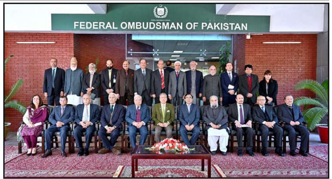
ISLAMABAD: President Dr. Arif Alvi in a group photo during his visit to the office of the Wafaqi Mohtasib.

tered online in 2023, marking an increase of 47 per cent from 2022. Similarly, 22,321 complaints were received through Mohtasib's mobile App in 2023, representing a 21 per cent increase from 2022. The meeting was also briefed on the Integrated Complaint Resolution System, processing 18,469 complaints in 2023, alongside Mohtasib's teams conducting Khuli Kutcheris and inspection visits to address people's grievances against government agencies.