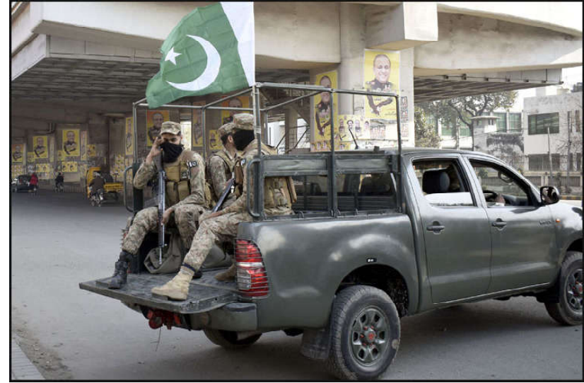
LAHORE: Pak Army soldiers patrol a road to ensure security ahead of general election, in Provincial Capital.