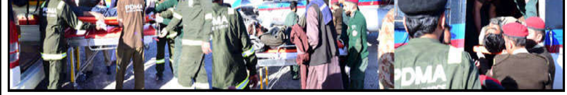
QUETTA: On the special directives of the caretaker Chief Minister Balochistan Mir Ali Mardan Khan Domki injured of Killa Saifullah bomb blast being shifted to CMH Quetta through helicopter

Pakistan has witnessed a surge in terrorist activities, especially in Khyber Pakhtunkhwa (KP) and Balochistan, since the outlawed militant group Tehreek-i-Taliban Pakistan ended its ceasefire with the government in November 2022.