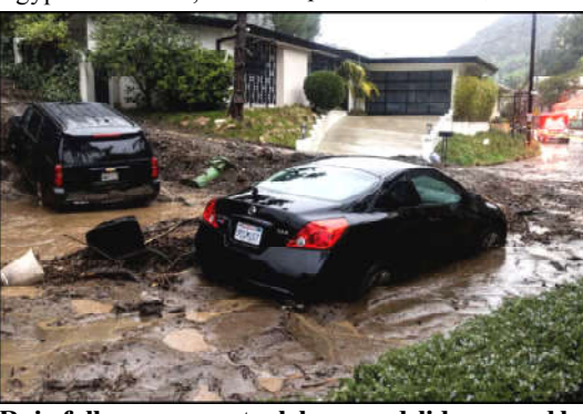
Rain falls over cars stuck by a mudslide, caused by an ongoing rain storm in Studio City, California.