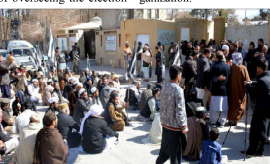
OUETTA: Worker of Jamiat Ulema-e-Islam candidate PB-39 hold protest in front of the DC office.

election reflects a collective commitment to advancing the interests of Pakistani cricket and ushering in positive reforms within the or-