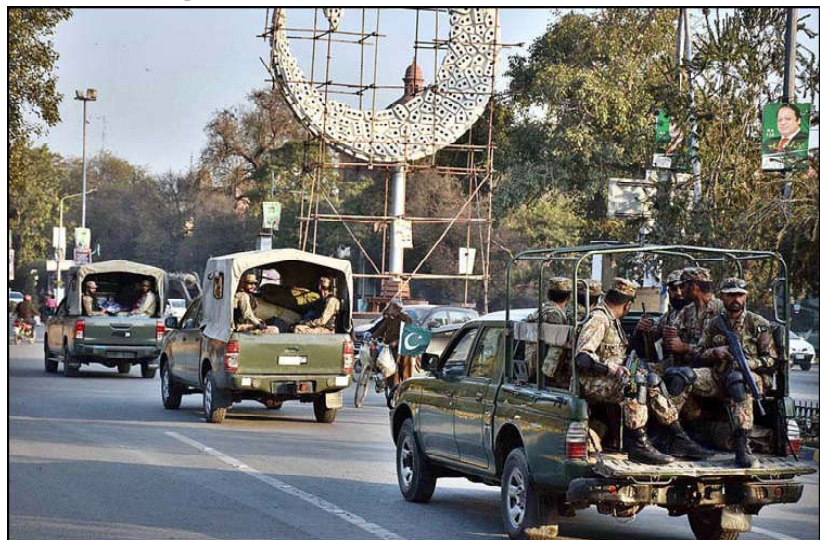
LAHORE: A convoy of army personnel patrols along a road in the city to develop a sense of protection among the masses and maintain law and order situation during the General Election 2024.

Senator Mushahid Hussain Syed, in a video message, said that the situation in Kashmir coincided with the Israeli killings in Gaza. He said that India hasbeen exposed as a state sponsor of cross border terrorism,