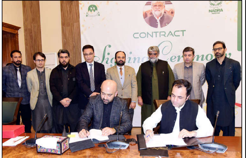
QUETTA: Caretaker Chief Minister Balochistan Mir Ali Mardan Khan Domki attending a MoU signing ceremony between Provincial Government and NADRA to start Computerized Weapon License