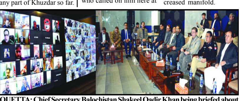
QUETTA: Chief Secretary Balochistan Shakeel Qadir Khan being briefed about arrangement for holding of free, fair and peaceful elections in the province

He spoke at length about the importance and utilization of the ongoing development projects by the federal and provincial governments, and said that the public issues are increased manifold if the projects are not completed well in time on one hand, while on the other hand, the cost of projects are also increased manifold