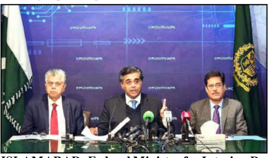
ISLAMABAD: Federal Minister for Interior, Dr. Gohar Ejaz and Murtaza Solangi, Federal Minister for Information and Broadcasting addressing a press conference, in Islamabad.

This is a strong chain of the sustainable relations between the two countries