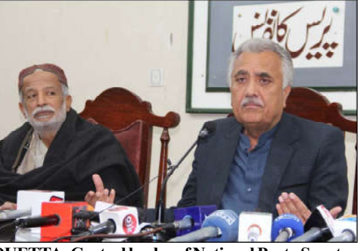
QUETTA: Central leader of National Party Senator Mir Kabeer Muhammad Shahi addressing a Press

sistance flight destined for Gaza will land in Al-Arish, Egypt, where the Pakistan's Ambassador will take charge of the supplies and oversee their transportation.