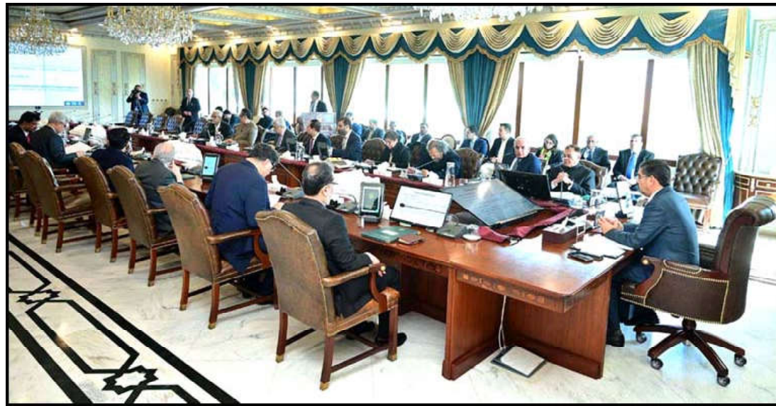
ISLAMABAD: Caretaker Prime Minister Anwaar-ul-Haq Kakar chairs a meeting of the Caretaker Federal Cabinet.

Ph: 2841470/2841473 Vol: XIX No. 235, Rajab 21, 1445 AH Friday February 02, 2024, Pages 04, Price Rs. 15