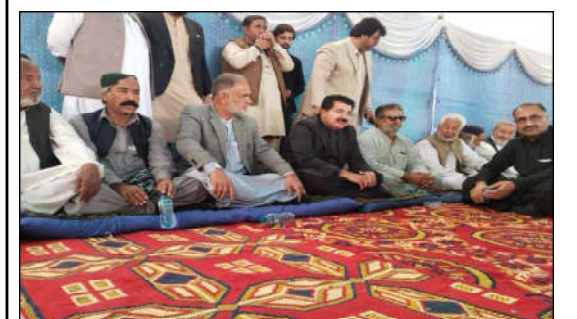
CHAGAI: Chairman Senate Muhammad Sadiq Sanjrani meeting with tribal elites in connection with election campaign at Sanjrani House