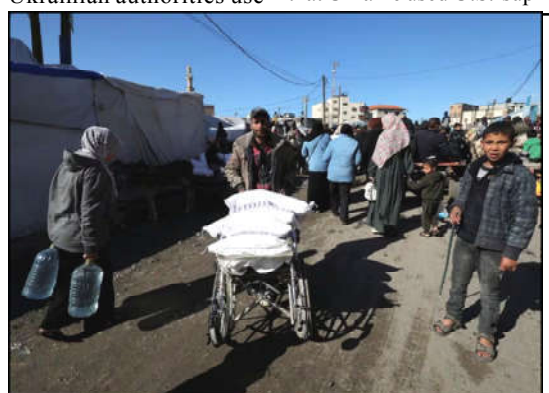
A Palestinian man carries bags of flour distributed by the United Nations Relief and Works Agency (UNRWA), amid the ongoing conflict between Israel and Hamas, in Rafah in the southern Gaza Strip.

Germany, have suspended funding to the UN agency for Palestinian refugees, UNRWA, over accusations that several staff members were involved in the Oct 7 raids in Israel. Withholding the funds was "perilous and would result in the collapse of the humanitarian system in Gaza", the heads of the UN agencies said in a joint statement. Meanwhile, mediation efforts gathered pace following a Sunday meeting of top US, Israeli, Egyptian and Qatari officials that produced a proposed framework for a new truce and prisoner release. The Israeli army said on Wednesday its troops had killed 15 "terrorists" in northern Gaza, and captured 10 "militants" during an attack on a school where they were allegedly hiding.