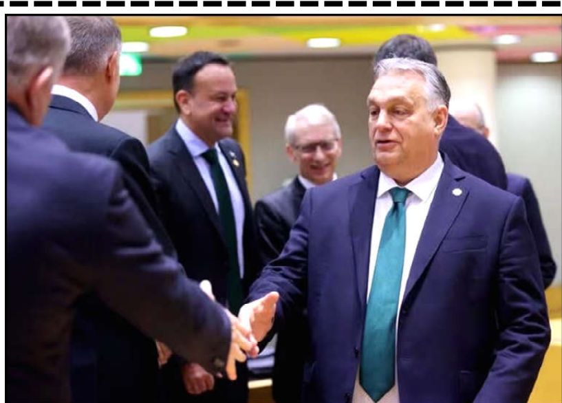
Hungary's Prime Minister Viktor Orban attends a European Union summit in Brussels, Belgium.

plied Patriot air defense systems to shoot down a Russian military transport plane in the Belgorod region on Jan. 24. Russian authorities said the crash killed all 74 people onboard, including 65 Ukrainian POWs heading for a swap. Ukrainian officials didn't deny the plane's downing but didn't take responsibility and called for an international investigation. Putin said Russia wouldn't just welcome but would "insist" on an international inquiry on what he described as a "crime" by Ukraine.