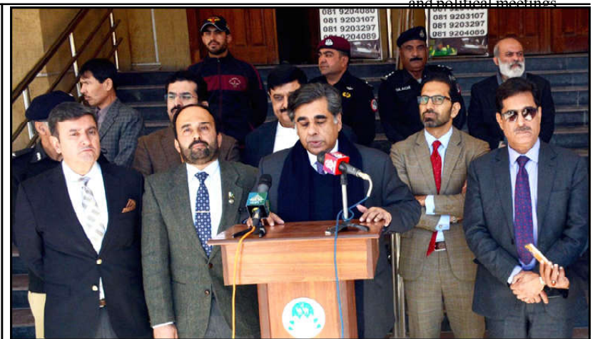
QUETTA: Caretaker Interior Minister Dr. Gohar Ejaz addressing a Press conference regarding holding of peaceful elections

The cabinet approved the increase in the prices of 146 essential life-saving medicines, keeping in view the rising prices of their raw material in the global market under the hardship category.