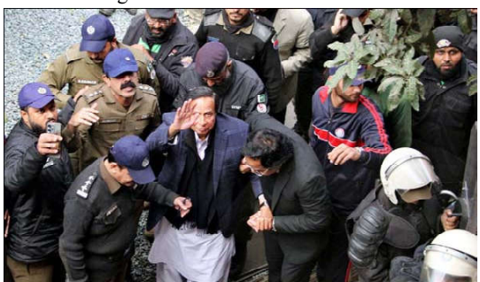
LAHORE: Former Chief Minister Punjab and Tehreek-e-Insaf (PTI) President, Chaudhry Parvez Elahi arriving for case hearing, at District Court.