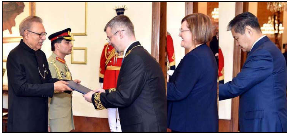
ISLAMABAD: The Ambassadors-Designates of Russia, Italy and Mongolia presenting their diplomatic credentials to President Dr. Arif Alvi, at Aiwan-e-Sadr.