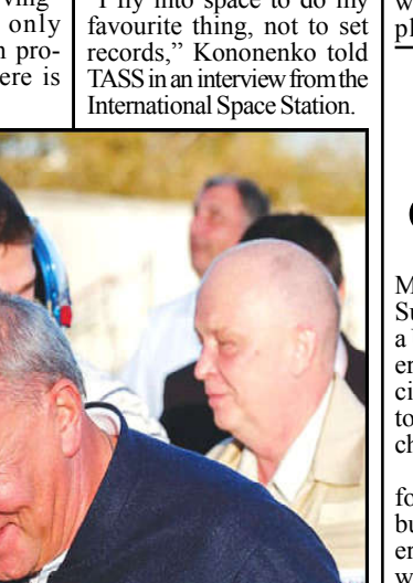
Russian space agency Roscosmos Yuri Borisov accompanying cosmonaut Oleg Kononenko at the Baikonur cosmodrome in Kazakhstan.

At 0830 Kononenko broke the record, Roscosmos said. Kononenko is expected to reach a total of 1,000 days in space on June 5 and by late September he will have clocked 1,110 days. "I fly into space to do my International Space Station.