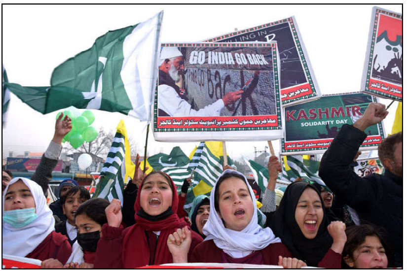
MUZAFFRABAD: Students hold placards to showing solidarity with the people of Kashmiri, during protest rally to mark the Kashmir Solidarity Day.