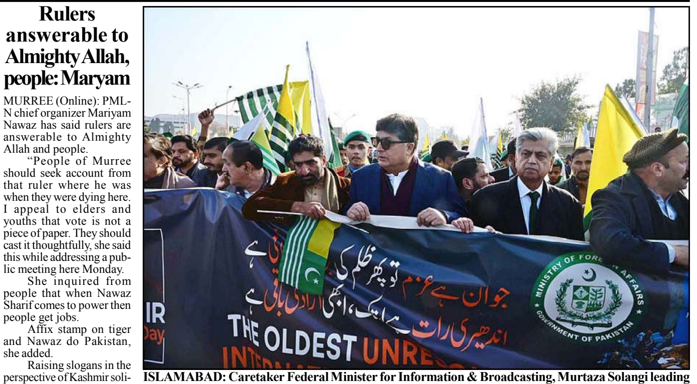
ISLAMABAD: Caretaker Federal Minister for Information & Broadcasting, Murtaza Solangi leading darity day she said Kash-Kashmir Solidarity Day Walk from Foreign Office Gate, Constitution Avenue to D-Chowk in front of Parliament House organized by Ministry of Kashmir Affairs and Gilgit-Baltistan.

He also reiterated the message that the OIC rerights and aspirations of