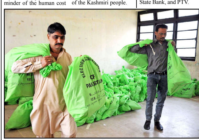
HYDERABAD: Workers of Election Commission and police officials busy in sorting and distribution of bags of election material to proper destinations.