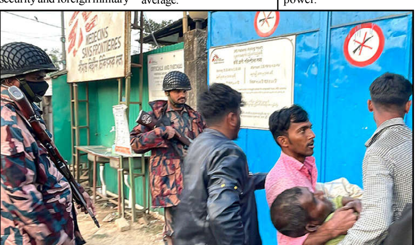
Local people carry a bullet wounded man for emergency aid at Médecins Sans Frontières (MSF) in Ukhia, after a military crackdown at the Bangladesh-Myanmar border.

to amend the constitution. Marcos said amending the 1987 constitution was meant to ease foreign investments, but Duterte accused him of using constitutional change to stay in power.