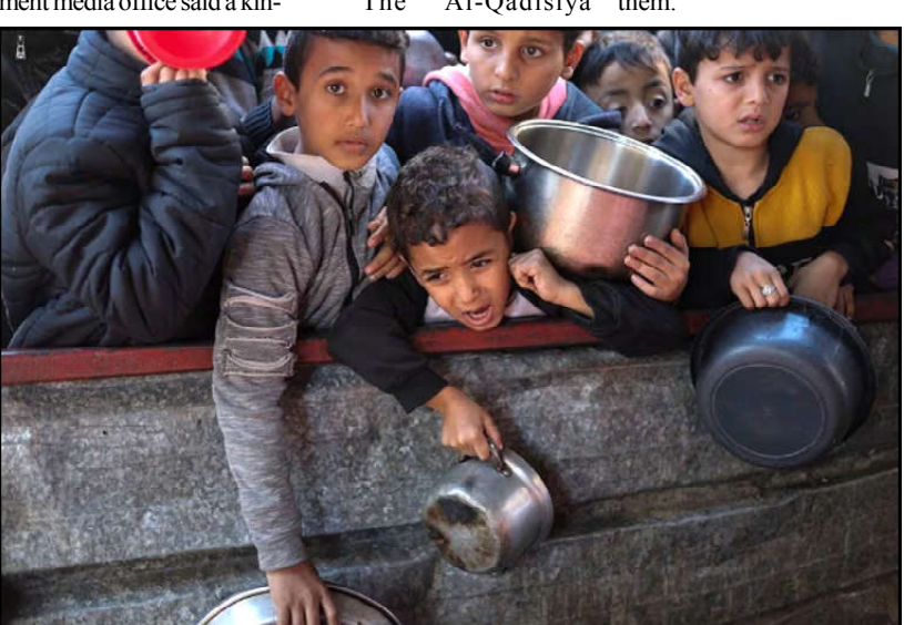
Palestinian children wait to receive food cooked by a charity kitchen amid shortages of food supplies, as the ongoing conflict between Israel and the Palestinian Islamist group Hamas continues, in Rafah, in the southern Gaza Strip.