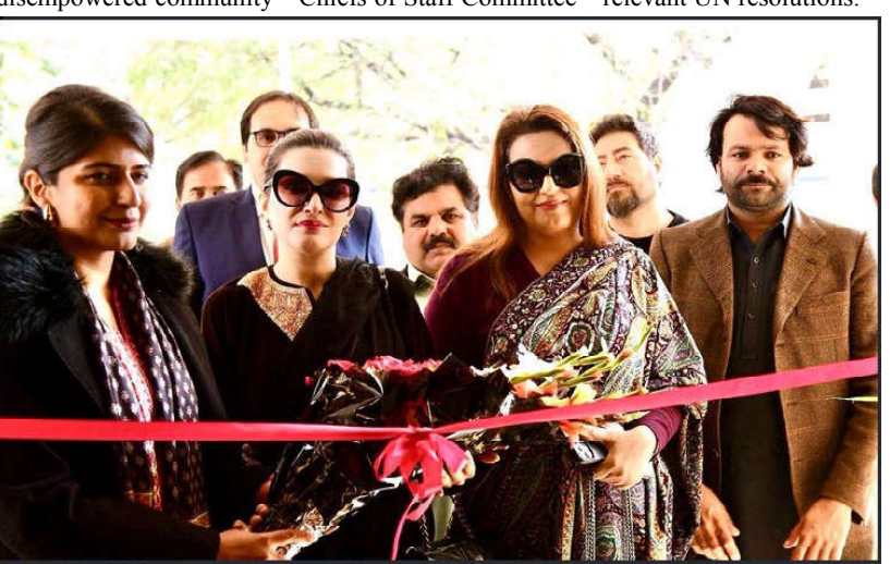
ISLAMABAD: Special Assistant to Prime Minister for Human Rights and Women Empowerment, Mushaal Hussein Mullick inaugurating the poster exhibition organized by National College of Arts (NCA) in connection with Kashmir Solidarity Day.

TikTok's Community Guidelines, available both in English and Urdu, is a key component of its misinformation combat strat-