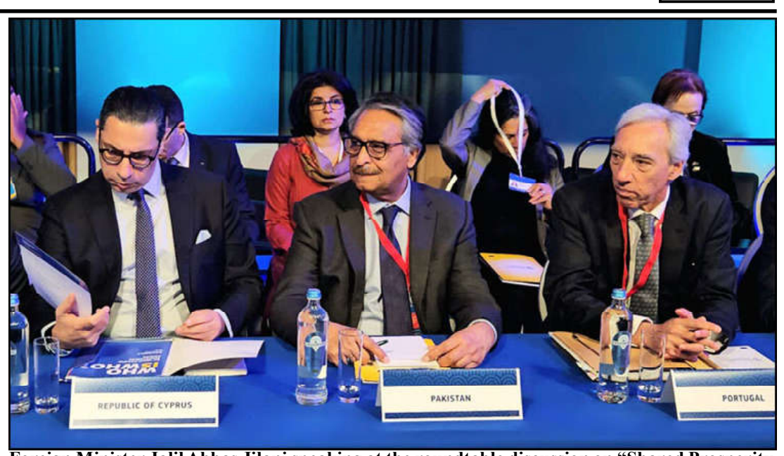
Foreign Minister Jalil Abbas Jilani speaking at the roundtable discussion on "Shared Prosperity, Economic Resilience, and Investments" at the Third EU Indo-Pacific Ministerial Forum in Brussels.