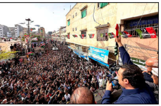
KARACHI: Chairman Pakistan People's Party Bilawal Bhutto Zardari addressing the election

Kashmir Solidarity Day observed in big way: