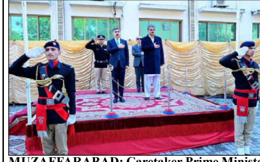
MUZAFFARABAD: Caretaker Prime Minister Anwaar-ul-Haq Kakar being presented guard of honor upon his arrival at AJK Legislative Assembly.

The CM was told that out of 277 polling stations, 916 are sensitive, and 830 are highly sensitive. Ghotki has 216 polling stations sensitive and 207 districts - Ghotki, Sukkur highly sensitive.