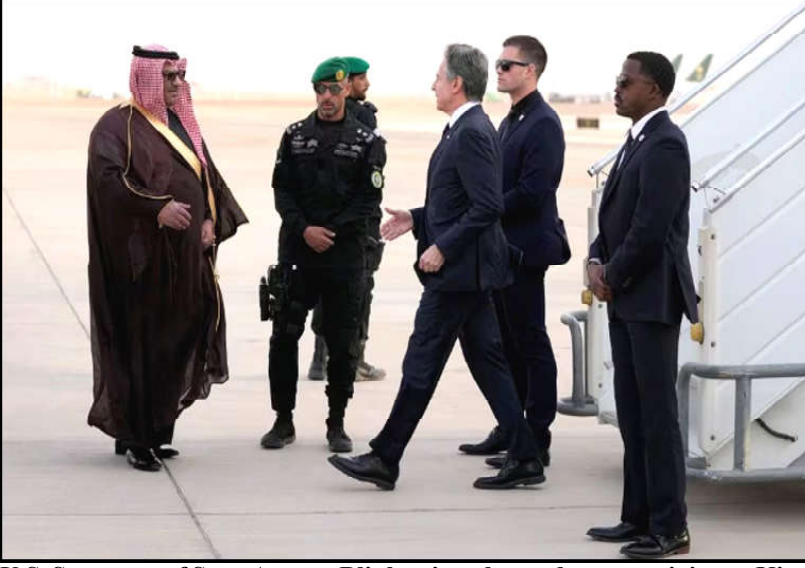
U.S. Secretary of State Antony Blinken is welcomed upon arriving at King Khalid International Airport, in Riyadh, Saudi Arabia.