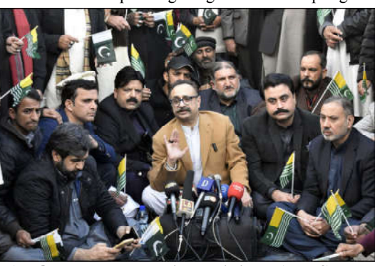
LAHORE: Former Prime Minister AJK Sardar Muahmmad Tanveer Ilyas Khan addressing a press conference during sit-protest in connection with Kashmir Solidarity Day at Mall road.

Day (WHD) April which also marks the anniversary of the founding of the World Health Organization (WHO) in 1948," informed DHO Charsadda, Dr World Health Organization Farhad Khan. In all a total the of 241 plants of different