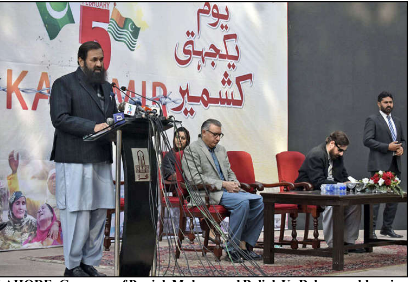
LAHORE: Governor of Punjab Muhammad Baligh Ur Rehman addressing during ceremony in connection with Kashmir Solidarity Day at Al-Hamra