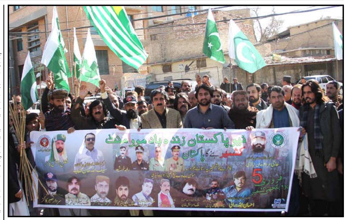
QUETTA: Members of New Pakistan Zindabad Movement are holding rally to express solidarity with the people of Indian occupied Jammu and Kashmir (IOJK) and condemn brutality of Indian Army in Kashmir on the occasion of "Kashmir Solidarity Day"

termination so that they playing field for all the could decide their own despolitical parties and the state media was giv-"On August 5, 2019, ing due coverage to all of India changed the status of Kashmir by taking unilateral and illegal actions," he said while regretting that