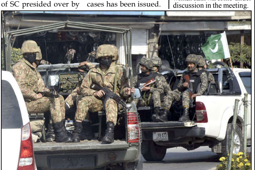
RAWALPINDI: A convoy of army patrols at Rawal road in the city ahead of the upcoming general elections.