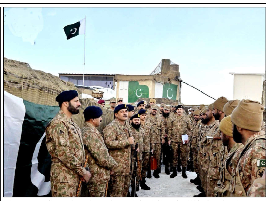
RAWALPINDI: General Syed Asim Munir, NI (M), Chief of Army Staff (COAS) talking with soldiers during his visit to the front lines along Line of Control (LOC) in Sarian Sector.

He said if India was a true democracy then it should give the people of Kashmir their just right to self-determination, besides restoring all the basic human rights in the IIOJK. PM Kakar said India must also stop the gross violations of human rights in the region along with releasing all the political prisoners. It should also abrogate all the strict emergency laws, besides removing its heavy military presence from the villages and towns of Kashmir.