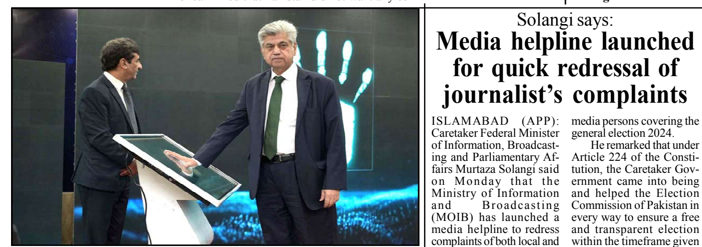
ISLAMABAD: Caretaker Federal Minister for Information & Broadcasting, Murtaza Solangi launched Media Helpline app at Press Information Department.