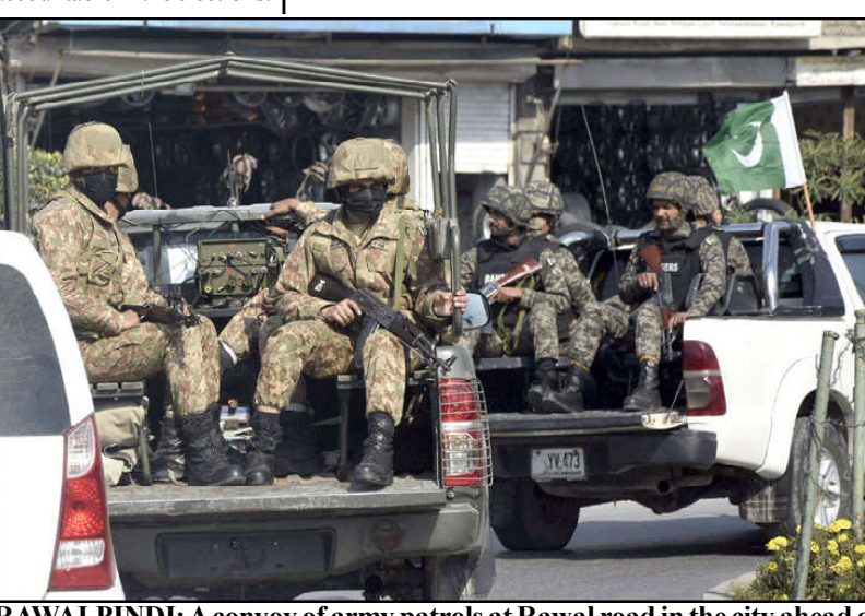
RAWALPINDI: A convoy of army patrols at Rawal road in the city ahead of the upcoming general elections.

He reiterated the call He also reiterated the message that the OIC refor the full implementation of the relevant UN resolu- mained fully committed tions, which emphasized to working with all relevant stakeholders to find the right to self-determination for the people of Kasha peaceful and just solution that respects the The secretary-general rights and aspirations of recalled that during the 49th the deserving people of