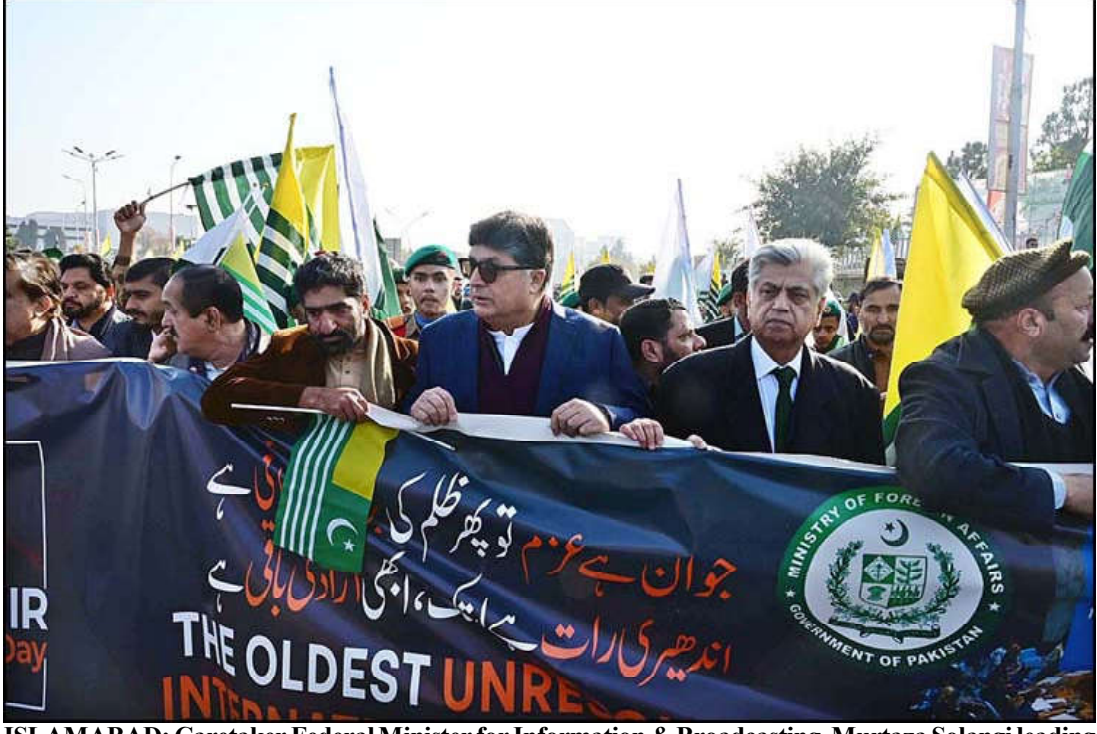
ISLAMABAD: Caretaker Federal Minister for Information & Broadcasting, Murtaza Solangi leading Kashmir Solidarity Day Walk from Foreign Office Gate, Constitution Avenue to D-Chowk in front of Parliament House organized by Ministry of Kashmir Affairs and Gilgit-Baltistan.

The prime minister said most of the people left the country for better jobs and due to economic reasons, however, millions of youth saw their future in