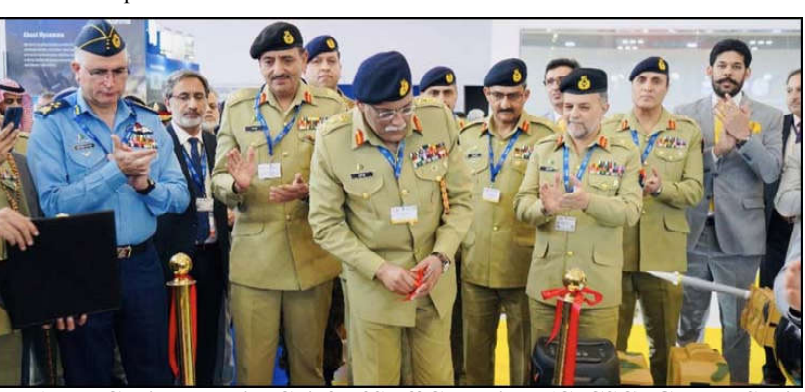
RIYADH: Chairman Joint Chiefs of Staff Committee (CJCSC), General Sahir Shamshad Mirza unveiled the Fatah-II Multiple Launch Rocket System (MRLS), at World Defense Show (WDS) 2024 in Riyadh.

He also reiterated the message that the OIC remained fully committed to working with all relevant stakeholders to find tion that respects the rights and aspirations of the deserving people of