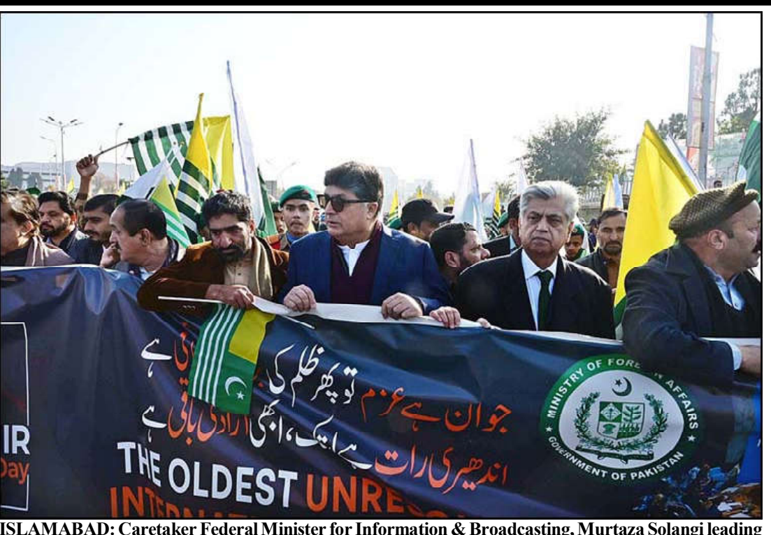
ISLAMABAD: Caretaker Federal Minister for Information & Broadcasting, Murtaza Solangi leading Kashmir Solidarity Day Walk from Foreign Office Gate, Constitution Avenue to D-Chowk in front of Parliament House organized by Ministry of Kashmir Affairs and Gilgit-Baltistan.