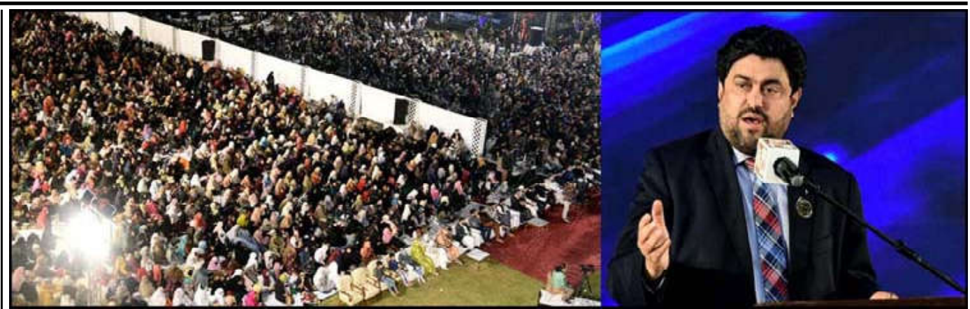
KARACHI: Governor Sindh Kamran Khan Tessori addressing the Ceremony of Mehfil-e-Zikr-e-Mustafa at Governor House.

Meanwhile, a stray horse caused collision between rickshaw.