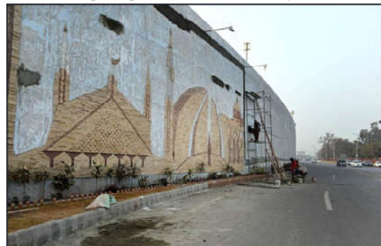
ISLAMABAD: Laborers busy in construction work to enhance the beauty of the city on the wall of a flyover at Rawal Dam Chowk in the Federal Capital.