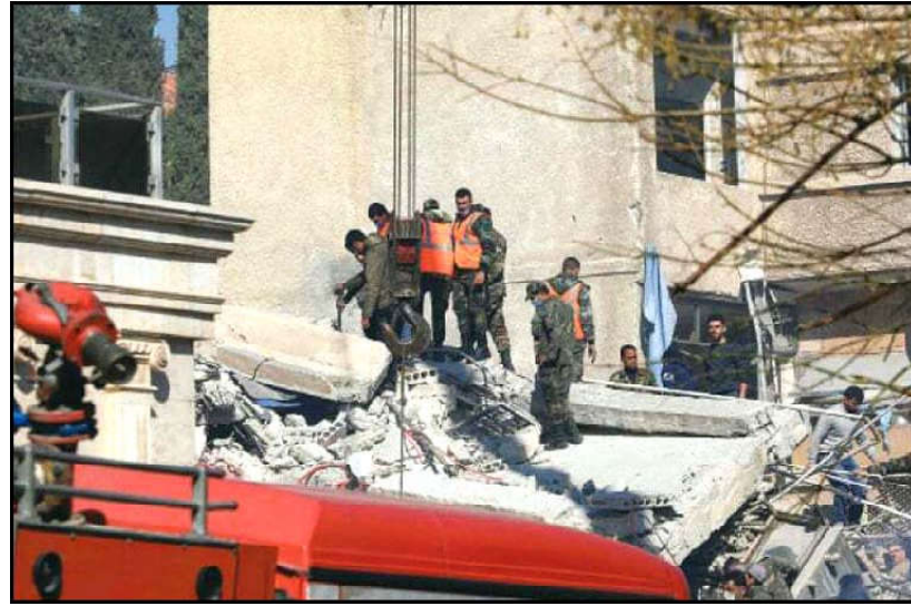
DAMASCUS: Security and emergency personnel search the rubble of a building destroyed in an Israeli strike.

"Then the clouds lifted and we could see this expansive — almost abstract — white line that extended each way across the horizon," he said. As the ship got closer during its visit on Sunday, huge gaping crevasses and beautiful blue arches sculpted into the edge of the iceberg came into focus. Waves up to four metres high "smashed" and "battered" its wall, breaking off small chunks and collapsing some arches, Strachan said. He compared sailing along the endless jagged edge to looking at sheet music. "All the cracks and arches were different notes as the song played." The tooth-shaped iceberg named A23a is nearly 4,000 square kilometres across,