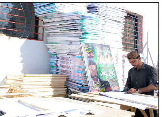
QUETTA: Workers busy preparing Election 2024 posters on Mekangi Road.