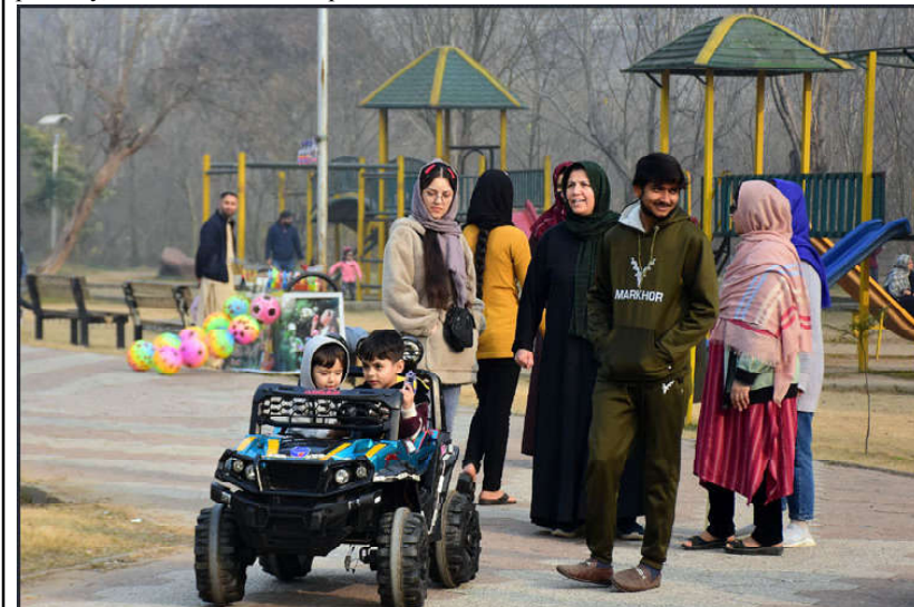
ISLAMABAD: Children riding electric car at Rose and Jasmine garden in the Federal Capital.