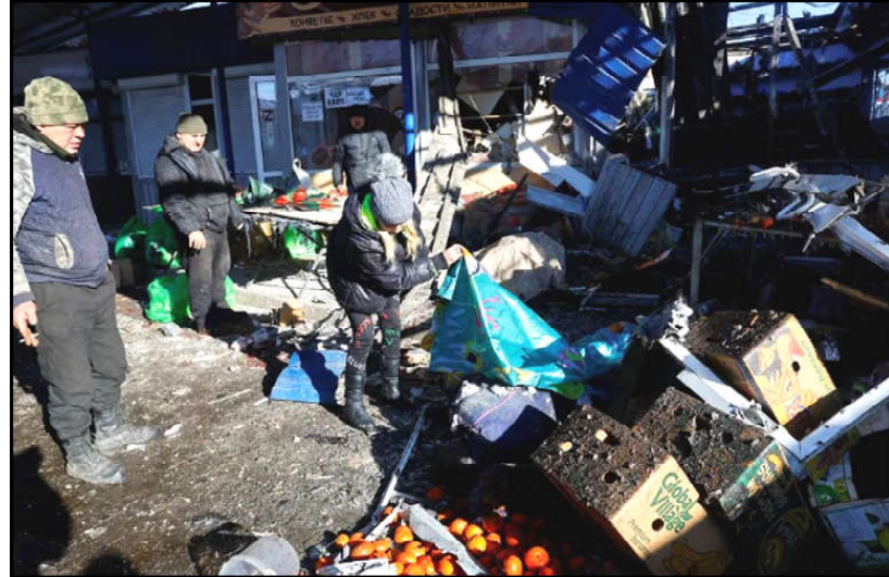
People remove debris at a food market following what local Russian-installed authorities say, was a Ukrainian military strike in the course of Russia-Ukraine conflict in Donetsk, Russian-controlled Ukraine.

Monitoring Desk VATICAN CITY: Pope Francis on Sunday called for the release of hostages, including six nuns, who were kidnapped on a bus in Haiti on Friday, and said he was praying for social harmony in the country. Gunmen hijacked a bus in Haiti's capital Port-au-Prince with at least six nuns on board and drove off to an unknown destination taking all passengers hostage. Vatican News reported on Saturday, citing the Haitian Conference of Religious group.