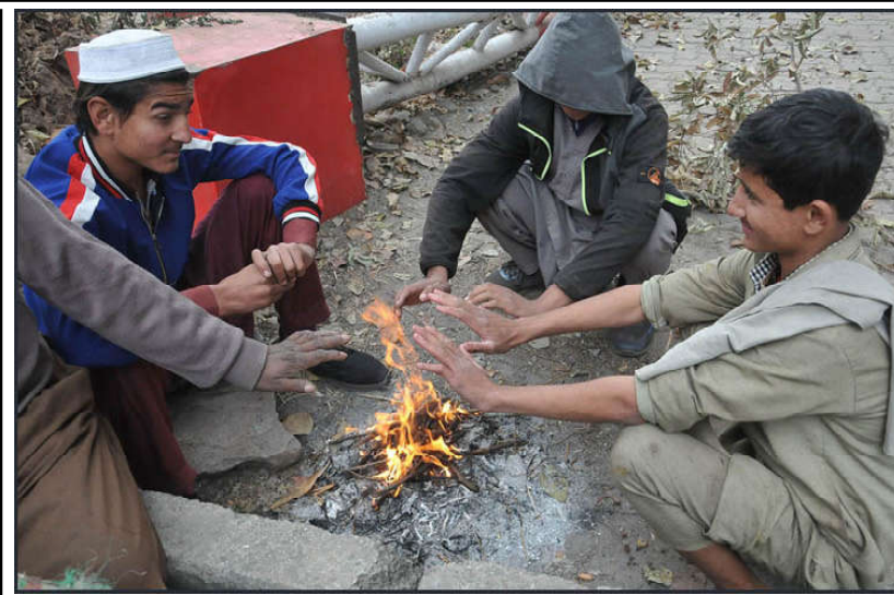
ISLAMABAD: People are sitting around fire, warm themselves as the temperature dropped in Federal Capital.

It was agreed that media organisations and journalists could have different editorial policies and report the same stories differently, and there could be fair and justified criticism on these