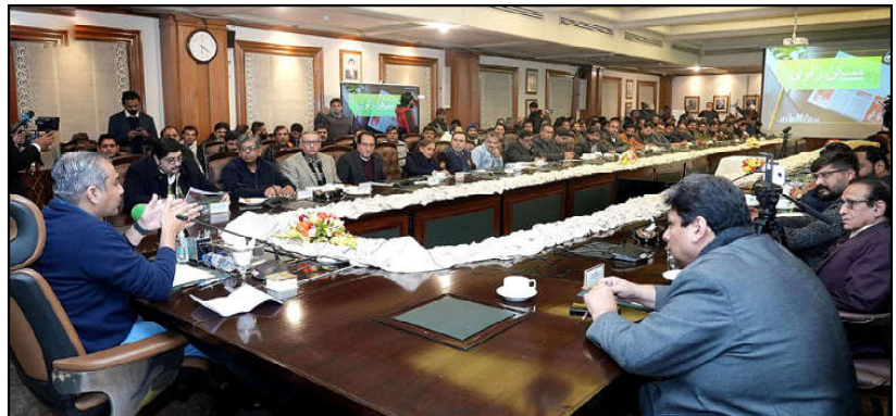
LAHORE: Caretaker Chief Minister Punjab Mohsin Raza Naqvi addressing the ceremony organized in connection with allotment of Residential Plot to Professional Journalist of Punjab.

we have fulfilled our promise being made with our journalist brothers." He said that he is fully aware that majority of the journalists lead a low profile lifestyle and they hardly make both ends meet. Residence for the journalists is a big issue as residence is a basic need for the journalists across Punjab including Lahore. Mohsin Naqvi apprised that a final shape to the journalists residential project has been given after holding a detailed consultation in this regard. It was our utmost strive to find a suitable place and make a long-term planning as well.