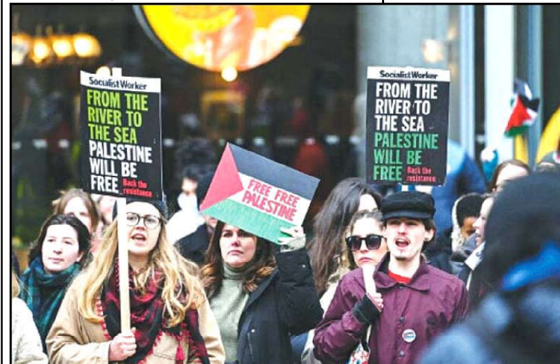
LONDON: Pro-Palestinian activists hold flags and placards while taking part in a 'Day of Action for Palestine' demonstration outside the British multinational aerospace company BAE Systems.

Secretary General Antonio Guterres aired similar sentiments in an earlier statement, telling the world: