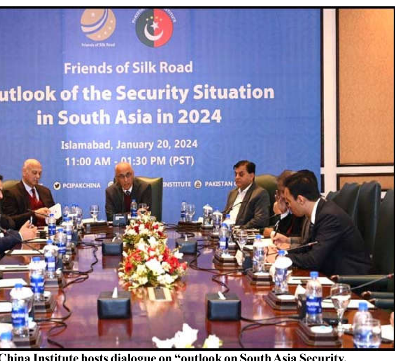
ISLAMABAD: Pakistan-China Institute hosts dialogue on "outlook on South Asia Security."

DUBAI (INP): Dubai Capitals, riding on belligerent half-centuries from Rahmanullah Gurbaz and Jake Fraser-McGurk, recorded an emphatic seven-wicket win over MI Emirates in the second match of the ILT20 season 2 at the Dubai International Stadium. This contest, played in the presence of Bollywood star Shah Rukh Khan and a large Saturday crowd, saw Afghanistan's Gurbaz crack an aggressive 81 runs off 39 balls with eight boundaries and four sixes and Australia's 21-year-old rising star Jake Fraser-McGurk hitting a breezy 54 off 25 balls with four boundaries and four sixes. The pair put on a 114 runs partnership for the second wicket in 51 balls to chase down MI Emirates' total of 159 for 9 in 20 overs (Muhammad Waseem 51, Andre Fletcher 30, Nicholas Pooran 21, Tim David 27, Jason Holder 3 for 34, Sikandar Raza 3 for 21). Dubai Capitals 160 for 3 in 16 overs (Rahmanullah Gurbaz 81, Jakes Fraser-McGurk 54, Trent Bouldt 2 for 23). Player of the Match: Sikandar Raza of Dubai Capitals