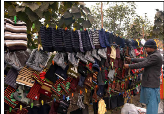
LAHORE: A vendor is busy in displaying and selling warm hats, scarves and gloves at his roadside setup.

The institutionalization of high quality performance assessment and results-based accountability is underway to meet the expectations of stakeholders.