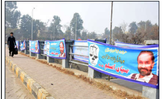
ISLAMABAD: A man walks past banner of a political party Jamaat-e-Islami candidate on a bridge in the Federal Capital, ahead of the country's general elections 2024.

The private sector has an important role in the education, political and social development of the country, they added.