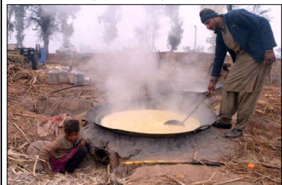
SARGODHA: Farmer busy making traditional sweet item Gurr near Khushab Road.