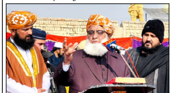
LAKKI MARWAT: Chief of JUI Maulana Fazlur Rehman addressing students during a ceremony