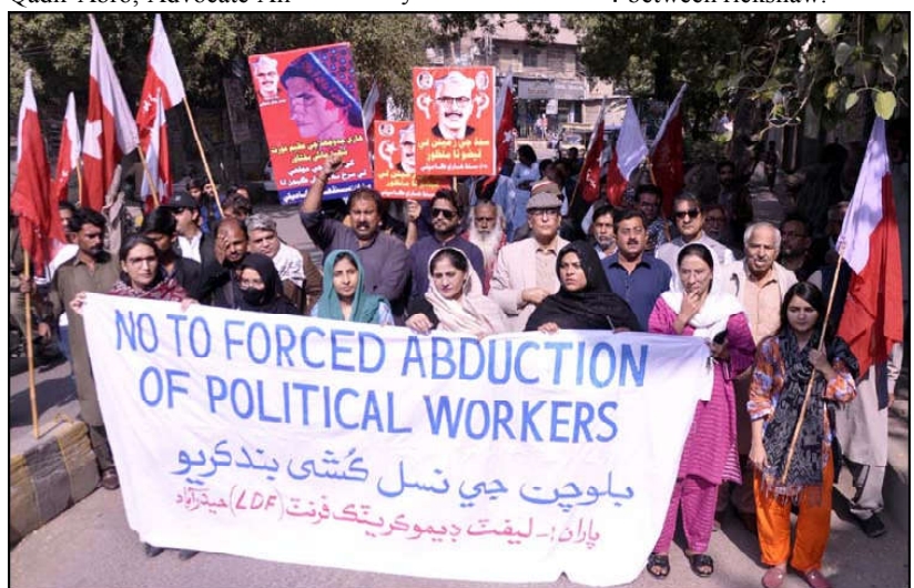
HYDERABAD: Members of Left Democratic Front (LDF) are holding protest rally against forced disappearances of Baloch and expressed solidarity with the Baloch, in Hyderabad.

The design of the rest area on the Ring Road would also be prepared soon.