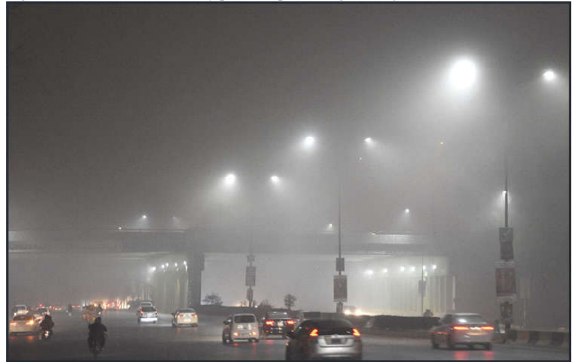
ISLAMABAD: Commuters on the way at Islamabad Expressway during heavy fog in night hours, in the Federal Capital.