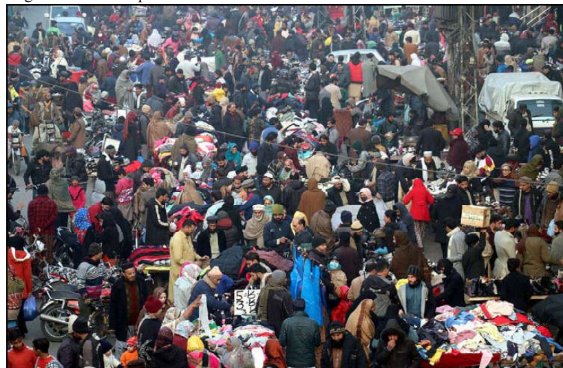
LAHORE: Warm clothes are being selling at a roadside stalls as the demand of warm clothes increased in city during the winter season, at Delhi Gate.

LAHORE (APP): The Lahore Electric Supply Company (LESCO) Wagha Sub-Division's SDO along with his team checked main transmission lines and power meters during a search operation late last night and found three customers stealing electricity in Hamad Garden area. The company's spokesman told media here Sunday that two accused were stealing electricity by hooking wires on LESCO's main supply lines, while the other one was pilfering power through a bogus meter. The inspection team seized the wires and bogus meter used in electricity theft and submitted an FIR.