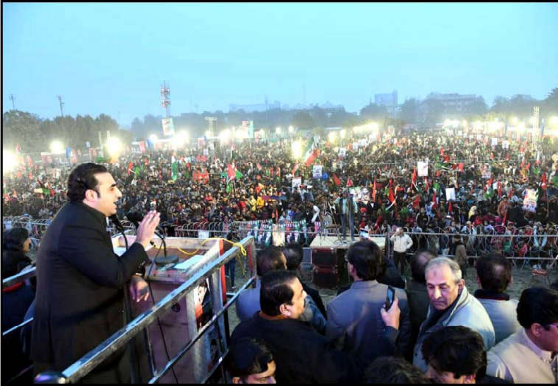
LAHORE: Peoples Party (PPP) Chairman, Bilawal Bhutto Zardari addresses to his supporters during public gathering meeting regarding Election Campaign in connection of the General Election 2024 coming ahead, in Lahore.

Ph: 2841470/2841473 REG: No. BC-116 B/ID-445 Vt XXV No 153, Rajab 10, 1445 AH Monday January 22, 2024 Pages 08, Price Rs.15