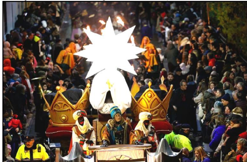
Participants dressed in costumes, and wearing blackface, take part in the annual Epiphany eve parade of the Three Kings, in Alcoy, Spain.

A 2021 study commissioned by the Equality Ministry found that although nearly half of people of African descent living in Spain were born in the country, only 12% described themselves as "Afro-Spanish" and 60% said they did not feel Spanish due to discrimination they suffered.