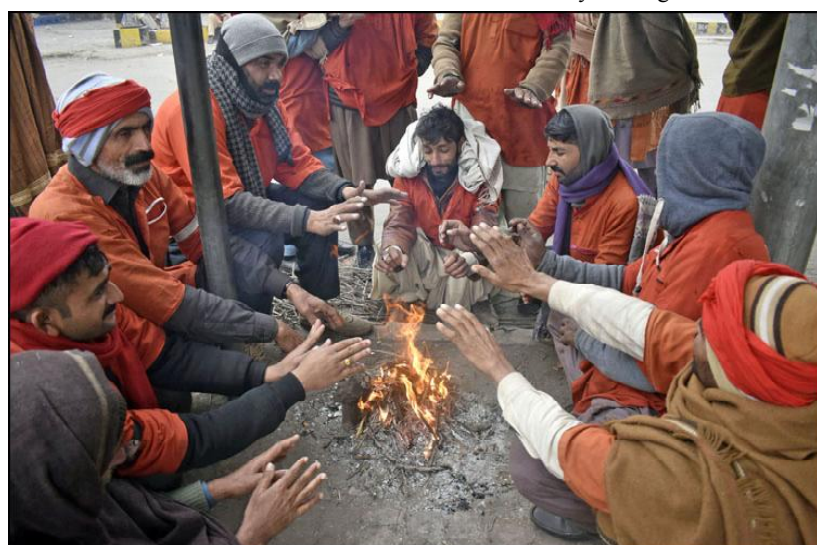
LAHORE: Coolies gather around the fire to counter coldness during the winters in Provincial Capital.