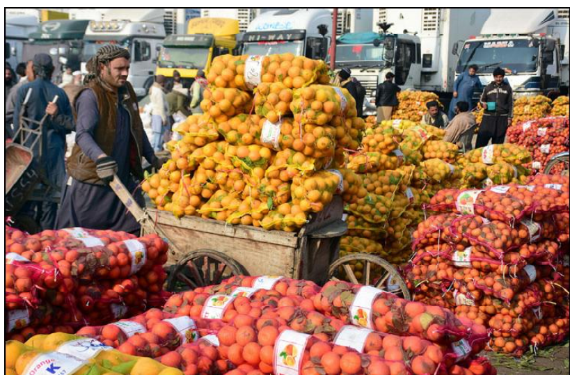
ISLAMABAD: Vendors are busy in their routine work at Oranges bidding point of the Fruit and Vegetables Market as the prices of fruits and vegetables are seen to hike in the first week of the Year 2024 in Federal Capital.