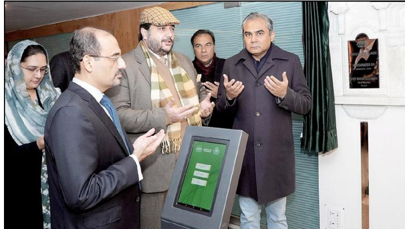
LAHORE: Caretaker Chief Minister Punjab Mohsin Naqvi offering a Dua inaugurating Punjab First E-Registration Model Center at LDA Plaza Kashmir Road.