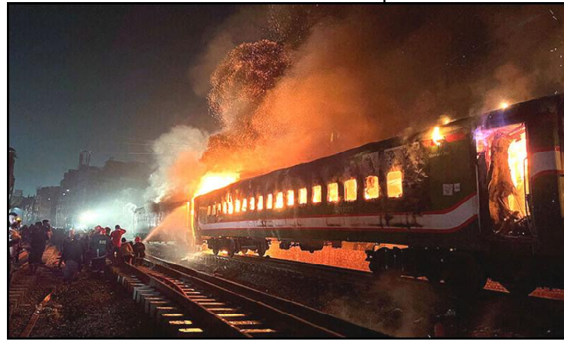
Firefighters try to extinguish a fire caught on a passenger train, ahead of the general election in Dhaka, Bangladesh.

The "Three Brotherhood Alliance", as the group is known, said it took over Laukkai town after the military's regional headquarters located there surrendered. The fall of Laukkai is the latest victory in a sweeping offensive by an alliance of rebel groups that began in October and has become the most significant threat to Myanmar's military government since it seized power in a 2021 coup.