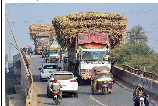
HYDERABAD: Truck holders on the way loaded with sugarcane at flyover of Tando Yousuf.