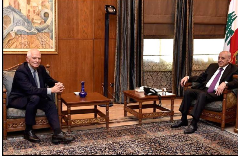
Lebanese Parliament Speaker Nabih Berri meets with European Union's foreign policy chief Josep Borrell in Beirut, Lebanon.

"We'll be discussing this issue. I think there will be positive developments," Greek Foreign Minister George Gerapetritis told Greek Skai television.