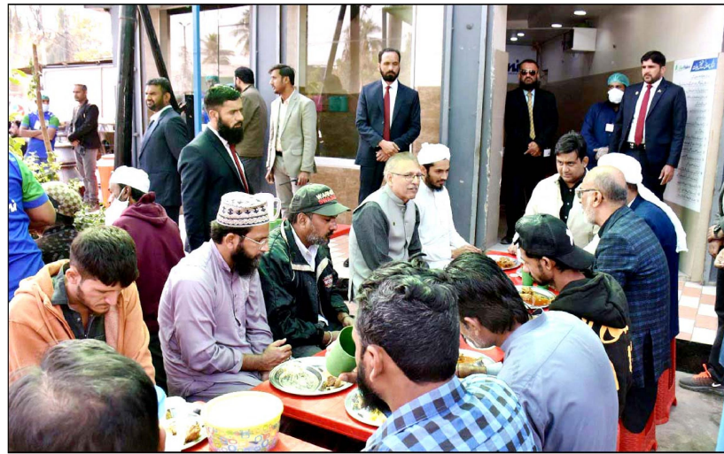
KARACHI: President of Pakistan Dr. Arif Alvi visits Saylani Welfare Trust at M Ali Society