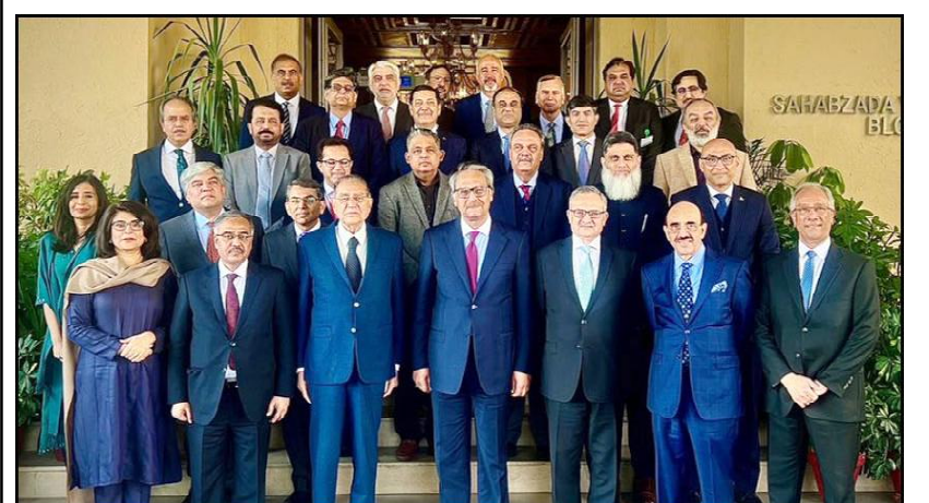
ISLAMABAD (INP): Envoys' Conference 2024 concluded today after deliberations on steering Pakistan's foreign policy through present day challenges and opportunities.

According to the Spokesperson of Foreign Office Muntaz Zahra Baloch, the Caretaker Prime Minister Anwar-ul-Haq Kakar and Foreign Minister Jaitil Abbas Jilani shared their vision of Pakistan's foreign policy.