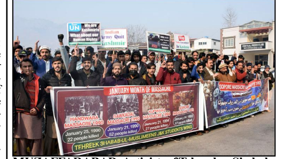
MUZAFFARABAD: Activists of Tehreek-e-Shababul-Muslimen holds placards and shouting slogans during protest against the Indian oppression in City.

The JI Acting Ameer further highlighted Punjab's historical role in promoting harmony among all provinces, expressing dismay at elements that have brought shame to the largest province. He mentioned that JI has issued 237 and 250 national and provincial assembly tickets throughout Punjab, signaling a clear message and commitment to a better future for the province. If elected with the support of the people, the JI would work towards progress and prosperity in Punjab, he assured. In a separate statement, Liaquat Baloch demanded the restoration of passenger flights for Gilgit Baltistan, stating that the suspension of flights for over two months has created severe difficulties for the people in the hilly area, virtually blocking their access to other parts of the country.