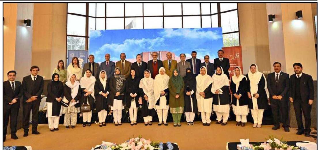
ISLAMABAD: District Judiciary Judges in group photo with the Chief Justice of Pakistan, Mr. Justice Qazi Faez Isa at the Federal Judicial Academy.