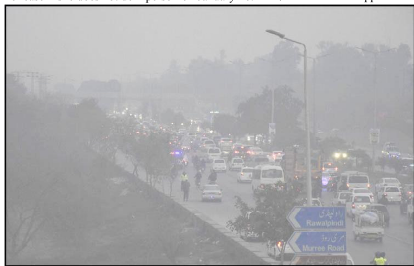
ISLAMABAD: Motorists on their way at Islamabad Highway during foggy weather in Federal Capital.

In response to a query about the tragic events of January 2022, when 22 lives were lost due to a snowstorm that left many stranded on the roads around Murree, he said the authorities have been diligently working to prevent a recurrence. The disaster was attributed to the negligence of local authorities, allowing an excessive number of vehicles (over 13,000) into Murree, surpassing its capacity of 4,000, the spokesperson maintained. To mitigate such risks, he noted that the administration of Murree has taken proactive measures. Last week, three facilitation centers for tourists were set up, and this number has now been increased to 13. The focus is on ensuring the safety of visitors, particularly those arriving in their cars, said the spokesperson. Authorities are keen to avoid a repeat of the 2022 tragedy, he said, emphasizing the importance of responsible management and adherence to capacity limits to ensure the safety of both tourists and residents in the picturesque hill station. Meanwhile, travelers, accompanied by families primarily arriving from various districts of Central Punjab and northern Khyber Pakhtunkhwa.