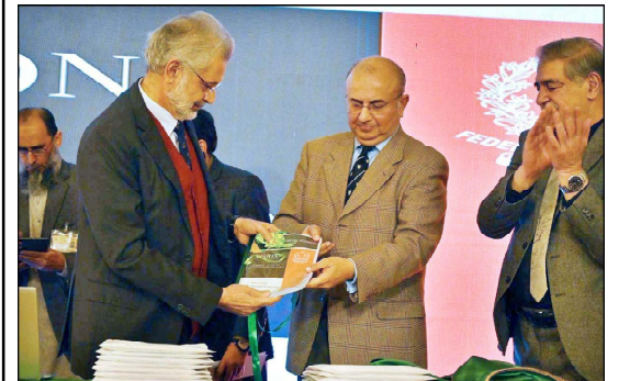
ISLAMABAD: Mr. Justice Syed Mansoor Ali Shah presenting a copy of FJA Vision to Hon'ble Chief Justice of Pakistan, Mr Justice Qazi Faez Isa in the Conference on the Launch of Vision and E-Campus at the Federal Judicial Academy

"Live coverage gives people the confidence that justice is being served," CJP Isa said.