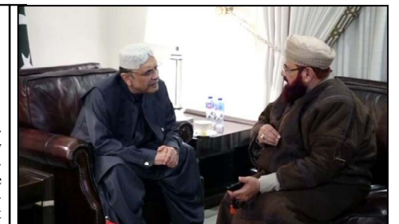
MULTAN: Peoples Party (PPP) Co-Chairman Asif Ali Zardari exchanges views with Former Federal Minister Allama Hamid Saeed Kazmi during meeting held in Multan.