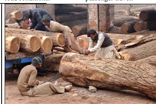
MULTAN: Labourers are busy manually cutting huge piece of wood at their workplace.

In the January-November period, China's total commercial freight volume went up 8.1 percent year on year to 50.02 billion tonnes, the data revealed.