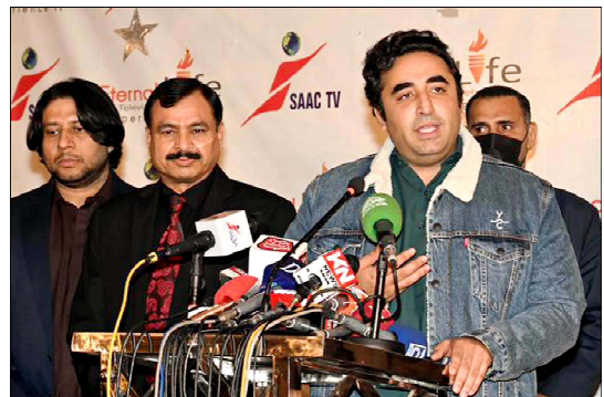
LAHORE: Peoples Party (PPP) Chairman, Bilawal Bhutto Zardari addresses to media persons during press conference, held at the Head Office of ISAAC TV in NA 127 Modern Colony

He expressed confidence that the general elections will be staged on time and the Pakistanis will have the chance to exercise their right to vote and form a government of their choice.