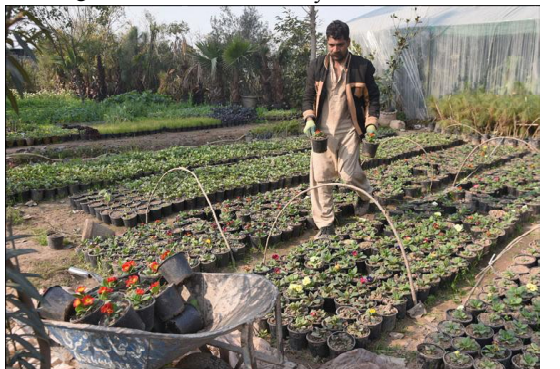
ISLAMABAD: A worker is busy in arranging flower pots in Nursery at Sector H-9 in Federal Capital.