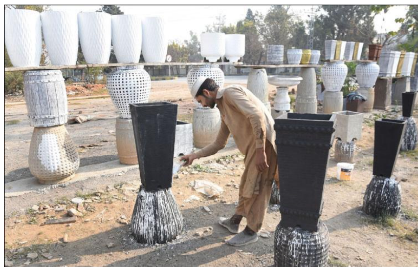
ISLAMABAD: A worker is busy in painting the fancy flowers pot in Nursery at Sector H-9 in Federal Capital.