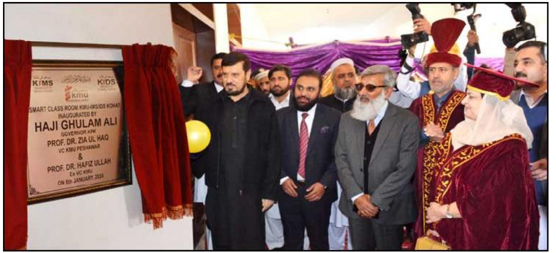
PESHAWAR: Khyber Pakhtunkhwa Governor Haji Ghulam Ali inaugurates smart classrooms at KMU institute of Medical Sciences Kohat.

Registration Model Centre as whether anyone asked him for money for the registry. The citizens by appreciating the e-Registration system replied that no money was being taken and the registration system was much simplified and easier now. Mohsin Naqvi revealed that the land transfer process of all the three towns would be done under a single roof at the e-Registration centre.