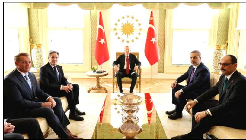
Turkish President Tayyip Erdogan, accompanied by Foreign Minister Hakan Fidan and Ibrahim Kalin, head of Turkey's National Intelligence Agency (MIT), meets with U.S. Secretary of State Antony Blinken in Istanbul, Turkey.

As victims were buried on Friday, mourners wept over their coffins and crowds chanted "revenge, revenge", state TV showed.