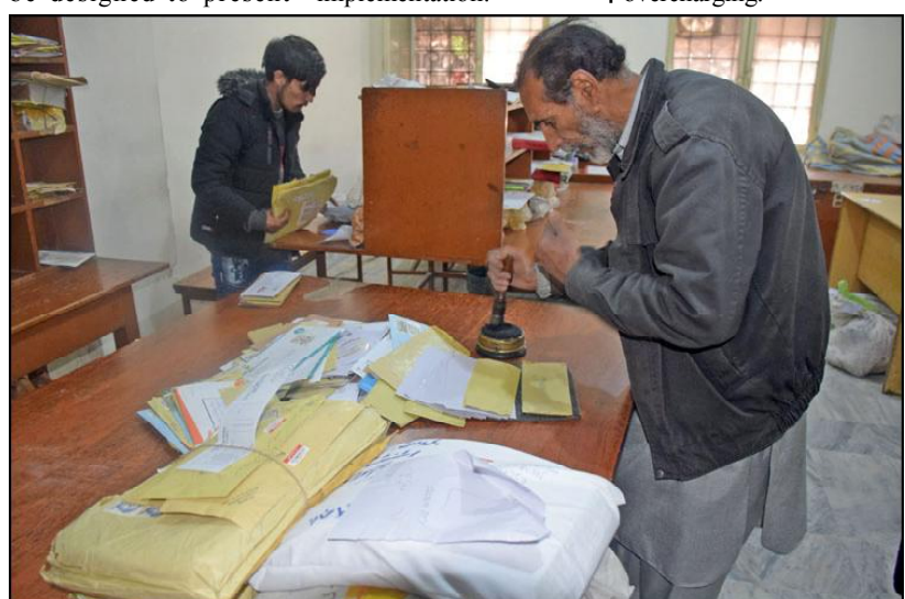
MUZAFFERABAD: Employees of Pakistan Post are busy in their work at General Post Office in the Capital of A.J.K.

People of the Nadapa Bala, main Charsadda road and suburbs areas including Budh Bear, Matni, Lala Musa, Kohat Road, University Road, Charsadda Road, Bakhshi Pul, Nasapa Bala.