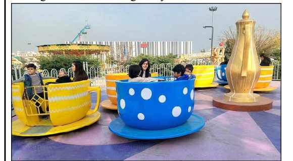
ISLAMABAD: Children enjoying the mechanized swing during their winter vacations at Joyland.

department completing investigations on 20,148 cases, while 4,178 cases are still under proceedings. Transparency in case investigations, maintaining merit, ensuring justice for criminals, and delivering justice to citizens are the primary goals of all these measures. The police spokesperson said that Islamabad Capital Police is vigilant day and night in combating crime, with several officers and personnel demonstrating exceptional courage in the line of duty, earning them the title of martyrs and Ghazis by facing criminals' bullets. Combating crime is impossible without the cooperation of the citizens, so citizens are urged to collaborate with the police, a police spokesperson concluded.