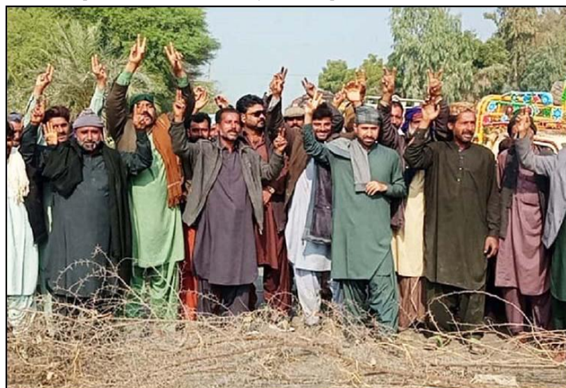
LARKANA: Growers are blocked road as they are holding protest demonstration against Irrigation Department of Sindh and shortage of water in Peersher, Mahar, Phul, Ahando Mirbahar, Maswani Jatoti villages, at Peersher Bypass road.

For example, Dr Fahad said retail price of one maize seed variety was Rs. 15,000 per bag but it was being sold for Rs 20,000 in black market. "As it is an exhausting crop and farmers spend more on its cultivation and saving it from insect attack, so they need a proper return."