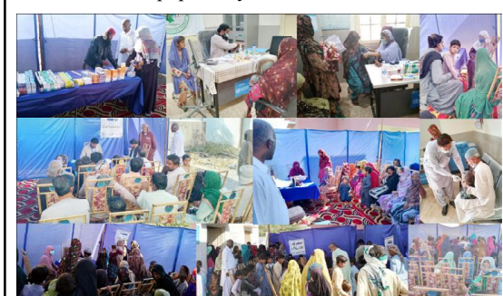
UTHAL: Doctors examining patients during free medical camp in BHU Sukan by PHC Global in collaboration with Health Department Lasebella

ISLAMABAD (INP): PTI leader Latif Khosa has alleged that nomination papers from a staggering 90 percent of Tehreek-e-Insaf (PTI) candidates have been rejected. Latif Khosa, while speaking on a TV channel, Khosa claimed that this mass rejection stands in stark contrast to the PML-N, where only a single candidate had faced rejection across the country. Khosa asserted that PTI candidates are prepared to engage in a robust legal battle against the rejection of their nomination papers. Despite the setback, he highlighted the presence of strong alternative candidates within the party. The ongoing scrutiny of nomination papers by the Election Commission has been a subject of controversy, with PTI alleging widespread rejection of its candidates on December 30. Media reports confirm that even central figures within PTI, including Imran Khan, have had their nomination papers rejected. Prominent leaders such as Shah Mahmood Qureshi faced rejection in National Assembly Constituencies NA 151 and 150, while his sons Zain Qureshi and Mehrabano also encountered a similar fate. Azam Khan Swati's nomination papers from Manshehra constituency NA 15, and Zulfi Bukhari's from NA 50 Attock were not spared either. Irfan Khan, Imran Khan's cousin and PTI candidate from PP-90 in