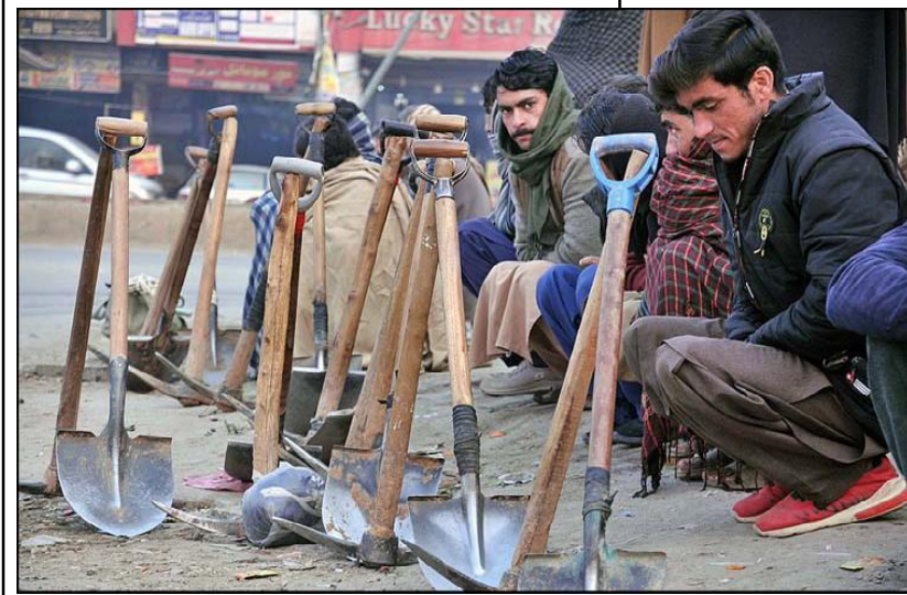
ISLAMABAD: Labourers along with their tools sitting on roadside waiting for clients to be hired for work during morning time at Khanna Pul.