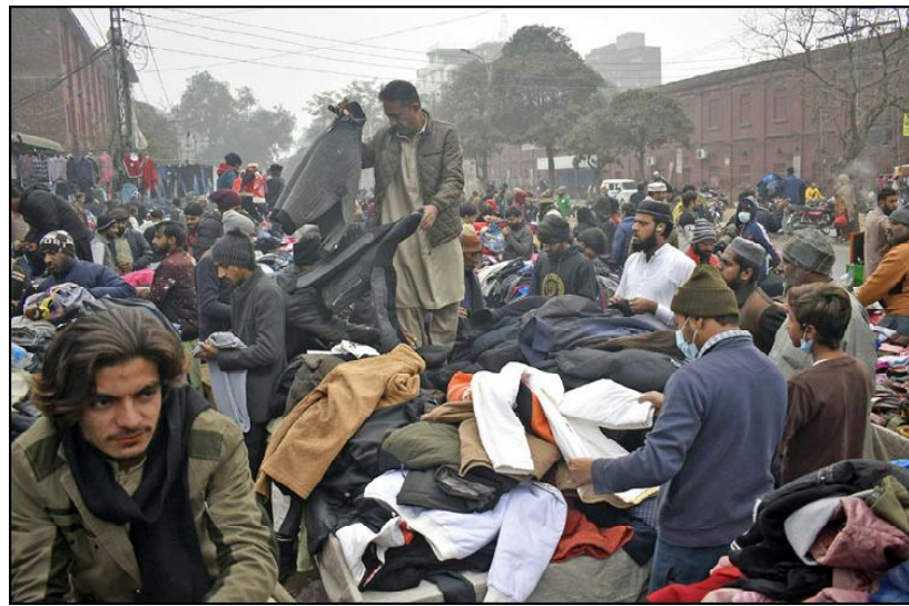
LAHORE: A large number of people are busy buying warm clothes outside Impress market during cold weather in Provincial Capital.

Among the telecommunication services, the export of call centres services increased by 8.84 per cent during the months as its exports increased from US $69.641 million to US $75.800 million whereas the export of other telecommunication services witnessed a nominal decrease of 0.88 per cent.