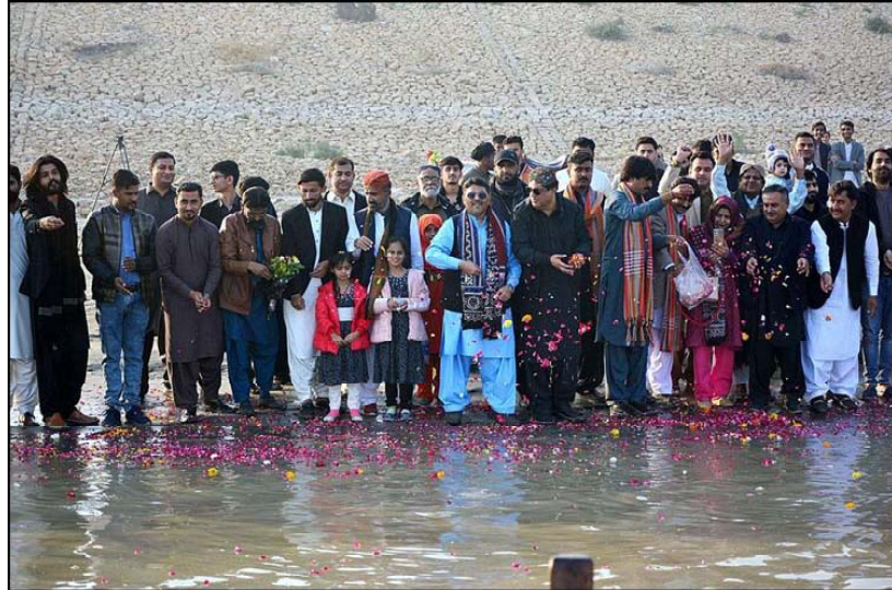
HYDERABAD: Sindhi writers, intellectuals and Sindhi folk singers throwing rose petals in the Indus River during last sunset of 2023 at Almanzar Picnic Point.

Expressing optimism for the continued positive role of journalists in Abbottabad, the chief minister hoped they would actively contribute to the well-being and prosperity of the journalistic society. He reassured the delegation that the provincial government is committed to addressing journalists' issues and promoting their welfare through every possible means.