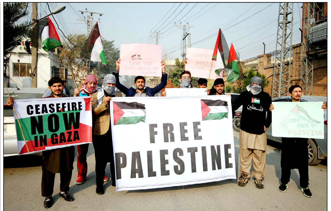
PESHAWAR: Members of Civil Society are holding protest demonstration against Israeli cruel and inhumane acts and express unity with the innocent people of Palestine, at Peshawar press club