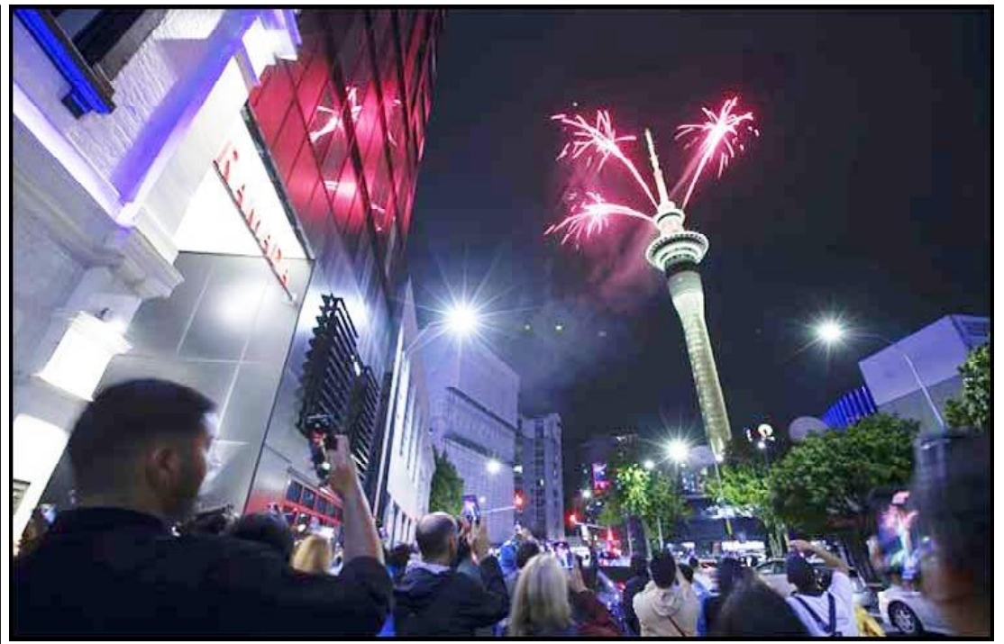
Fireworks burst from the Sky Tower in Auckland, New Zealand to celebrate the New Year

Prime Minister Benjamin Netanyahu said Saturday that Israel's war against Hamas will last for "many months"—until the Palestinian militant group has been eliminated.