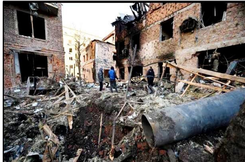
Residents inspecting the damage outside an apartment building after the overnight Russian drone attack in Kharkiv.