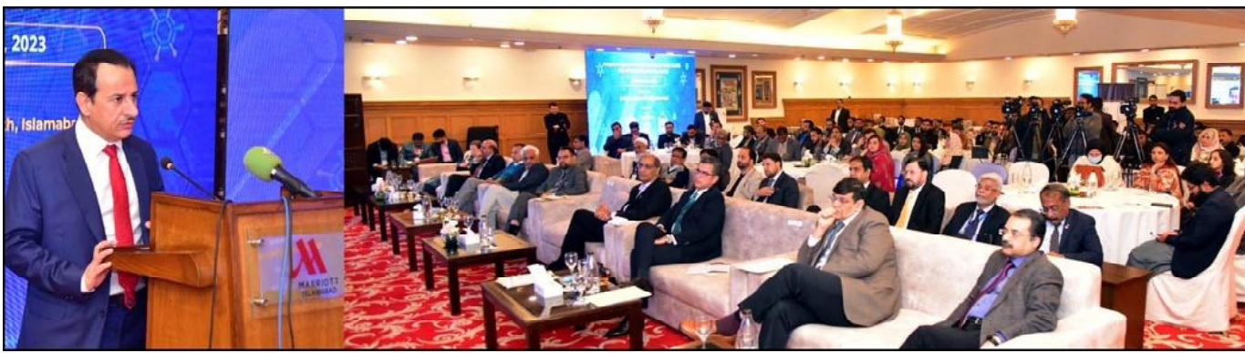
Federal Health Minister Dr. Nadeem Jan addressing National Conference on Integrated Approach for Evidence Based Public Health and Role of National Health Data Centre in Islamabad.