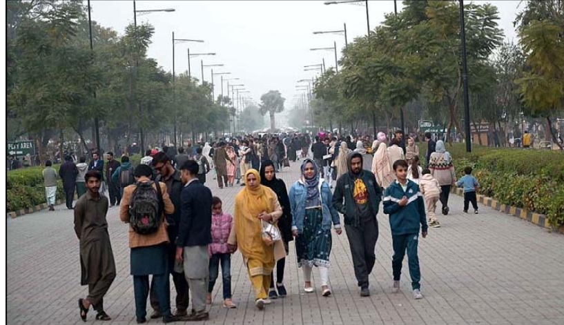
ISLAMABAD: A large number of people came to visit Lake View.