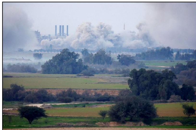
Smoke rises over Gaza, amid the ongoing conflict between Israel and the Palestinian Islamist group Hamas, as seen from southern Israel

The Ukraine Prosecutor General's office has registered more than 121,000 Russian crimes of aggression and war crimes since the war started, according to its website. The UN has also found several cases of Ukrainian authorities committing violations of human rights of people they have accused of collaborating with Russian authorities.