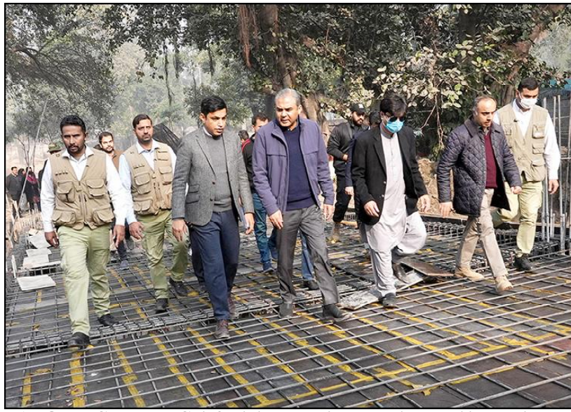
LAHORE: Caretaker Chief Minister Punjab Mohsin Naqvi inspecting the on-going construction works at Lahore Zoo.

In Lahore, the delegation visited Akhuwat College University Kasur.