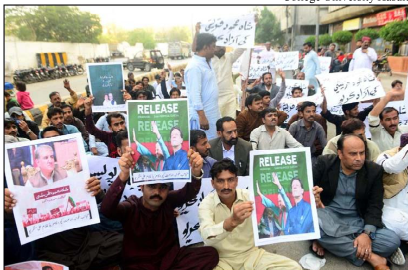
KARACHI: Members of Ghousiya Jamat are holding protest demonstration for release of Shah Mahmood Qureshi, at Karachi press club.

The emotional toll of the disease is also witnessed among male patients, mostly youngsters, especially when the skin ulcer appears on uncovered body parts like face.