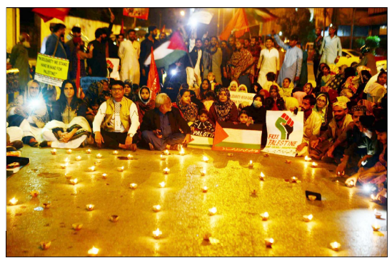
KARACHI: Members of National Trade Union Federation (NTUF) are enlightened candles to express solidarity with martyred innocent people of Palestine and against Israeli cruel and inhumane acts, during protest demonstration at Karachi press club

Talking about the progress in the negotiations with Baloch protesters, the Information Minister revealed that in the first phase, all children and women were safely released.