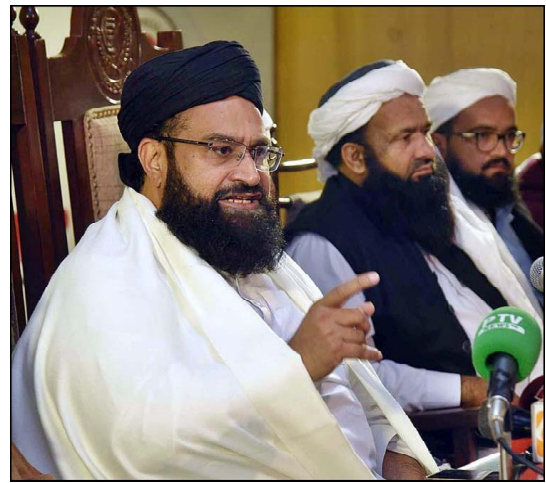
LAHORE: Special Assistant to Prime Minister and Chairman Pakistan Ulema-e-Islam Council Allama Tahir Ashrafi addressing a Press conference.