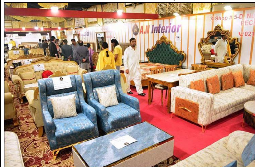
HYDERABAD: Families viewing the furniture during three days Pakistan lifetime furniture's Exhibition.