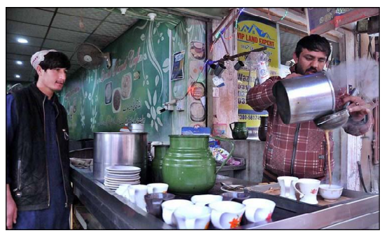
ISLAMABAD: A vendor preparing tea for his customers in a local hotel.

bondage. They said the on-going freedom movement, which reflects the sentiments of the general populace of IIOJK, will continue till the implementation of the UN resolutions. India is striving to equate Kashmiris' freedom struggle with terrorism through false flag ops and concerted propaganda but will never succeed in its nefarious designs, they added. They said the fascist Modi must remember that people struggling for freedom cannot be linked to terrorism.