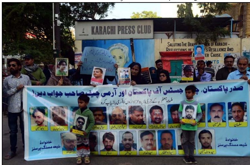
KARACHI: Members of Shia Missing Persons are holding protest demonstration for recovery of their loved one as soon as possible, at Karachi press club.