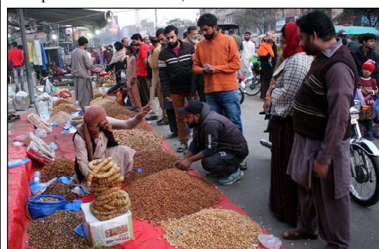
LAHORE: Dry fruits are being selling at a roadside stall, as the demand of dry fruits increased in city during the winter season, near Badshahi Mosque in Lahore.

These views were expressed by the deputy commissioner at an important meeting. DC Syed Hassan Raza said that price control magistrates should play an active role in maintaining stability in the prices of food items and inspect shops on a daily.