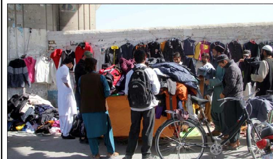
QUETTA: Warm clothes are being selling at roadside stalls as the demand of warm clothes increased in city during the winter season.