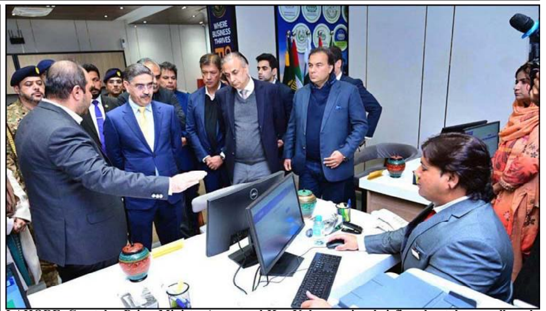
LAHORE: Caretaker Prime Minister Anwaar-ul-Haq Kakar receives briefing about the overall working and current progress of the Business Facilitation Center.

It also demanded to devise a monitoring mechanism in all the universities for enforcement of the "Policy on Drug and Tobacco Abuse in Higher Education Institutions 2021" in letter and spirit. Another resolution of PTI Senator Seemee Ezdi was not taken up due to the absence of lawmaker which recommended the government to prioritize climate change projects in its development Budget and allocate sufficient funds for climate change adaptation.