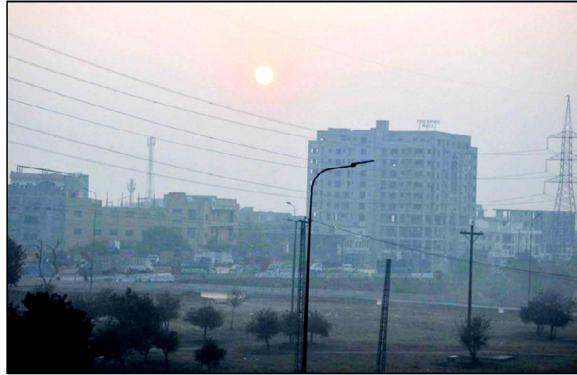
ISLAMABAD: A view of first sunrise of year 2024 through Khana Pul.