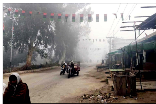
NAUNDERO: View of foggy weather on early morning on the arrival of winter season, captured over the horizon of Naundero

Deputy Commissioner/DRO Ghotki said that during the general elections, 728 polling stations will be set up for 9,10,662 voters in the district, in which 200 will be reserved for men and 200 for women, while 328 will be common. Similarly, 2620 booths will be established, of which 1381 will be for men and 1339 for women. He said that during the general elections, a total of 9,316 employees including 728 presiding officers, 5240 assistant presiding officers, and 2620 presiding officers will perform their duties. pay. On this occasion, he directed the DHO and said that a health emergency plan should be prepared in connection with the general elections, all the ambulances should be operational and any kind of negligence in this regard will not be acceptable.