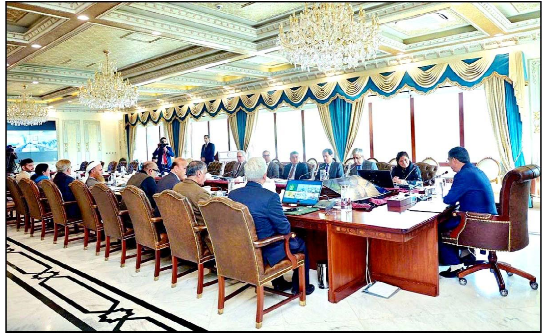
ISLAMABAD: Caretaker Prime Minister Anwaar-ul-Haq Kakar chairs a meeting on Afghan Transit Trade and Anti-smuggling.

The caretaker prime minister said that all the resources and security apparatus would be utilized to ensure the holding of peaceful polls on the election date and expressed the hope that they would be successful in this regard.