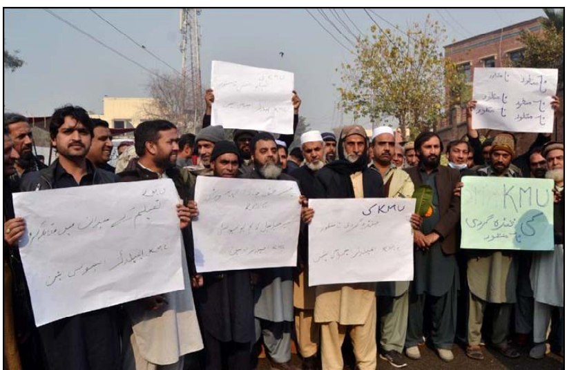
PESHAWAR: Members of Khyber Medical Employees Association are holding protest demonstration for acceptance of their demands, held at Peshawar press club.

MANANWALA (Online): PML-N central leader Mian Javed Latif has said titanic of PTI politics has sunk. "We will put the final nail in the political coffin of Intehar Khan and his coterie on February 8 and send him packing for ever, he said this while talking to media men here Monday after holding corner meetings in different villages of constituency PP-142. "My Quaid Nawaz Sharif is last ray of hope for people who will steer the country from "Masalistan" and put it on the path to progress and prosperity, he added. PML-N will win the election with overwhelming majority from across the country, he claimed. Sheikhpura is citadel of tigers of Mian Nawaz Sharif. Our political rivals have become confused over our politics of service to people. We have accomplished record development projects in our respective constituencies. He announced Mian Nawaz Sharif and Maryam Nawaz will soon address public meeting.