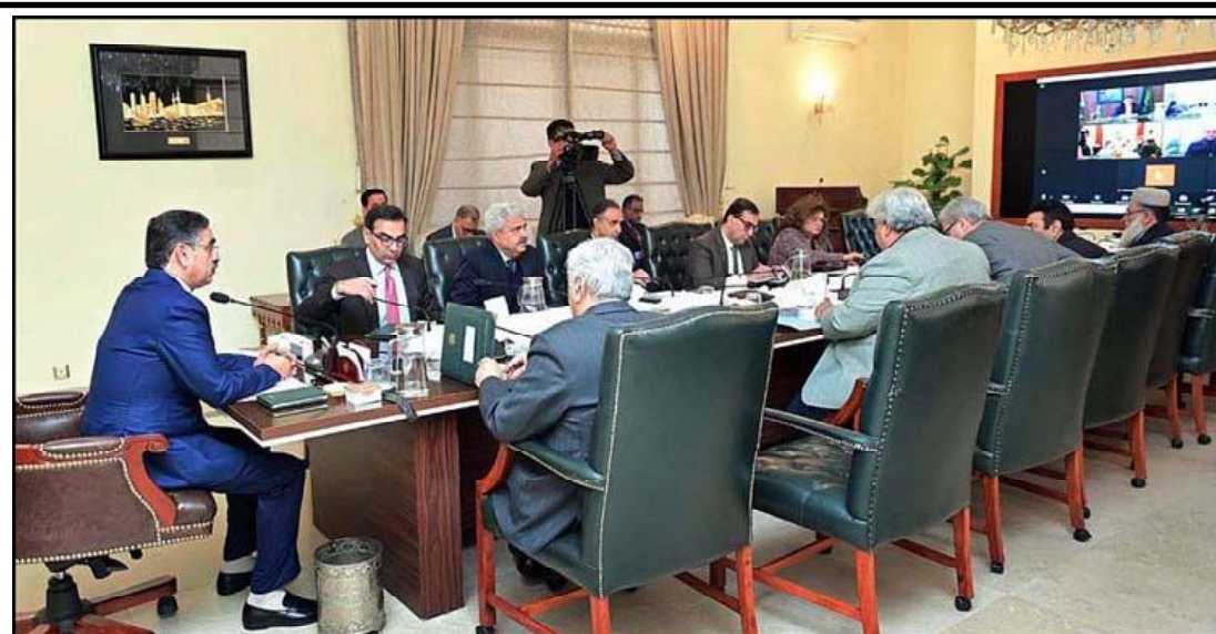
ISLAMABAD: Caretaker Prime Minister Anwaar-ul-Haq Kakar chairs a meeting availability of Urea Fertilizer in the country.