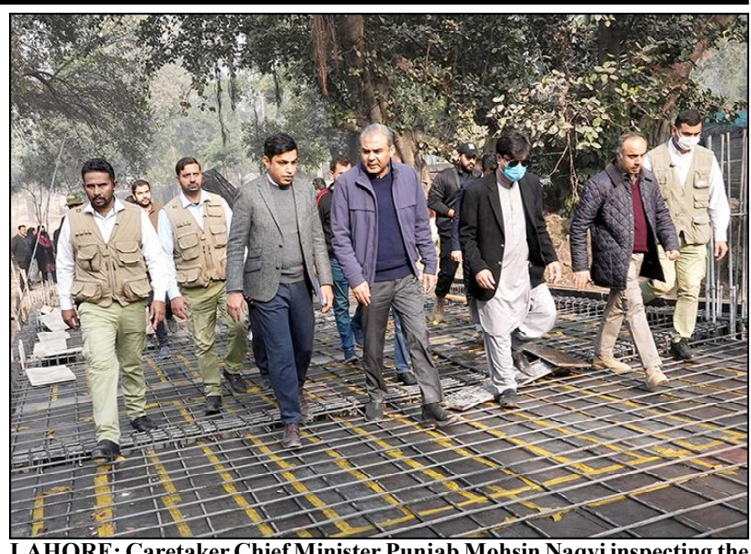
LAHORE: Caretaker Chief Minister Punjab Mohsin Naqvi inspecting the on-going construction works at Lahore Zoo.

India remain marginalized, with recent cricket clashes highlighting the lopsided nature of the historic rivalry. The two nations' diminishing economic ties and cultural exchanges mirror the broader trend of India prioritizing relationships with other regional players. The surge in nationalism and public hostility on both sides further exacerbates the diplomatic challenges, raising questions about the prospects for future cooperation. As several experts and government officials contend that Pakistan has strategically employed terrorism as a proxy to achieve its objectives against India, a country it perceives as a national security threat, the ripple effect extends to broader regional implications in the medium term. It exacerbates existing bilateral relations and fosters greater mistrust and instability between two are three primary issues nuclear-armed neighbors that persist in its relation- with a history of multiple