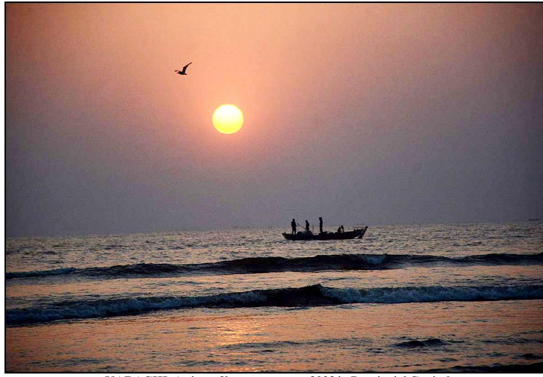
KARACHI: A view of last sunset year 2023 in Provincial Capital