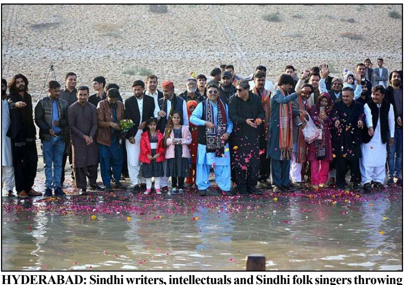
rose petals in the Indus River during last sunset of 2023 at Almanzar Picnic

During the year 2023, militant attacks not only increased in Khyber Pakhtunkhwa and its tribal districts but also in Balochistan and Punjab. Khyber Pakhtunkhwa witnessed the highest number of militant attacks.