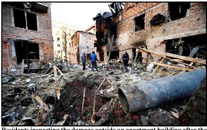
Residents inspecting the damage outside an apartment building after the overnight Russian drone attack in Kharkiv.