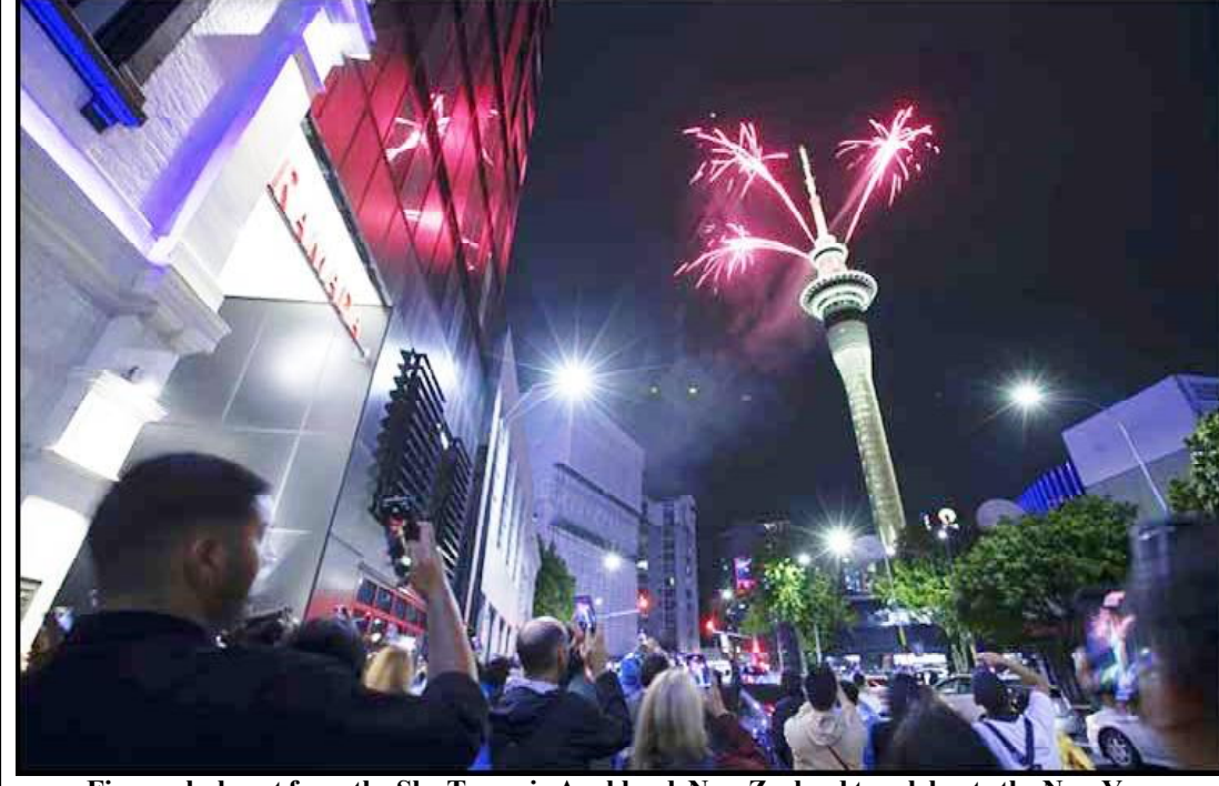
Fireworks burst from the Sky Tower in Auckland, New Zealand to celebrate the New Year

says Gaza is "just weeks away" from famine. Prime Minister Benjamin Netanyahu said Saturday that Israel's war against Hamas will last for "many months"—until the Palestinian militant group has been