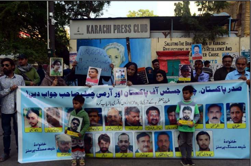
KARACHI: Members of Shia Missing Persons are holding protest demonstration for recovery of their loved one as soon as possible, at Karachi