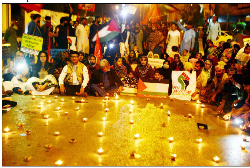
KARACHI: Members of National Trade Union Federation (NTUF) are enlightened candles to express solidarity with martyred innocent people of Palestine and against Israeli cruel and inhumane acts, during protest demonstration at Karachi press club

ered 23 iPhonesworth Rs9.2 million from her bag. A case has been registered under the Customs Act after recovering the smartphones.