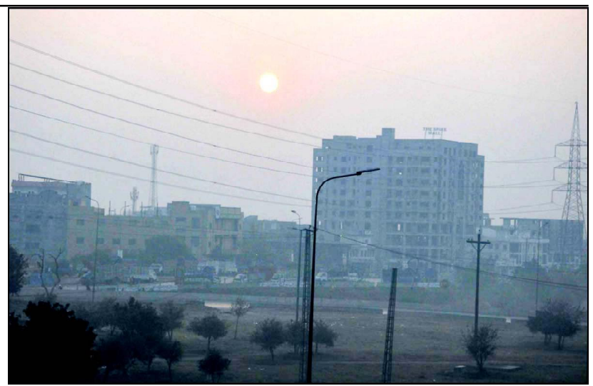
ISLAMABAD: A view of first sunrise of year 2024 through KhanaPul.

BAP Senator Samina Mumtaz Zehri moved another resolution recommending the government to take immediate steps to cater needs of all students with diverse cultural backgrounds and to reform the higher education curriculum to apprise students of the consequences and risks of drug usage.