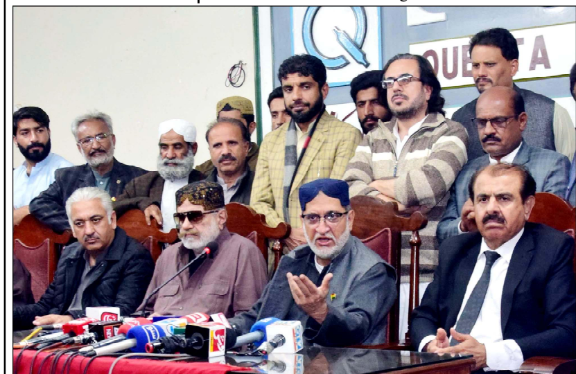
QUETTA: Balochistan National Party Chief, Sardar Akhtar Jan Mengal addresses to media persons during press conference at Quetta press club