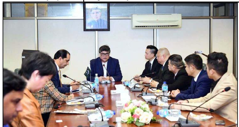
ISLAMABAD: Caretaker Federal Minister for Privatisation, Fawad Hasan Fawad in a meeting with Chinese Business Delegation on at Privatisation Division.