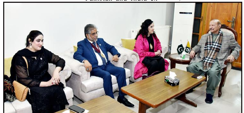
ISLAMABAD: A Delegation of Kashmiris meeting with president Azak Kashmir Barrister Sultan Mehmood Chaudhary

The differences among the party candidates for the constituencies of Lahore will also be got reconciled.