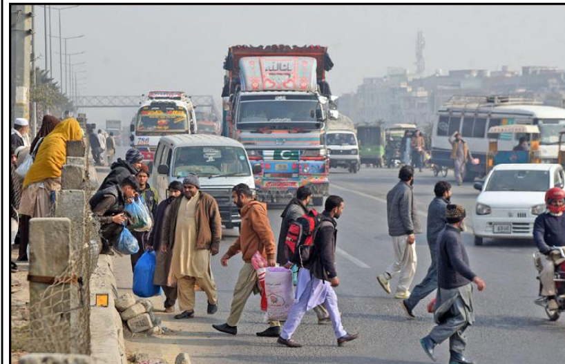
ISLAMABAD: People are crossing the busy Kernal Sher Khan Road instead of using over head pedestrian bridge, which may cause any incident any time.

A five hundred rupee fine will be imposed for motorcycle and car drivers, two thousand rupees for light transportation, and five thousand rupees for passengers and large vehicles for using a phone while driving. A two thousand rupee fine for driving an unlicensed motorcycle or light transport vehicle and a five thousand rupee fine for passenger carriers and heavy trucks will be obligatory.