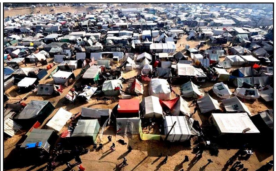
Displaced Palestinians, who fled their homes due to Israeli strikes, shelter in a tent camp, in Rafah, southern Gaza Strip

any new escalation carries risks for a wider regional war. Tehran-backed fighters in Yemen have attacked Red Sea shipping, drawing a US military response, and an Iranian warship has sailed into the waterway, Iranian media reported on Monday. The Gaza war was triggered by a surprise Hamas attack on Israeli towns on Oct. 7 that Israel says killed 1,200 people. Palestinian health authorities in Hamas-run Gaza say Israel's offensive there has killed more than 21,978 people. The scale of suffering in Gaza, where the bombardment has driven almost all inhabitants from their homes, has led Israel's Western allies, including the US, to urge it to scale down its offensive. "My wish for 2024 is not to die... Our childhood is gone. There is no bathroom, no food and no water. Only tents. There is nowhere safe. There is nothing. Our wish is to go back to our homes and end this," 11-year-old Layan Harara said in Gaza's Rafah. Residents of Sheikh Radwan district in Gaza City, in the northern part of the enclave that Israel's offensive focused on first, said tanks had withdrawn after what they described as the most intense 10 days of warfare since the conflict began.