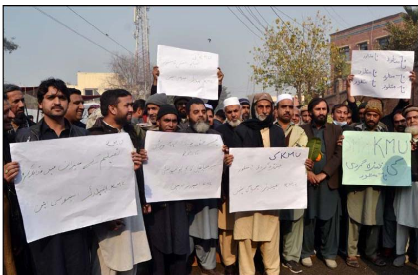
PESHAWAR: Members of Khyber Medical Employees Association are holding protest demonstration for acceptance of their demands, held at Peshawar press club.

MANANWALA (Online): PML-N central leader Mian Javed Latif has said titanic of PTI politics has sunk. "We will put the final nail in the political coffin of Intehar Khan and his coterie on February 8 and send him packing for ever, he said this while talking to media men here Monday after holding corner meetings in different villages of constituency PP-142. "My Quaid Nawaz Sharif is last ray of hope for people who will steer the country from "Masailistan" and put it on the path to progress and prosperity, he added. PML-N will win the election with overwhelming majority from across the country, he claimed. Sheikhpura is citadel of tigers of Mian Nawaz Sharif. Our political rivals have become confused over our politics of service to people. We have accomplished record development projects in our respective constituencies. He announced Mian Nawaz Sharif and Maryam Nawaz will soon address public meeting.