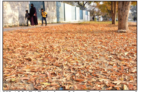
ISLAMABAD: A view of the yellow leaves on road side after dropping from trees as indicating autumn season in Federal Capital.