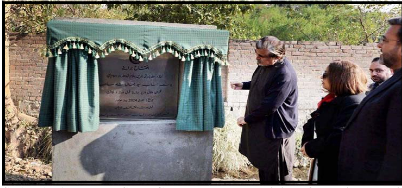
ISLAMABAD: Jamal Shah, Caretaker Federal Minister for National Heritage and Culture inaugurating Shah Alla Ditta Caves development, conservation & preservation project.

Replying to a question, he said it is a gift for the nation that Pakistan declared a best tourism destination in the world, adding, the government is simplifying the procedures and encouraging and involvement of private sector.