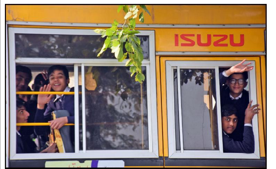
ISLAMABAD: Students are leaving to home in school bus as today was the first after winter vacation in Federal Capital.

Interior of the cave is divided into upper and lower halves. Walls are treated with mud plaster having many coatings of white wash but now the color of the walls become blackish due to the smoke of the fire used by the dwellers.