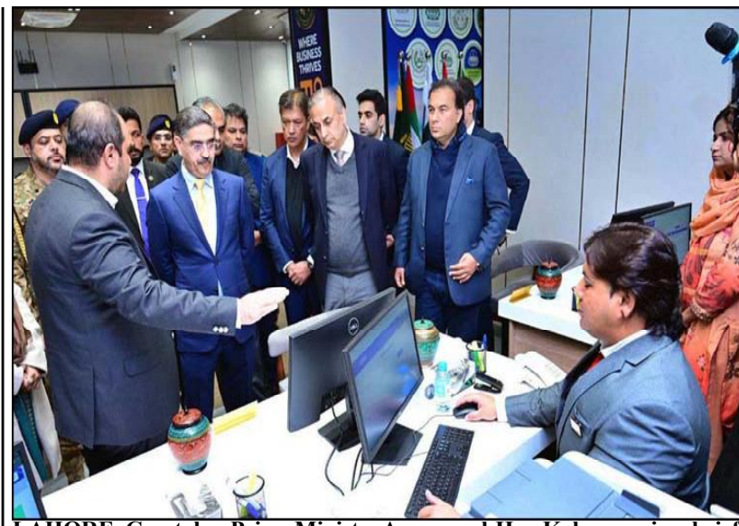
LAHORE: Caretaker Prime Minister Anwaar-ul-Haq Kakar receives briefing about the overall working and current progress of the Business Facilitation Center.

In his message, the Vice Chancellor has directed the regional heads of the university to take special care of the students' facilities and provide them with full support.