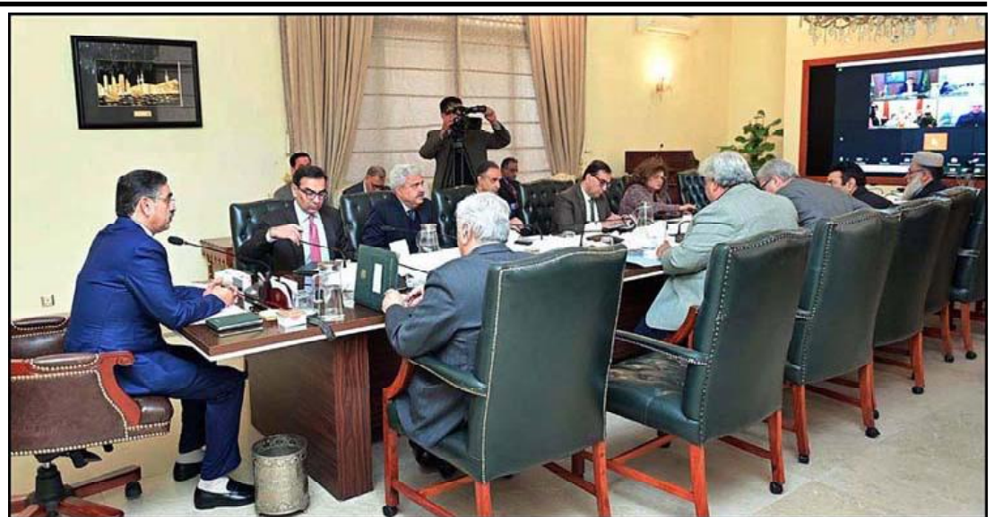
ISLAMABAD: Caretaker Prime Minister Anwaar-ul-Haq Kakar chairs a meeting availability of Urea Fertilizer in the country.

He said that those exploiting farmers by urea fertilizer hoarding would not be spared. The prime minister chaired a meeting over the availability of urea fertilizer in the country. The meeting was attended by Caretaker Finance Minister Dr Shamsad Akhtar, Caretaker Minister for Energy Muhammad Ali, Caretaker Minister for National Food Security Dr Kausar Abdullah Malik, Caretaker Minister for Trade Dr Gohar Ejaz, caretaker chief ministers and relevant officials, PM Office Media Wing said in a press release.