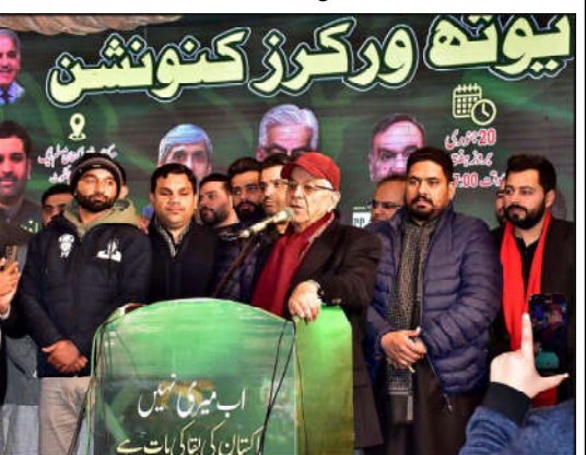
SIALKOT: Former Federal Minister for Defence Khawaja Muhammad Asif is addressing to the participants of Workers Convention at PML-N House at Paris Road.

Third parties to explore mutually beneficial avenues of cooperation. The two sides rejected the disinformation campaigns and distorted reporting on CPEC and stressed the need to counter fallacious narratives and misinformation.