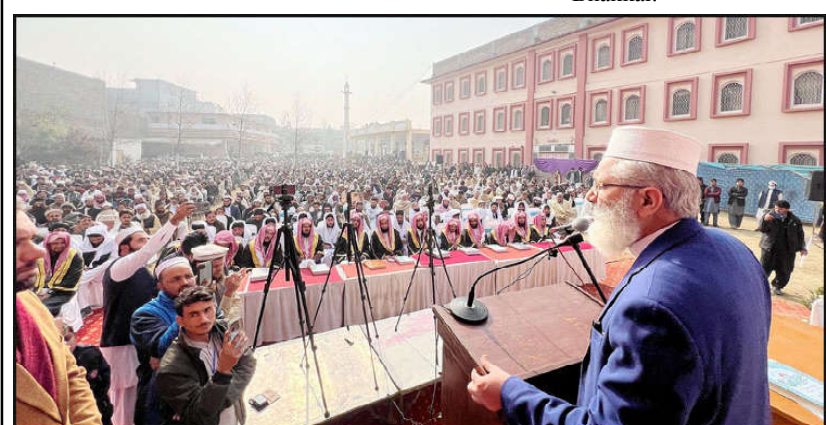
MALAKAND: Amir Jamaat-e-Islami Pakistan Sirajul Haq addressing annual ceremony of Khatam-e-Bukhari

ISLAMABAD (INP): At least three people were killed and two others were wounded in a fog-related road accident in Kasur on late Friday night. According to private news channel, an accident occurred at the Kutchery Road in Pattoki where a truck collided with a trailer parked on the road side due to dense fog, killing three persons on the spot and injuring two others. Police and rescue teams reached the spot after getting information and shifted the dead and injured to a nearby hospital. In another incident, two people died when a passenger van crashed into a loader near Jehan Khan on Jhang Road in Bhakkar.