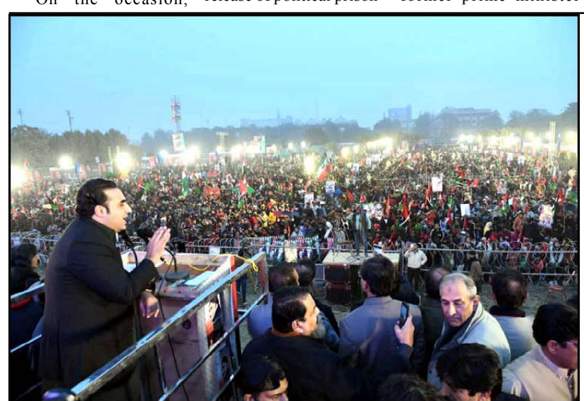
LAHORE: Peoples Party (PPP) Chairman, Bilawal Bhutto Zardari addresses to his supporters during public gathering meeting regarding Election Campaign in connection of the General Election 2024 coming ahead, in Lahore.