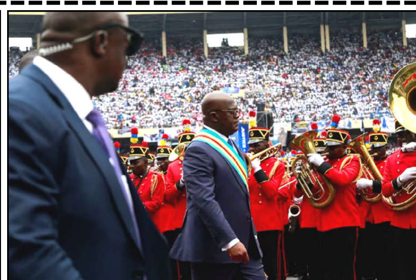
Democratic Republic of Congo President Felix Tshisekedi arrives to be sworn in for a second term as a president during the inauguration ceremony at Martyrs Stadium in Kinshasa, Democratic Republic of Congo.

Ethiopia's current main port for maritime exports is in the neighbouring country of Djibouti. "My message to Ethiopia is that ... trying to seize a piece of land to control it is something no one will agree to," Sisi said, saying cooperation on development was a better strategy.