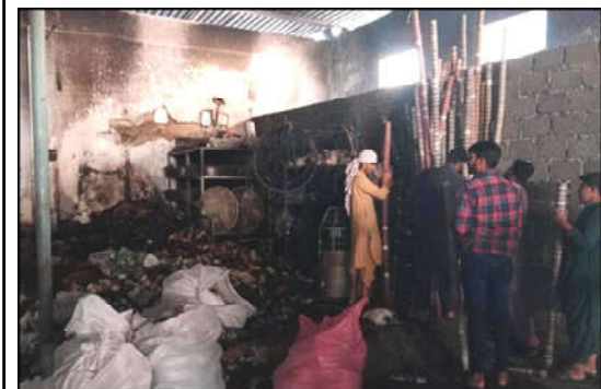
KARACHI: View of site after a fire broken out incident at a factory as the fire brigade officials are busy in extinguishing fire and rescue operation, at New Karachi Industrial area of Karachi.

visit to different areas of Tehsil Torkho. He addressed public gatherings there. The people of Veerkop, Shahgram and other areas gave him a warm welcome. The JUI workers welcomed him outside the city and took him in a convoy to the public meeting place.