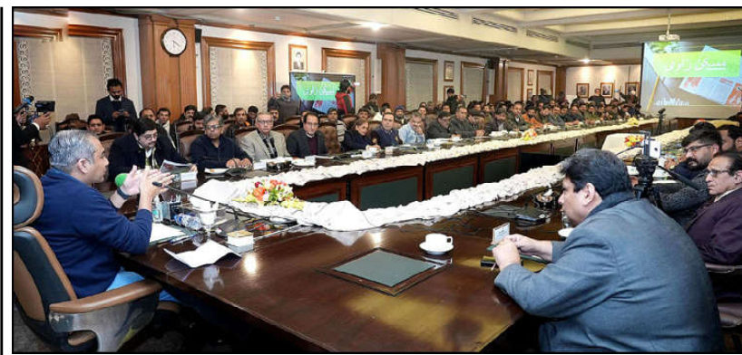
LAHORE: Caretaker Chief Minister Punjab Mohsin Raza Naqvi addressing the ceremony organized in connection with allotment of Residential Plots to Professional Journalist of Punjab.

Urban Development Authority (RUDA) will inform the journalists community about the mode for acquiring the plots. Mohsin Naqvi stated that approximately, one year of the incumbent government has passed. "Whichever city I visit, the only demand being made by the journalists community is to do something substantial for their welfare. Today, we have fulfilled our promise being made with our journalist brothers."