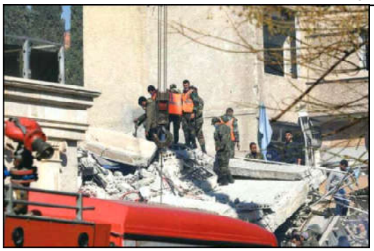
DAMASCUS: Security and emergency personnel search the rubble of a building destroyed in an Israeli strike.

An Associated Press analysis of the footage suggested the launch happened at the Guard's launch pad on the outskirts of the city of Shahrood, some 350 kilometers (215 miles) east of the capital, Tehran. Iran's three latest successful satellite launches have all happened at the site.