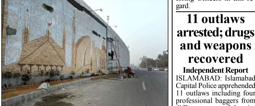
ISLAMABAD: Laborers busy in construction work to enhance the beauty of the city on the wall of a flyover at Rawal Dam Chowk in the Federal Capital.

ISLAMABAD (INP): The number of pending cases before the Supreme Court (SC) of Pakistan is more than 55,000 as of 16th December 2023, a report issued by the apex court read. According to a quarterly report (from 17th September 2023 to 17th December 2023), the top court of the country has disposed of 859 during the period. The report, issued under Article 19-A which guarantees right to information, read that the number of pending cases was 56,503 on 17th September 2023 and dropped to 55,644 on 17th December 2023.