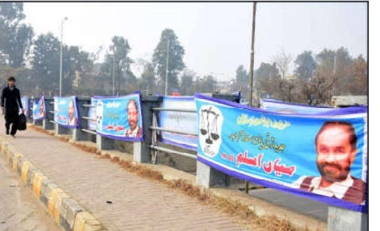
ISLAMABAD: A man walks past banner of a political party Jamaat-e-Islami candidate on a bridge in the Federal Capital, ahead of the country's general elections 2024.

ISLAMABAD (INP): The International Islamic University, Islamabad (IIU), invited applications from students interested in enrolling in short Sunday courses to learn the Arabic language. According to the University official, a 24 week Arabic learning course, taking place only on Sundays, is set to begin on February 18, 2024. Admissions are open in three phases: certificate for individuals without prior knowledge of Arabic, diploma for those who complete the certificate course.