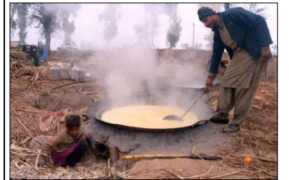
SARGODHA: Farmer busy making traditional sweet item Gurr near Khushab Road.