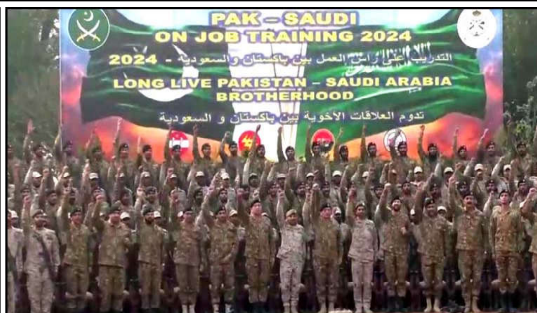
A view of group photo as joint military training between Pakistan Army and Royal Saudi Land Forces started at Okara garrison

Those who used to chant slogans of vote kizzat do (give respect to vote) are nowhere to be found," he said, referring to former prime minister Nawaz Sharif.