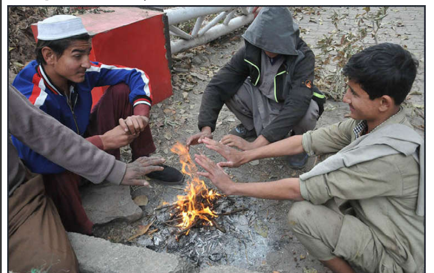
ISLAMABAD: People are sitting around fire, warm themselves as the temperature dropped in Federal Capital.

SUKKUR (APP): PPP leader Syed Khursheed Ahmed Shah on Sunday confidently declared his party will win the upcoming general elections. "InshaAllah, the next government will be of the Pakistan Peoples Party." Addressing a gathering here, he assured that the People's Party would save Pakistan economically. He said that the PPP Government in Sindh has accomplished a lot, ended oppression, and faced challenges but has never left the field. He mentioned that there are role model hospitals like NICVD and SIUT in Sindh, while the others have not built a single hospital in Punjab. He said that PPP has undertaken projects in both rural and urban areas of Sindh, consistently contributing to historical developments. Syed Khursheed Ahmed Shah criticized Imran Khan, stating that the PTI government has damaged the country's economy, and in 2018, an incompetent person was imposed on Pakistan.