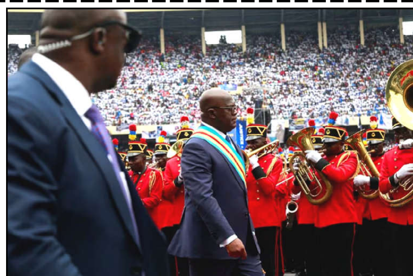
Democratic Republic of Congo President Felix Tshisekedi arrives to be sworn in for a second term as a president during the inauguration ceremony at Martyrs Stadium in Kinshasa, Democratic Republic of Congo.

Ethiopia's current main port for maritime exports is in the neighbouring country of Djibouti. "My message to Ethiopia is that ... trying to seize a piece of land to control it is something no one will agree to," Sisi said, saying cooperation on development was a better strategy.