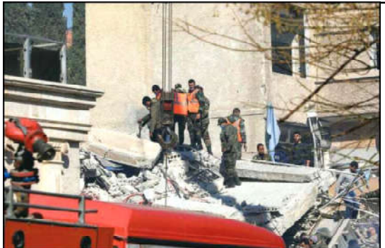
DAMASCUS: Security and emergency personnel search the rubble of a building destroyed in an Israeli strike.

An Associated Press analysis of the footage suggested the launch happened at the Guard's launch pad on the outskirts of the city of Shahroud, some 350 kilometers (215 miles) east of the capital, Tehran. Iran's three latest successful satellite launches have all happened at the site.