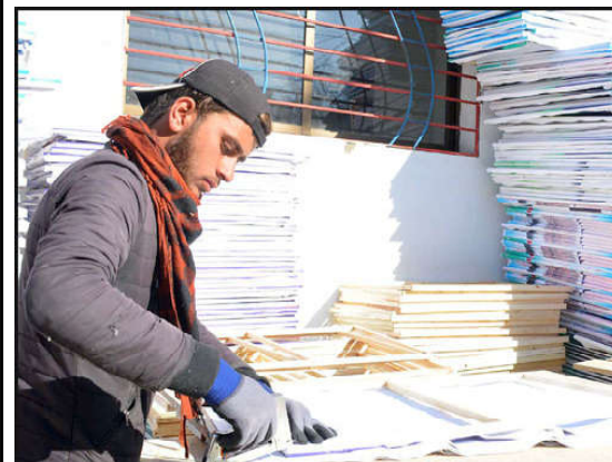
QUETTA: Workers busy preparing Election 2024 posters on Mekangi Road.