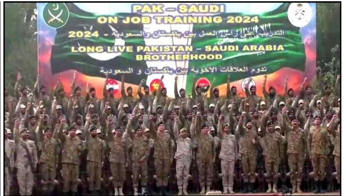
A view of group photo as joint military training between Pakistan Army and Royal Saudi Land Forces started at Okara garrison

Nawaz Sharif. Bilawal reminded that those who now mock the PPP's limited presence in Lahore have forgotten that the city warmly welcomed Benazir Bhutto, and in turn, she was elected as the prime minister of the country. The PPP chairman highlighted his 10-point welfare agenda, emphasising that upon assuming power, 17 federal ministries would be abolished and the elites would no longer receive subsidies.