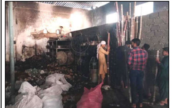
KARACHI: View of site after a fire broken out incident at a factory as the fire brigade officials are busy in extinguishing fire and rescue operation, at New Karachi Industrial area of Karachi.

Contesting the elections from Chitral on the ticket of Jamiat Ulema-e-Islam, Muhammad Talha Mehmood said during his