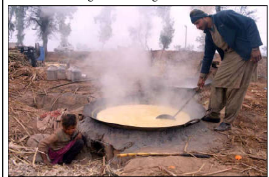
SARGODHA: Farmer busy making traditional sweet item Gurr near Khushab Road.