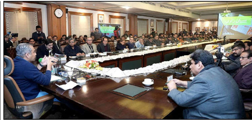
LAHORE: Caretaker Chief Minister Punjab Mohsin Raza Naqvi addressing the ceremony organized in connection with allotment of Residential Plat to Professional Journalist of Punjab.

Urban Development Authority (RUDA) will inform the journalists community about the mode for acquiring the plots. Mohsin Naqvi stated that approximately, one year of the incumbent government has passed. "Whichever city I visit, the only demand being made by the journalists community is to do something substantial for their welfare. Today, we have fulfilled our promise being made with our journalist brothers."