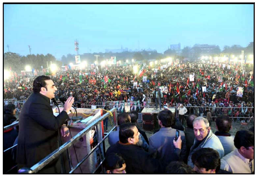
LAHORE: Peoples Party (PPP) Chairman, Bilawal Bhutto Zardari addresses to his supporters during public gathering meeting regarding Election Campaign in connection of the General Election 2024 coming ahead, in Lahore.