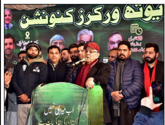
SIALKOT: Former Federal Minister for Defence Khawaja Muhammad Asif is addressing to the participants of Workers Convention at PML-N House at Paris Road.

In Nankana Sahib, a warning was issued to election candidates for displaying Panaflex and billboards. Panaflex and other promotional materials have been removed from Jhelum, Rawalpindi, Islamabad, Sargodha and Bhakkar. Panaflex hoardings have also been put up in Chinot, Faisalabad, Nankana, Kasur, Lahore and Multan. Provincial Election Commissioner Punjab has issued strict instructions to District Monitoring Officers in this regard.