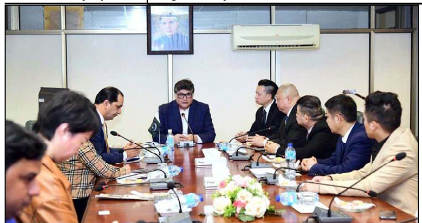
ISLAMABAD: Caretaker Federal Minister for Privatisation, Fawad Hasan Fawad in a meeting with Chinese Business Delegation on at Privatisation Division.

ISLAMABAD (APP): Caretaker Prime Minister Anwaar-ul-Haq Kakar on Monday said that enough urea fertilizer was available in the country to meet requirements and directed for initiation of legal proceedings against those involved in its hoarding and illegal profiteering. He said that those exploiting farmers by urea fertilizer hoarding would not be spared. The prime minister chaired a meeting over the availability of urea fertilizer in the country. The meeting was attended by Caretaker Finance Minister Dr Shamsad Akhtar, Caretaker Minister for Energy Muhammad Ali, Caretaker Minister for National Food Security Dr Kausar Abdullah Malik, Caretaker Minister for Trade Dr Gohar Ejaz, caretaker chief ministers and relevant officials, PM Office Media Wing said in a press release.