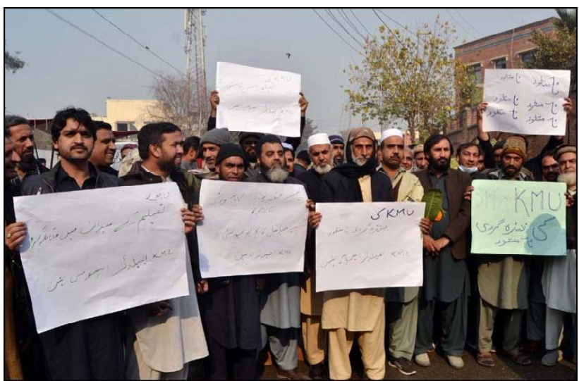
PESHAWAR: Members of Khyber Medical Employees Association are holding protest demonstration for acceptance of their demands, held at Peshawar press club.