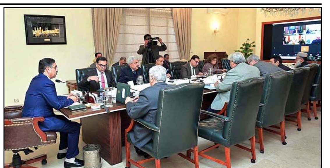
ISLAMABAD: Caretaker Prime Minister Anwaar-ul-Haq Kakar chairs a meeting availability of Urea Fertilizer in the country.

opportunities, taxation as well as GDP growth. He said that owing to the mutual cooperation between the government and the business community, the country was heading towards achieving economic stability and revival.