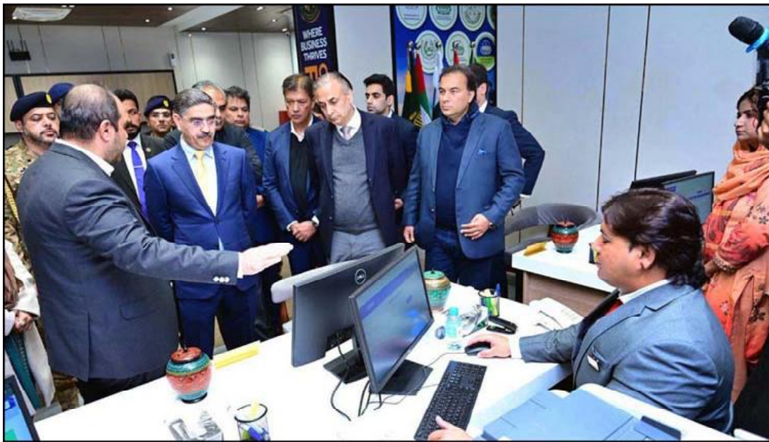
LAHORE: Caretaker Prime Minister Anwaar-ul-Haq Kakar receives briefing about the overall working and current progress of the Business Facilitation Center.