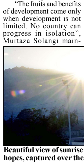
Beautiful view of sunrise of year 2024 with the new hopes, captured over the horizon of Quetta

Welcoming the message of the President of the People's Republic of China Xi Jinping at the beginning of the new year, Murtaza Solangi said his vision of global development was also evident in his New Year message. President Xi has always promoted the timeless principles of humanity and his theory was a negation of the theory that a country can achieve development only by keeping other countries behind, the minister opined. "In our region too, President Xi Jinping's globalist ideology is gaining ground," he said.