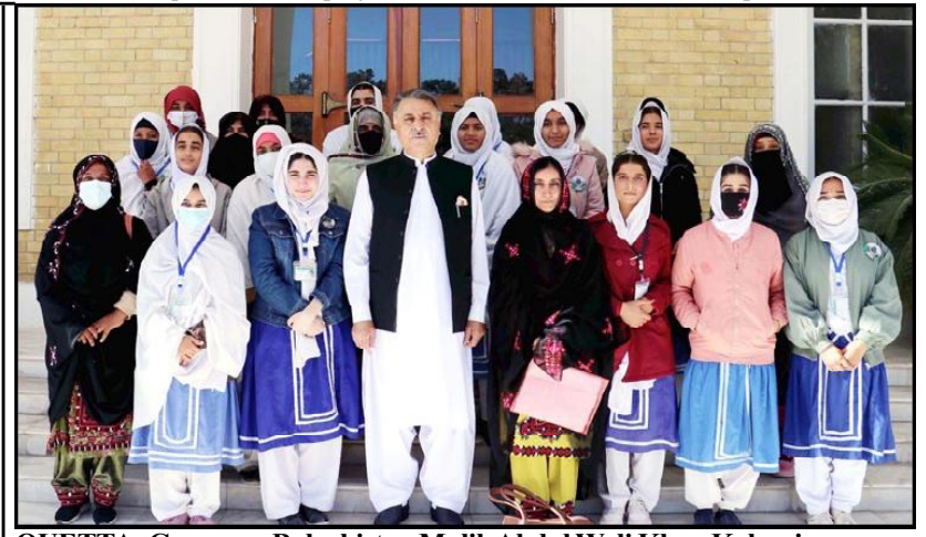
QUETTA: Governor Balochistan Malik Abdul Wali Khan Kakar in a group photo with students of Turbat during their visit to Governor House

Independent Report ISLAMABAD: Pakistan condemns the Indian authorities' decision to declare the Tehreek-e-Hurriyat Jammu and Kashmir (TeH) as an "unlawful association", for a period of five years. The TeH is the second Kashmiri party banned under the Unlawful Activities (Prevention) Act (UAPA) in less than a week's time. With its banning, the total number of outlawed Kashmiri political parties increases to six. The party was founded by iconic Kashmiri leader, Syed Ali Shah Geelani, who passed away in 2021 during a protracted house arrest. His death body was ruthlessly snatched by the occupation authorities, and his near and dear ones were not allowed to attend his funeral. Banning of political parties is part of India's relentless campaign to subjugate the Kashmiri people, suppress dissent, and consolidate its occupation of Indian Illegally Occupied Jammu and Kashmir (IIOJK). These actions blatantly violate democratic norms and international human rights and humanitarian law. India must remove the ban on all the political parties illegally outlawed in IIOJK; respect the fundamental rights and freedoms of the Kashmiri people; release all the political prisoners and dissenters; and faithfully implement the UN Security Council resolutions on Jammu and Kashmir.