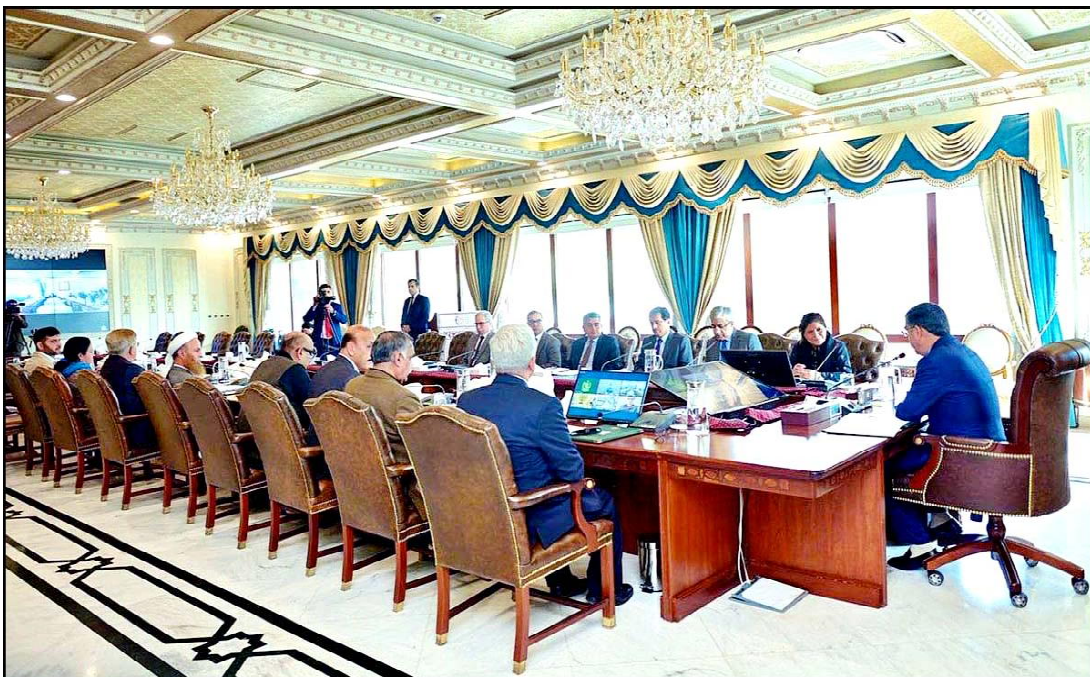
ISLAMABAD: Caretaker Prime Minister Anwaar-ul-Haq Kakar chairs a meeting on Afghan Transit Trade and Anti-smuggling.

Ph: 2841470/2841473 Vol: XVIII No. 352, Jamadi-us-Sani 19, 1445 AH Tuesday January 02, 2024, Pages 04, Price Rs.15