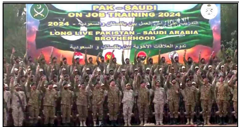
A view of group photo as joint military training between Pakistan Army and Royal Saudi Land Forces started at Okara garrison