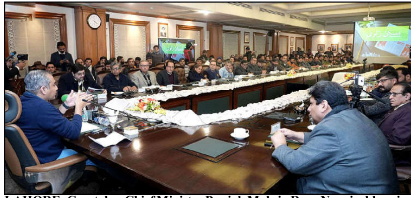
LAHORE: Caretaker Chief Minister Punjab Mohsin Raza Naqvi addressing the ceremony organized in connection with allotment of Residential Plat to Professional Journalist of Punjab.

Urban Development Authority(RUDA) will inform the journalists community about the mode for acquiring the plots. Mohsin Naqvi stated that approximately, one year of the incumbent government has passed. "Whichever city I visit, the only demand being made by the journalists community is to do something substantial for their welfare. Today, we have fulfilled our promise being made with our journalist brothers."