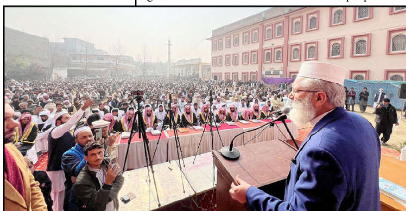
MALAKAND: Amir Jamaat-e-Islami Pakistan Siraul Haq addressing annual ceremony of Khatam-e-Bukhari at Daraul Aloom Taleem Sakhakot.