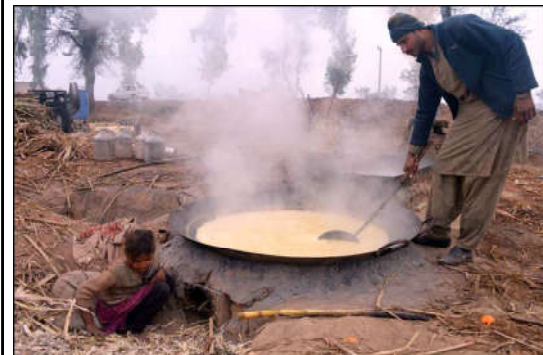
SARGODHA: Farmer busy making traditional sweet item Gurr near Khushab Road.