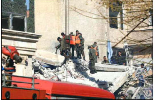
DAMASCUS: Security and emergency personnel search the rubble of a building destroyed in an Israeli strike.

An Associated Press analysis of the footage suggested the launch happened at the Guard's launch pad on the outskirts of the city of Shahroud, some 350 kilometers (215 miles) east of the capital, Tehran. Iran's three latest successful satellite launches have all happened at the site.