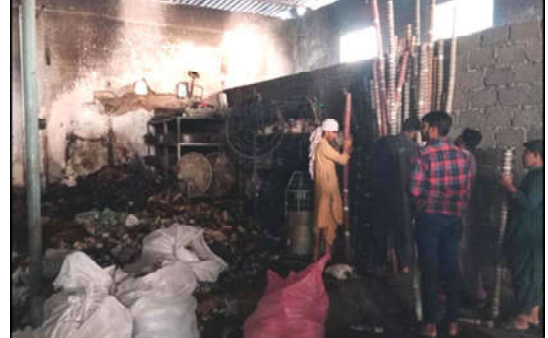
KARACHI: View of site after a fire broken out incident at a factory as the fire brigade officials are busy in extinguishing fire and rescue operation, at New Karachi Industrial area of Karachi.

"Governments and civil society organizations must remain active.