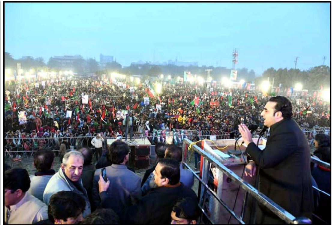
LAHORE: Peoples Party (PPP) Chairman, Bilawal Bhutto Zardari addresses to his supporters during public gathering meeting regarding Election Campaign in connection of the General Election 2024 coming ahead, in Lahore.

The PPP chairman highlighted his 10-point welfare agenda, emphasising that upon assuming power, 17 federal ministries would be abolished and the elites would no longer receive subsidies. Instead, he added, the funds saved from these decisions would be spent on the welfare of the people.