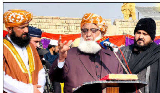
LAKKI MARWAT: Chief of JUI Maulana Fazlur Rehman addressing students during a ceremony

He demanded of the government to provide necessary protection to the party leaders.