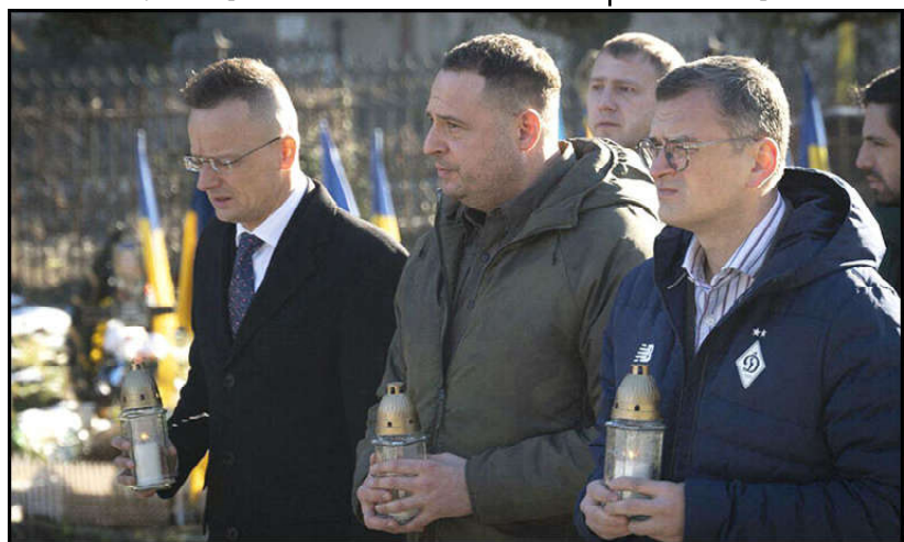
Hungarian foreign minister Peter Szijjarto, Zelensky's chief of staff Andriy Yermak and Ukrainian foreign minister Dmytro Kuleba paying tribute at Monument for Died Ukrainian Soldiers in Uzhhorod, home to a large ethnic Hungarian community in Ukraine.

Monitoring Desk HELSINKI: Finns headed to the polls to pick a new president on Sunday to lead the country in its new role within Nato after it broke with decades of non-alignment to join the Western defence alliance in the wake of Russia's invasion of Ukraine. The Nordic country's admission to Nato last year drew threats of "counter measures" from its much larger neighbour. In December, Finland closed its entire border with Russia to passenger traffic in response to a surge in migrants trying to cross. Moscow denied Finnish charges it was sending the migrants there. All nine candidates are promising a tough stance towards Russia if elected president.