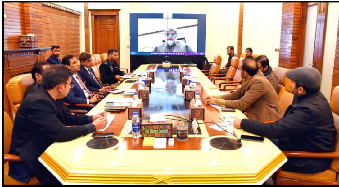
QUETTA: Caretaker Chief Minister Balochistan Mir Ali Mardan Khan Domki presiding over a level meeting regarding law and order situation