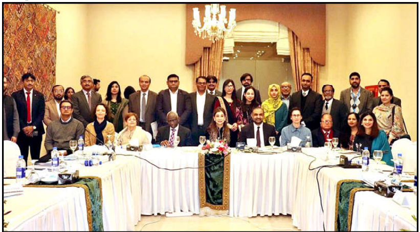
ISLAMABAD: Stakeholders gathered for a crucial consultation on the proposed Child Domestic Labour Draft Bill.