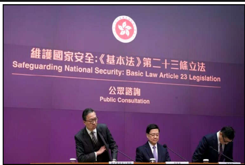
Hong Kong's Secretary for Justice Paul Lam, Chief Executive John Lee and Secretary for Security Chris Tang Ping-keung attend a press conference regarding the legislation of Article 23 national security laws, in Hong Kong.