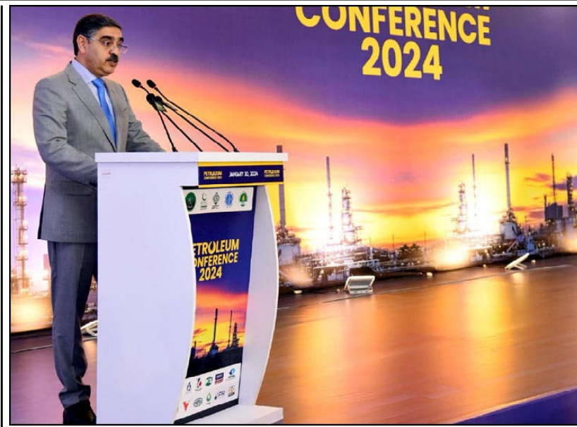
ISLAMABAD: Caretaker Prime Minister Anwaar-ul-Haq Kakar addresses the participants of Petroleum Conference.

ISLAMABAD (APP): Caretaker Prime Minister Anwaar-ul-Haq Kakar on Tuesday, while pointing to the abundant natural resources in the country, underlined the need for concerted efforts to explore onshore and offshore oil and gas reserves. He was addressing the Petroleum Conference 2024 as the chief guest. Chief of the Army Staff General Syed Asim Munir was the guest of honour. The prime minister affirmed the government's readiness to contribute in infrastructure development, logistics, and security to bolster exploration and production efforts. He further stated that the conference reflected a collective commitment to fully utilise the immense mineral potential so as to ensure energy self-sufficiency and transform Pakistan into a regional exporter of energy. He appreciated the Special Investment Facilitation Council (SIFC) and the Federal Ministry of Energy for fostering an investor-friendly environment by streamlining regulations and procedures. Country Manager, Kuwait Foreign Petroleum Exploration Company Ali Taha Al-Temimi appreciated unrelenting efforts of the Government of Pakistan in bringing the stakeholders together for formulating policy recommendations and boosting investment in the petroleum sector. Provincial chief ministers, minister for energy, secretary petroleum, government representatives, policy makers, foreign and domestic investors from the energy and petroleum (E&P) sector and international delegates also attended the conference.