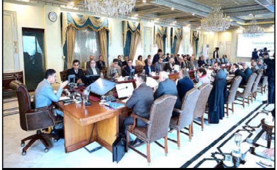
ISLAMABAD: Caretaker Prime Minister Anwaar-ul-Haq Kakar chairs meeting of the Federal Cabinet.

Elaborating his viewpoint, he said that Baloch, Pashtuns and different settlers had been living in Balochistan for decades. Continued on page 2