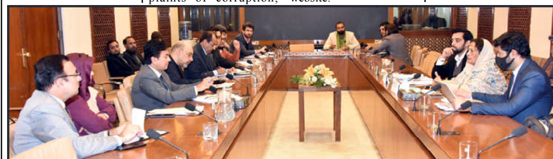
Senator Engr. Rukhsana Zuberi, Convener Sub-Committee of the Senate Standing Committee on Overseas Pakistanis and Human Resource Development presiding over a meeting of the committee at Parliament House Islamabad.

are treated in a non-humane way, orphaned and injured in order to implement the Islamabad Wildlife Management Board (IWMB) High Court's (IHC) judgment in W.P. 1155/2019 which specifically states, "No animal is treated in a manner that subjects it to unnecessary pain and suffering". She said that the IWMB operated under the Ministry of Climate Change and Environmental Coordination. In 2020, she said, when the Islamabad Zoo was permanently shut down on the IHC's orders the IWMB gradually converted its site into the only wildlife rescue centre, first of its kind in Pakistan, providing assistance to all species of wild animals in distress.