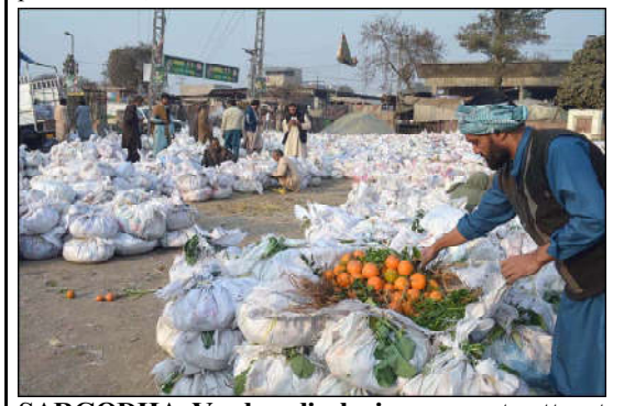
SARGODHA: Vendors displaying orange to attract the customers in front of market.