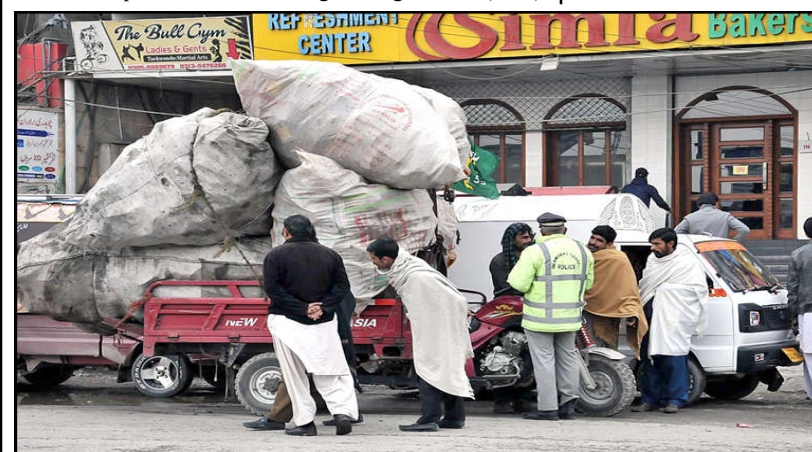
ISLAMABAD: Traffic police official issuing challan to rickshaw loader driver due to overloading which is a violation of the traffic rule at Lathrar Road, Khana Pull.

upload the required documents till March 16, 2024. The result of the scholarship will be announced by email around July 15, 2024 to every candidate who applied for the scholarship. It is the responsibility of the students applying for any professional degree (Medical, Engineering, Nursing, Architecture, Law, Veterinary Medicine, etc.) to first get confirmed its accreditation from the respective Councils i.e. Pakistan Medical and Dental Council (PMDC), Pakistan Engineering Council (PEC),