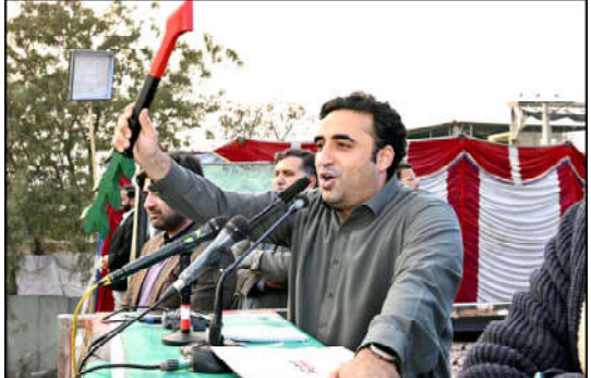
DERA ISMAIL KHAN: Peoples Party (PPP) Chairman, Bilawal Bhutto Zardari addresses to his supporters during public gathering meeting as a part of Election Campaign in connection of the General Election 2024