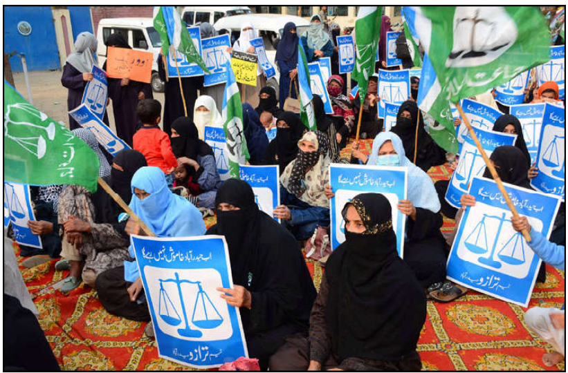
HYDERABAD: Activist of Jamat-e-Islami holds a sit in protest against over billing, Detection and pro long load shedding, outside HESCO Headquarter.