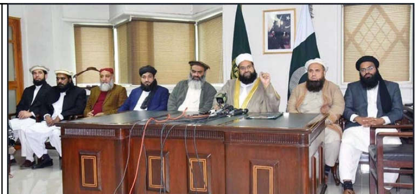
ISLAMABAD: Special Representative to the Prime Minister for Religious Harmony & Islamic Countries and Chairman Pakistan Ulema Council Hafiz Tahir Mahmood Ashrafi addressing a press conference accompanied by Ulema and Mashaikh.