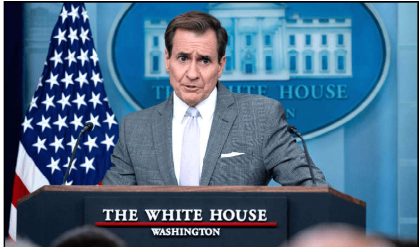
US National Security Council spokesman John Kirby speaks during the daily briefing in the Brady Briefing Room of the White House in Washington, DC.