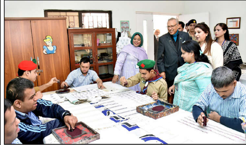
KARACHI: President Dr. Arif Alvi visiting the Center or training at Society for Children Need of Special Attention (SCINOSA).

Cardiology besides multi-million road projects to facilitate the people of the area. After inaugurating health facilities, he inspected 'Accident & Emergency' and other wards. All wards and departments of state-of-the-art hospitals are fully functional for medical facilities. During a briefing, the caretaker CM was told that Angiography, CT scan and other facilities are being conducted at the hospital. Later, speaking to journalists, Mohsin Naqvi stated that it was the responsibility of doctors, nurses, paramedics and staff of the cardiology department to maintain the standard of the hospital. He informed that poor people of the area would benefit from the facilities being extended there.