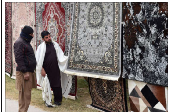
ISLAMABAD: A vendor is selling carpets alongside a road in the Federal Capital.