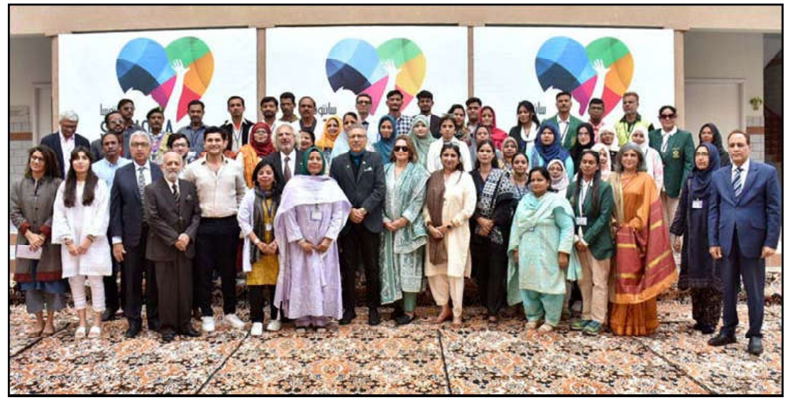
KARACHI: President Dr. Arif Alvi and the First Lady Begum Samina Arif Alvi in a group photo with organizers and staff at Society for Children in Need Of Special Attention (SCINOSA).

Federal and Sindh governments have made laudable progress in that regard by reserving special quota for differently-abled persons in public sector jobs while the banking sector was also inducting special persons, Dr. Alvi said adding that Governor SBP and heads of different banks had also assured of additional steps in that regard in a recent meeting on inclusion and empowerment of special persons and women.