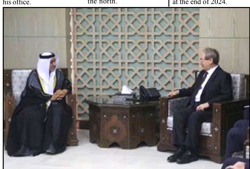
Syrian Foreign Minister Faisal Mekdad meets with new ambassador of the United Arab Emirates to Syria, Hassan al-Shehi, in Damascus, Syria.

He added that reservists would be gradually released "to prepare and come ready" for future operations. Since the Israeli invasion against Gaza on Oct 7, the Lebanese-Israeli border has seen near-daily exchanges of fire between the Israeli army and Lebanon's Hezbollah movement, a Hamas ally. Hezbollah on Monday claimed responsibility for 10 attacks on Israeli army positions near the border, using Iranian-made Falaq-1 rockets. Israel has not reported any strikes on military sites in the north.