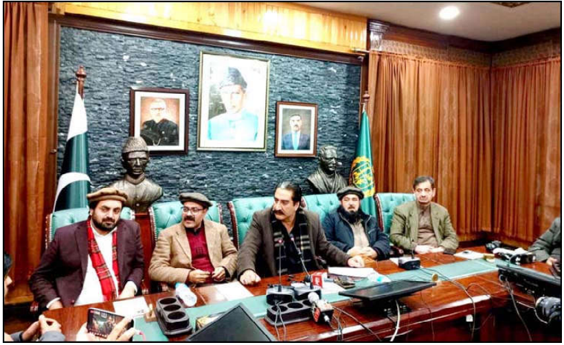
GILGIT: Provincial Ministers Gilgit-Baltistan addressing a press conference regarding wheat subsidy.