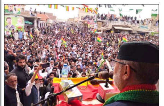
DALBANDIN: President of Balochistan National Party Sardar Akhtar Jan Mengal addressing a public meeting