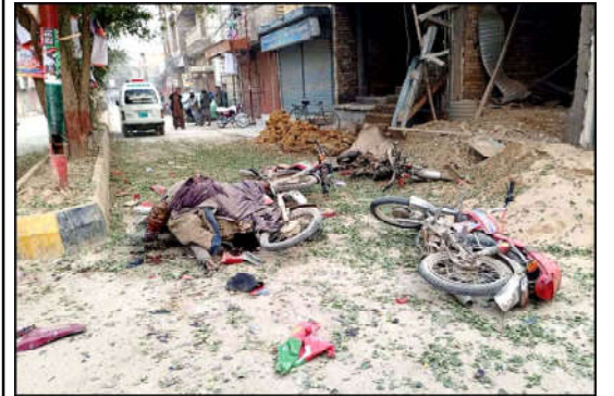
View of site after blast occurred at a rally of Tehreek-e-Insaf (PTI) at Sibi