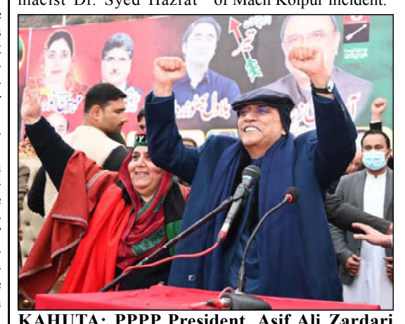
KAHUTA: PPPP President, Asif Ali Zardari addresses during public gathering meeting as a part of election campaign in connection of General Election 2024 coming ahead, in Kahuta.