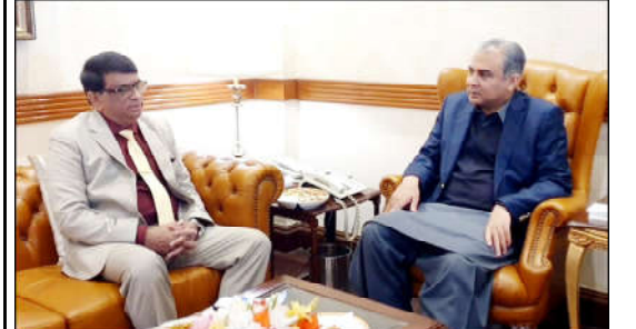
LAHORE: Provincial Election Commissioner Ejaz Anwar Chohan meeting with Caretaker Chief Minister Punjab Mohsin Naqvi.

implementation of the Election Commission's code of conduct, and measures will be taken to ensure compliance. The chief minister further stated that law enforcement, including the police and other security agencies, will play a pivotal role in upholding the rule of law during the electoral process. The Provincial Election Commissioner acknowledged the valuable cooperation of the Punjab government in this regard.