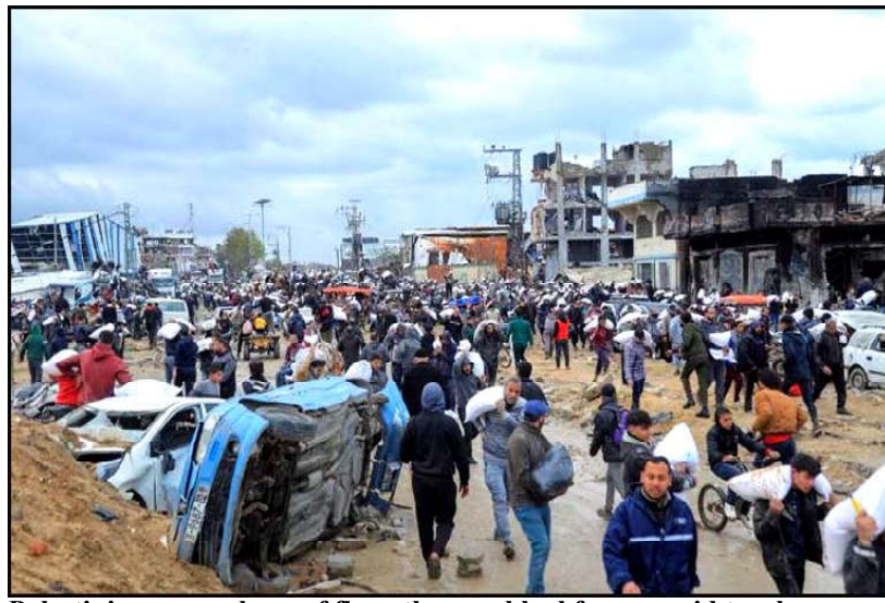
Palestinians carry bags of flour they grabbed from an aid truck near an Israeli checkpoint, as Gaza residents face crisis levels of hunger, amid the ongoing conflict between Israel and Hamas, in Gaza City.

Explaining how this decision could be implemented, Shakir said in interviews to various media outlets that "the UN Security Council could take action to enforce the decision." He acknowledged that the US veto could once again protect Israel in the Security Council but warns that the veto would further weaken the US stance on this issue.