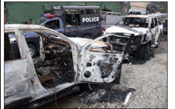
KARACHI: A view of burnt vehicles after clash between the workers of the Pakistan People's Party (PPP) and Muttahida Quami Movement-Pakistan (MQM-P) during an election campaign rally at Nazimabad area, in Provincial Capital.