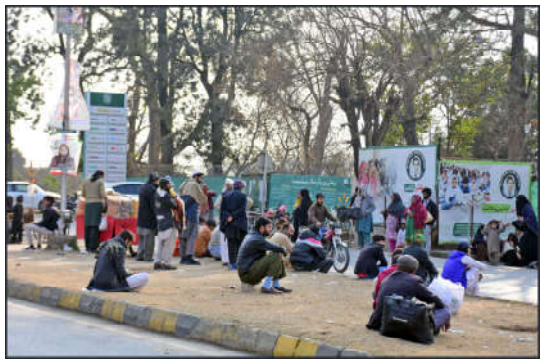
ISLAMABAD: People are waiting outside Benazir Bhutto Income Support Program (BISP) office for collecting money as waiting for their turn at sector G-7 in the Federal Capital.

Reflecting on the visit, the syndicate group members expressed gratitude to the CCP for the warm hospitality and offering invaluable perspectives on the challenges and opportunities posed by IR 5.0. They found the engagement beneficial for their research.