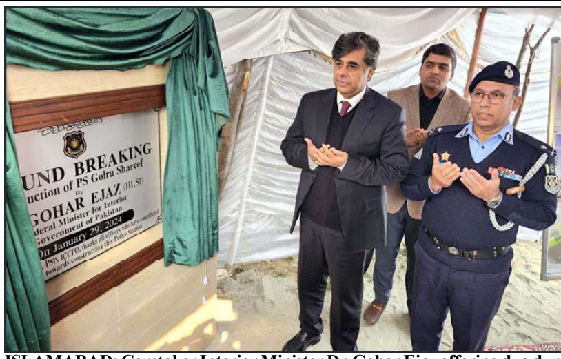
ISLAMABAD: Caretaker Interior Minister Dr. Gohar Ijaz offering dua during ground breaking ceremony of new building of Police Station Golra.

He thanked the Interior Minister for initiating the decoration and embellishment of police stations, affirming the force's commitment to ensuring safety and providing facilities to the citizens in Islamabad.