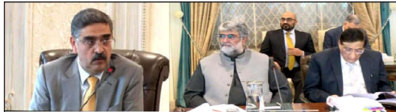
ISLAMABAD: Caretaker Balochistan Chief Minister Mir Ali Mardan Khan Domki attending National Economic Council (NEC) meeting chaired by Caretaker Prime Minister Anwaar-ul-Haq Kakar