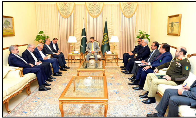
ISLAMABAD: Foreign Minister of Islamic Republic of Iran Hossein Amir-Abdollahian calls on Caretaker Prime Minister Anwaar-ul-Haq Kakar, in the Federal Capital.

He prayed to Allah Almighty to rest the departed soul in eternal peace and grant courage to the bereaved family to bear this loss with fortitude.