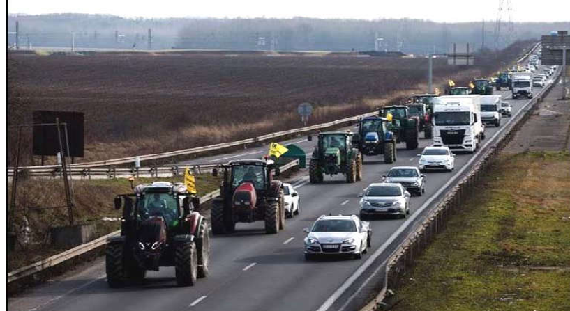
French farmers use their tractors during a go-slow operation near Roissy Charles-de-Gaulle airport as they protest over price pressures, taxes and green regulation, grievances shared by farmers across Europe, in Compans, near Paris, France.

Monitoring Desk LOS ANGELES: Nasa's rover Perseverance has gathered data confirming the existence of ancient lake sediments deposited by water that once filled a giant basin on Mars called Jerezo Crater, according to a study. The findings from ground-penetrating radar observations conducted by the robotic rover substantiate previous orbital imagery and other data leading scientists to theorize.