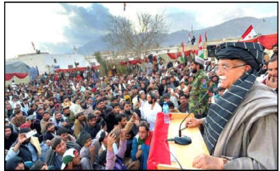
QUETTA: Chairman of PML-N Nawaz Sharif and candidate for NA 263 & 266 Mehmood Khan Achakzai addressing a public gathering in Hazarhganji