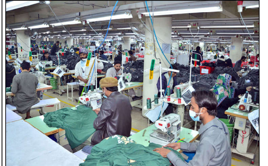
FAISALABAD: Workers busy in their work in a local Garment factory in the city.