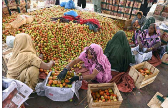
HYDERABAD: Labourer women busy in packing tomatoes in wood boxes at Subzi Mandi.