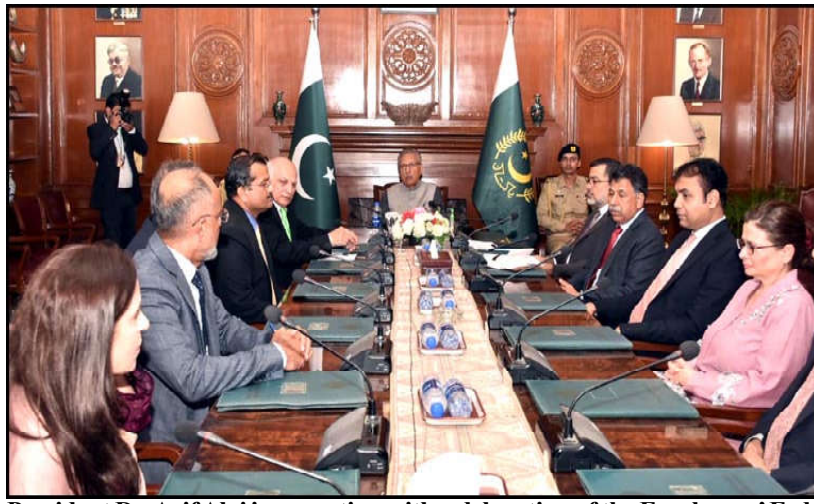
President Dr. Arif Alvi in a meeting with a delegation of the Employers' Federation of Pakistan, at Governor House, Karachi

constructed Danish Schools in South Punjab and Basic Health Units so the people can get health services in the region. On Saturday, the Pakistan Muslim League-Nawaz (PML-N) launched its much-awaited election manifesto. The manifesto was unveiled by PML-N supremo Nawaz Sharif. On the other hand, according to Election Commission of Pakistan sources, overall 90,675 polling stations have been set up across the country for the upcoming general elections, slated for Feb 8, 2024.