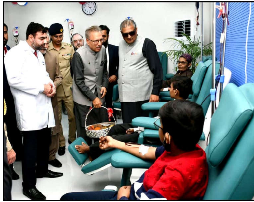
President Dr. Arif Alvi enquiring after the health of patients during his visit to the Sundas Foundation Karachi Centre, providing blood and hematological services to patients, in Karachi.

Later, unidentified armed men initiated indiscriminate firing, while some individuals also attacked vehicles with sticks. The locals said that the firing was so intense that it could be heard from a considerable distance. Police vehicles from Gulbahar Police Station reached the scene, but the firing persisted, they lamented.