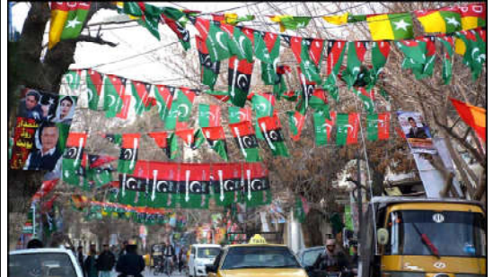
QUETTA: A view of different political party flag hanging on the road for upcoming general.

Both countries have displayed zeal and enthusiasm for benefiting from each other's expertise and experience.