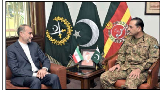
RAWALPINDI: Chief of Army Staff (COAS), General Syed Asim Munir exchanging views with Amir Abdollahian, Foreign Minister of Iran during meeting held at General Headquarters (GHQ) in Rawalpindi.