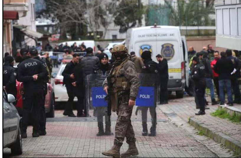
Turkish police stand guard outside the Italian Santa Maria Catholic Church after two masked gunmen were shooting during Sunday service, in Istanbul, Turkey.

At the time, the centre-left Labor government said the laws sent a clear message there was no place in Australia for those who glorify the Holocaust or terrorist acts.