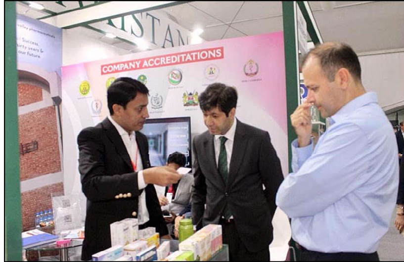
DUBAI: H.E. Mr. Hussain Muhammad, Consul General visited various stalls of Pakistani exhibitors at Pakistan Pavilion set up by Trade Development Authority of Pakistan (TDAP) at Za'abeel Hall-7 Dubai World Trade Centre on January 29, 2024. 40 exhibitors from Pakistan are participating in the 4-day lucrative Arab Health exhibition.