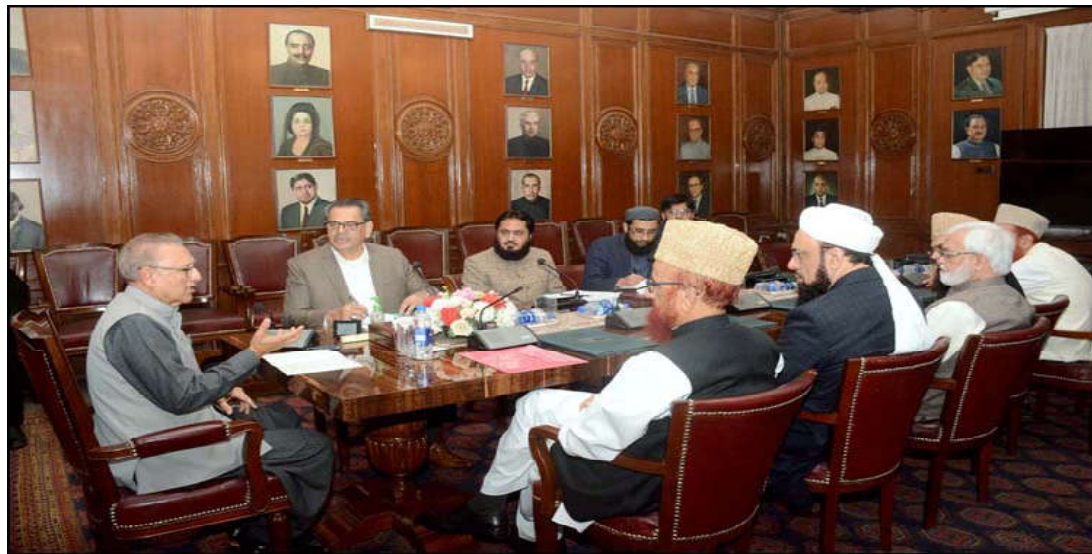
KARACHI: President Dr Arif Alvi chairing a meeting on the role of Masajid and Madaris in promoting education and creating awareness about health issues, at Governor House.