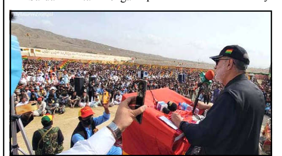
NOSHKI: President Balochistan National Party Sardar Akhtar Jan Mengal addressing a public gathering in connection with general elections