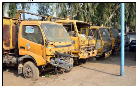
RAWALPINDI: A view of damage vehicles stand in a parking area of WASA office in the city, as needs to attention for concern authority.