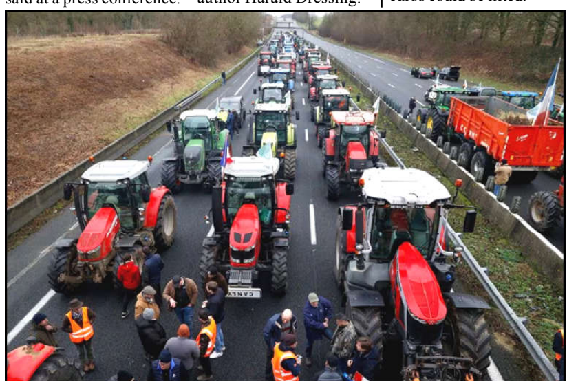
French farmers use their tractors to block the A1 highway as they protest over price pressures, taxes and green regulation, grievances shared by farmers across Europe, in Chamant, near Paris, France.

Monitoring Desk BEIJING: A Chinese defence ministry spokesperson said on Thursday that India-China border tensions were "an issue left over from history and not the whole of China-India relations".