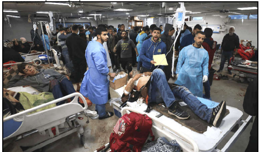
Injured people receive treatment in Gaza City's Al-Shifa hospital, following a reported Israeli strike, that according to Gaza's Health Ministry, killed at least 20 and wounded more than 150 as they waited for humanitarian aid.

Witnesses and health officials said the shooting took place at a roundabout on Gaza City's southern edge, where a large crowd had gathered for distribution of food. Footage posted online and confirmed to have been taken on the main road near the roundabout showed hundreds of people fleeing, as fire rang out in the background. Men loaded wounded Palestinians onto horse and donkey carts that took off charging down the avenue.