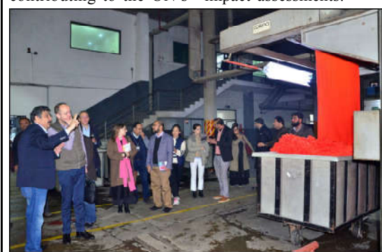
FAISALABAD: A European Union delegation is visiting in a local factory in the city.

ISLAMABAD (APP): The Pakistani Rupee on Friday gained 07 paise against the US Dollar in the interbank trading and closed at Rs279.59 against the previous day's closing of Rs279.66. However, according to the Forex Association of Pakistan (FAP), the buying and selling rates of the Dollar in the open market stood at Rs279.1 and Rs281.3 respectively. The price of the Euro decreased by Rs 2.01 to close at Rs302.46 against the last day's closing of Rs304.47, according to the State Bank of Pakistan (SBP). The Japanese Yen remained unchanged and closed at Rs1.89, whereas a decrease of Rs1.20 was witnessed in the exchange rate of the British Pound, which traded at Rs354.62 compared to the last closing of Rs355.82. The exchange rates of the Emirates Dirham and the Saudi Riyal.