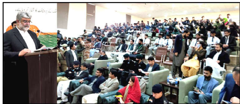
SIBI: Caretaker Chief Minister Balochistan Mir Ali Mardan Khan Domki addressing inaugural ceremony of DigiBizz Freelance Training Program