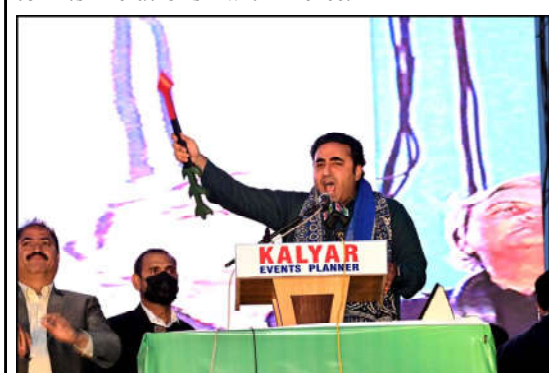
MULTAN: Peoples Party (PPP) Chairman, Bilawal Bhutto Zardari addresses to his supporters during public gathering meeting as a part of Election Campaign in connection of the General Election 2024 coming ahead, in Multan.

He said that Pakistan attached great significance to its relations with