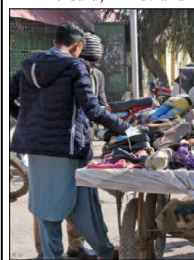
ISLAMABAD: People are buying warm shoes alongside a road at Aabpara area.

interaction between consumers and petroleum products. We urge OGRA to conduct regular inspections of petrol pumps to ensure compliance with safety protocols, including proper maintenance of equipment, adequate fire safety measures, and employee training in handling emergency situations. "Furthermore, we emphasize the importance of implementing stringent safety measures in the storage and handling of petroleum products."