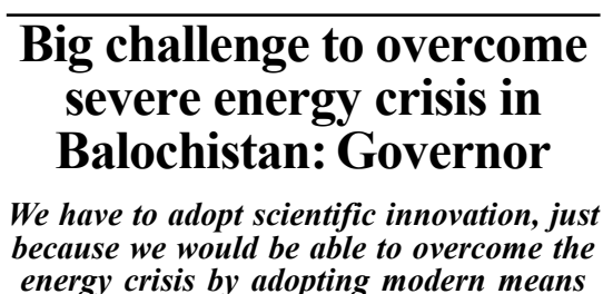
QUETTA: A MoU being signed between BUITEMS and BRSP in presence of Governor Balochistan Malik Abdul Wali Khan Kakar

Meanwhile the Chief Minister Balochistan, Mir Ali Mardan Khan Domki has inaugurated the