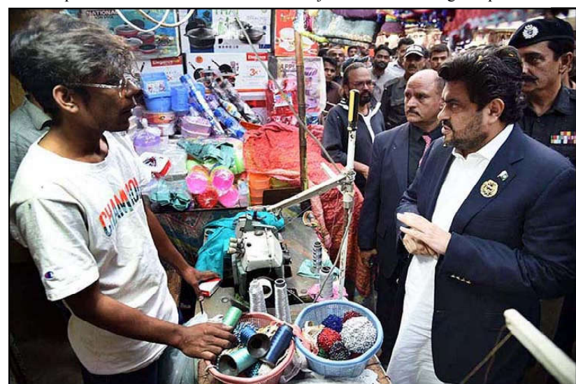
KARACHI: Governor Sindh Kamran Tessori talking with shopkeeper during his visit Shama Shopping Center and Resham Bazaar of Shah Faisal Colony.