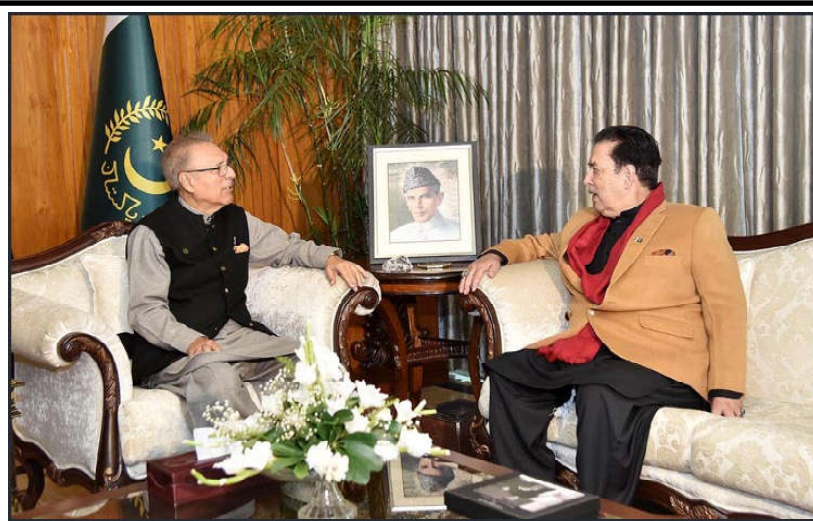
ISLAMABAD: Governor Gilgit-Baltistan, Syed Mehdi Shah, called on President Dr Arif Alvi, at Aiwan-e-Sadr.

It is mentioned that complaints against officials upto BPS-19 shall be authorized by Regional DGs, whereas approval of process on complaints against BS-20 and above officers will be authorized by Chairman NAB.