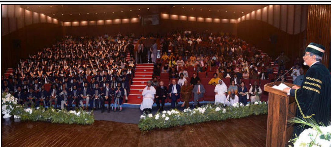
KARACHI: Caretaker Chief Minister Sindh Justice (Retd) Maqbool Baqar addressing the Arts Council Academic Convocation 2024.