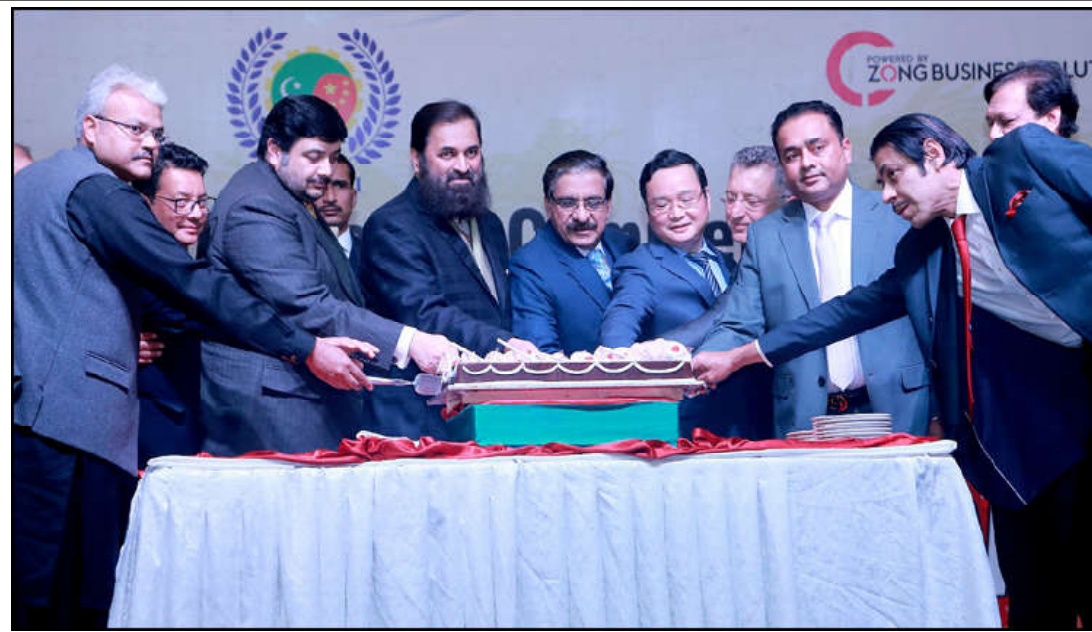
LAHORE: Governor Punjab Muhammad Baligh-ur-Rehman and others cutting cake on the eve of new Chinese year organized by Pakistan China Joint Chamber of Commerce and Industry.