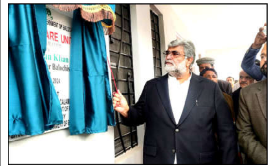
SIBI: Caretaker Chief Minister Balochistan Mir Ali Mardan Khan Domki inaugurating ICU at DHQ

ISLAMABAD (Online): District Returning officers and returning officers were assigned the powers of first class magistrate. Election Commission (EC) has issued notification regarding the powers of first class magistrates of DRO's and RO's. According to sources of EC, District returning officers and returning officers will continue to have the powers of first class magistrates until the declaration of election results. It is said in issued notification that under section 193 of election act 2017, the powers of magistrate have been given. The powers have been assigned in relation to general elections of National Assembly (NA) and provincial assemblies from Punjab, Sindh, Khyber Pakhtun Khwa (KPK) and Baluchistan. These officers will be authorized to take immediate notice of any action against the rules.