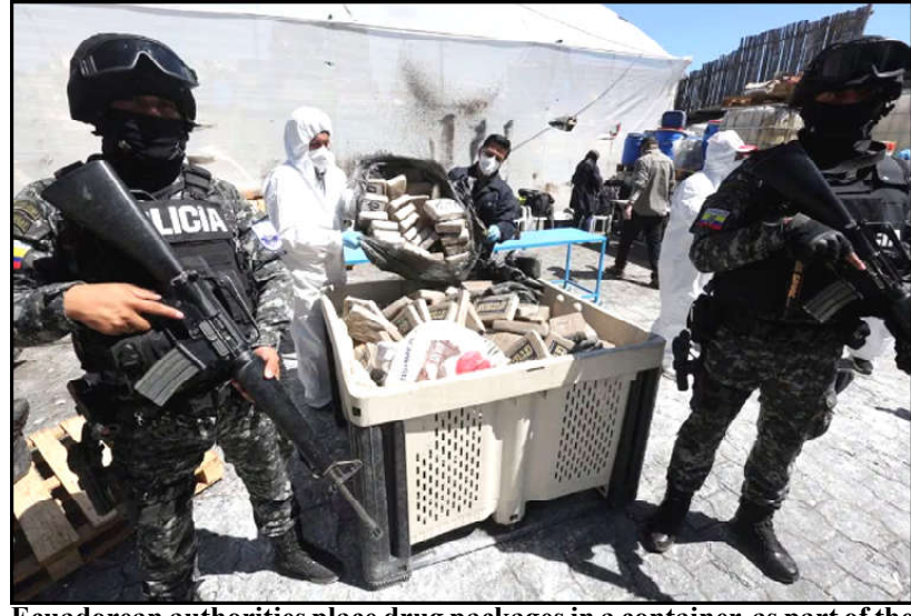
Ecuadorian authorities place drug packages in a container, as part of the more than 20 tons of seized drugs to be destroyed at an undisclosed location, in Ecuador.

The king was pictured arriving with his wife Queen Camilla at the private London Clinic in west London, where Kate, the Princess of Wales, is also having treatment after undergoing abdominal surgery last week.