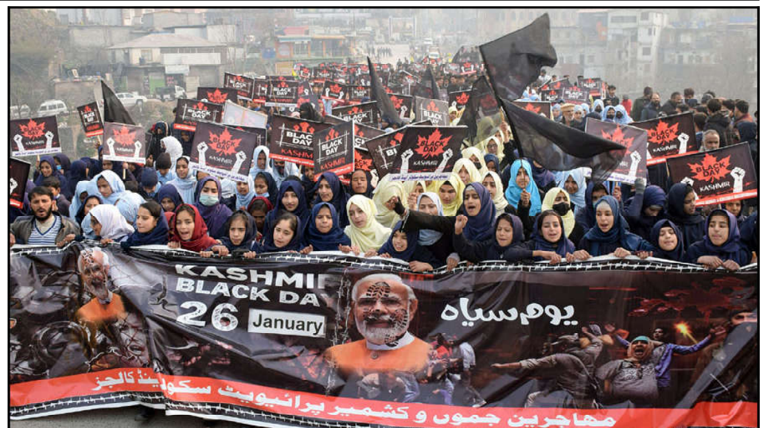
MUZAFFRABAD: Students of school and college hold placards during protest as they observe Indian Republic Day as Black Day during an anti-Indian protest in the city, to show their solidarity with people of Indian-administered Kashmir.

during the short tenure of the caretaker government, he had adopted a proactive approach to improve the educational standards and deal with the issues and 20 out of 50 schools of federal capital were selected for reforms. Those educational institutes were being transformed as model schools with provision of missing facilities and improvement of their management, he said and added that the caretaker government was also focusing on universities and boards and measures were taken to resolve their issues while chairmen of educational boards were directed to improve the system and ensure transparency in examination and assessment processes.