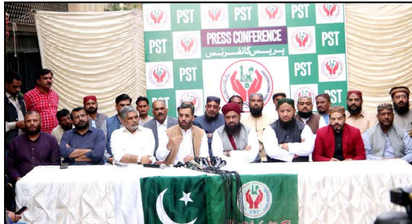
KARACHI: Muttahida Qaumi Movement (MQM-P) Senior Deputy Convener, Mustafa Kamal and Sarwat Ejaz Qadri, Chief of Sunni Tehreek are addressing a press conference, at Qadri House in Karachi.

ISLAMABAD (APP): Caretaker Interior Minister Dr Gohar Ejaz has directed to ensure providing fool-proof security to foreigners. During his visit to the National Action Plan Secretariat in Islamabad today, he directed bringing further improvement in the code of conduct of security of foreigners and its implementation. Dr Gohar Ejaz said mutual cooperation between law enforcement agencies is very important for protection of all citizens which is the prime responsibility of the state. He said all resources should be utilized to ensure law and order during the elections.