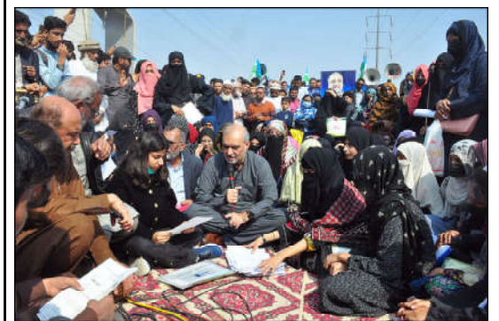
KARACHI: Leader of Jamaat-e-Islami Hafiz Naeem ur Rehman is sitting with students during sit protest (Dharna) in favor of their demands outside Board of Intermediate Education office.