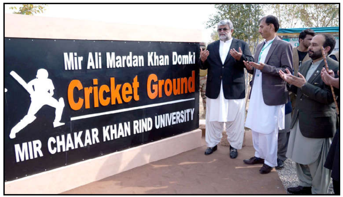
SIBI: Caretaker Chief Minister Balochistan Mir Ali Mardan Khan Domki inaugurating cricket ground at Mir Chakar Khan Rind University

ISLAMABAD (Online): Petroleum products prices are likely to be increased in Pakistan in next week owing to surge in prices in international market. As per sources of ministry of petroleum prices of oil have increased by 4.37 dollar per barrel in international markets during the last 12 days. The oil price has been enhanced from 77.78 per dollar to 82.15 dollar per barrel in international markets. The price of petrol is likely to scale up Rs 7 per liter and diesel Rs 5 per liter from February 01.