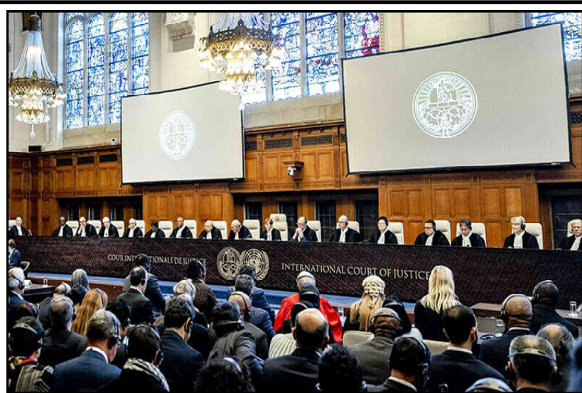
Judges at the International Court of Justice (ICJ) rule on emergency measures against Israel following accusations by South Africa that the Israeli military operation in Gaza is a state-led genocide, in The Hague, Netherlands.