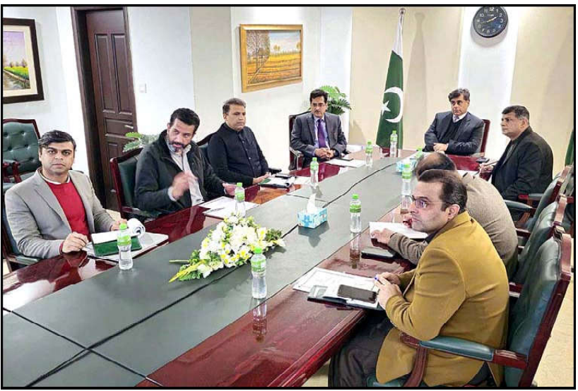
ISLAMABAD: Caretaker Interior Minister Dr. Gohar Ejaz chairing a briefing at National Action Plan Secretariat.