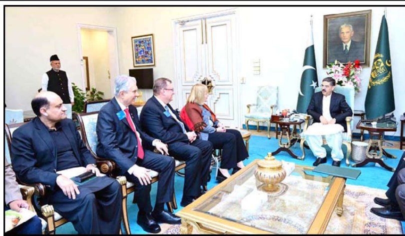
ISLAMABAD: A delegation of Rotary International calls on Caretaker Prime Minister Anwaar-ul-Haq Kakar.

Elahi had filed a petition in the Supreme Court to seek permission to contest the general election.