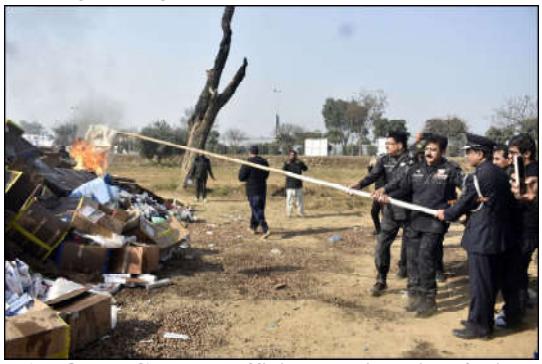
LAHORE: Customs official burning pile of seized drugs previously smuggled into the country, on the outskirts of Provincial Capital, on the eve of International Customs Day.