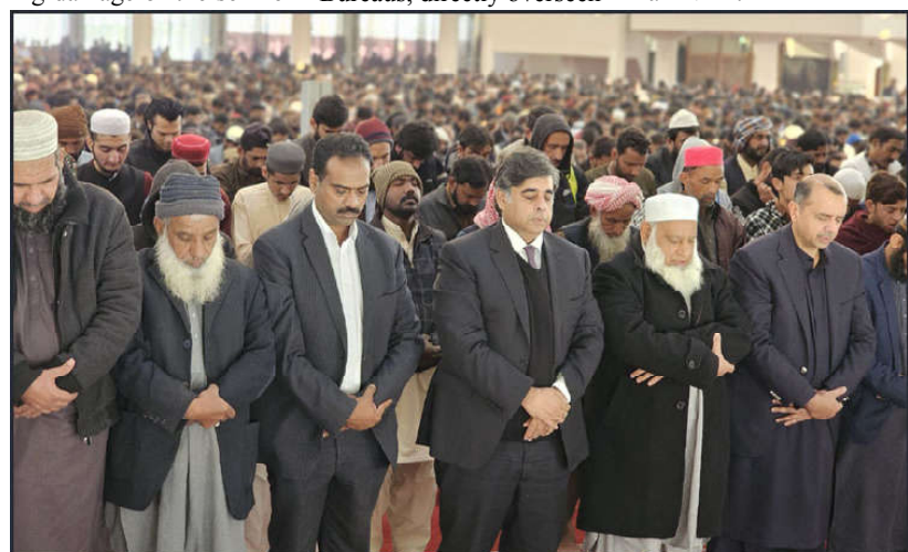
Federal Minister for Interior Dr Gohar Ejaz offering Friday prayer at Faisal Mosque in Islamabad.

She also predicted that India would eventually disintegrate due to divisive RSS policies.