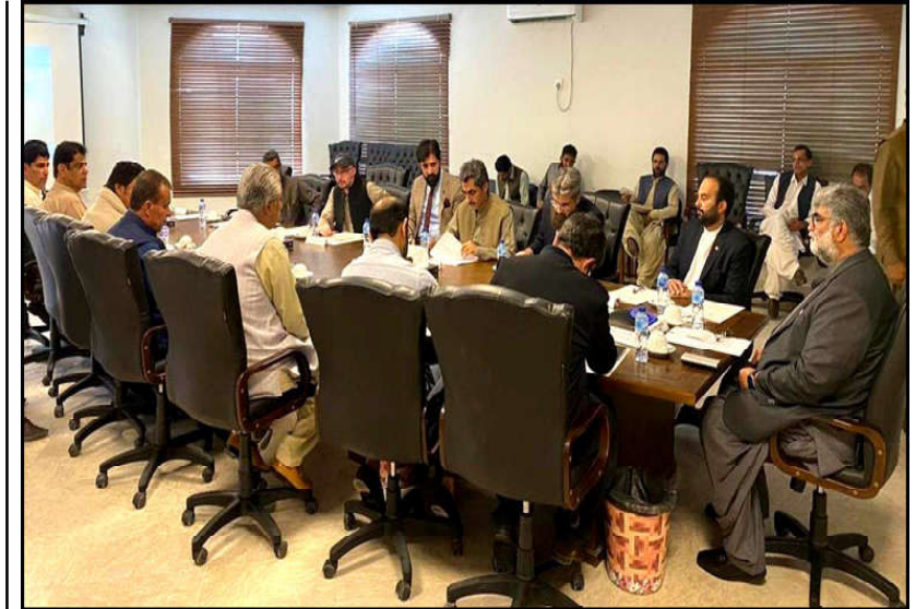
GWADAR: Caretaker Chief Minister Balochistan Mir Ali Mardan Khan Domki presiding over a meeting regarding provision of water to Gwadar and surroundings

only giving directives along with its funding, but were also controlling the drive. Matter of fact also remains that India assassinated the innocent people in terrorism acts in different countries including Pakistan, but no concrete evidences were provided about their evidences.