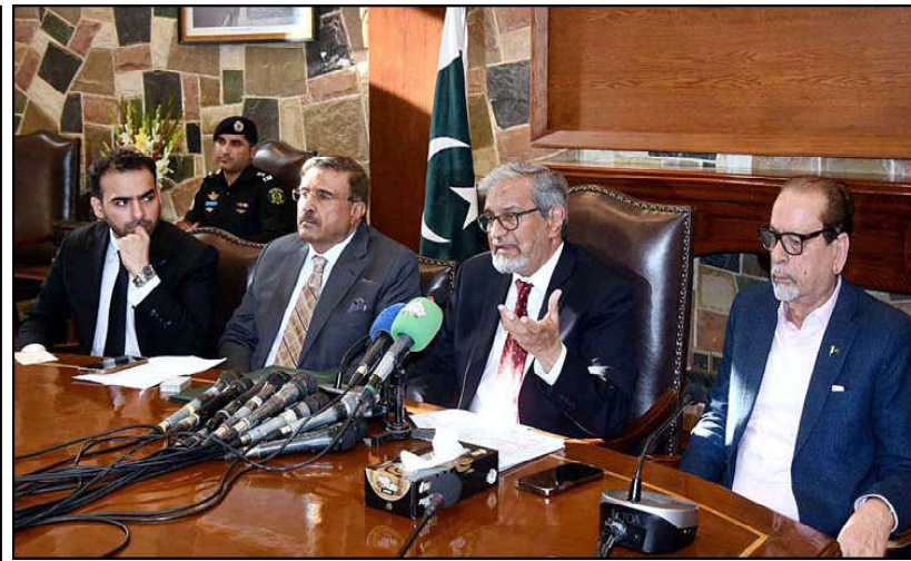
KARACHI: Caretaker Sindh Chief Minister Justice (Retd) Maqbool Baqar addresses a press conference at CM House.