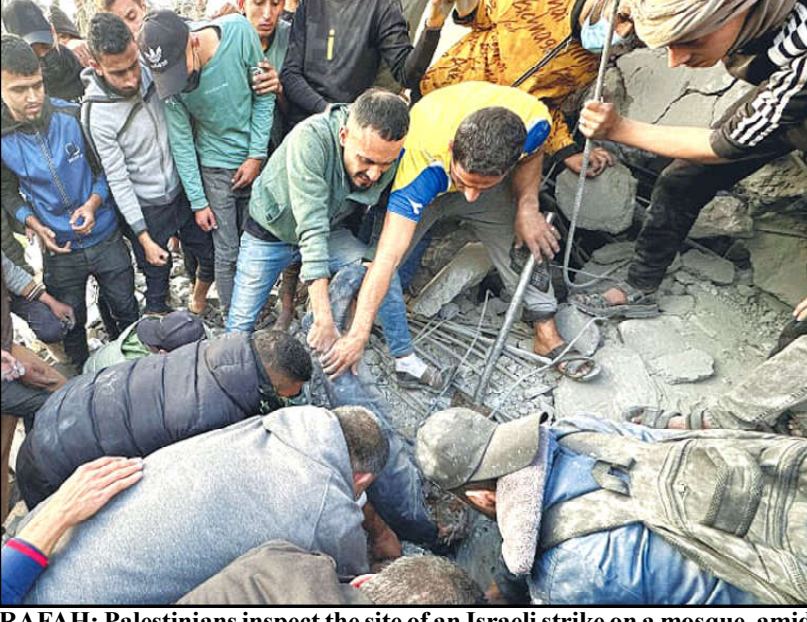
RAFAH: Palestinians inspect the site of an Israeli strike on a mosque, amid the ongoing aggression in the southern Gaza Strip

The area, modelled on Paris in the 1860s, is filled with elegant but crumbling buildings constructed over the subsequent seven decades. Many were nationalised in the 1950s and 1960s and left in disrepair.