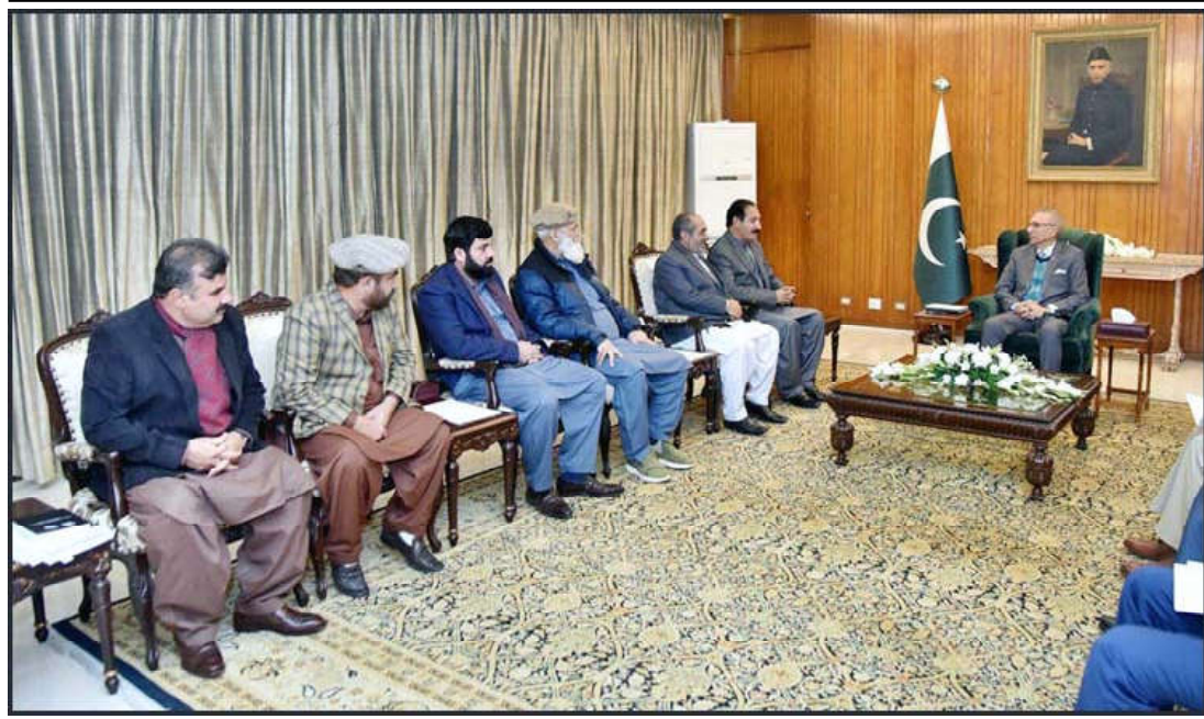
ISLAMABAD: A delegation of elected members of Gilgit-Baltistan Council called on President Dr. Arif Alvi at Aiwan-e-Sadr.