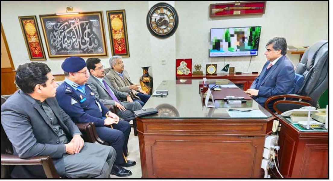
ISLAMABAD: Caretaker Interior Minister Dr. Gohar Ejaz in a meeting with Secretary Interior, Chief Commissioner and IG Islamabad.

upon PTI to hold its intra party elections since 24 May 2021; at that time the PTI was in the Federal Government and in some provinces. Therefore, it cannot be stated that ECP was victimizing PTI. Nonetheless, we wanted to satisfy ourselves that the ECP had not acted mala fide or for ulterior reasons or that PTI was discriminated against. "It transpired that ECP had passed orders against thirteen other registered political parties which were far more severe than the order passed against PTI. "ECP wanted to ensure that PTI holds intra party elections. The mere production of a certificate stating that such elections were held would not suffice to establish that intra party elections had been held when a challenge was thrown to such an assertion. Nor, in our opinion, should ECP concern itself with minor irregularities in the