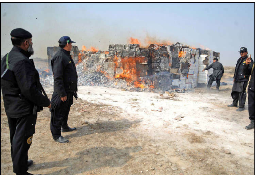
HYDERABAD: Officials of Inland Revenue burn a large quantity of Cigarettes during the destruction ceremony of non custom paid items, in the city.

Referring to the population from 14 - 17 years, it said that 21.6 percent were working children and 15.5 percent were in child labour or hazardous work respectively. The report revealed that the major four industries for child labour included agriculture,