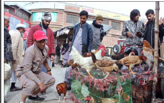
QUETTA: A vendor selling country-hens as demand increased during winter season for preparing 'yakhni' in Provincial Capital.