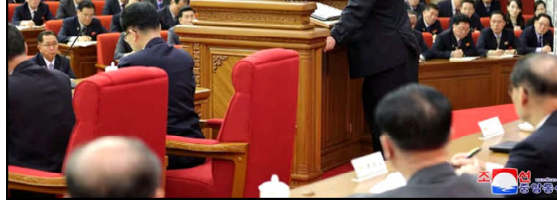
North Korean leader Kim Jong Un attends the 19th expanded political bureau meeting of the 8th Central Committee of the Workers' Party of Korea in Pyongyang, North Korea.

The drills will rehearse NATO's execution of its regional plans, the first defence plans the alliance has drawn up in decades, detailing how it would respond to a Russian attack. NATO did not mention Russia by name in its announcement. But its top strategic document identifies Russia as the most significant and direct threat to NATO members' security. The exercise comes at an important moment after Russia's invasion of Ukraine started the deadliest war on European soil in more than 70 years.