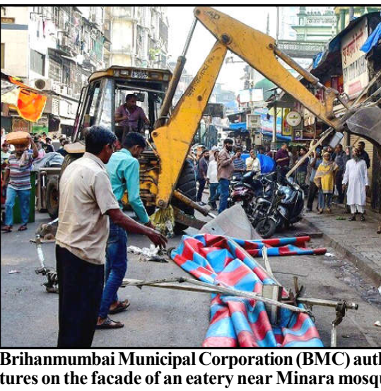
Brihanmumbai Municipal Corporation (BMC) authorities demolishing structures on the facade of an eatery near Minara mosque in Mumbai.

No serious injuries were reported in the melee but by Tuesday, authorities had called in excavators to knock down more than a dozen shopfronts belonging to Muslims in that locality, according to local media reports.