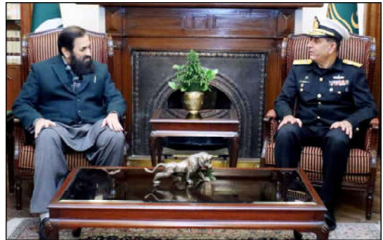
LAHORE: Commander Central Punjab, Commandant Naval War College, Rear Admiral Azhar Mahmood (HIM), called on Governor Punjab Muhammad Balighur Rehman at Governor House

On this occasion, the caretaker minister directed the concerned officials for taking all possible steps for the resolution of their problems.