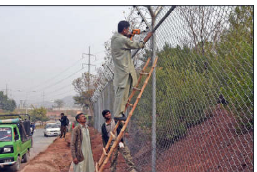
ISLAMABAD: Workers are busy in installing electric fence around diplomatic enclave in Federal Capital.

ISLAMABAD (APP): The National Disaster Management Authority (NDMA)'s Gender and Child Cell has joined Steering Committee of Inter-Agency Working (IAWG). The NDMA in a post on its official handle on X shared the update on Thursday that the Authority's Cell had joined the international platform on January 24. The IAWG is a global coalition of organizations that work together to promote Sexual and Reproductive Health and Rights in Humanitarian Settings. "This is a great opportunity for NDMA's Gender & Child Cell to collaborate with other members of IAWG share best practices & contribute to global efforts to improve health issues. We look forward to working with our partners & stakeholders to achieve our common goals."