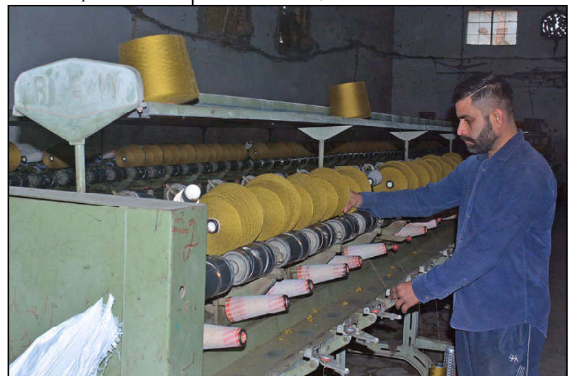
FAISALABAD: A worker busy in his work at a local Polyester factory in the city.

people-to-people contacts were instrumental in fostering understanding and good-will between the nations. He said that the cultural agreement, signed in 1957 between Pakistan and Japan, has been the bedrock of bilateral relations as it laid the foundation for deepening and broadening the bilateral relations. "Programs we have undertaken jointly include performances, exhibitions, student exchange, scholarships and joint research initiatives between the two nations," he said adding that such activities played an important role in fostering cultural learning, cross-cultural relations.