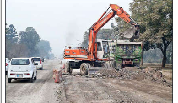
ISLAMABAD: Machinery being used for extension work of Park Road during development work in the Federal Capital.