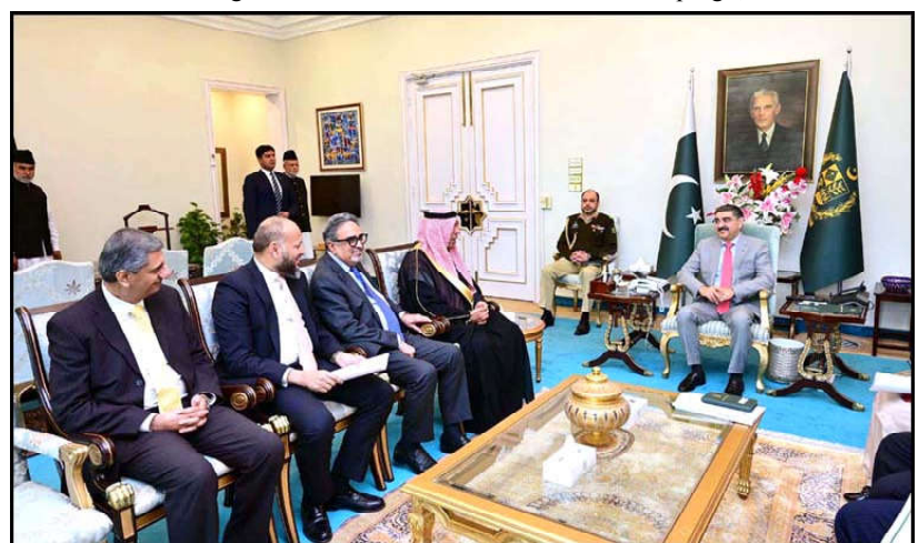
ISLAMABAD: Head of Al-Jomaih Group alongwith a delegation called on Caretaker Prime Minister Anwaar-ul-Haq Kakar.