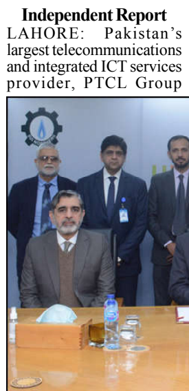
(PTCL & Ufone 4G), and largest integrated gas company of Pakistan, SNGPL have renewed their partnership for the continued provision of the state-of-the-art cellular services to SNGPL under PTCL Group Business

Independent Report LAHORE: Pakistan's largest telecommunications and integrated ICT services provider, PTCL Group