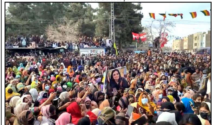
QUETTA: Members of Baloch Solidarity Committee are gathered to welcome Dr. Mahrang Baloch after reaching Quetta from Islamabad, in Quetta.