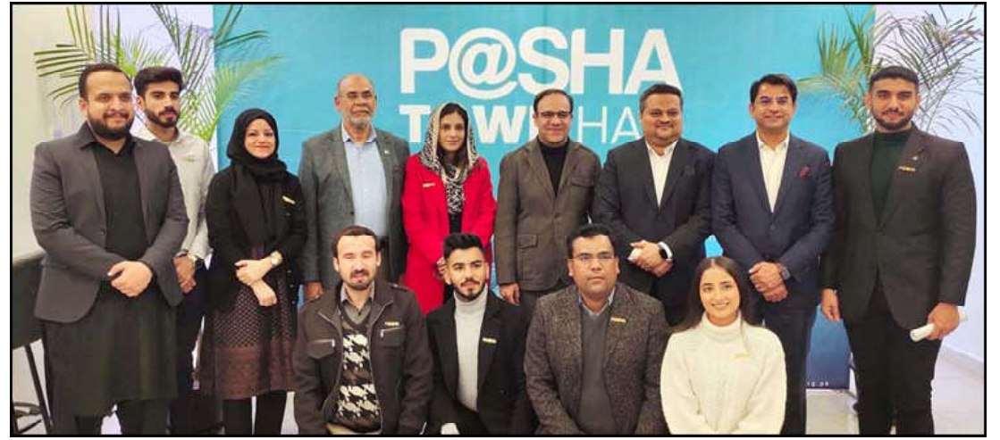
ISLAMABAD: Caretaker Federal Minister for IT and Telecommunication Dr. Umar Saif in a group photo after Town Hall meeting.

exports of IT and IT-enabled services, the State Bank of Pakistan (SBP) has increased the permissible retention limit from 35% to 50% of their export proceeds in the Exporters' Specialized Foreign Currency Accounts (ESFCAs). "We worked with the SIFC and the State Bank to make a significant policy intervention, allowing IT companies to keep 50% of their export revenue in dollars.