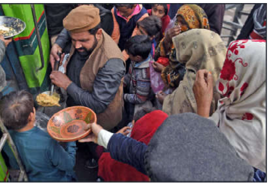
ISLAMABAD: A man is distributing free among the devotees at Shrine of Hazrat Bari Imam in the Federal Capital.