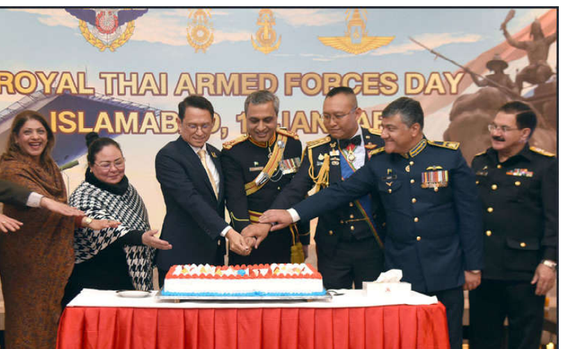
ISLAMABAD: Inspector General Communication and Information Technology Lt Gen Muhammad Aqeel, Defence and Military Attache of Royal Thai Colonel Thanai Permpul, and others cutting the cake during Armed Forces Day of Royal Thai, at a local hotel in the Federal Capital.

transferring BISP cash," he added. Replying a question, he said, "BISP Union council surveys are also being conducted at every district level," he said. "This innovative approach will stand as a testament to the program's commitment to leaving no deserving family behind." Replying a question, he mentioned that differently able persons and transgender persons were also included in this programme after the approval of a policy by the BISP Board. "The main objective of survey system is to register more eligible families and conduct future surveys in country," he added. To another question, he said, "We are also streamlining our banking system in which more six to seven banks would part of this payment system." "The government has also announced a saving scheme (Bachat Scheme) under the BISP for daily wagers and other deserving people." "A person who wants to apply for the Bachat scheme program must first complete the NSER survey in the Benazir Income Support Program and then apply for the programme," he added.