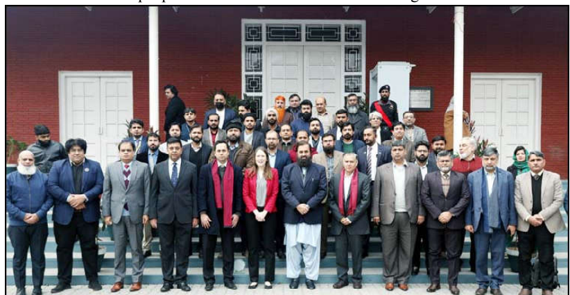
LAHORE: Governor Punjab Muhammad Balighur Rehman/Chancellor in a group photo with participants during the opening ceremony of 1 st Automotive Engineering Conference at University of Engineering and Technology.

The Sindh Cabinet approved to inclusion of its legal framework into Rules of Business as e-Service Sindh and e-Pay Sindh by amendment in Secretariat Instructions 2014 last Monday. Secondly, there would be e-registration for Registered Sale Deeds, a service that would allow citizens to register their sale deeds through online applications, payments and appointments for biometric verification and registration before the Sub-Registrars.