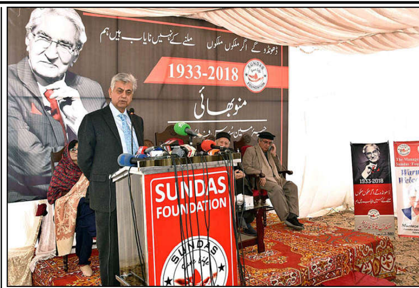
LAHORE: Murtaza Solangi, Caretaker Federal Minister for Information & Broadcasting addressing on the Death Anniversary of Legend Munnoo Bhai at Sundas foundation at Shadman.

Responding to a question, Abid Sher Ali said that the PML-N did not victimise anyone over political differences; however, those elements, who humiliated the monuments of national heroes and vandalized the sensitive military installations on May 9, did not deserve any concession. Everything is going well other than the punishment to those people who were involved in May 9 mayhem, he added.