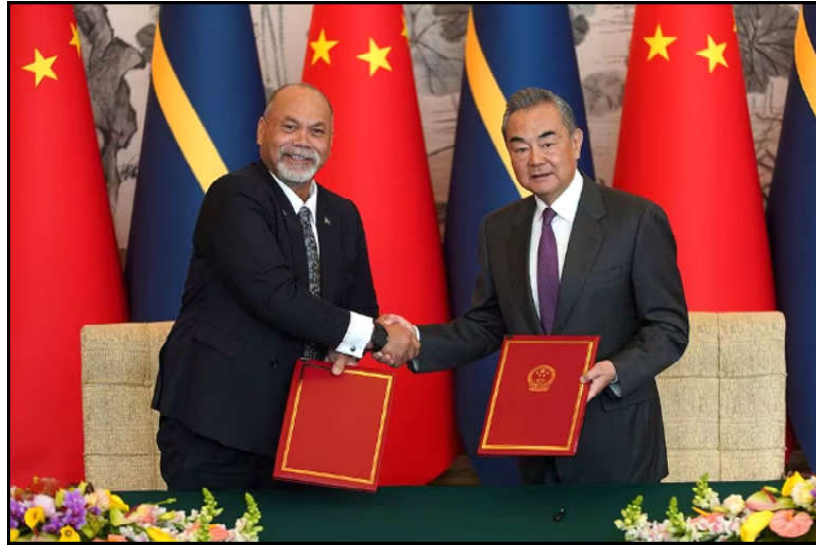
Chinese Foreign Minister Wang Yi and Minister of Foreign Affairs and Trade of Nauru Lionel Aingimea shake hands after signing a Joint Communiqué on the Resumption of Diplomatic Relations between China and Nauru, at Diaoyutai State Guesthouse, in Beijing, China.

viser, told Reuters: "Comments will come a little later. Time is needed to clarify all the data." Video posted on the Telegram messaging app by Baza, a channel linked to Russian security services, and verified by Reuters, showed a large aircraft falling towards the ground near the village of Yablonoovo in the Belgorod region and exploding in a vast fireball. Ukraine's GUR military intelligence spokesperson Andriy Yusov told the Radio Svoboda outlet that a prisoner exchange had been planned for Wednesday, adding: "It's not taking place at the moment."