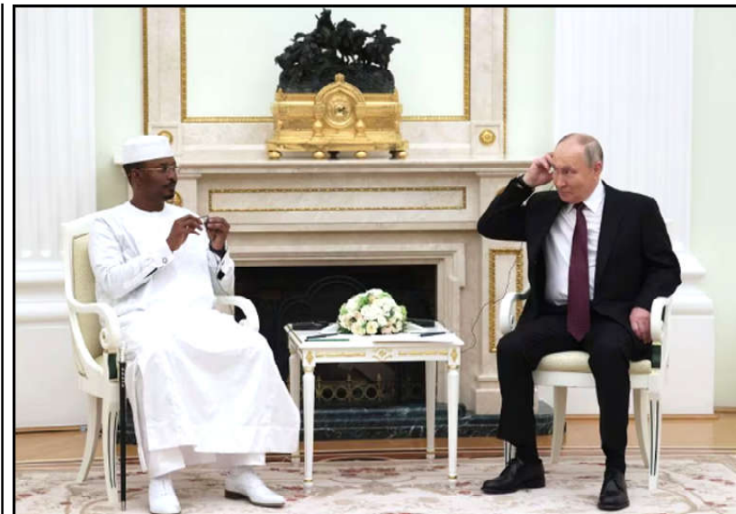
Russia's President Vladimir Putin and Chad's interim President Mahamat Idriss Deby attend a meeting at the Kremlin in Moscow, Russia.