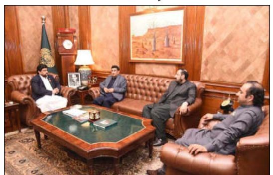
KARACHI: Governor Sindh Kamran Khan Tessori meeting a delegation of Ministers from Gilgit-Baltistan at the Governor House.

Even in the online portals of different universities of KP, the offer of two per cent quota for minorities is missing, they added.