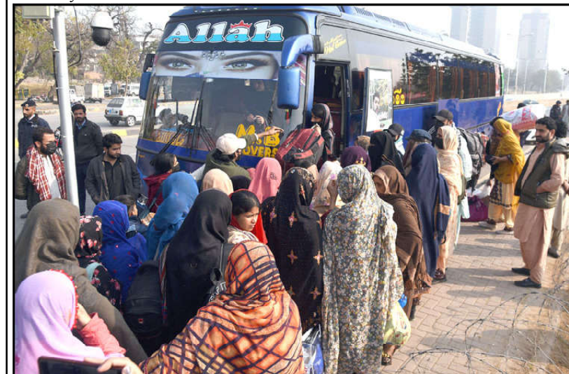
ISLAMABAD: Relatives of Baluchistan missing persons stands in a queue waiting for boarding in a bus after the finish sitting protest (Dharna) in front of National Press Club in Federal Capital.

Sarfraz Bugti had resigned from the portfolio for taking part in the general elections of 2024.