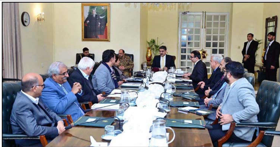
ISLAMABAD: Caretaker Prime Minister Anwaar-ul-Haq Kakar chairs a review meeting on reduction of the energy sector's circular debt.

increase in temperatures by 1.3 to 4.9 percent by 2090; fourth, the lack of innovation and diversity in the structure of the economy; and fifth, the failure to integrate Pakistan's economy with the rest of the world. Dr. Shamshad further stressed five critical areas of reforms essential to reducing Pakistan's vulnerabilities and fostering sustainable growth that included.