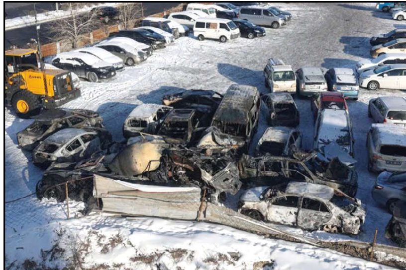
Burnt vehicles stand near the site where a truck carrying liquefied natural gas exploded, in Ulaanbaatar, Mongolia.