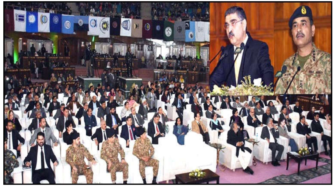
ISLAMABAD: Caretaker Prime Minister Anwaar-ul-Haq Kakar and Chief of the Army Staff General Syed Asim Munir addressing the participants of Pakistan National Youth Conference.

sage of hope, the COAS asked the youth to shun dependency. He referred to the historic role played by the youth in creation and development of Pakistan and exhorted them to partake in building the nation through discipline, honest toil and a genuine quest for knowledge. He highlighted the power potential of Pakistan, the demographic dividend, immense mineral wealth, a creative corpus of IT literate workforce, and great prospects in agriculture.