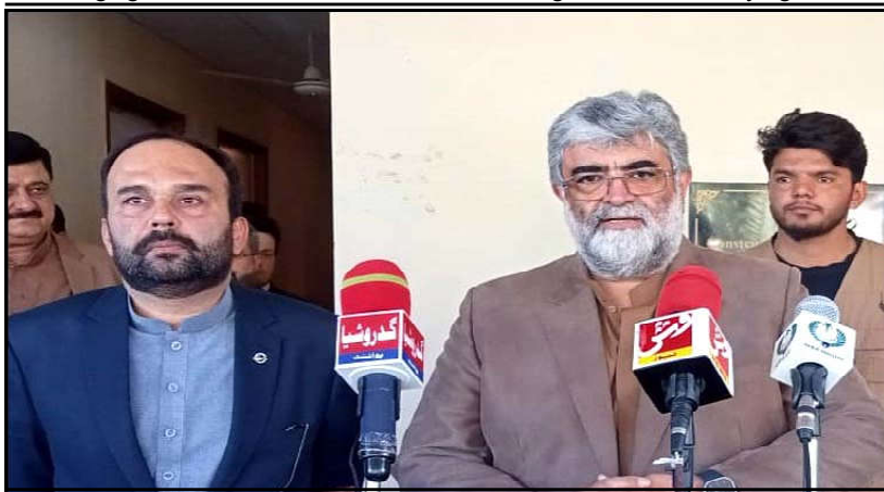
TURBAT: Caretaker Chief Minister Balochistan Mir Ali Mardan Khan Domki talking with mediemen regarding preparation of general elections