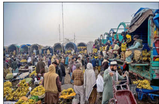
ISLAMABAD: Vendors displaying bananas for auction at Fruit and Vegetable market Pirwahai in Federal Capital.