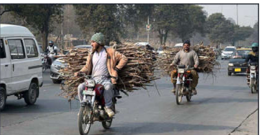
ISLAMABAD: Two motorcyclists on the way at Islamabad Expressway loaded with dry branches of tree for domestic use in Federal Capital.

area. The owners were summoned and presented before the court of Senior Special Magistrate CDA. The Senior Special Magistrate ordered that the factories of the accused be sealed immediately and sentenced the accused to imprisonment and fine and remanded in custody. According to the details, Chief Commissioner Islamabad and Chairman CDA issued strict instructions to the Enforcement, Environment and Sanitation Wing a few days ago.