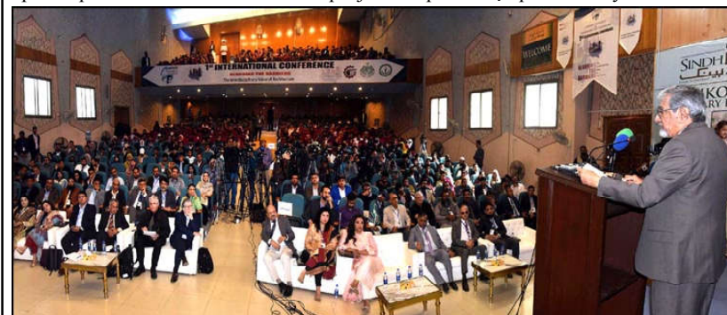
KARACHI: Caretaker Sindh Chief Minister Justice (Retd) Maqbool Baqar addressing inaugural session of 2-day International Conference at Dawood University.

He expressed these views while addressing the pre-dengue season refresher training session of the field staff of the Metropolitan Corporation Rawalpindi area. The CEO said that the purpose of conducting pre-dengue season refresher training was to prepare oneself for anti-dengue measures. He added that refresher training sessions will help in making the anti-dengue campaign operationally successful.