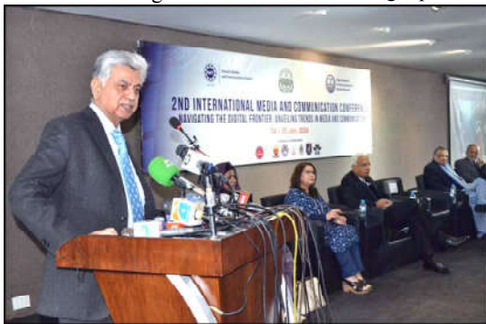
LAHORE: Caretaker Federal Minister for Information and Broadcasting, Murtaza Solangi addressing the Second International Media and Communication Conference at University of Management and Technology.

ained. The minister said the challenges of the digital age were also great as artificial intelligence, deep fake, voice cloning and misinformation factories have made it difficult to sift fact from fiction. He said that besides the benefits of modern technology in media, there were many risks also involved. He said that many tasks are being done by using artificial intelligence and voice cloning. The fundamental principle of journalism was the gatekeeper system to verify the facts but the new media had ignored "the gatekeeper". In the era of artificial intelligence, deep fake, cyber cloning, he said it had become difficult to bring the truth to people, Murtaza Solangi opined.