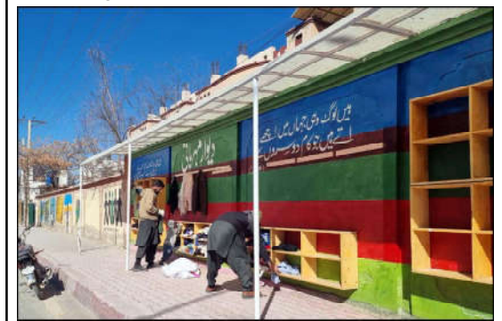
QUETTA: Needy people are taking warm clothes from Wall of Kindness (Divar-e-Meharbari), near Commissioner office in Quetta.

He said that there is need of skilled human resource in different countries of the world.