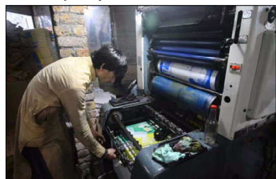
PESHAWAR: Worker busy in printing different political parties posters at his workplace in Mohallah Jangi in connection with upcoming General Elections-2024.

In terms of quantity, fish exports increased by 11.17 percent in December compared to the exports of 18,064 metric tonnes in November. The overall food group exports from Pakistan increased by 49.84 percent during the first six months.