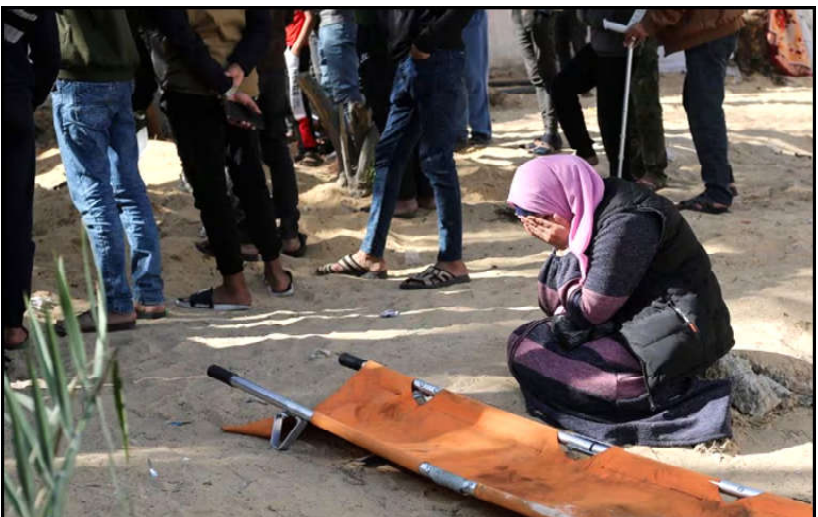
A woman reacts while people bury bodies of Palestinians killed in an Israeli strike, at the Nasser hospital premises as Palestinians cannot reach the cemetery due to the Israeli ground operation, in Khan Yunis in the southern Gaza Strip.

rial capacities, excellence in the digital domain, as well as excellence in beneficiary satisfaction with the provided healthcare services and interaction with various stakeholders. The forum includes an accompanying exhibition showcasing success stories resulting from the implementation of healthcare model initiatives and pathways in various health clusters across the Kingdom. Specialized teams will present these stories, demonstrating their practical application in the field. This will be the third edition of the forum, coinciding with the completion of launching 20 health clusters in the Kingdom. The forum aims to facilitate the exchange of experiences and expertise in common areas, advancing healthcare services in alignment with the goals of the Health Sector Transformation Program and the Saudi Vision 2030.