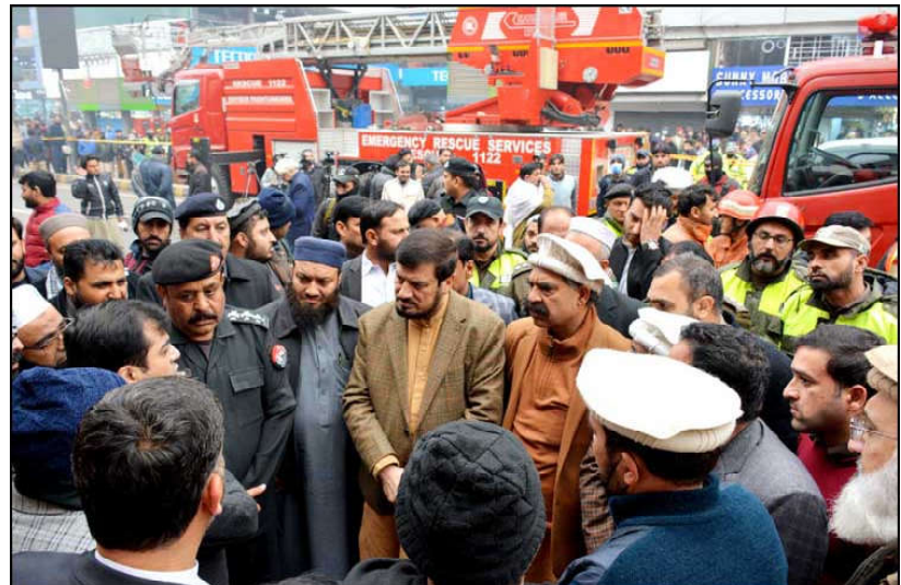
PESHAWAR: Khyber Pakhtunkhwa Hajji Ghulam Ali talking to traders and shopkeepers those who are fire affected during his visit to Saddar Bazaar.

The police recovered a 9mm pistol with 12 bullets from the crime scene, while an investigation is underway to apprehend the perpetrators and determine the motive behind this act of violence.