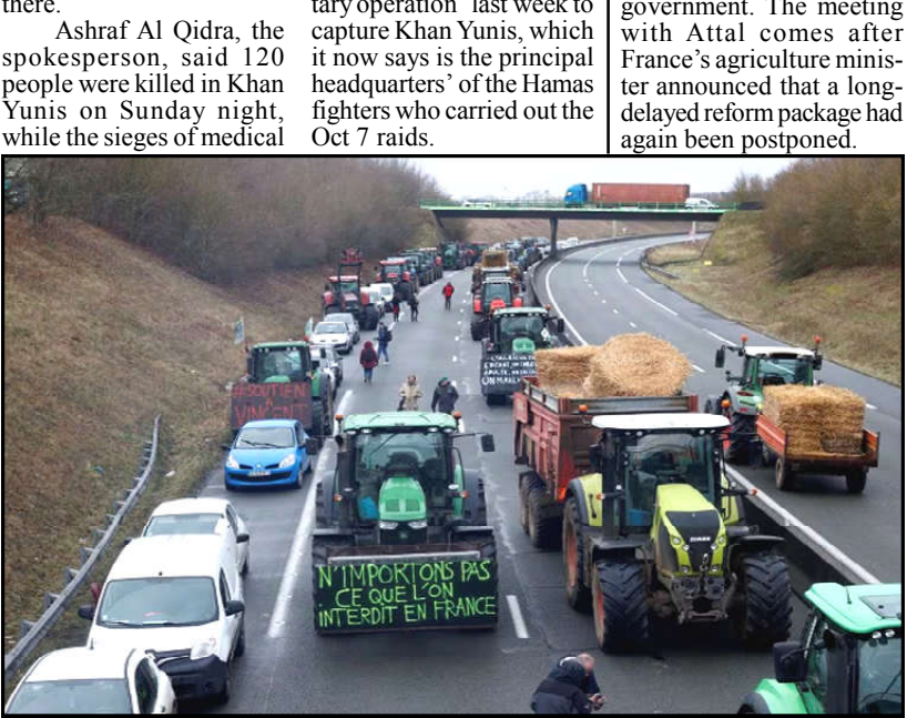
French farmers block the A16 highway with their tractors to protest over price pressures, taxes and green regulation, grievances that are shared by farmers across Europe, near Beauvais, France. The slogan reads "Let's not import what is prohibited in France".

facilities meant many of the dead and wounded were beyond the reach of rescuers. "The Israeli occupation is preventing ambulances from moving to recover bodies of martyrs and the wounded from western Khan Yunis," he said. Residents said bombardment from air, land and sea was the most intense in the southern sector of Gaza Strip since October, as Israeli tanks surged across Khan Yunis towards the Mediterranean coast. Video filmed from afar showed scattered civilians wandering a ghost city, crowded with tents, as gunfire rattled and columns of smoke rose into the sky. Israel launched a military operation last week to capture Khan Yunis, which it now says is the principal headquarters of the Hamas fighters who carried out the Oct 7 raids.