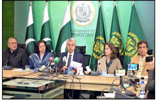
ISLAMABAD: Caretaker Federal Minister for Information and Broadcasting Murtaza Solangi addressing a press conference at PTV Headquarters.