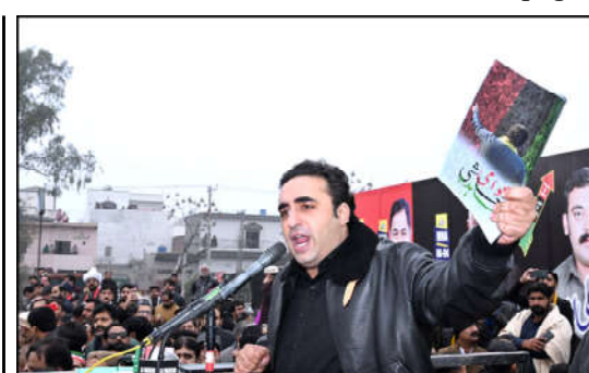
CHINIOT: Chairman PPP Bilawal Bhutto Zardari addressing a public gathering at Hockey Stadium.