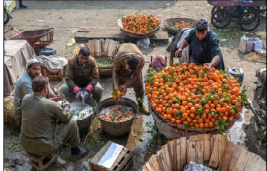
ISLAMABAD: Vendors busy in washing oranges at Pir Wadhai.

Independent Report ISLAMABAD: The first-ever two-day 'Sargodha Citrus Fest' kicked off at COMSTECH on Tuesday displaying around 45 varieties of citrus fruit and its products attracting a large number of visitors. The fest is being organized by the University of Sargodha and COMSTECH jointly where the visitors enjoy the products, especially citrus fruit-made cakes, juices, desserts, candies and green tea besides a variety of citrus fruit. The varieties of citrus fruit including Rangpur Lime, Carrizo Citrange, Gada Dahi, Rangpur, Gilgil, Mitha, Pishawari Mittha, Kinnow, Seedless Lemon, Jati Khati, Bara Masii, Ornad Blood, Mosambi, Murcott and many others were exhibited through several stalls. The citrus fest is set to captivate visitors especially fruit enthusiasts of all ages on Wednesday too offering citrus-infused culinary delights and