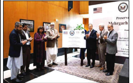
KARACHI: Chief Minister of Balochistan Ali Mardan Khan Domki and Ambassador of United States to Pakistan Donald Blome launching the Ambassadors Fund for Cultural Preservation (AFCP) first-ever project in Balochistan