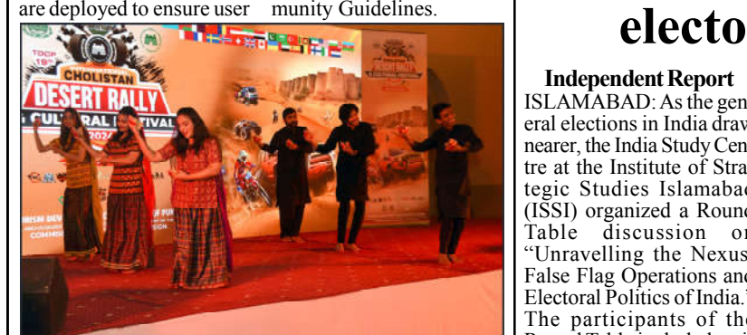
ISLAMABAD: Artists performing traditional dance during TDCP 19th International Cholistan Desert Rally and Culture Festival, at a local hotel in the Federal Capital.

The participants of the Round Table included eminent former diplomats, defence practitioners, think-tank representatives, and members of the media and academic community. The event aimed at assessing potential implications of such incidents on regional stability as well as underscoring the imperative of responsible actions in the South Asian geopolitical landscape. The deliberations delved into the possibilities of another false flag operation in the run-up to Indian elections, the historical precedents, the modus operandi in previous instances, and the effect of such occurrences on public perceptions relating to issues of peace and security, bilateral relations, and national security. Experts analysed the events surrounding the Pulwama incident, Pakistan's swift response after Balakot strike, and the country's simultaneous engagement in the strategic, diplomatic and information arenas. The participants highlighted both Pakistan's firm resolve as well as measured, timely and effective response, consistent with its commitment to ensuring regional stability.