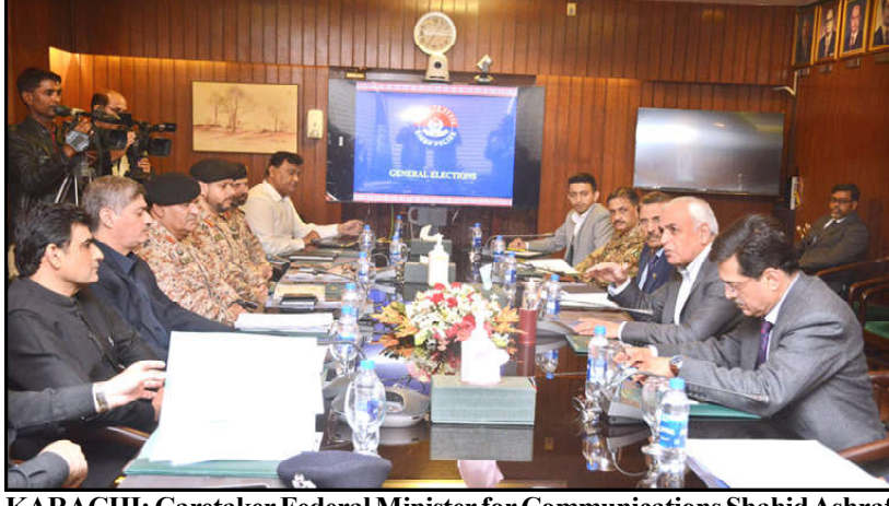
KARACHI: Caretaker Federal Minister for Communications Shahid Ashraf Tarar chairs a meeting of Election Committee to review security arrangements for upcoming General Elections 2024 at Sindh Secretariat.

Zampa, Mohammed Siraj, Kuldeep Yadav, Mohammed Shami. ICC also announced the Men's T20I and Women's ODI and T20I Team of the Year 2023. ICC Men's T20I Team of the Year: Yashasvi Jaiswal, Phil Salt, Nicholas Pooran, Suryakumar Yadav (captain), Mark Chapman, Sikandar Raza, Alpesh Ramjani, Mark Adair, Ravi Bishnoi, Richard Ngarava, Arshdeep Singh. ICC Women's ODI Team of the Year: Phoebe Litchfield, Chamari Athapaththu ©, Ellyse Perry, Amelia Kerr, Beth Mooney (wk), Nat Sciver-Brunt, Ash Gardner, Annabel Sutherland, Nadine de Klerk, Lea Tahuhu, Nahida Akter ICC Women's T20I Team of the Year: Chamari Athapaththu ©, Beth Mooney (WK), Laura Wolvaardt, Hayley Matthews, Nat Sciver-Brunt, Amelia Kerr, Ellyse Perry, Ash Gardner, Deepti Sharma, Sophie Ecclestone, Megan Schutt.