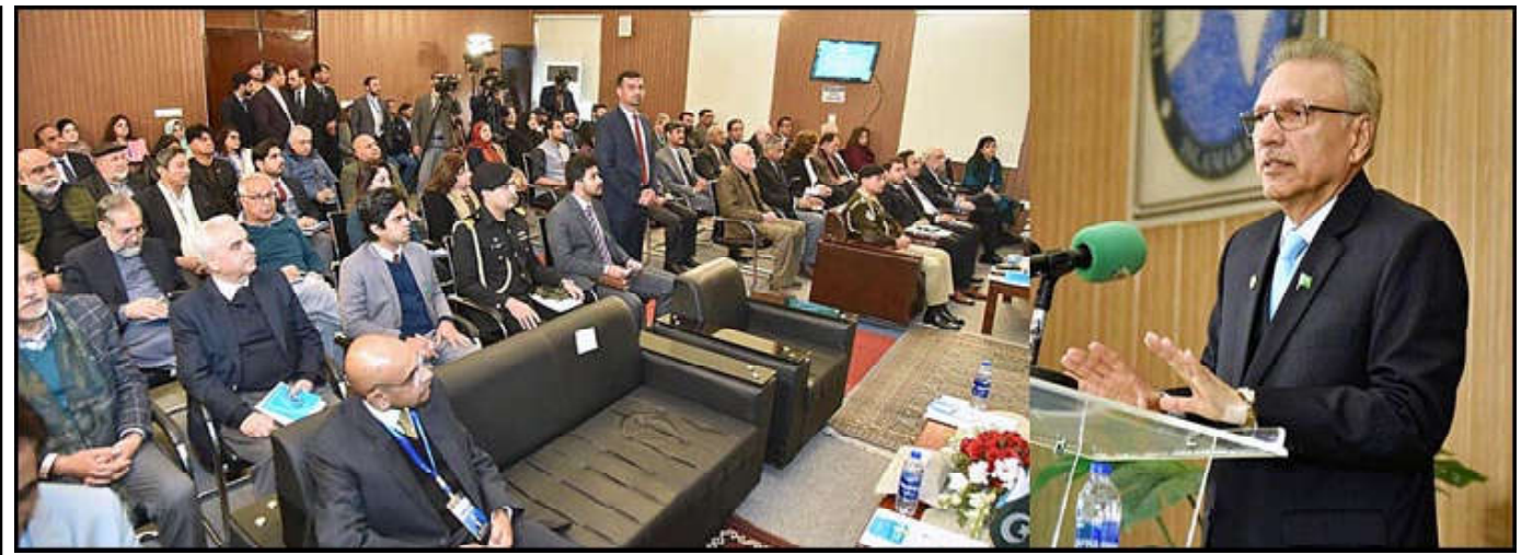
ISLAMABAD: President Dr Arif Alvi addressing the inaugural session of the Regional Dialogue 2024 on "Climate Crisis: Shaping South Asia's Resilience" organized by the Institute of Regional Studies.

despite being 19 times smaller in size than Pakistan and not having such an abundance of water similar to Pakistan. Similarly, Vietnam has taken its fishery exports to around $10 billion per annum by adopting international standards and techniques, he added. He said by pushing the farmers to adopt modern agriculture technology, Pakistan could also feed the world. He recalled Pakistan's successes in fighting COVID-19 through a data-based approach and national unity and said that the world would follow its footprints if the country set such an example as it had also achieved recognition through massive tree plantation. He said the energy the sun provided to the earth every day was many times higher than the world's annual production.