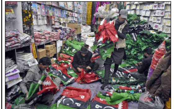
LAHORE: Vendors busy in preparing party flags of political party Pakistan People's Party in their shop Ganpat area in Provincial Capital, ahead of the country's general elections 2024.