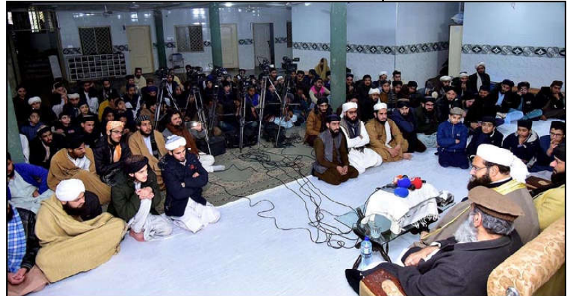
RAWALPINDI: Special Representative to the Prime Minister for Religious Harmony & Islamic Countries and Chairman Pakistan Ulema Council Hafiz Tahir Mahmood Ashrafi addressing the religious scholars and students at Rawalpindi Jamia Masjid.

Assuring cooperation to shop owners, he said that the provincial government would be contacted to provide financial assistance, including interest-free loans, to owners whose shops were gutted in the fire. On the occasion, the governor was informed that 65 shops and 17 godowns in the time center have been turned to ashes, while 60 shops are gutted in United Market. Mobile phones and accessories worth millions of rupees were destroyed during the blaze.