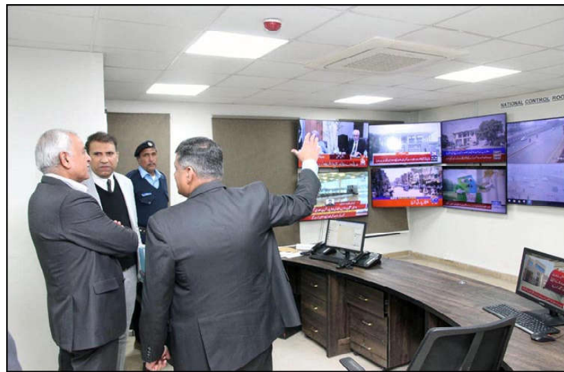
ISLAMABAD: Federal Minister for Communications Shahid Ashraf Tarar visiting the Control Room established by Ministry of Interior to monitor the overall security situation during General Elections.