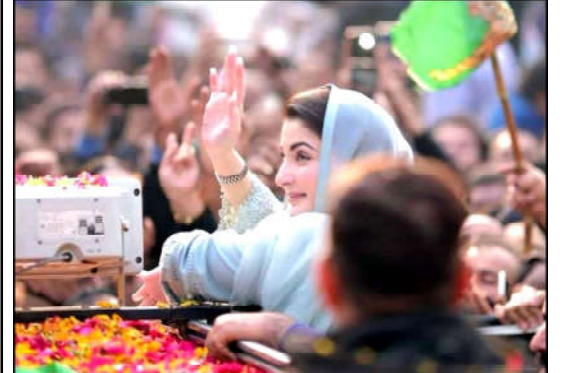
LAHORE: Muslim League (PML-N) Leader, Maryam Nawaz Sharif waving hand to her supporters during rally as a part of Election Campaign for the upcoming General Election 2024, in Lahore.

He said that Nawaz Sharif after coming into power will announce 'big projects' for Ahmedpur Sharqia masses will not be left alone.