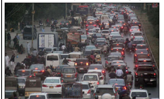
KARACHI: A view of massive traffic jam at nursery area in Provincial Capital.

He said the PPP believed in the public mandate and it would form the next government with the help of the people.