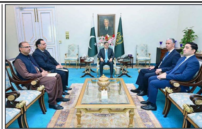
ISLAMABAD: The outgoing Ambassador of Tajikistan in Pakistan, Ismatullo Naserdin calls on Caretaker Prime Minister Anwaar-ul-Haq Kakar.

ISLAMABAD (APP): Citizens in various cities including the capital are facing almost freezing temperatures due to dense fog that engulfs in the morning and stays on for hours after daybreak where health experts asked people to remain vigilant while maintaining a healthy diet and using face masks. A thick layer of fog has enveloped many cities in Punjab including Lahore, paralyzing routine life and disrupting road traffic, a private news channel reported. The recent cold wave and foggy conditions have already made living conditions difficult with people already suffering due to power load shedding and low pressure of gas. In these circumstances, the number of people complaining of cold-related ailments has also shot up over the last few days.