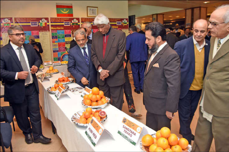
ISLAMABAD: Visitors look Kinnow during Orange Festival, at COMSTECH in the Federal Capital.