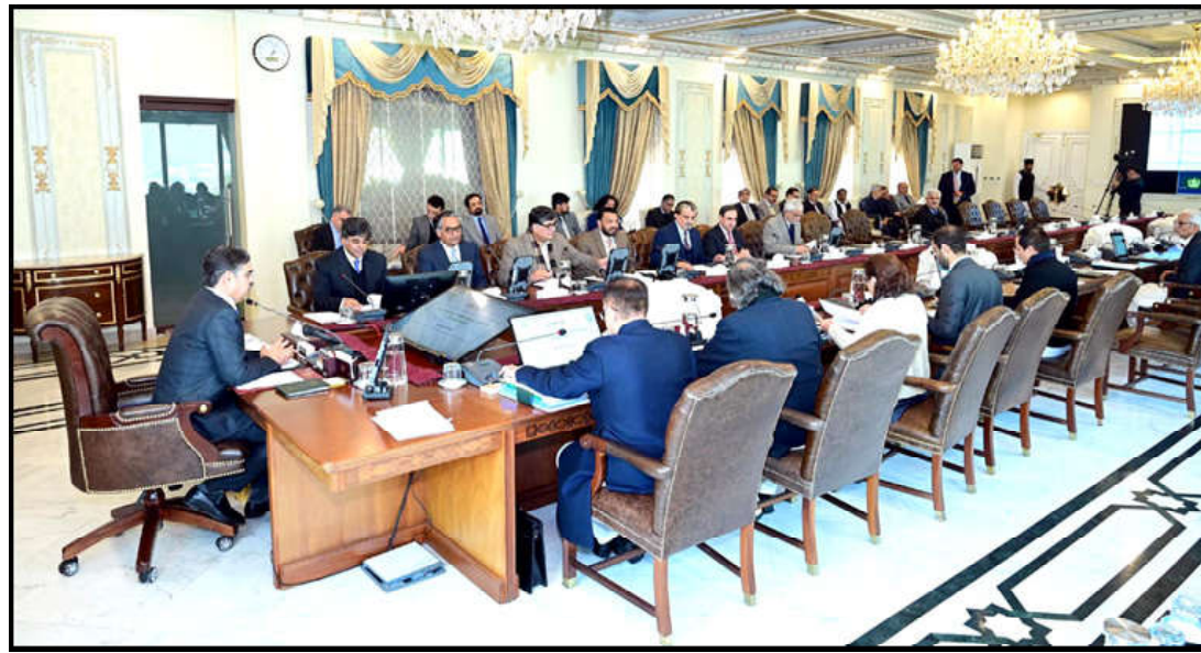
ISLAMABAD: Caretaker Prime Minister Anwaar-ul-Haq Kakar chairs a meeting of the Caretaker Federal Cabinet.