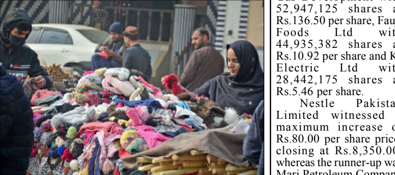
RAWALPINDI: A woman is buying children warm wool caps from a street vendor alongside Murree road in the city.