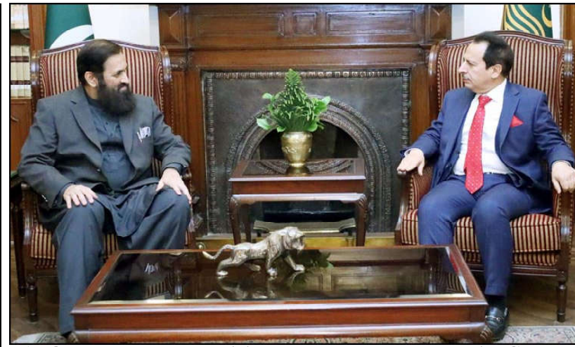
LAHORE: Federal Health Minister Nadeem Jan called on Punjab Governor Muhammad Balighur Rehman at Governor House.