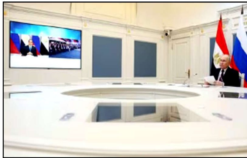
Russian President Vladimir Putin takes part in the official ceremony for pouring the first concrete into the foundation of power unit 4 at Egypt's El-Daba Nuclear Power Plant with the participation of Egyptian President Abdel Fattah el-Sisi, via video link at the Kremlin in Moscow, Russia.

collapsed in the area near the epicentre, in rural Wushi County, Xinhua reported, while electricity was temporarily knocked out. Video circulating on Chinese social media showed household appliances crashing to the floor as wild shaking rocked homes. More footage shared by state broadcaster CCTV showed firemen entering a damaged building with cracked walls and police helping an injured local. Local TV channels in the Indian capital New Delhi reported strong tremors in the city, about 1,400 kilometres away.