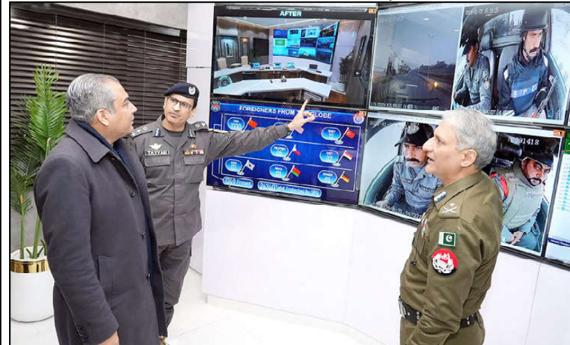
LAHORE: Caretaker Chief Minister Punjab Mohsin Raza Naqvi along with Inspector General Police Punjab inspecting latest Security Cameras after inaugurating Special Protection Unit (Special Operation Room) at city traffic Police Lines Manawa.