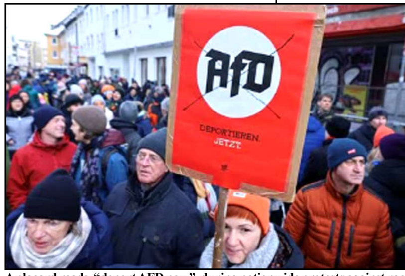
A placard reads, "deport AFD now", during nationwide protests against racism and plans of Germany's far-right Alternative for Germany (AFD) party to deport foreigners, in Bonn, Germany.

SANAA (AFP/APP): Britain and the United States have carried out strikes on the Yemeni capital Sanaa, the news agency of the Huthi rebels said Tuesday, after the group claimed to have hit a US military cargo ship. The official Saba news agency said that "American-British forces are launching raids on the capital of Sanaa" and several other parts of Yemen, while Huthi TV outlet al-Masirah said four strikes targeted the Al-Dailami military base north of the capital, which is under rebel control. Earlier on Monday, Huthi rebels claimed they had hit a US military cargo ship off the coast of Yemen—although the United States denied an attack had taken place. The Yemeni rebels began striking Red Sea shipping in November, saying they were hitting Israeli-linked vessels in support of Palestinians in Gaza, which has been ravaged by fighting amid the Hamas-Israel war.