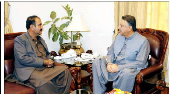
QUETTA: Former Federal Minister Agha Hassan Baloch meeting with Governor Balochistan Malik Abdul Wali Khan Kakar

ISLAMABAD (INP): The Election Commission of Pakistan (ECP) has directed the political parties and candidates to avoid erecting hoardings and banners on government buildings, on electricity poles and abide by code of ethics.