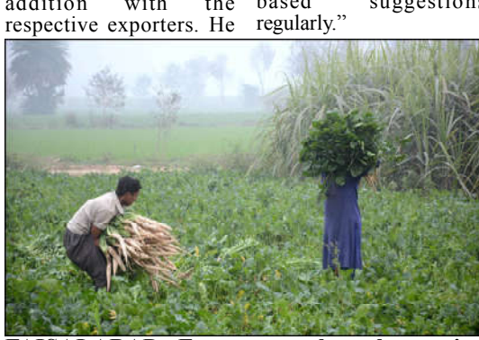
FAISALABAD: Farmers are busy harvesting raddish crop at their field.