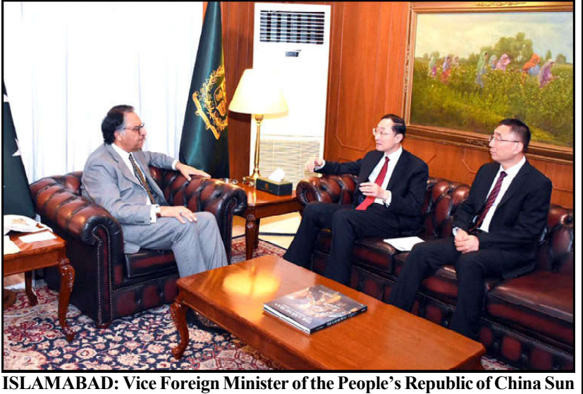
Weidong called on Foreign Minister Jalil Abbas Jilani at Ministry of foreign Affairs in the Federal Capital.

He said that the authority takes swift action upon receiving complaints. underscoring its commitment to removing and blocking any unlawful content.