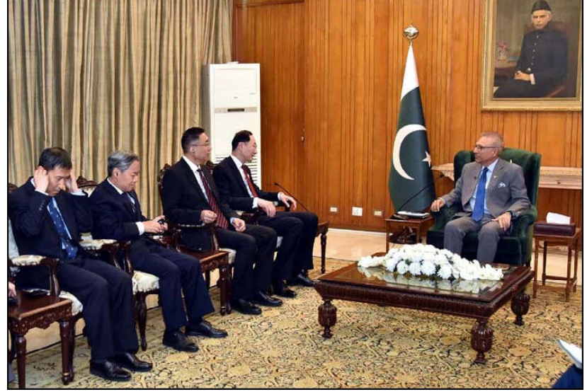
ISLAMABAD: President, Dr. Arif Alvi exchanging views with Sun Weidong. Vice Foreign Minister of the Peoples Republic of China during meeting held at Aiwan-e-Sadr in Islamabad.