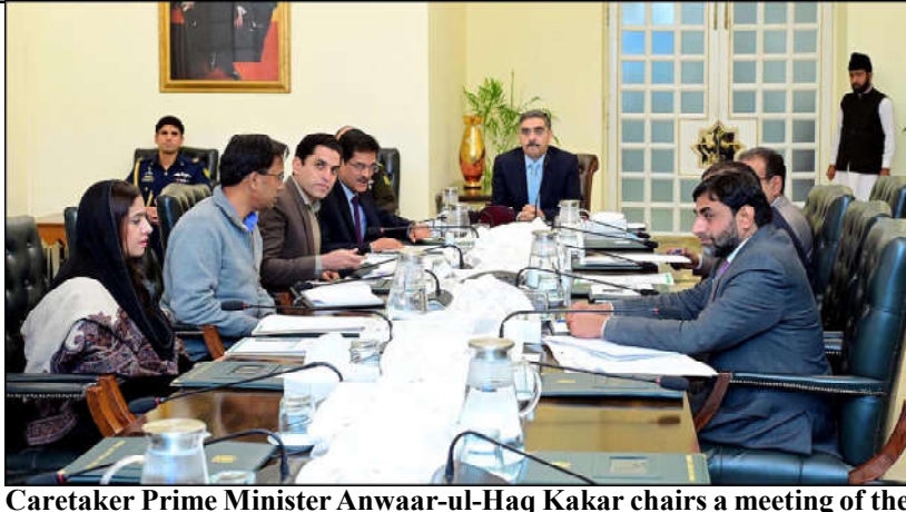
Caretaker Prime Minister Anwaar-ul-Haq Kakar chairs a meeting of the Capital Development Authority in Islamabad

He was given a briefing over the bicycle lanes project in Islamabad and federal capital master plan. Under the bicycle lanes project, a total of 374km lanes and 150 parking stations would be constructed, it was told. The prime minister also emphasized upon the need of vertical construction in the new residential projects in Islamabad. and directed the relevant authorities to formulate an effective strategy to woo investors for the business purposes with construction of high-rise buildings. He also directed the authorities to resolve the water issue of the capital city immediately by