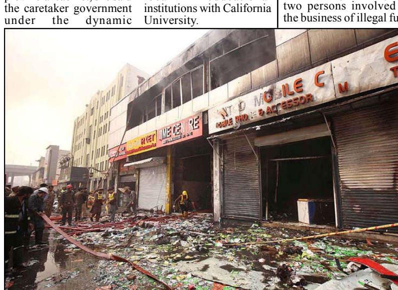
PESHAWAR: A view of damages caused by fire in the Time Center mobile

Punjab government wishes to undertake town house projects like California, adding that it is also interested in affiliation of