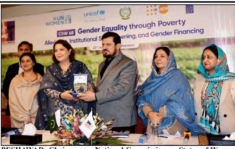
PESHAWAR: Chairperson, National Commission on Status of Women presenting shield to Khyber Pakthunkhwa Governor, Haji Ghulam during a function organized by the National Commission on Status of Women.