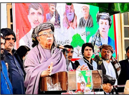
QUETTA: Chairman Pakhtunkhwa Milli Awami Party Mehmoood Khan Achakzai addressing a election campaign meeting