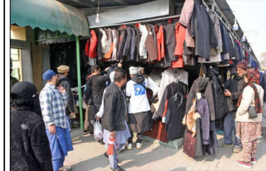
ISLAMABAD: People are busy buying warm clothes in Friday weekly bazaar at sector H-9 in the Federal Capital.