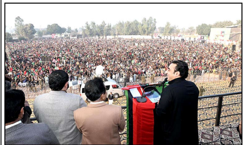
RAHIM YAR KHAN: Chairman PPP Bilawal Bhutto Zardari addressing the public gathering in in Liaquatpur.

After hearing the arguments the court ordered Islamabad police to provide record of FIR registered against Baloch demonstrators to the lawyer and wrapped up the case.