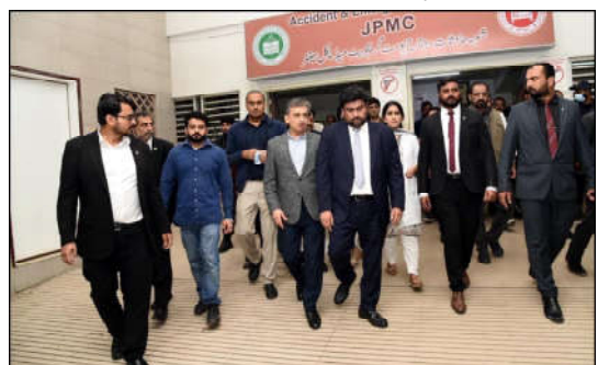
KARACHI: Governor Sindh Kamran Khan Tessori during his visit to Jinnah Hospital Emergency Department.

At this stage, the assistant commissioner Model Town also reported delays in closure of cafes. The court took a serious note of the situation and ordered for imposing a Rs 200,000 fine for the initial offense, escalating to a Rs 500,000 fine for the second violation. The court further ruled that the cafe in question should be sealed for the third violation. The court also directed to restore MA College ground immediately, besides adjourning further hearing till January 26.