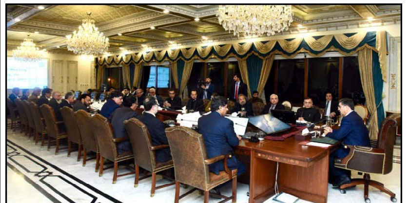
ISLAMABAD: Caretaker Prime Minister Anwaar-ul-Haq Kakar chairs a meeting of the Caretaker Federal Cabinet.