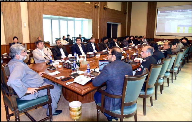
QUETTA: Caretaker Chief Minister Balochistan Mir Ali Mardan Khan Domki presiding over a high level meeting to review steps taken for holding of peaceful elections in the province