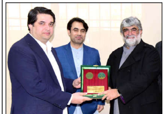
QUETTA: Secretary Finance Babar Khan presenting a shield to Caretaker Chief Minister Balochistan Mir Ali Mardan Khan Domki

Similarly, he directed to start work without any delay on the steps proposed for meeting the shortage of security personnel. Earlier, during the briefing, it was informed that some 8,000 CCTV cameras would be installed at the sensitive and most sensitive polling stations of the province. It was also informed that the deployment of the police and levies personnel as to be required for the elections. The services of retired security personnel would also be hired for election duty. The supply of election material would be done in remote and inaccessible areas of the province by the helicopter, it was decided in the meeting.