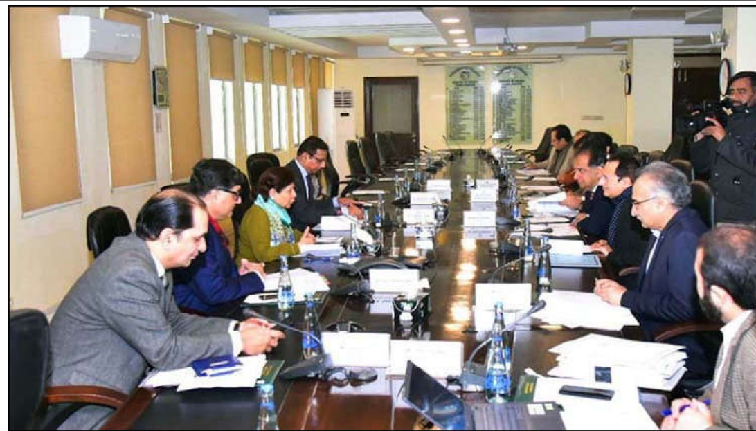
ISLAMABAD: Minister for Finance, Revenue and Economic Affairs, Dr. Shamshad Akhtar chairing a meeting on drugs pricing mechanism.

agriculture, and other sectors crucial for economic growth. The minister noted a monthly increase of one billion dollars in exports over the past three months, and with revised tariffs, he anticipated a doubling of the country's export figures. During his visit to various stalls at the Expo, Minister Gohar engaged with representatives from different companies who briefed him on their manufacturing processes. Gohar concluded his address by expressing optimism about Pakistan's promising economic