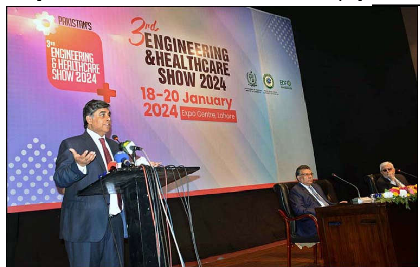
LAHORE: Federal Minister of Commerce, Industries and Investments, Dr. Gohar Ejaz addressing the Engineering & Healthcare Show 2024 at Expo Center Johar Town.