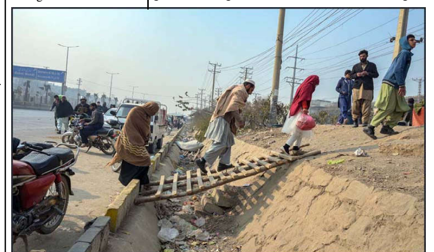
ISLAMABAD: People crossing nullah through temporary wooden ladder along road at Pirwadhai.

"We are presently running over 100 filtration plants operated by designated staff. This figure is three times higher what we had on ground four years back," the official claimed.