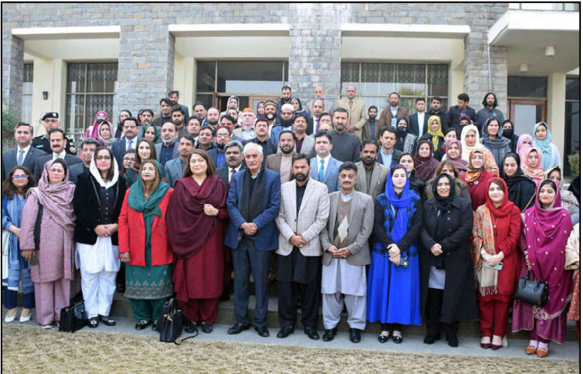
MUZAFFRABAD: Chairperson of National Commission on the Status of Women Nilofar Bakhtiar posing for a group photograph along with participants after the seminar titled "State Consultation on Ending Child Marriage" at a local hotel in the city.

and Higher Education Department were also discussed in the meeting. On this occasion, Governor Punjab issued instructions that the Punjab Government should take necessary steps in the light of these reports. Governor Punjab directed that all these reports should also be presented before the Syndicate so that the Syndicate can take correct decisions in the light of the report presented by these important departments. Governor Punjab said that the university should re-examine the agreement of the academic block construction project, which was stalled due to a dispute with a private company, and ensure its early completion. Apart from this, Governor Punjab also directed to complete the shelved project of Girls Hostels at the earliest so that along with facilities the students.