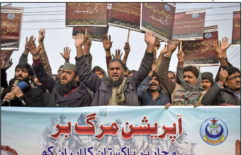
LAHORE: Activists of Jamiat Ahle Hadith Pakistan hold a protest against Iran attack on Pakistan, at Ravi road in Provincial Capital.