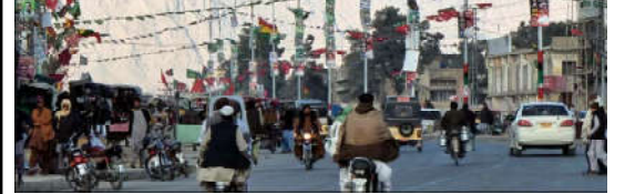
QUETTA: Banners and flags of different political parties has been placed on Saryab road in connection of upcoming General Election 2024.

He said that the whole nation is standing by its brave and talented armed forces.