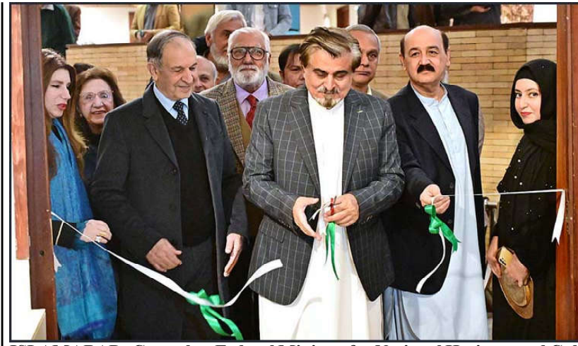
ISLAMABAD: Caretaker Federal Minister for National Heritage and Culture Division Jamal Shah cutting ribbon to inaugurate calligraphic exhibition titled "Mashq-e-Ishq" by Gen. (R) Humayun Khan Bangash at PNCA.

The Chairman, PMIC has stressed for completion of the project in true letter and spirit. The progress report of the project will be submitted to the Prime Minister.