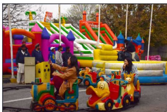
ISLAMABAD: Girls are enjoying riding train during a festival at Jinnah Convention Center in the Federal Capital.

"To avoid rush at these plants, we have now started them operating round the clock," he said. "Now it is up to their convenience as when can come to these facilities for getting water."