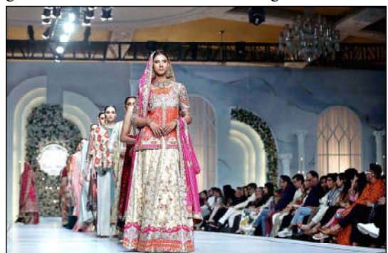
LAHORE: Models walking on ramp during Bridal Show in a local wedding hall on late Thursday night.