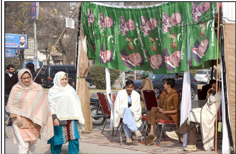
ISLAMABAD: Supporters of Pakistan Muslim League (N) sitting in a campaign office alongside a road at sector G-9 at Karachi Company in the Federal Capital, ahead of the upcoming general elections.