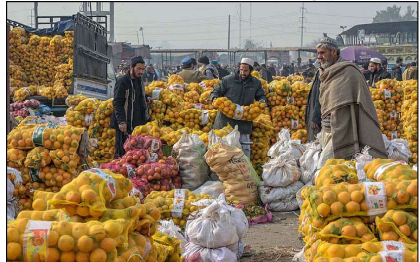
ISLAMABAD: Labourers busy in arranging bags of orange after unloading from delivery truck at Fruit & Vegetable Market, Pirwadhai.

extraction process. During the last few years, the region has witnessed an olive boom, with hundreds of thousands of Kaho trees contributing to the region's economic and agricultural prosperity. Sabir Sultan emphasized the growing interest among locals in olive cultivation and grafting, citing it as not only a source of edible oil but also an avenue for additional income through tea and pickles. The olive cultivation success story in Abbottabad serves as an inspiration for farmers and agricultural enthusiasts, showcasing the possibilities.