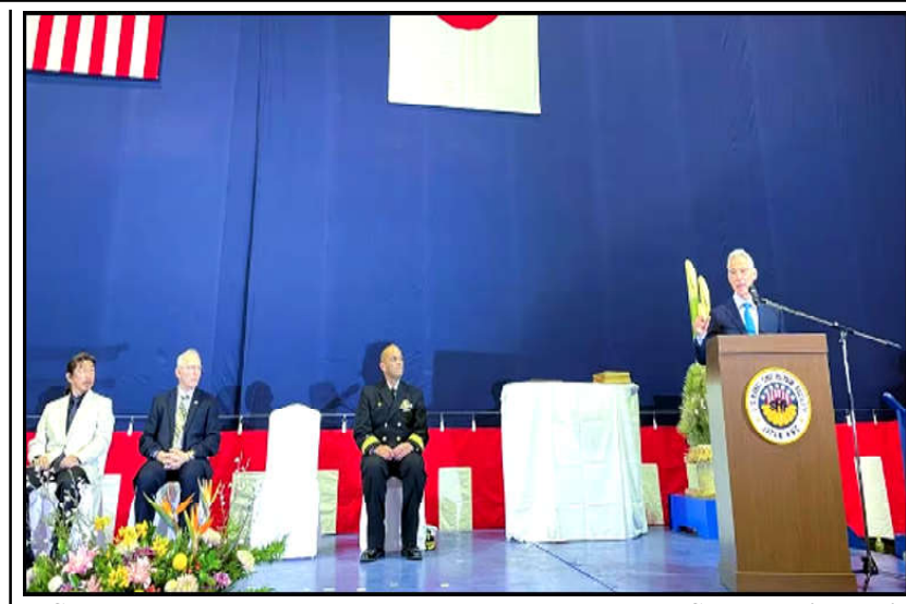
U.S. ambassador to Japan Rahm Emmanuel speaks at a U.S. naval ship repair facility in Yokosuka, Japan.