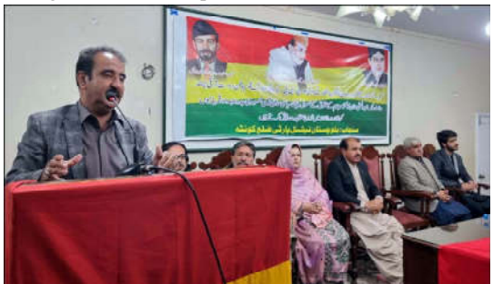
QUETTA: Former Federal Minister, Agha Hassan Baloch addresses during condolence reference on the occasion of death anniversary of Malik Abdul Ali Kakar, Founder of Balochistan National Party (BNP) held at Quetta Press Club.

This involves deploying security personnel at all polling stations, maintaining a secure environment for law and order, safeguarding printing presses during ballot paper production, and ensuring security during the transportation of ballot papers from printing presses to the offices of Returning Officers. Provide security for the transportation of polling bags from Returning Officers' offices to polling stations and for election material from polling stations to RO offices after polling and counting. This includes ensuring security during tabulation, provisional result announcements, and result consolidation by Returning Officers. Security officials should adhere to Article 220 of the Constitution of Pakistan and Section 5, along with Section 193 of the Election Act, 2017.