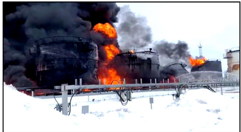
Firefighters extinguish oil tanks at a storage facility that local authorities say caught fire after the military brought down a Ukrainian drone, in the town of Klinty in the Bryansk Region, Russia.

topus and you see its tentacles all around from the Houthis to Hezbollah to Hamas." Iran has widely been seen by Israel and the US and as the major destabilizing power in the Middle East, allegedly supplying weapons, military expertise, and training to Hamas in Gaza, Hezbollah in Lebanon, and the Houthi rebels in Yemen. The US has previously alleged that Iran is "deeply involved" in Houthi attacks on commercial ships in the Red Sea, claiming that it has provided the rebels with drones, missiles, and intelligence. Tehran has denied the allegation, insisting that "resistance groups" are acting independently and "not taking orders from Tehran to confront the war crimes and genocide committed by Israel."