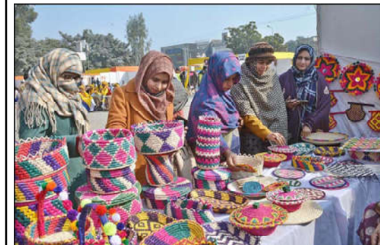
SARGODHA: Women visiting different stalls during two-day Orange Mela organized by Lok Virsa at Sargodha Arts Council.

inclusion, said a press release issued here on Friday. The event will feature a series of interactive sessions and panel discussions to highlight how non-bank microfinance institutions (NBMFI) can aid women in achieving financial independence. The workshop focuses on fintech's potential to boost women's financial inclusion, tackle non-bank microfinance sector issues, and bridge the gender finance gap. The workshop is expected to attract a diverse audience.