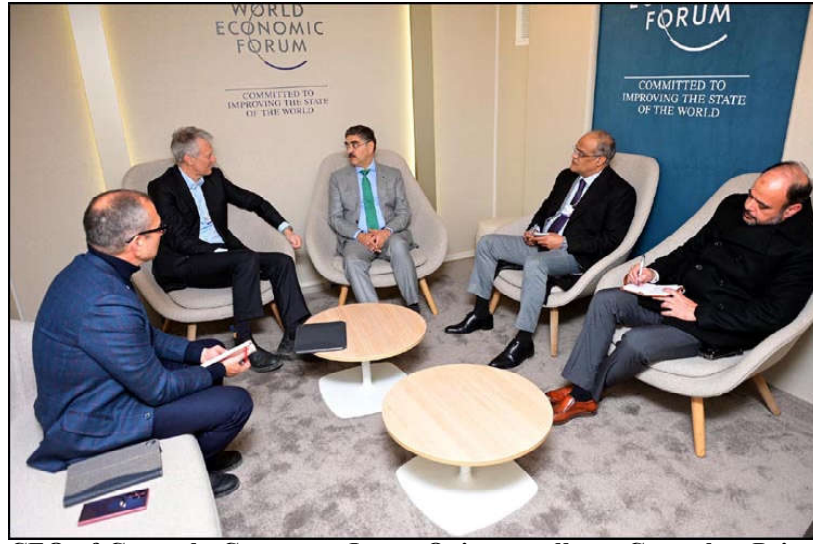
CEO of Cocacola Company, James Quincey calls on Caretaker Prime Minister Anwaar-ul-Haq Kakar on the sidelines of the World Economic Forum in Davos.

business people have different opinion," he said adding the private entities should become the opinion maker and influencing and contributing more towards it. Caretaker Prime Minister Anwaar ul Haq Kakar held a meeting with Chief Executive Officer of Cocacola Company, James Quincey on the sidelines of the World Economic Forum in Davos today. In the meeting, the Prime Minister highlighted the steps taken by the government to facilitate business and investment in Pakistan. The Prime Minister also discussed the establishment of the Special Investment Facilitation Council and the favorable environment for foreign investors.