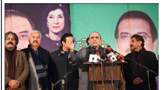
LAHORE: PPP President, Asif Ali Zardari addresses public gathering meeting regarding inauguration ceremony of Election Campaigns in connection of the General Election 2024, held at Peko Road NA-127 constituency in Lahore.