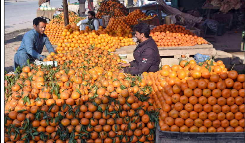
ISLAMABAD: A vendor is selling Kinnow at his fruit stall alongside a road at Khanna Pull area in the Federal Capital.