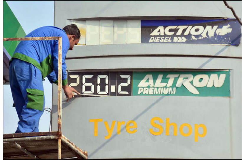
RAWALPINDI: An employee of a petrol station updates the latest fuel prices on a board, alongside Murree road in the city, as petrol and diesel prices come down for the second half of January 2024 amid changes in global crude prices.