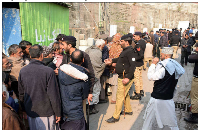
MUZAFFRABAD: Police personals searching body of devotees of entry gate of shrine of Hazrat sain Sahki Saheli Sarkar during annual Mela, in the city.