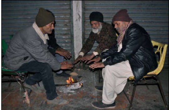
HYDERABAD: People warm their hands on bonfire to save themselves from cold waves during the winter season, in Hyderabad.