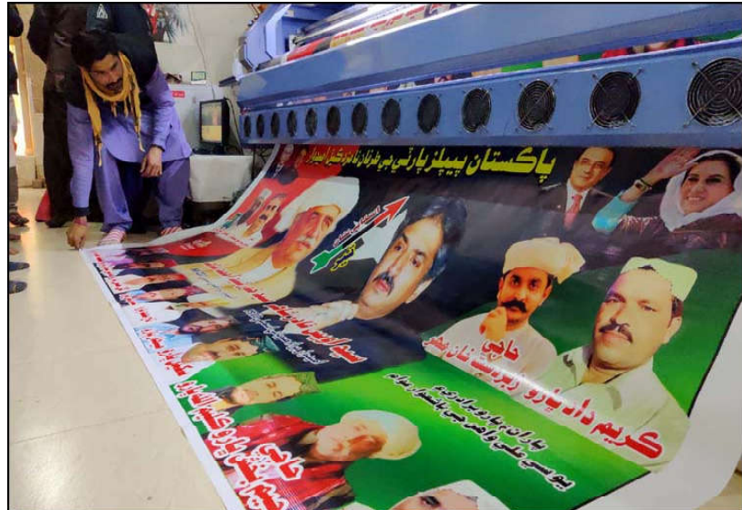
SUKKUR: Laborers are working at a printing press busy in printing posters for publicity party candidate in connection of Election Campaigns of the General Election 2024, in Sukkur.