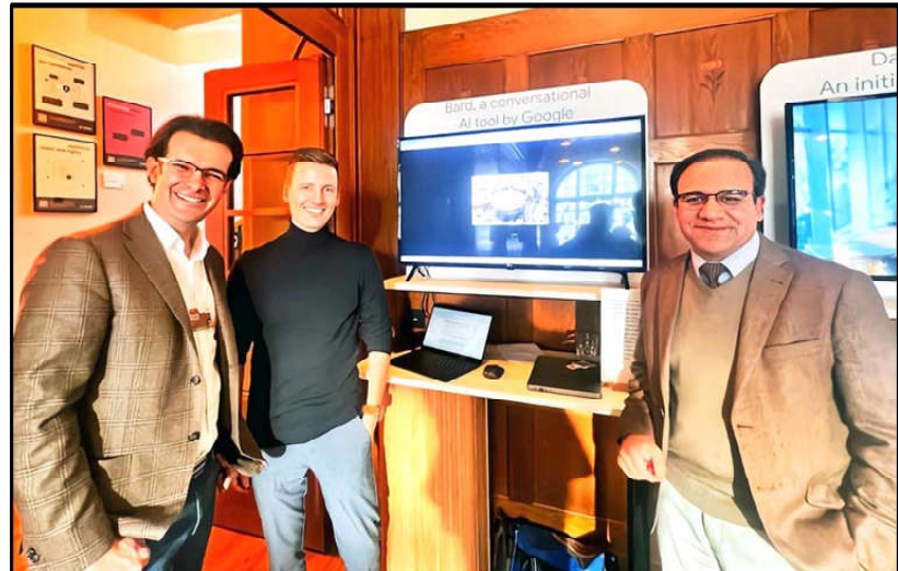
SWITZERLAND: Caretaker Federal Minister for IT and Telecommunication Dr. Umar Saif visits Google House at Davos.