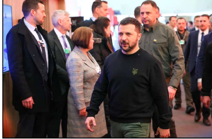
Ukraine's President Volodymyr Zelenskyy and Head of the Ukrainian President's Office Andriy Yermak arrive for the meeting with U.S. Secretary of State Antony Blinken (not pictured) during the 54th annual meeting of the World Economic Forum in Davos, Switzerland.