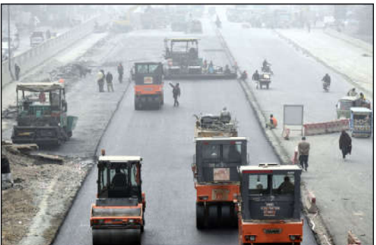
LAHORE: Labourers are busy in construction work of Sagian Road with the help of heavy machinery in the Provincial Capital.