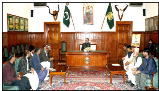
QUETTA: A delegation of BNP meeting with Governor Balochistan Malik Abdul Wali Khan Kakar

After extensive hearings last week, a three-member bench of the Supreme Court, led by Chief Justice of Pakistan Qazi Faez Isa, upheld the Election Commission of Pakistan's decision to invalidate the PTI's electoral symbol "bat" and declared its intra-party polls as "un-constitutional."