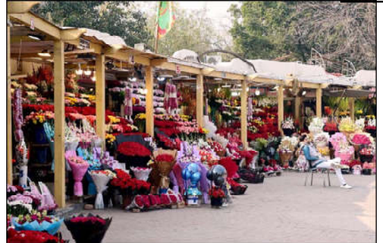
ISLAMABAD: Vendors displaying flower bouquets to attract customers at F-6 Flower Market in Federal Capital.

a strong view that Artificial Intelligence (AI), can revolutionize and revitalize the agriculture sector, especially horticulture, while addressing the challenges of climate change, adapting modern crop patterns, attracting talent and envisioning a positive impact on this sector. She called for executing AI promptly as the most significant step in the agriculture sector which needs to be incorporated in the Green Pakistan Initiative.