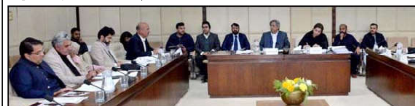
ISLAMABAD: Chairman Senate Standing Committee on Power, Senator Azam Nazeer Tarar presiding over a meeting of the committee at Parliament House.

extend the bilateral relations and cooperation, investment opportunities in the province and other matters of mutual interest came under discussion in the meeting. Ahmad Shah said that Pakistan-Qatar brotherly relations span over many decades and Qatar actively participated in relief and rehabilitation activities in Sindh on the occasion of natural disasters and the most recently in floods. The minister said that Karachi, as the economic hub of the country, has a very favorable environment for investment and Qatari investors could benefit.