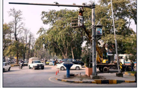
ISLAMABAD: A worker is busy in the maintenance work of CCTV cameras installed in Federal Capital.

adjourned for the said date. "When the case was fixed for 8.1.2024, no written application was filed and during the hearing learned counsel stated that he wants to withdraw the objection noted on the last date of hearing. "As the petitioner's counsel was not willing to plead the complainants as respondent in these petitions, then a question was posed to the learned counsel whether without impleading the complainants/informers we can proceed with the matter and on this point some of the arguments were advanced on 8.1.2024 and further Constitution Petition No.43/2023, etc 6 arguments we heard today and passed the order of impleadment as respondent in these petitions.