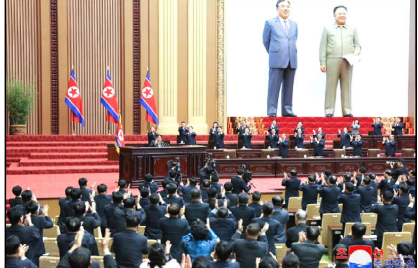
North Korean leader Kim Jong Un attends the 10th Session of the 14th Supreme People's Assembly of the Democratic People's Republic of Korea, at the Mansudae Assembly Hall, in Pyongyang, North Korea.

indeed working on with the US administration, and it is more relevant in the context of Gaza." Securing a normalisation deal with Saudi Arabia would be the grand prize for Israel after it established diplomatic ties with the United Arab Emirates, Bahrain and Morocco, and could transform the geopolitics of the Middle East. The kingdom, the most powerful country in the Arab world and home to the most sacred sites in Islam, wields considerable religious clout across the globe. After the eruption of conflict last October between Israel and the Palestinian group Hamas that rules Gaza.