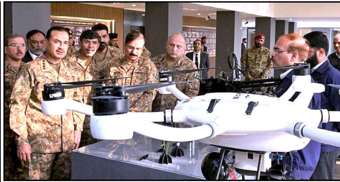
WAH: General Syed Asim Munir, NI (M), Chief of Army Staff (COAS) visits Pakistan Ordnance Factories (POF) Wah.