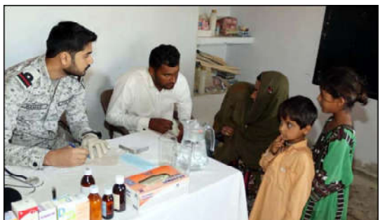
Doctor examining the patients at free medical camp established by Pakistan Navy at Kappar village

They were agreed on that there is a dire need to take more steps for promotion of bilateral trade between the two countries. Moreover, there is also need to take concrete measures for prevention of smuggling, they stressed.