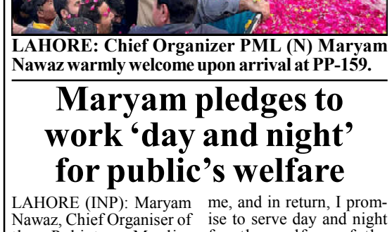
LAHORE: Chief Organizer PML (N) Maryam Nawaz warmly welcome upon arrival at PP-159.

The discussion also centered around collaboration in the recently established techno parks, with a focus on leveraging technological advancements for enhancing operational effectiveness and efficiency.