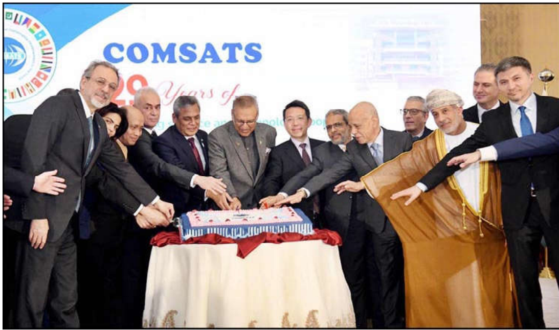
ISLAMABAD: President Dr Arif Alvi cutting cake to mark the 29th anniversary celebration of the Commission on Science and Technology for Sustainable Development in the South (COMSATS), at Aiwan-e-Sadr.