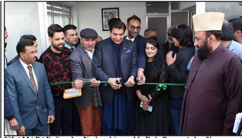
ISLAMABAD: Speaker National Assembly Raja Pervez Ashraf inaugurating the office of the Parliamentary Reporters Association at Parliament House.

The evening session featured briefings from the Ministry of Communication, shedding light on its affiliated Departments.