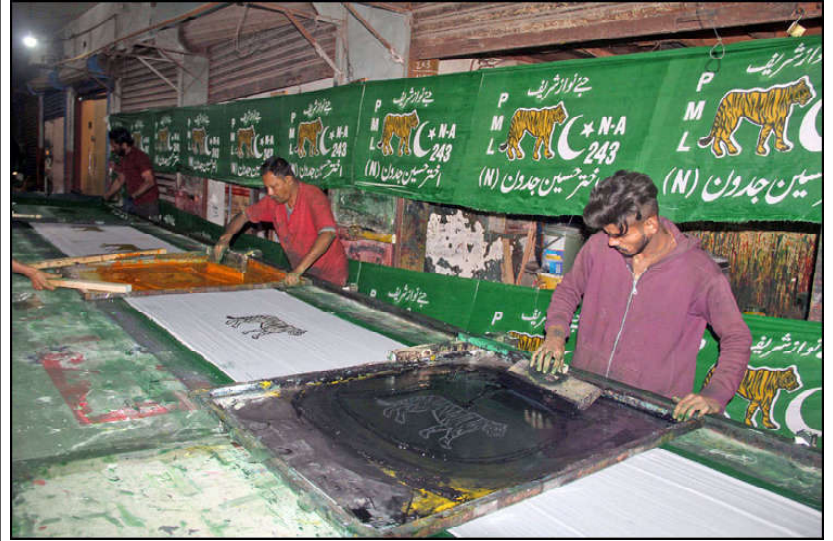
KARACHI: Workers using screen printing method print election banners for the PML N Political party at a workshop in Provincial Capital, ahead of the upcoming general elections.

Highlighting the achievements in this regard, he mentioned that 8,912 Pakistani workers have been employed in various sectors in Romania over the last five years. To a question, he highlighted the proactive role of the Bureau of Emigration & Overseas Employment in exploring job opportunities for Pakistani workers in Romania. He reaffirmed the Government of Pakistan's commitment to enhance cooperation and stated that the government aims to sign a Memorandum of Understanding (MoU) on labor migration with Romania. This MoU will create a structured framework to facilitate safe, orderly,