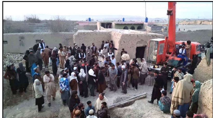
QUETTA: Rescue officials and local people busy in rescue operation to save the lives of child, which fell down into sewer into a well, located on Bostan area in Quetta.

the tax collection body will suspend SIMs and utility connections of the non-filers. The IMF's move to issue notices to hundreds of thousands of non-filers is part of a broader strategy to boost tax compliance in Pakistan. Last week, the Executive Board of the International Monetary Fund (IMF) completed the first review of Pakistan's economic reform programme supported by its Stand-By Arrangement (SBA). "The Board's approval allows for an immediate disbursement of SDR 528 million (around US$ 700 million), bringing the total disbursements under the SBA to US$ 1.9 billion," a Finance Ministry news release said.