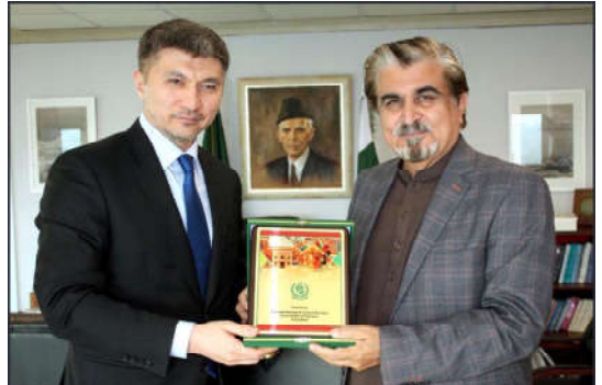
ISLAMABAD: Caretaker Federal Minister for National Heritage and Culture, Jamal Shah presenting shield to Ambassador of Kazakhstan, Yerzhan Kistafin at National Heritage & Culture Division.

According to rescue sources, the cause of the fire is not yet known. Rescue sources also informed that no casualty was reported in the incident.