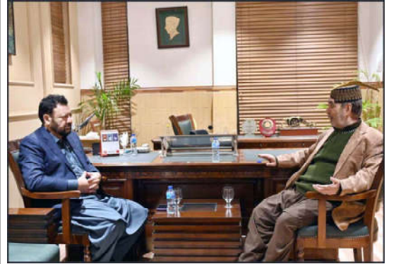
ISLAMABAD: Chief Minister Gilgit-Baltistan, Haji Gulbar Khan calls on Governor Gilgit-Baltistan, Syed Mehdi Shah.

The Pakistan Senate delegation underscored the potential for increased co-operation by urging the CPA to establish a regional office in Pakistan. This move is seen as pivotal in expanding collaborative initiatives with both federal and provincial parliaments, aiming to bolster the capacities of elected members, staffers, and officials.