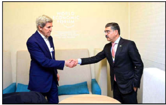
DAVOS: Caretaker Prime Minister Anwaar-ul-Haq Kakar meets U.S. Presidential special envoy on Climate John Kerry on the sidelines of the World Economic Forum.

During the meeting, they discussed the local and global impacts of climate change. The two leaders also discussed the climate change related challenges being faced by the developing countries.