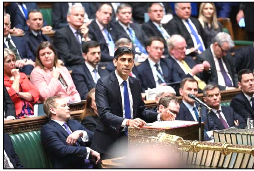
Britain's Prime Minister Rishi Sunak delivers a ministerial statement in the House of Commons, in London, Britain.

mined to do even more and that's why I can announce today the UK will send in some 20,000 personnel to lead one of Nato's largest deployments since the end of the Cold War." The UK contingent will include fighter jets and surveillance aircraft, the navy's most advanced warships and submarines, and a full range of army capabilities, including special operations forces. London will send a so-called Carrier Strike Group — which features its flagship aircraft carrier and F-35B fighter jets and helicopters — to the exercises in the North Atlantic, Norwegian Sea and Baltic Sea.