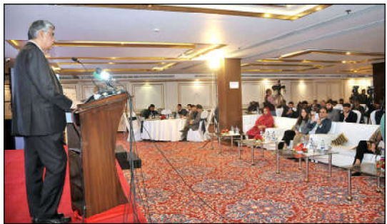
Identification". The minister opined that probably lack of a strong local government system was prob-

ably one of the major problems in Pakistan's political history. Terming the conference for the civic hackathon problem identification as a very interesting initiative, he said it aimed to bring together experts from the public, private sector and civil society to collectively identify the most pressing civic issues in the country - in order attempt to later develop a digital solution for it. He said that in Pakistan, there was a lot of potential to focus on develop-