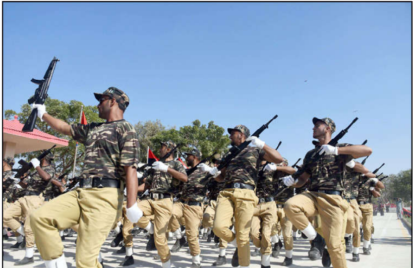
KARACHI: Police commandos march during the passing-out ceremony at Saeedabad Police Training Centre, in Provincial Capital.