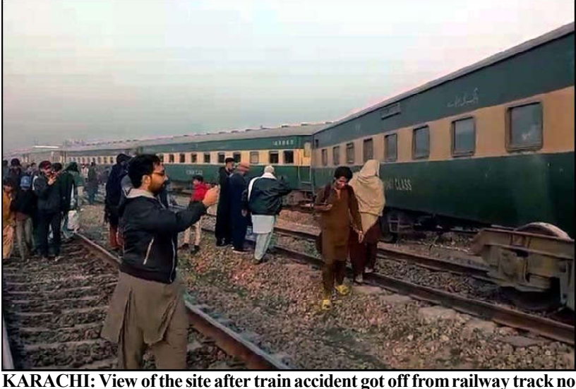
casualties is reported due to slow speed, three bogies of Shalimar Express derailed from the tracks near Bin Qasim Railway in Karachi.

He said the Punjab government has begun the registration of electric vehicles through the initiative Punjab Bank of Pakistan.