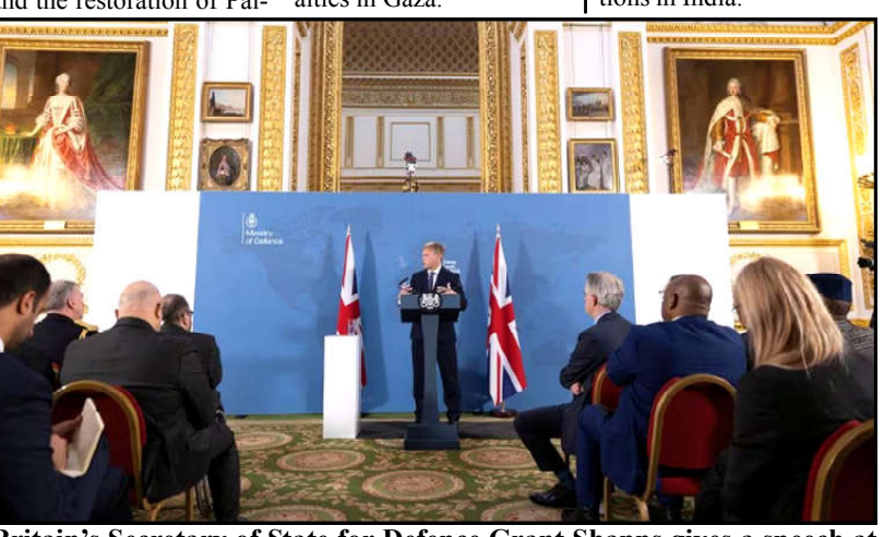
Britain's Secretary of State for Defence Grant Shapps gives a speech at Lancaster House, in London, Britain.

They also wished each other success in upcoming parliamentary elec tions in India.