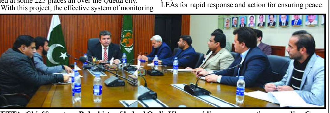
QUETTA: Chief Secretary Balochistan Shakeel Qadir Khan presiding over a meeting regarding Green Pakistan Initiative

and surveillance for restoration of peace in the city.