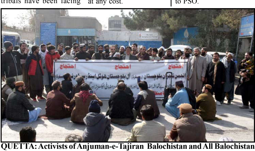
Hotel and Restaurant holding a protest against extra charges in sui gas bills

They They said that 0.7 mil- Balochistan Health Department and Malaria Control Program are also taking steps to provide awareness to the public about health and malaria prevention so that awareness could be created in people to protect tricts of Balochistan includ- them from malaria.