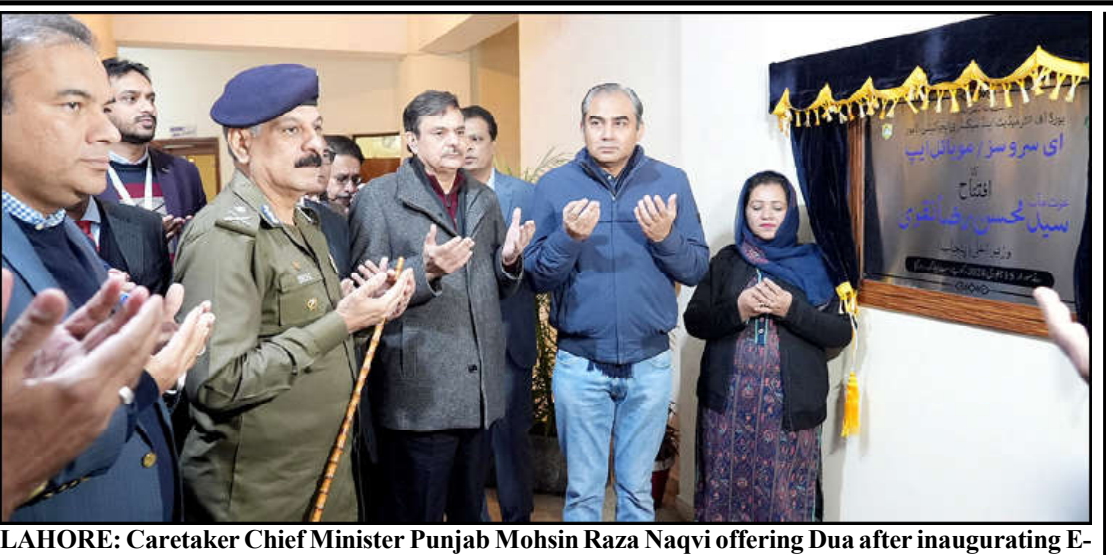
Services/Mobile App at Lahore Board of Intermediate and Secondary Education