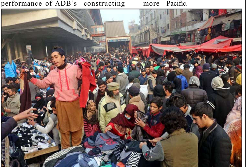
LAHORE: Warm clothes are being selling at a roadside stalls as the demand of warm clothes and shoes increased in city during the winter season, near

These interactions act as a platform for both aim to build robust public and private sector partnerships in the realms of policies, project their thought leadership implementation, and accelerating Participants will delve transformation of food systems in Asia and the