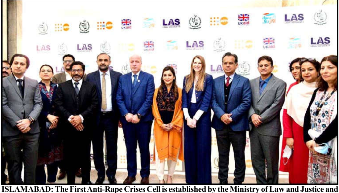
Ministry of Health with the support from the UK Government, UN Population Fund (UNFPA) and Legal Aid Society.

He said Sindh had issues of sea intrusion as well, as there was the low discharge of water to Indus Delta.