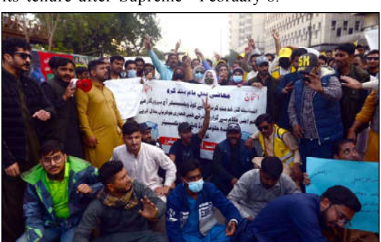
KARACHI: Lady Health Workers and vaccinators of Expanded Programme on Immunization (EPI) are holding protest demonstration for acceptance of their demands, at Karachi press club.

federal government argued the said matter is pending hearing in Supreme Court (SC) too. SC has given order to hold election. Election schedule has been issued. The elections are going to be held on