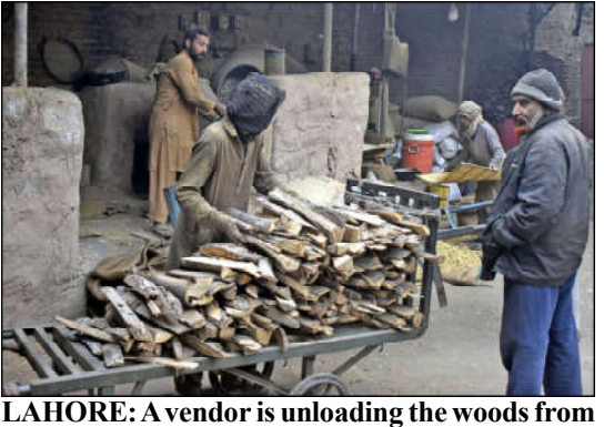
handcart to use as fuel at traditional mud oven at Misri Shah area of the Provincial Capital.

During the conference, the Pakistan Software Association released introductions and contact information of 38 Pakistani