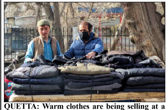
QUETTA: Warm clothes are being selling at a roadside stall as the demand of warm clothes increased in city during the winter season, in Quetta.

While a good snowfall often holds the promise of quality harvest, its continued absence during the ongoing winter has begun leaving thousands of farmers, particularly the apple cultivators, distraught.