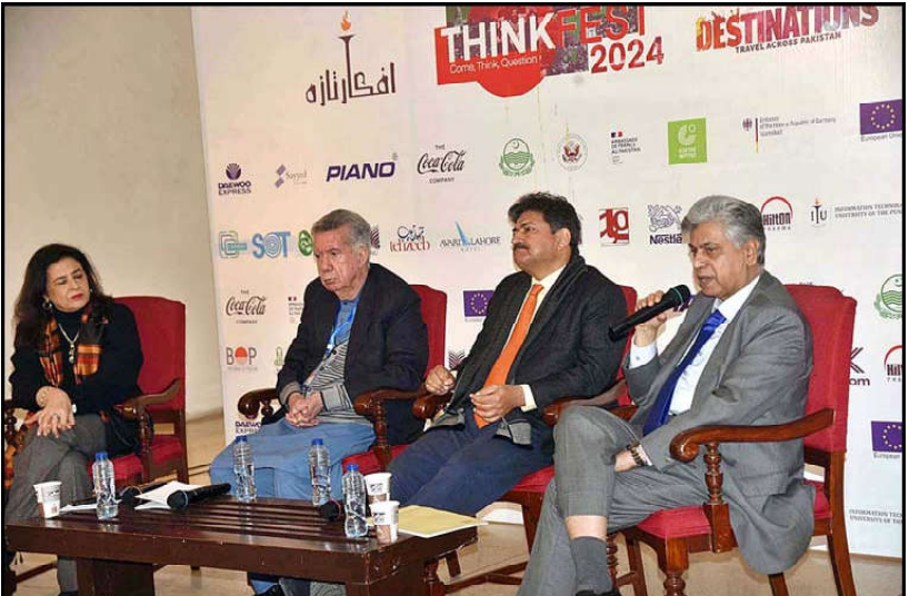
LAHORE: Caretaker Federal Minister for Information and Broadcasting, Murtaza Solangi addressing a Seminar (Muzakara) organized by Think Fest at Al Hamra Hall.

Two each female candidates are contesting from NA-255, NA-260, NA-262 and NA-263. No female candidate