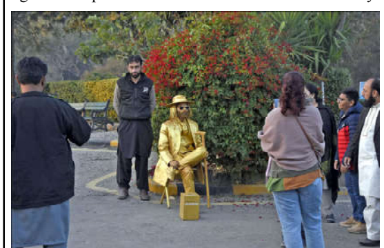
ISLAMABAD: People taking picture with Golden man at Dam-e-Koh picnic point during Sunday Holiday in the Federal Capital.