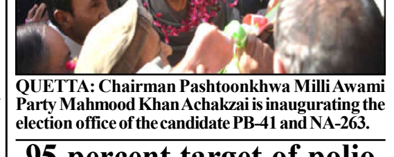
QUETTA: Chairman Pashtoonkhw Milli Awami Party Mehmood Khan Achakzai is inaugurating the election office of the candidate PB-41 and NA-263.

It is noteworthy that political parties assigned symbols for the 2024 general elections must comply with Section 206 of the Elections Act, 2017, ensuring a 5 percent representation of women candidates on general seats.