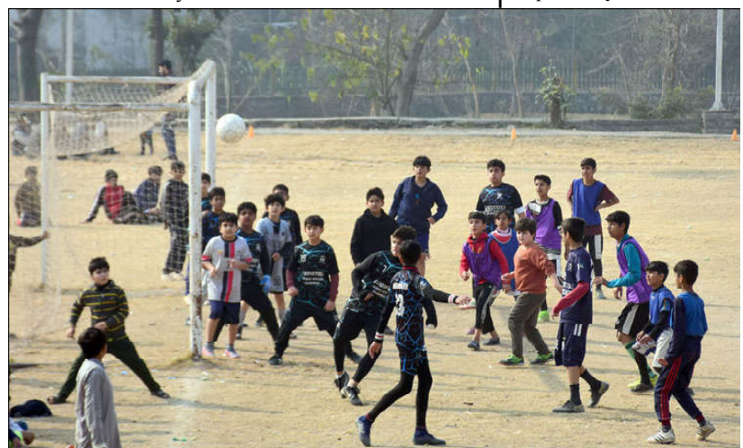
ISLAMABAD: Youngsters playing football match in a ground at sector G-10 in the Federal Capital.