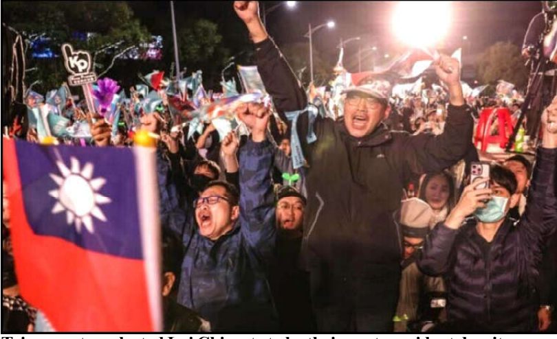
Taiwan voters elected Lai Ching-te to be their next president despite warnings from China that he would take the island closer to war.