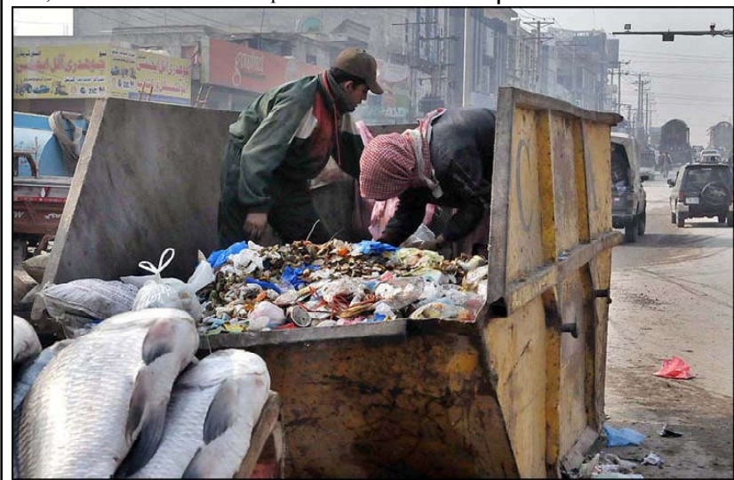
ISLAMABAD: Gypsy youngsters searching valuables from garbage.

ISLAMABAD (APP): The Pakistan Institute of Development Economics (PIDE) has launched the latest edition of its 'Discourse Magazine' this week, aiming to initiate a nationwide debate on the reform of key sectors, domains, and institutions. Around 15 unique areas have been covered in 'Discourse: Reconfiguring Pakistan: State, Society, and Economy,' including Reconceptualizing Development, Constitutional Reform, Political Contestation, Parliament and Civil Service, Economic Policy, Foreign Aid, Energy, Trade and Industry, Land and Agriculture, Labour Relations, Education, Public Welfare, Cities and Local Governance, Climate, and Society and Culture, as stated in a PIDE news release on Sunday. The publication features contributions from a number of prominent personalities in the academic domain, political sphere, legal fraternity, media sector, government bureaucracy, diplomatic circle, business community, development network.