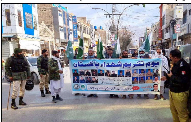
QUETTA: Members of Balochistan Commission for Human Rights are holding protest demonstration for acceptance of their demands, held at Manan Chowk in Quetta.

While the campaign also remained continued on Sunday, it is likely to achieve more about