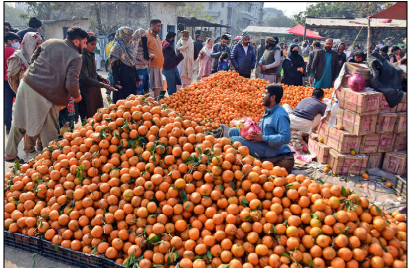
ISLAMABAD: People are busy buying Kinnow in Sunday weekly bazaar at sector G-10 in the Federal Capital.

The PBF President further stated that the measures taken by the Army Chief were for the betterment of the country and hoped for more improvements in future. "The unwavering resolve by Pakistan's security forces to combat illegal activities and secure the nation's economic interests, ultimately working towards a more prosperous and stable Pakistan."