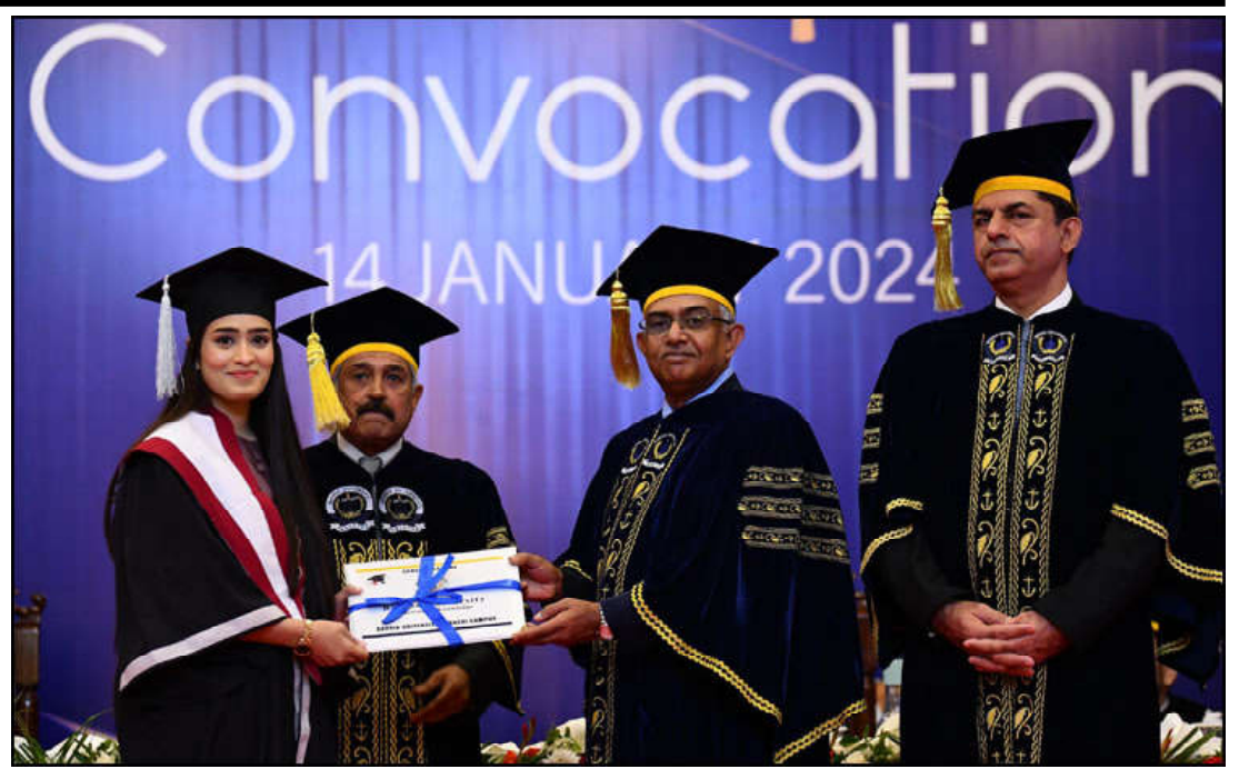
Chief Naval Staff Admiral Naveed Ashraf award certificate to a student of Bahria University Karachi Campus during 19th Convocation ceremony.