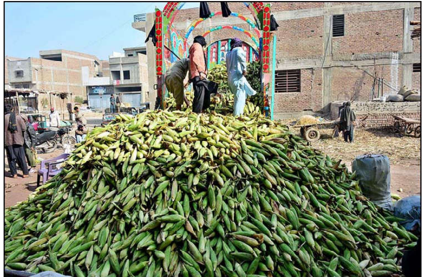
HYDERABAD: Labourers are busy unloading corn cobs from the delivery truck.

The spokesman said that the purpose of this agreement was to maintain paperless files of the notes, approvals and proposals so that the records could be easily accessible. Sometimes important documents of the offices are damaged during any untoward incident like flood or fire. For example, RDA documents were lost in 2004 due to the flood, he told. The spokesman informed that representative of PITB briefed the participants about E-Filing and Office Automation System.