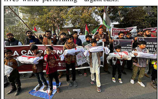
MULTAN: A protest arranged by the Save Gaza campaign with the solidarity of the people of Gaza at Multan press Club.

KOHOSTAN (APP): At least two women died and 18 others were injured when a pak-up vehicle fell into a deep gorge at Village Qilla of district Kolai Palis. According to the Rescue 1122 sources, the pickup, which was carrying more than 20 family members who were going to attend a marriage ceremony, fell into a gorge, resulting in two women dying on the spot and 18 others, including women, children, and men, sustaining injuries. District Emergency Officer Lower Kohistan mobilized a medical team along with all available ambulances to the accident site and promptly administered initial medical aid to the injured. Initially, the injured were shifted to the district hospital in Pattan, and after first aid, seriously injured passengers were transferred to Ayub Medical Colleges in Abbottabad.