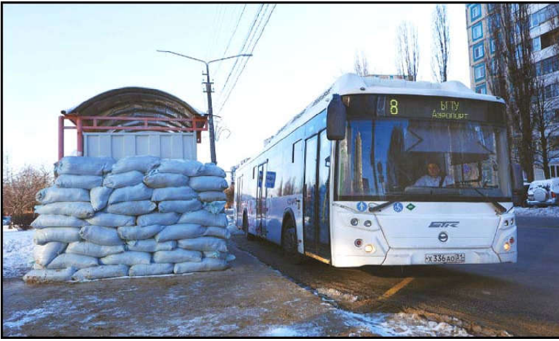
A bus stops at a place protected with sandbags in Belgorod, the main city in Russia's south-western region which has come under shelling by Ukraine over the past week.