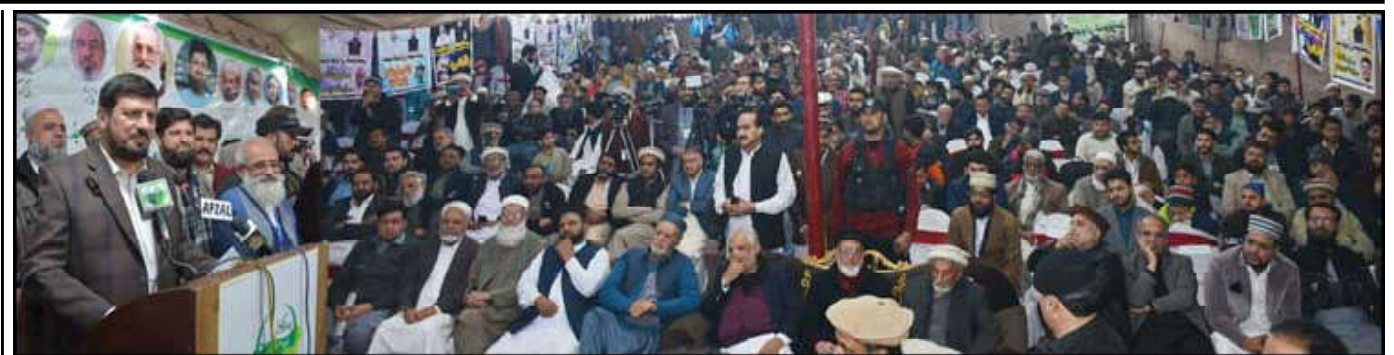
PESHAWAR: Khyber Pakhtunkhwa Governor Haji Ghulam Ali addressing Hindko convention organized by Hindko Tahafuz Foundation.

shoulders," he said, and added that he attached great importance to the provision of facilities to journalists. He urged them to concentrate on digital media since the future belonged to this form of journalism. "Those who don't change themselves according to changing times lag behind others," the CM opined. There were many things, he went on to say, in which Pakistan was behind other countries. Speaking on the occasion, Caretaker