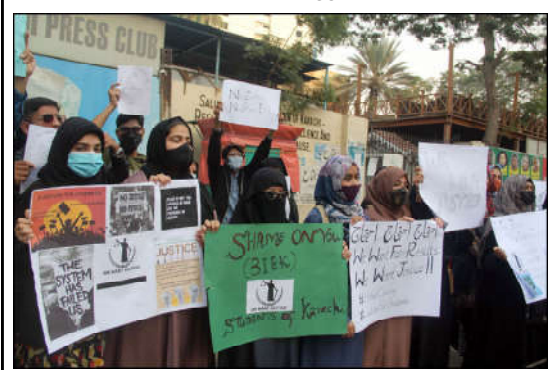
KARACHI: Students holds placards during protest in favor of their demands outside press club in Provincial Capital.