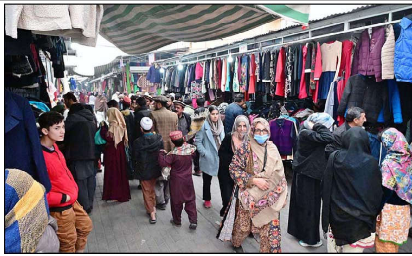
ISLAMABAD: Customers selecting and purchasing old clothes displayed by the Weekly Bazaar vendors to attract the customers.

MULTAN (APP): The Multan Electric Power Company (MEPCO) on Sunday disconnected electricity connections of 1862 agriculture tube well consumers over non payment of over Rs 1.36 billion pending dues across the region. The MEPCO's drive against defaulter tube well consumers was underway under the directions of the Prime Minister. Teams have disconnected the connections of defaulter farmers and removed transformers also during the ongoing drive. While 491 agriculture consumers have deposited Rs 179.9 million dues during this period.