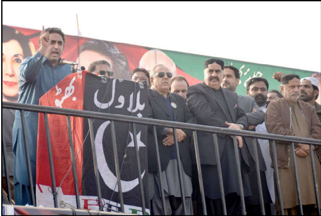
DERAALLAH YAR: Chairman of the Pakistan People's Party (PPP) Bilawal Bhutto Zardari addressing during political gathering

Ph: 2841470/2841473 REG: No. BC-116 B/ID-445 Vt XXV No 146, Rajab 03, 1445 AH Monday January 15, 2024 Pages 08, Price Rs.15