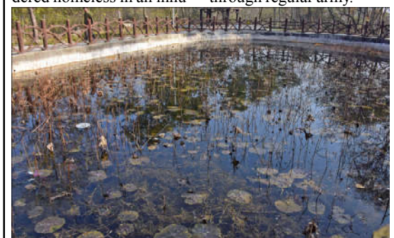
ISLAMABAD: A view of polluted water of Lotus Lake in the Federal Capital, as needs to attention for concern authority.