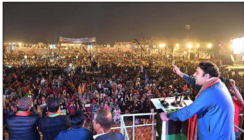
KHAIRPUR: Chairman Pakistan People's Party Bilawal Bhutto Zardari addressing to public gathering during Election Campaign.