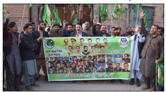
QUETTA: Workers of Pakistan Muslim League (N) hold a rally pay tribute to martyrs of the Pak Army.