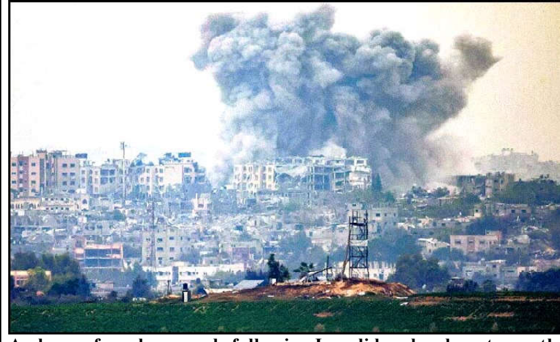
A plume of smoke ascends following Israeli bombardment over the Gaza Strip.

that more than 20 of all the listed (weapons) which were not included in the number of the downed, did not reach their targets as a result of active countermeasures by electronic warfare," the statement said. There were no details on the targets of the strike. Air defences shot down Russian missiles in at least five regions across Ukraine, according to local officials from those provinces. The large south-eastern city of Dnipro was struck, the local governor said, also without providing detail as to what was hit. Police in the northern region of Chernihiv posted a picture of a large crater made by a downed missile. "As a result of being hit by the debris of an en-