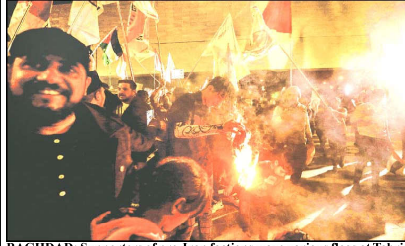
BAGHDAD: Supporters of pro-Iran factions wave various flags at Tahrir square during a protest on Saturday against the US and British air strikes against Yemen's Houthi fighters.

Monitoring Desk AKROTIRI: Pro-Palestinian activists protested at the gates of RAF Akrotiri in Cyprus on Sunday, angry that the British base was used as a launch pad for strikes against the Houthi militia in Yemen. U.S. and British warplanes, ships and submarines launched dozens of air strikes against Houthi forces in Yemen overnight Thursday to Friday in retaliation for attacks on Red Sea shipping that the Iran-backed group says is a response to the war in Gaza.