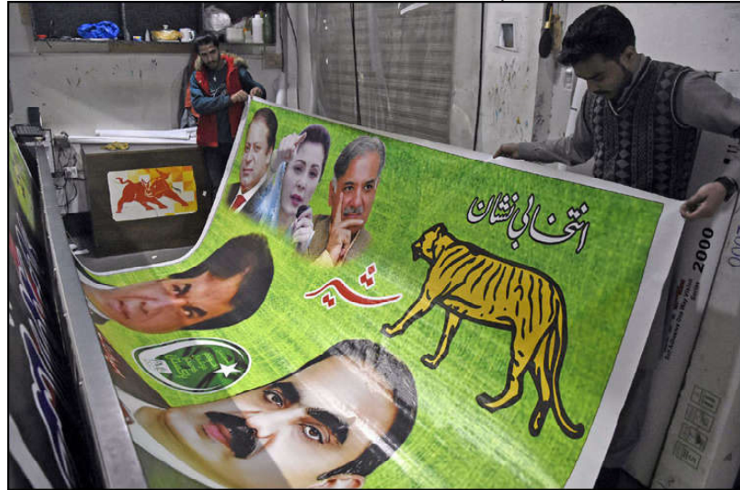
RAWALPINDI: Workers prints election campaign posters of candidates of political party Pakistan Muslim League (N) at a printer in the city, ahead of the upcoming general elections.

The index was set at 1,000 on Jan. 1, 1998.