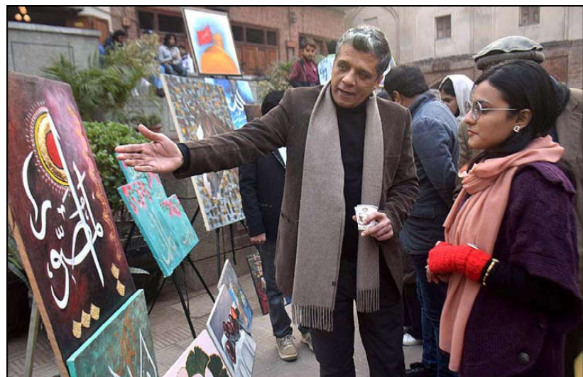
LAHORE: Visitors viewing paintings during Painting and Calligraphy Exhibition in collaboration with Formanite School System and Walled City Authority.