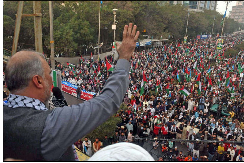
KARACHI: Leader of Jamaat-e-Islami Hafiz Naeem ur Rehman addressing during demonstration against Israeli airstrikes on Gaza, to show solidarity with Palestinian people, in Provincial Capital.