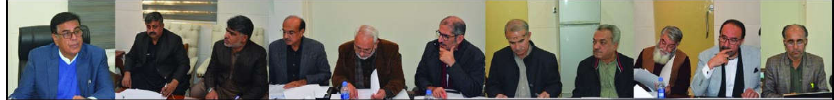
QUETTA: Secretary Communication & Works Qambar Dashti presiding over a meeting to review progress on ongoing development projects.