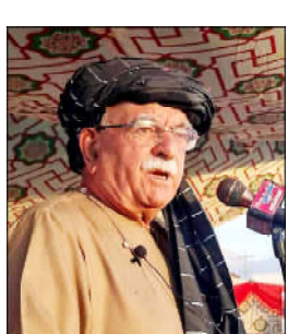
Pashtoons to make their both ends meet despite their land is rich in the natural resources.

He said that the Pashtoons nation and its land is rich in natural resources, but despite this, the people are forced to live miserable life. It has become difficult for the