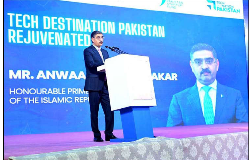
ISLAMABAD: Caretaker Prime Minister Anwaar-ul-Haq Kakar addresses the Tech Destination Pakistan Ceremony.