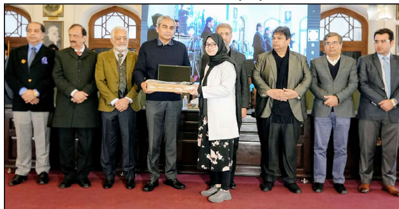
LAHORE: Caretaker Chief Minister Sindh Mohsin Naqvi distributing laptops amongst the students of King Edwards Medical College.

The CM stated that the snorkels imported from Indonesia are state-of-the-art firefighting machines. Despite not being the required number of fire engines that cities like Karachi and others need, the snorkels are a step towards building more efficient firefighting departments that are well-equipped to handle fire incidents.