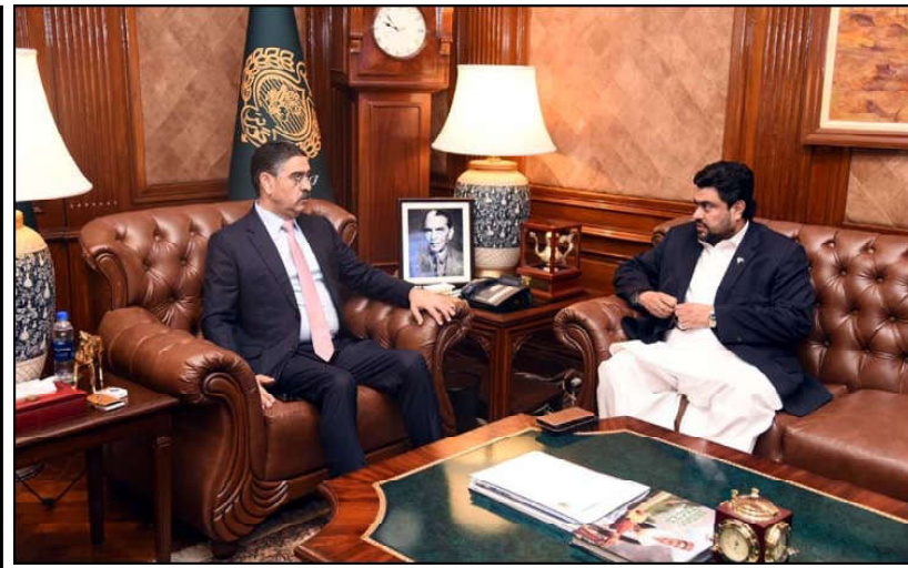
KARACHI: Caretaker Prime Minister Anwaar-ul-Haq Kakar in meeting with Sindh Governor Kamran Khan Tessori.

Cases under the Anti-Narcotics Act have been registered against the arrested accused and further investigations are under process.