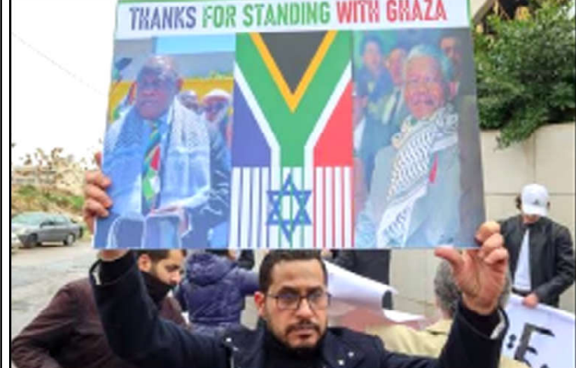
A demonstrator holds a sign during a protest as judges at The International Court of Justice (ICJ) in the Hague, hear a request for emergency measures to order Israel to stop its military actions in Gaza, in Amman Jordan.

The UN body's director general, Tedros Adhanom Ghebreyesus, said it was the sixth mission to northern Gaza cancelled by the UN agency because requests to visit had not been approved or assurances over security provided since its last visit, on Dec 26. "Intense bombardment, restrictions on movement, fuel shortage and interrupted communications make it impossible for WHO and our partners to reach those in need," he told a virtual press conference from Geneva.