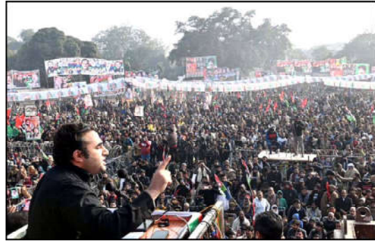
FAISALABAD: Peoples Party (PPP) Chairman, Bilawal Bhutto Zardari addresses to his supporters during public gathering meeting held at Hockey Stadium Tandlianwala in Faisalabad.

The Governor said that the constitution of Pakistan guarantees equal rights, freedom of religion and expression to all citizens of the country including all religious minorities.