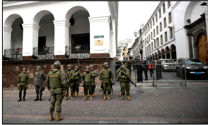
Security forces stand guard as members of the diplomatic corps arrive at Carondelet Palace in Quito for a meeting.

Israeli reoccupation in the Gaza Strip appealed for the uprooted residents to be allowed to return to their homes as the Arab countries' leaders met Abbas.