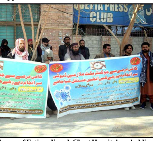
QUETTA: Contract employees of Fatima Jinnah Chest Hospital are holding protest demonstration for acceptance of their demands, at Quetta press club.

Continued from page 1 never compromised on democratic norms. He said the PPP had already introduced Benazir Income Support Programme (BISP) for downtrodden segments of society. After coming to power, the PPP would also introduce Benazir Kisan Card, Benazir Mazdoor Card and Benazir Youth Card, in addition to initiating free medical treatment, free education, free electricity up to 300 units, Waseela-e-Haq, Waseela-e-Rozgar and other programmes. He also announced establishment of a university in Tandlianwala if his party was voted to power, along with giving proprietary rights to people living in Kutchi Abadis and construction of 3 million houses. He said after floods, the PPP launched a programme for 300,000 houses along with their proprietary rights in Sindh and such programs would also be launched in Punjab after winning the general election. He asked the female workers of PPP to go door to door and convince people, especially the youth, to cast their vote in favor of the PPP.