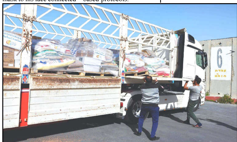
Truck drivers refasten a humanitarian aid cargo after inspection by Israeli security upon arriving from Egypt on the Israeli side of the Kerem Shalom border crossing.

to a cylinder of nitrogen in a tented to deprive him of oxygen.