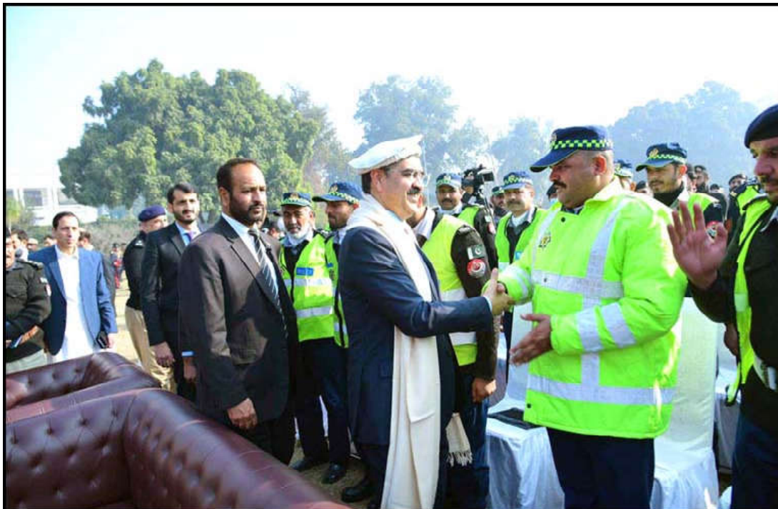
PESHAWAR: Caretaker Prime Minister Anwaar-ul-Haq Kakar interacts with KP Police officials after the Police Darbar Ceremony.