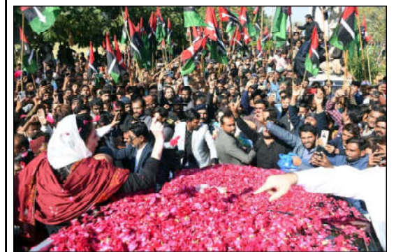
HYDERABAD: Peoples Party (PPP) Leader, Aseefa Bhutto Zardari being welcomed by party workers upon her arrival in Hyderabad.

While introducing technical education and skills training courses in general educational institutions, the Technical Education and Vocational Training Authority (TEVTA) has been assigned the task of conducting a feasibility study about identification of suitable institutions for the purpose, he added.