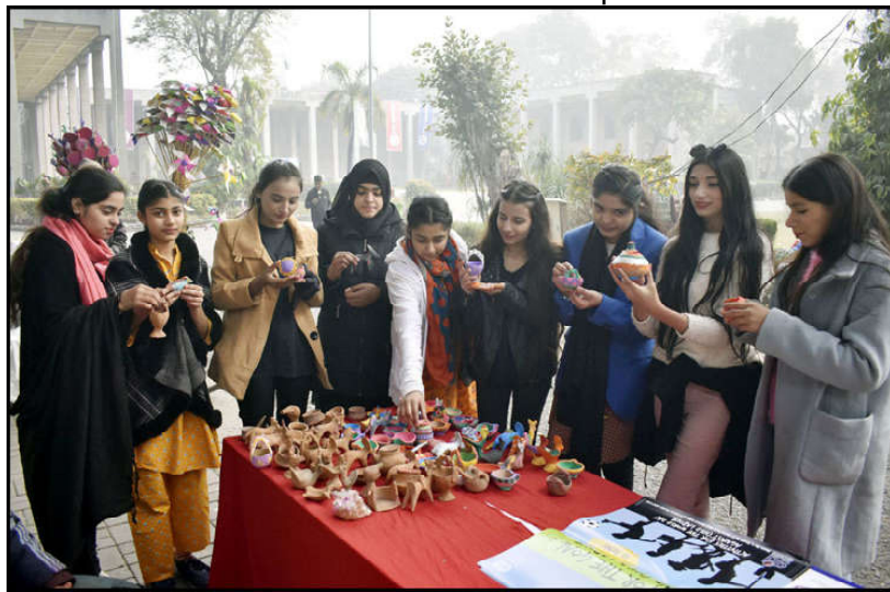
LAHORE: Visitors are taking interest in different kind of traditional stuff on stalls during "Gusy Fair" at Children Library in Provincial Capital.

ISLAMABAD (APP): Chief Election Commissioner (CEC) Sikandar Sultan Raja and members of the Election Commission on Wednesday conveyed profound sadness and grief regarding the tragic demise of four Election Commission employees due to a gas leakage incident in Kashmir. According to the Election Commission spokesperson, four employees, including an election officer, two data entry operators, and a sub-assistant, tragically lost their lives in Kashmir due to a gas leakage incident. In his message, Chief Election Commissioner (CEC) expressed deep condolences.