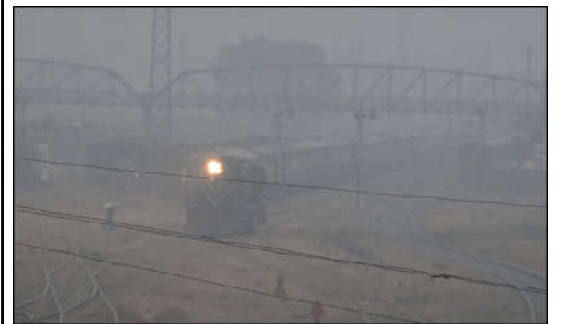
RAWALPINDI: A view of the dense foggy weather early in the morning at City.