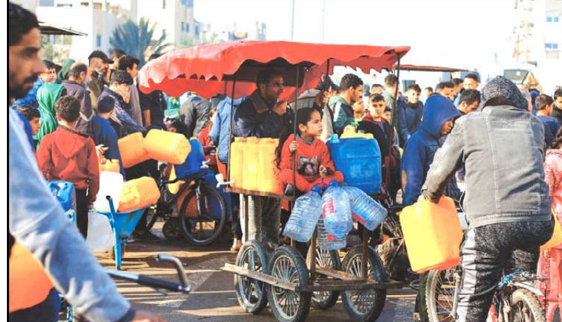
RAFAH: Palestinian children wait to collect drinking water amid shortages, in southern Gaza.

Monitoring Desk DAVOS: Misinformation and disinformation driven by artificial intelligence ahead of elections in major economies are the biggest global risks this year and next, the World Economic Forum (WEF) warned on Wednesday. The organisation's Global Risks Report 2024, released ahead of its annual meeting of political and business elites in Davos next week, also warns of the threats posed by climate change, the cost-of-living crisis and war. "Misinformation and disinformation are biggest short-term risks, while extreme weather and critical change to Earth systems are greatest long-term concern," the report said. "Concerns over a persistent cost-of-living crisis and the intertwined risks of AI-driven misinformation and disinformation."