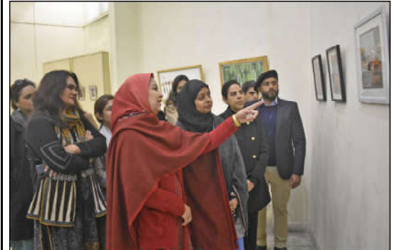
LAHORE: Visitors and staff are taking interest in the pictures during exhibition at Lahore College for Women University regarding the oppression on Palestinian people.