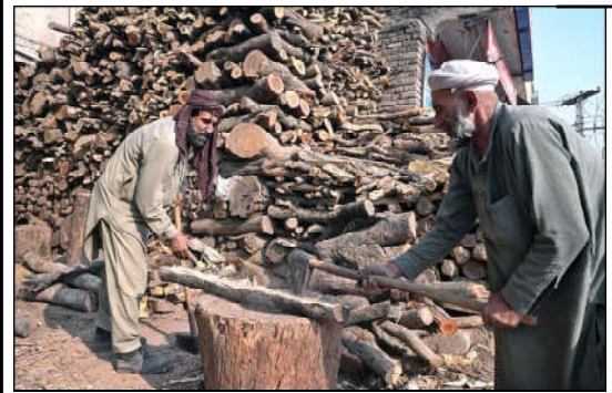
ISLAMABAD: Laborers cutting wood in pieces for selling purpose at his workplace in the Federal Capital.

To another question, she said that the European Union was the largest destination for Pakistani exports where the business community diversifies their exports to the EU to take maximum advantage of the EU's GSP Plus scheme for Pakistan which has recently been rolled.