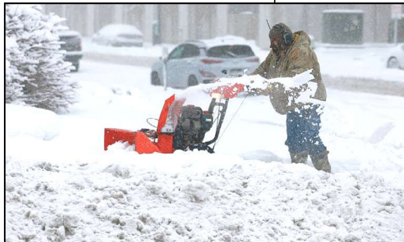
DES MOINES: A person uses a snow blower to clear a sidewalk after a snowstorm dumped several inches of snow on the US state of Iowa.

parts of the eastern half of the country. The current storm is blanketing an area from Minnesota in the north to Alabama in the south and from Kansas in the west to North Carolina in the east, according to AccuWeather.com. It is moving toward the US East Coast and the Northeast. The storm is coming ahead of what will likely be the most frigid weather in over a year since the December 2022 storm blanketed much of the eastern half of the country, according to data from financial firm LSEG. LSEG projected that natural gas demand, used to heat about half the homes in the country, would reach a daily record of 169.2 billion cubic feet per day (bcfd) on Monday, Jan 15. That is Martin Luther King Jr. Day and the record gas use, which includes exports, is expected even though many businesses and government offices will be closed for a long US holiday this weekend.