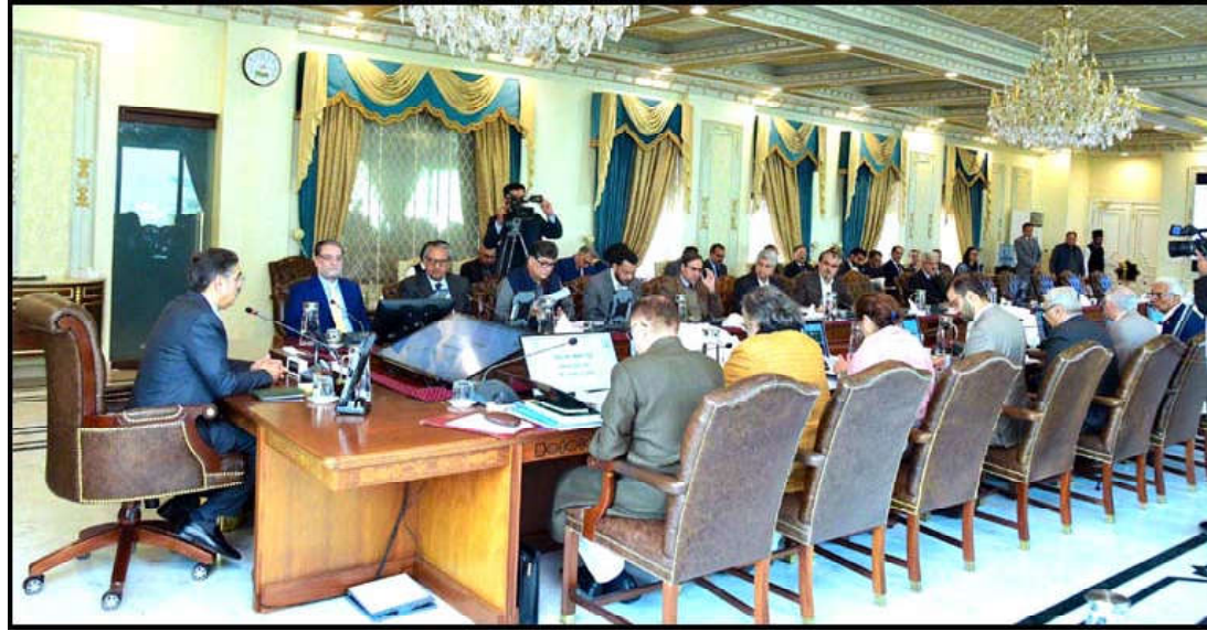
ISLAMABAD: Caretaker Prime Minister Anwaar-ul-Haq Kakar chairs a meeting of the Caretaker Federal Cabinet.

Ph: 2841470/2841473 REG: No. BC-116 B/ID-445 Vt XXV No 142, Jamadi-us-Sani 28, 1445 AH Thursday January 11, 2024 Pages 08, Price Rs.15