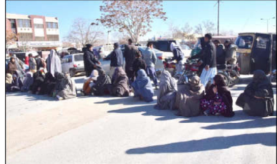
QUETTA: Women residents of Marriabad staging a sit-in against non-provision of gas in front of SSGC office.