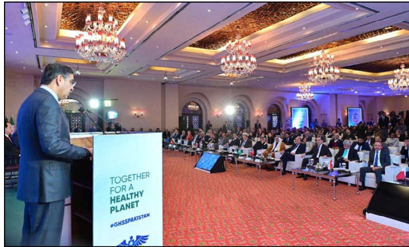
ISLAMABAD: Caretaker Prime Minister Anwaar-ul-Haq Kakar addresses the Global Health Security Summit.

due to pending dues of 281 billion rupees. The matter, now approved by the board, will be presented to the Privatization Committee of the Cabinet before reaching the caretaker federal cabinet. The advisory report, currently incomplete, lacks the valuation of PIA's assets, with a deadline set for the third week of January. Financial advisers recommend granting the new buyer the option to terminate employees after one year, with proposals to extend this period to three years. Additionally, it is suggested to consolidate non-core assets and liabilities in a holding company, making the federal government responsible for debt and interest payments. Financial advisers propose transferring 640 billion rupees to the new holding company.