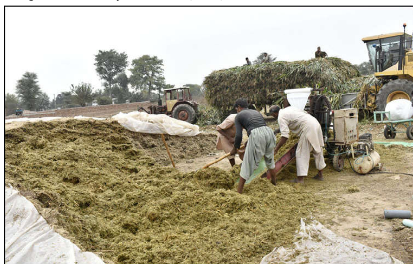
LAHORE: Workers busy packing sacks of animal fodder.

government after 10 years has launched a comprehensive desilting drive throughout the province to clean 17000km canals in the first phase, he said while talking to a PTV news channel. "The first phase of the project could have been implemented efficiently last year".