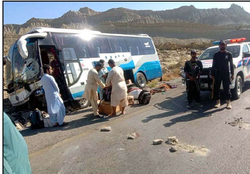
HUB: View of site after traffic accident due to over speeding and break failed, at Uthal.

He said the officials sacrificed their lives for the safety of future genera-