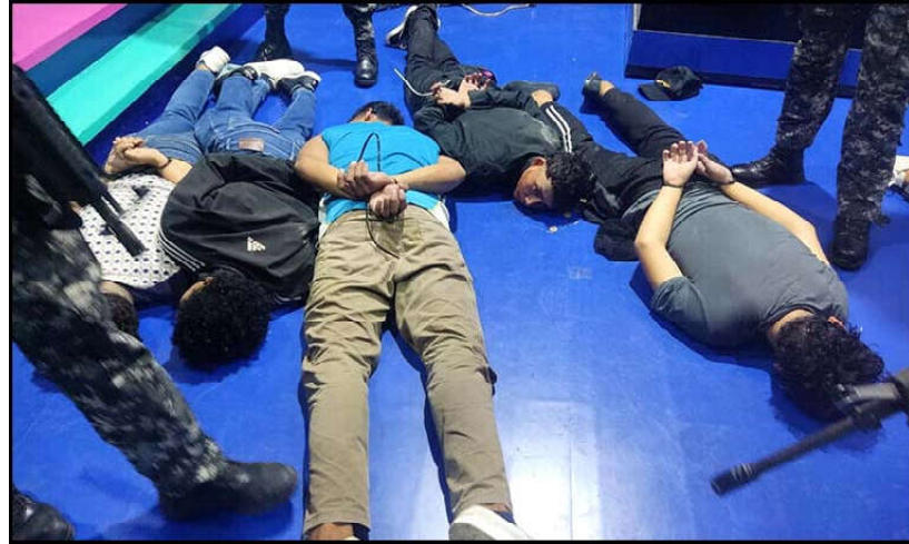
People accused of invading and taking over television station TC with weapons and forcing staff to lie and sit down, lie handcuffed on the floor in Guayaquil, Ecuador.

missile from Huthi-controlled areas of Yemen into the Southern Red Sea," the US Central Command (CENTCOM) said in a statement. The drones and missiles were downed by a combination of F/A-18 warplanes operating from the USS Dwight D. Eisenhower aircraft carrier and one British and three American destroyers, CENTCOM said, adding that there were no injuries or damage reported. The United States set up a multinational naval task force last month to protect Red Sea shipping from Huthi attacks, which are endangering a transit route that carries up to 12 percent of global trade.