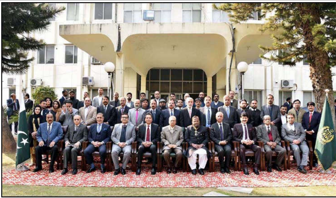
ISLAMABAD: President Dr Arif Alvi in a group photo with the officials of the Federal Tax Ombudsman (FTO) during his visit to FTO Office.

The FTO was making efforts to increase its outreach and registration.