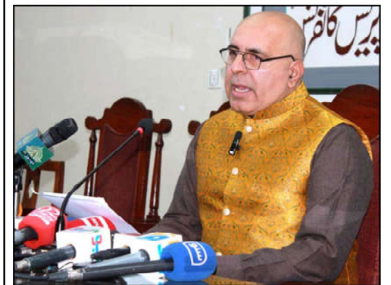
QUETTA: Balochistan Caretaker Minister for Information Jan Achakzai talking to media persons.