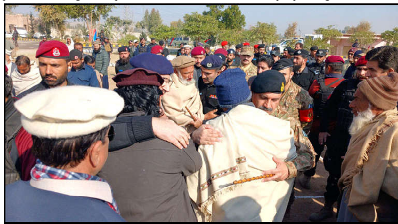
KOHAT: IG Police KPK Akhtar Hayat Khan Gandapur and other officers are greeting with relatives of Martyr policemen, killed by terrorist in Iachi check post attack.

During the exercise, PAF's newly inducted state-of-the-art J-10C fighter aircraft will flex its muscles against Eurofighter jets of Qatar Emiri Air Force in their first ever face-off in an aerial exercise.