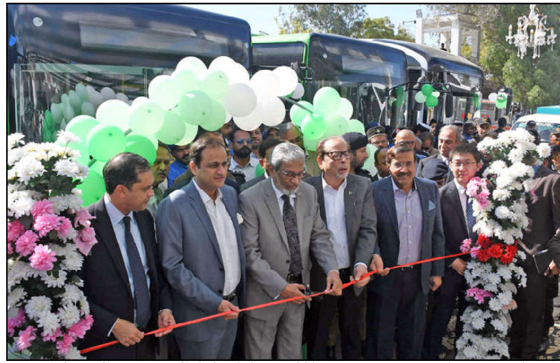
KARACHI: Caretaker Chief Minister of Sindh Maqbool Baqir cut the ribbon along with others during the launching ceremony of 30 green buses of "Peoples City Bus Project" outside Quaid Mausoleum in Provincial Capital.

The IG emphasized that the police were fully prepared to provide security for the upcoming general elections.