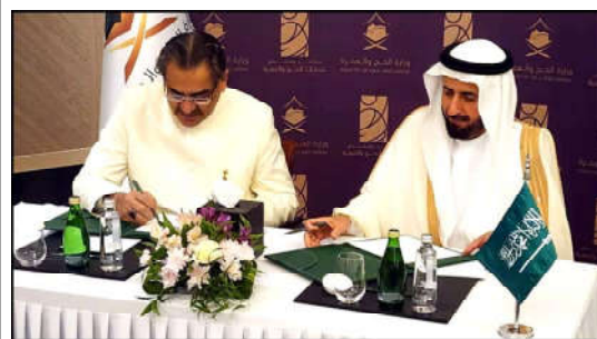
ISLAMABAD (APP): Caretaker Minister for Religious Affairs and Interfaith Harmony Aneeq Ahmed, along with Saudi Minister of Hajj and Umrah Dr. Tawfiq bin Fawzan Al-Rabiah, signed the annual Hajj agreement between Pakistan and Saudi Arabia.

According to the spokesman of the Ministry of Religious Affairs and Interfaith Harmony, Minister for Religious Affairs and Interfaith Harmony Aneeq Ahmed had unveiled the Hajj policy for 2024 in November 2023.