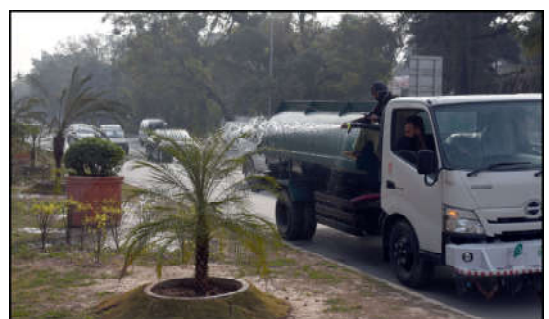
ISLAMABAD: Workers of Capital Development Authority (CDA) are watering the plant on green belt along the road side in Federal Capital.

The education team received instructions to raise awareness about traffic laws and road safety among driving learners.