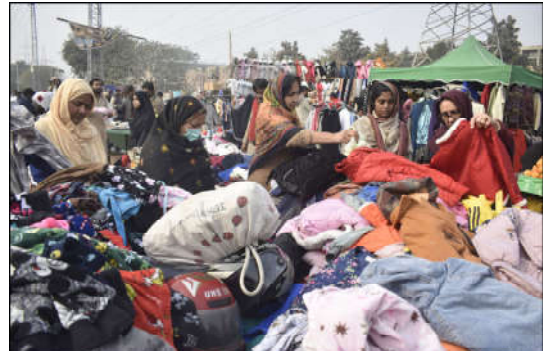
LAHORE: People are buying used stuff from flea market along the Jail road in Provincial Capital.

desire to foster amicable relations with all nations. Addressing the distress faced by the people of Occupied Jammu and Kashmir under the Indian government, Haris Nawaz urged the international community to alleviate their plight, emphasizing the imperative of resolving the Kashmir issue per United Nations resolutions. The meeting primarily delved into discussions concerning cooperation, bilateral trade, and various shared interests. Additionally, topics encompassed the expulsion of illegally residing foreigners.