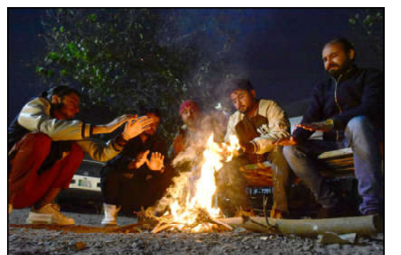
ISLAMABAD: Vendors sits around the fire along the road side to counter coldness during the extreme weather conditions of winters.

A total 357 teachers were promoted in grades 18 to 19, including 72 associate professors of FG colleges (males, females), 110 associate professors of model colleges (males, females) and 175 Vice-Principals of Islamabad Model Colleges, Schools (males, females) were also included.