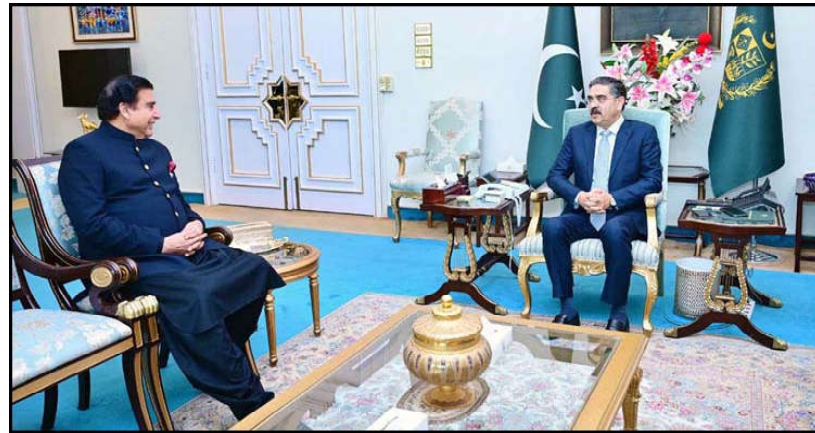
ISLAMABAD: Speaker National Assembly Raja Pervez Ashraf called on caretaker Prime Minister Anwaar-ul-Haq Kakar.