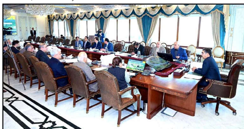
ISLAMABAD: Caretaker Prime Minister, Anwaar-ul-Haq Kakar chairs a meeting on the matters related to National Highway Authority (NHA), in Islamabad.