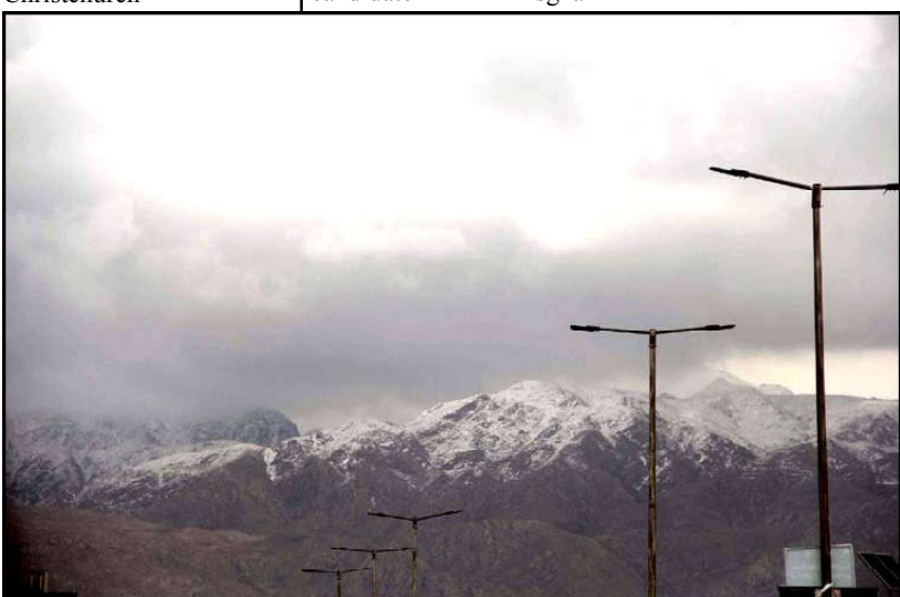
QUETTA: Beautiful eye catching view of dark clouds covered sky over the mountains during cloudy weather before downpour of winter season, captured over the horizon of Quetta.