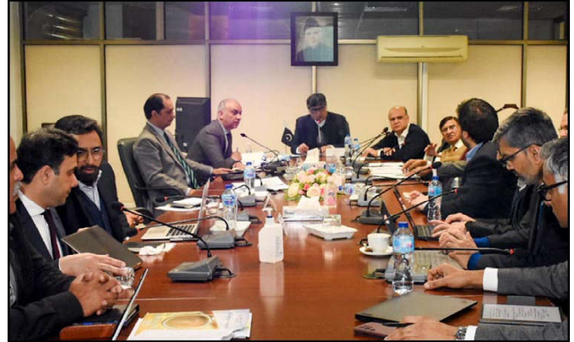
Caretaker Federal Minister for Privatisation, Mr. Fawad Hasan Fawad chaired Privatisation Commission Board meeting in Islamabad.

He further emphasized that the awareness team is continuously providing information on traffic laws and road safety to the public at various times and locations and every possible measure is being taken for the protection of life and property of the citizens. No room will be given to criminal elements to disturb public peace, and residents are urged to cooperate with the police.