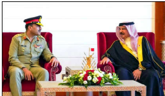
RAWALPINDI: Chief of Army Staff (COAS), General Asim Munir exchanging views with Hamad Bin Isa Bin Salman Al Khalifa, King of Bahrain during meeting held in Bahrain.