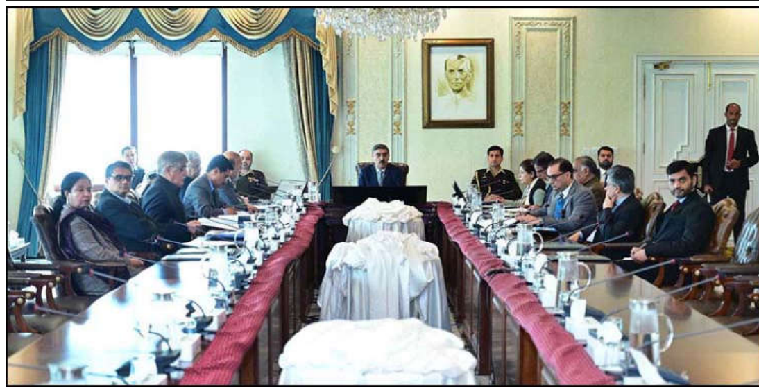
ISLAMABAD: Caretaker Prime Minister Anwaar-ul-Haq Kakar chairs a review meeting regarding Afghan Transit Trade and Anti-Smuggling operations.