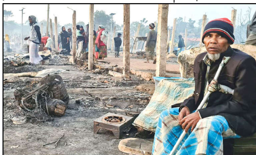
COX'S BAZAAR: A Rohingya refugee sits amid the debris of his house charred by a devastating fire at the Ukha camp.

The event marked the 46th anniversary of the killing of three neo-fascists in Via Acca Larentia, in south-east Rome. Two of the men were gunned down by suspected far-left militants while the third was killed by police after a riot broke out shortly after the shooting. No one was ever convicted over the deaths. In the video, lines of men can be seen making stiff-armed salutes and shouting "present" three times as one of their number yelled "For all fallen comrades."