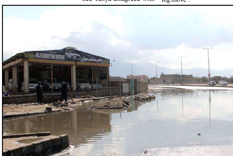
QUETTA: Inundated road by overflowing sewerage water, creating problems for residents and commuters, showing negligence of concerned authorities, at New Sabzal Road in Quetta.

King of Bahrain also conferred Military Medal Order of Bahrain First Class on COAS in recognition of his significant efforts and contributions to the enhancement of bilateral ties between the two brotherly countries.