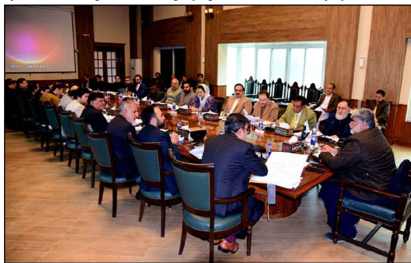
QUETTA: Caretaker Chief Minister Balochistan Mir Ali Mardan Khan Domki presiding over meeting of Provincial Cabinet

realize that it is very necessary to bring Balochistan equal to other provinces in education sector just because there is no concept of the development without education. The Governor said that it is our conscious endeavour and desire to increase the number of allocated seats for students of Balochistan in the educational institutions of other provinces. This would help provide better opportunities of higher education to our maximum students, he added.