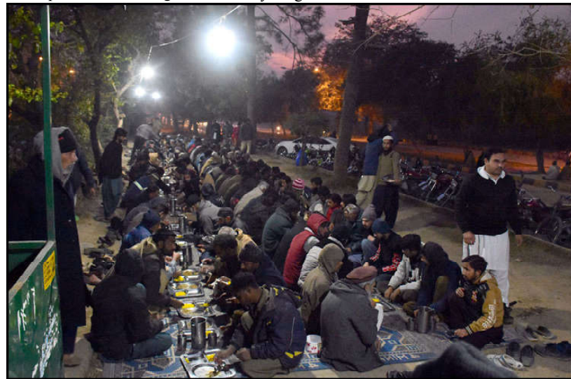
ISLAMABAD: Deserving people are eating dinner at free food distribution point at Sector G-8 as due to the extreme inflation the quantity of such deserving people are increasing day by day in Federal Capital.

According to the synoptic situation, a trough of westerly wave was present over western parts of the country and may persist in upper parts till Tuesday morning. Mainly cold and cloudy weather is expected in most of the upper parts of the country, while very cold in northern parts and north Balochistan. Dense fog/smog is likely to persist in plain areas of Punjab, Khyber Pakhtunkhwa, and upper Sindh.