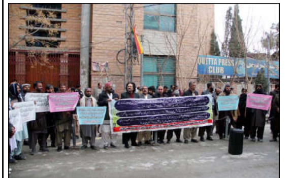
QUETTA: Members of Joint Action Committee University Teachers Officer and Employees Association are holding protest demonstration against the non-payment of their dues salaries.