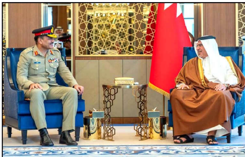
RAWALPINDI: Chief of Army Staff (COAS), General Asim Munir exchanging views with Salman Bin Hamad Al Khalifa, Crown Prince and Prime Minister of Bahrain during meeting held in Bahrain.

CJP Isa continued, "If the institution denies your allegations, then you say it is not true." To which, Khosa complained that action was being taken against the PTI people by imposing Section 144. The Chief Justice remarked: "We are not the government but the Supreme Court. We are not running anyone's campaign, Section 144 and MPO will be for everyone, not only for PTI, neither Section 144 nor MPO has been challenged before us."