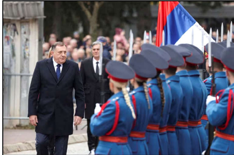
President of Republika Srpska (Serb Republic) Milorad Dodik attends Serb Republic national holiday, banned by the constitutional court, in East Sarajevo, Bosnia and Herzegovina.

top diplomat Josep Borrell was in Lebanon in a sign of international concern. "G7 countries are working with the Israeli government to find a rapid way out of the military phase," the Italian Foreign Ministry quoted minister Antonio Tajani as saying as Italy began its one-year presidency of the Group of Seven. An Israeli strike on south Lebanon on Monday killed a senior commander in Hezbollah's elite Radwan force, three security sources told Reuters, the latest in daily clashes across Israel's northern border.