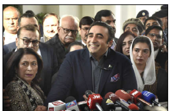
ISLAMABAD: Chairman PPP Bilawal Bhutto Zardari talking with media persons outside Supreme Court

His remarks came days after the Senate approved a non-binding resolution seeking a delay in the general elections, set to be staged next month, drawing strong criticism from mainstream political parties.