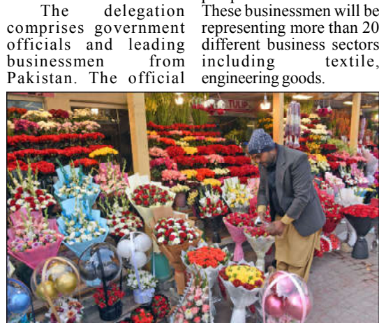
ISLAMABAD: A florist is sparing water on the flowers for preserving their freshness, F-6 Flower Market in Federal.

ISLAMABAD (APP): The Pakistani Rupee on Monday witnessed an appreciation of 11 paise against the US Dollar in the interbank trading and closed at Rs281.28 against the previous day's closing of Rs281.39. However, according to the Forex Association of Pakistan (FAP), the buying and selling rates of the Dollar in the open market stood at Rs281 and Rs283.5 respectively. The price of the Euro increased by 21 paise to close at Rs307.55 against the last day's closing of Rs307.34, according to the State Bank of Pakistan (SBP).