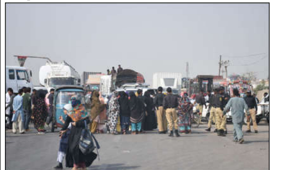
KARACHI: Motorists are facing trouble in maneuvering at maripur road due to the protest of the relatives of Baloch missing persons, in Provincial Capital.