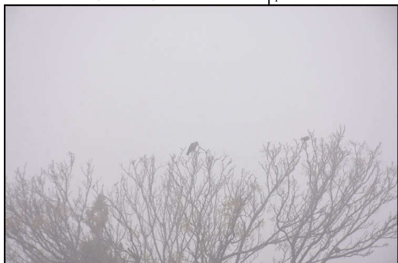
ISLAMABAD: Buildings and roads are hide to the thick blanket of Fog as such weather will be reassumes till the rainy spell in Federal Capital.

ware. However, a data hub was established in a short span of time of three months, gathering data from all provinces and dividing it into 25 different categories and providing it to all law enforcement organizations. A survey of 4,800 private cameras was conducted, connecting them with Safe City Islamabad centralized system for monitoring plazas, metros, green and orange buses, important buildings, hotels, and motels. Additionally, important commercial centers like the I-8 Centre, F-8 Markaz, Lake View, Blue Area, Minister Enclave, Jinnah Courts, and DHA are now accessible through Safe City cameras.