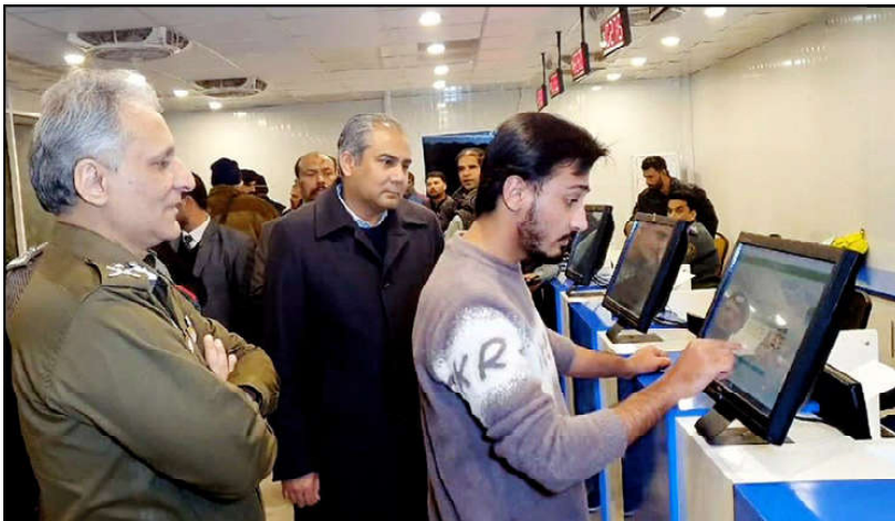
LAHORE: Caretaker Chief Minister Punjab Mohsin Naqvi along with Inspector General Police Punjab review the online test during his visit to Police Khidmat Markaz liberty.

The CM announced plans to upgrade 737 police stations, with 36 already completed. He also mentioned resolving the issue of government land.