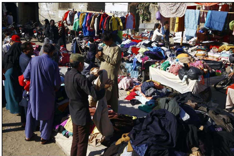
KARACHI: Warm clothes are being selling at roadside stalls as the demand of warm clothes increased in city during the winter season, at Saddar area.

The official said that work was being done on institutional reforms in CDNS and new reforms and innovations were being introduced. "At this time Automated Teller Machine (ATM) has also been introduced in CDNS which will provide enough facilities to the users," he added. Replying to a question,