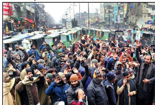
LAHORE: Members of Awami Rickshaw Union are holding protest demonstration against massive unemployment, increasing price of daily use products and inflation price hiking, at Lahore press club.