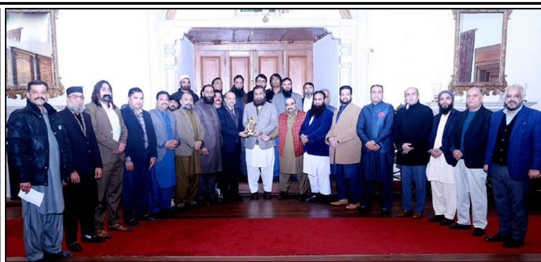
LAHORE: Punjab Governor Muhammad Baligh-ur-Rehman in a group photo with delegation of Anjuman-e-Tajiran led by Waqar Ahmad Mian.

Earlier to this, over Rs 69.5 billion over-invoicing was unearthed in the import of solar panels during 2017-2022.