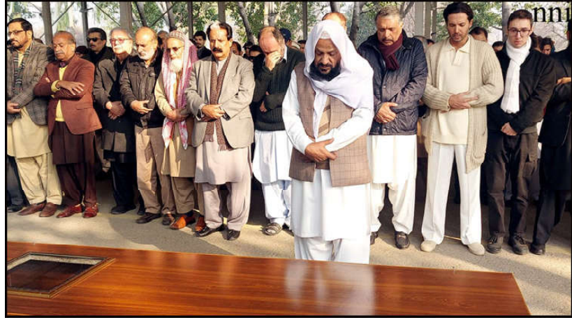
ISLAMABAD: A view of funeral prayers of Former Federal Minister Sartaj Aziz at H-8 grave yield.

he added. He also expressed hope that IT exports will increase to $4 billion after the State Bank of Pakistan allowed the IT companies to retain 50% of their receipts in dollar accounts. "We wanted to empower the youth of the country with info-tech skills and that it was making all-out efforts for the purpose", he added. "IT and Telecom is working on all those projects that will create employment opportunities in the country for youngsters in the future," he mentioned. The ministry is trying its best to move Pakistan forward in the field of education through the provision of IT skills and empowering skilled manpower in IT industries, he said.