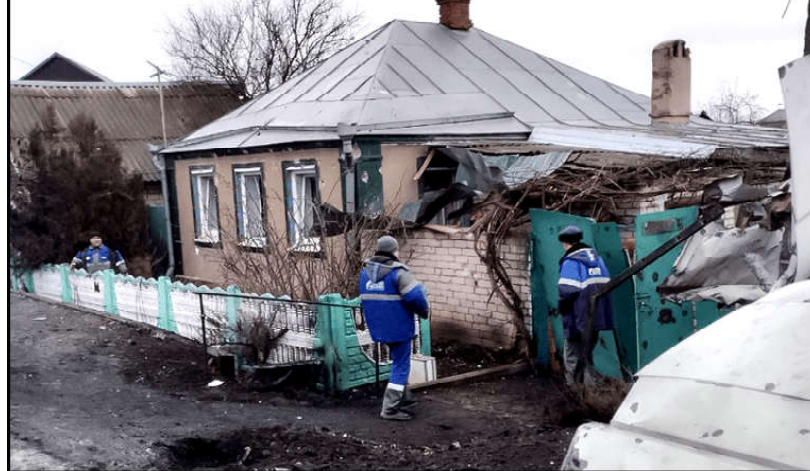
Governor of the Belgorod region, shows aftermath of a missile strike on the region as Moscow said it had downed nine missiles fired by Kyiv.

Monitoring Desk SEOUL: South Korea's opposition Democratic Party leader Lee Jae-myung remained hospitalised in intensive care on Wednesday, a day after a knife attack on him shocked political leaders who were vying for the upper hand in a major election three months away. Surgeons operated on Lee for more than two hours late on Wednesday to repair a major blood vessel in his neck that was sliced when an assailant lunged.