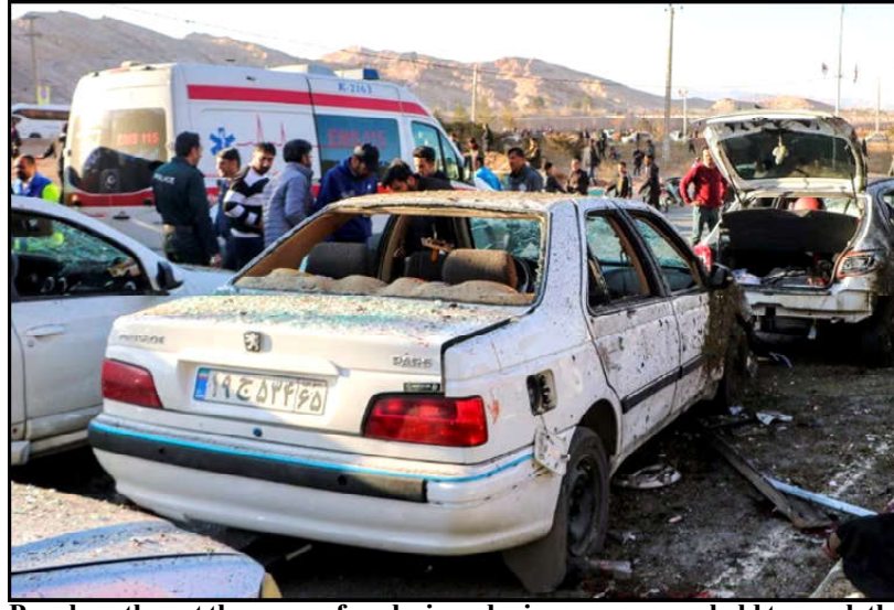
People gather at the scene of explosions during a ceremony held to mark the death of late Iranian General Qassem Soleimani, in Kerman, Iran.