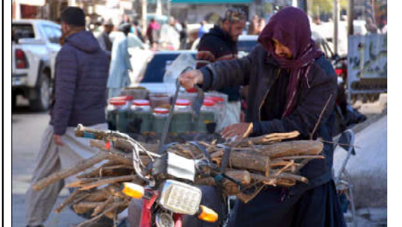
QUETTA: A man tie dry woods on his motorbike before going home for domestic use.