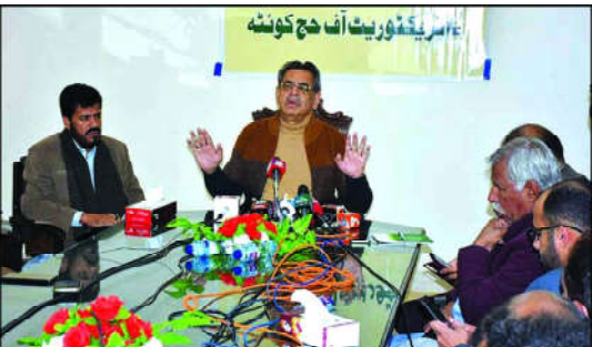
QUETTA: Caretaker Federal Minister for Religious Affairs and Interfaith Harmony Aneeq Ahmed talking to media persons after visiting Hajji Camp.