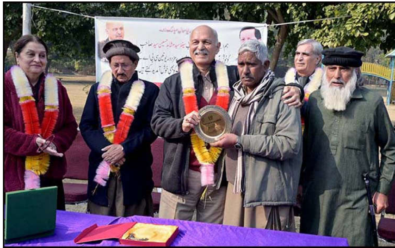
ISLAMABAD: Chairman Parliamentary Committee on China-Pakistan Economic Corridor (CPEC), Senator Mushahid Hussain Sayed presenting a shield to CDA sanitation workers during the farewell party at E-7 Park.

ISLAMABAD (Online): Supreme Court (SC) has dismissed the bail plea of the accused arrested in tax fraud being the plea withdrawn. Chief Justice of Pakistan (CJP) Qazi Faez Isa has remarked white collar crime is not an ordinary crime. A 3-member bench of SC presided over by the CJP Qazi Faez Isa heard the bail after arrest plea filed by the accused Anmar Rafiq Wednesday. The CJP remarked white collar crime is not an ordinary crime. White collar crime causes enormous loss to the country. Such a big claim was made on fake invoices. The CJP inquired how can one push money forcibly in some one's else account. This is not ordinary crime. On what basis we should grant bail to the accused. Justice Muhammad Ali Mazhar remarked this is fraud of billion of rupees.