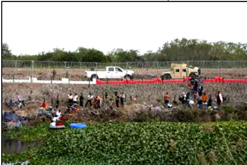
People wait behind concertina wire and newly installed barriers to turn themselves to the U.S. border authorities in Brownsville, Texas, as seen from Matamoros, Mexico.