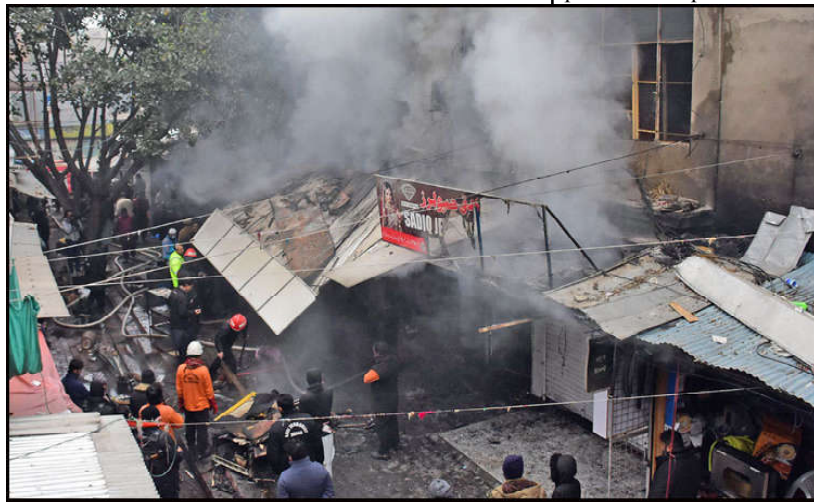
ISLAMABAD: Rescue workers are busy in fire extinguishing as fire broke out at Aabpara market due to short circuit in Federal Capital.

ISLAMABAD (INP): The federal capital Islamabad and its neighbouring regions experienced a sudden jolt today as earthquake tremors sent shockwaves across the landscape, causing panic among residents. According to the private news channel, the seismic activity was also felt in Rawalpindi, Attock, and Chakwal. The seismological centre said that the magnitude of the earthquake was 4.9 on the Richter scale, the depth of the earthquake was 137 kilometres underground, the epicentre was the Afghanistan-Tajikistan border, and the tremors were felt at 2:24 p.m. No loss of life or property was reported from any part of the capital.