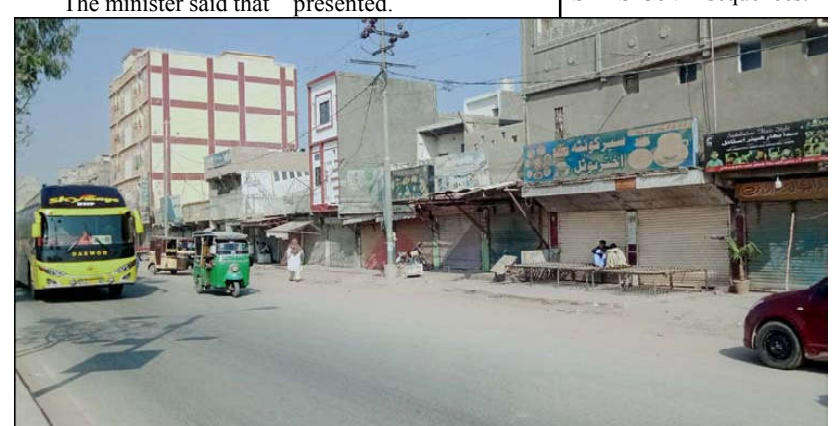
HUB: View of business activities seen closed while markets gives desert look during the shutter down strike called by Baloch Yakjehti Committee against Baloch people genocide, extrajudicial killings, and enforced disappearances