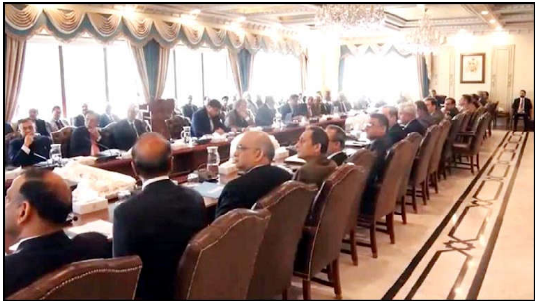
ISLAMABAD: Caretaker Prime Minister Anwaar-ul-Haq Kakar chairs a meeting of 8th meeting of Apex Committee of Special Investment Facilitation Council.