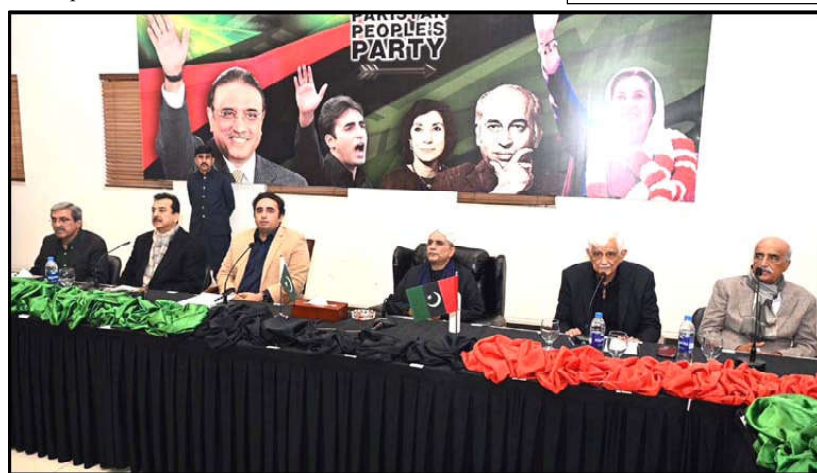
LAHORE: Peoples Party (PPP) Co-Chairman, Asif Ali Zardari and PPP Chairman, Bilawal Bhutto Zardari preside over Central Executive Committee (CEC) meeting of the party held at Bilawal House in Lahore.