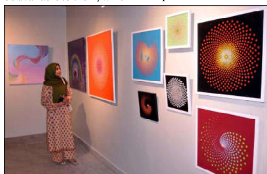
HYDERABAD: Visitors take keen interest in paintings during the 18th Degree Show (Annual Thesis Display/Exhibition) held at Shaheed Allah Bukh Soomro (SABS) University of Art, Design and Heritages in Jamshoro.