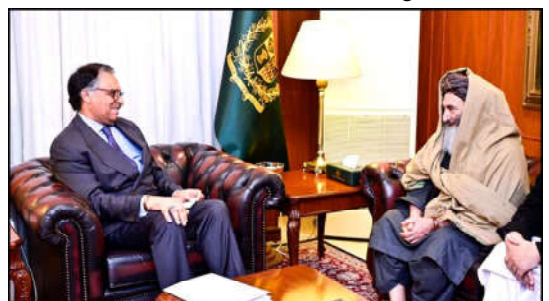
ISLAMABAD: Kandahar Governor Mullah Shirin in a meeting with Caretaker Foreign Minister Jalil Abbas Jilani during his visit to Islamabad.

Chaired jointly by Asif Zardari and Bilawal Bhutto, the meeting addressed pivotal issues such as the upcoming general elections, the party's election campaign, and the formulation of the party man-