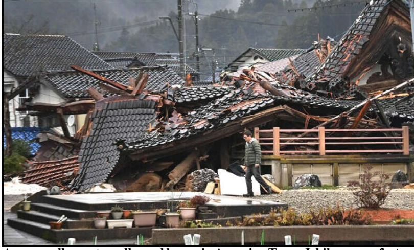
A man walks past a collapsed house in Anamizu Town, Ishikawa prefecture after a major 7.5 magnitude earthquake struck the Noto region in Ishikawa prefecture on New Year's Day.

man Daniel Hagari did not directly comment on the killing, but said afterwards that the military was in "very high state of readiness in all arenas, in defence and offence. We are highly prepared for any scenario." Israel has previously announced the deaths in Gaza of Hamas commanders and officials during the war, but Aruri is the most high-profile figure to be killed, and his death came in the first strike on the Lebanese capital since hostilities began. The strike adds to widespread fears that the nearly three-month-old Israel-Hamas war could become a wider regional conflagration.