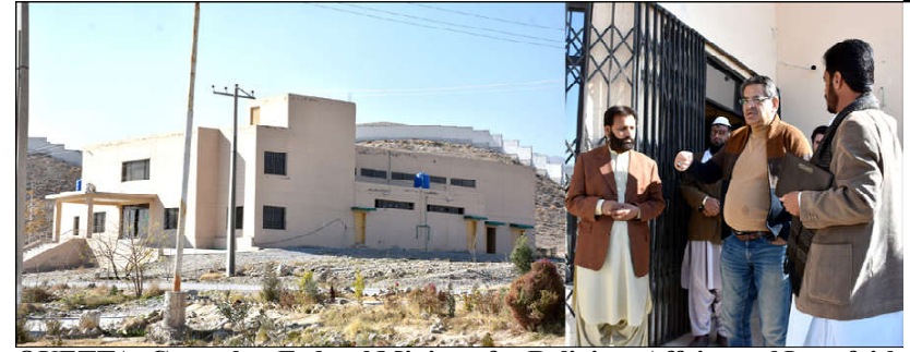
QUETTA: Caretaker Federal Minister for Religious Affairs and Interfaith Harmony Aneeq Ahmed inspecting building of Haji Camp