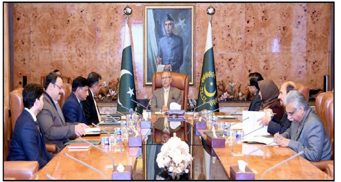
ISLAMABAD: President, Dr. Arif Alvi being briefed about the role and performance of National Book Foundation held at Aiwan-e-Sadr.

hard all the paths to there are blocked," Fallah said. The US assassination of Soleimani in a drone attack at Baghdad airport and Tehran's retaliation by attacking two Iraq military bases that house US troops brought the United States and Iran close to full-blown conflict in 2020. As chief commander of the elite Quds force, the overseas arm of Iran's Revolutionary Guard Corps (IRGC), Soleimani ran clandestine operations in foreign countries and was a key figure in Iran's longstanding campaign to drive US forces out of the Middle East.