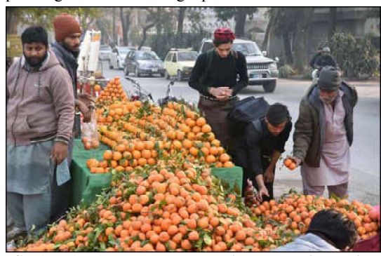
ISLAMABAD: Vendors selling and displaying oranges at roadside setup near G-9.

A small and medium enterprises policy, with orientation of Information and Communication Technology (ICT) that underscores importance of technology in creating value within businesses is essential for fostering economic growth. He said despite Pakistan's aspirations to become a digital economy, its existing digital infrastructure requires significant improvements to fully realize its potential.