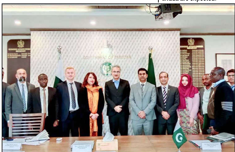
ISLAMABAD: Ministry of Economic Affairs Hosts Successful Meeting with International Delegation for 119th Advance Railway Course under PTAP Initiative.

Meanwhile four more ships, Maersk Kensington, Rich Rainbow, FSM and Limra also arrived at outer-anchorage of the Port Qasim during last 24 hours to load/unload Containers, Palm oil and LPGs respectively. A total of ten ships were engaged at POA berths during the last 24 hours, out of them two ships, Ullswater and Sunray are left the port on today morning and three more ships, MSC Jemima, Leila Confidence and Al-Bidda are expected.