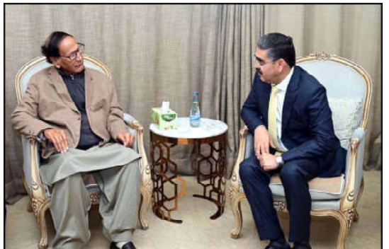
LAHORE: Caretaker Prime Minister Anwaar-ul-Haq Kakar meets with the President of Pakistan Muslim League (Q).

He said: "We want the conduct of the general elections in a peaceful way. There can be political differences, but there is no chance of personal differences."