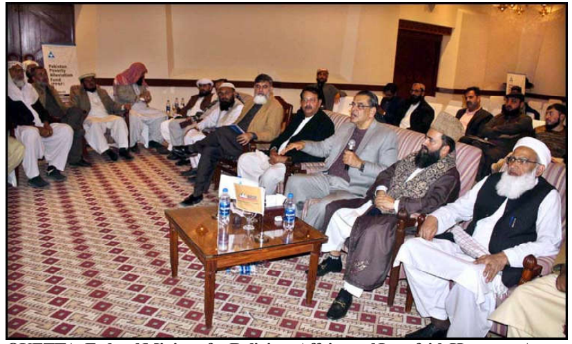
QUETTA: Federal Minister for Religious Affairs and Interfaith Harmony Aneeq Ahmed chairing a meeting with Religious Scholars of various religions.

Aftab Ahmad Khan Sherpao said that experiments with the political system caused colossal loss to the economy therefore such practices should be stopped. He said the Imran Khan experiment caused economic stagnation, inflation and political instability. "What service was done to the country by bringing him to power?" he asked.