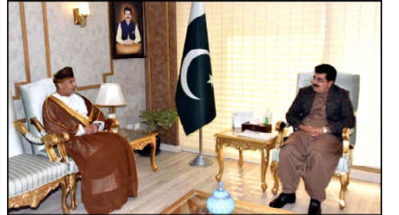
ISLAMABAD: Chairman Senate, Muhammad Sadiq Sanjrani exchanging views with Fahad Sulaiman Khalf Alkharusi, Ambassador of Sultanate of Oman during meeting held at Parliament House in Islamabad.