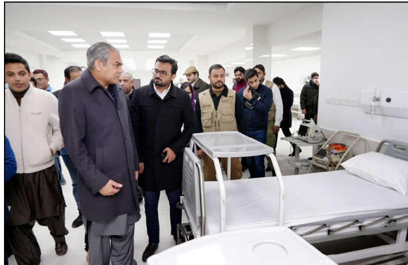
LAHORE: Caretaker Chief Minister Punjab Mohsin Naqvi inspecting the quality of new beds in upgraded Emergency Unit at Punjab Institute of Cardiology.

definitive goal of providing training to at least five hundred thousand youth, ultimately facilitating their employment. He emphasized the clear roadmap established for the welfare of the youth, which will also serve as a helpful guide for the incoming government. As part of the programme, initially, over 0.1 million young individuals will undergo various courses, including IT, in addition to other fields. During the ceremony, agreements and memorandum of understanding were signed between various departments and institutions to facilitate the program's objectives.