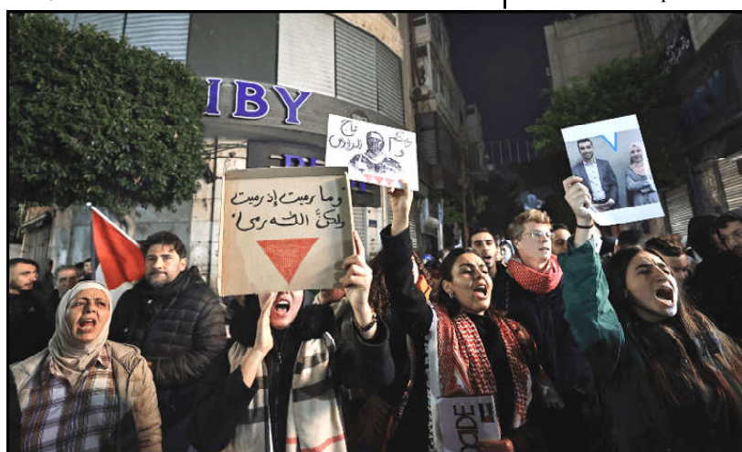
Palestinians protest in solidarity with Gaza in Ramallah, in the occupied West Bank.

"The motherland will eventually be reunified, and it will inevitably be reunified," Song said in his New Year's message on his office's website. This is the common desire and common mission of people on both sides of the Taiwan Strait, Song added.