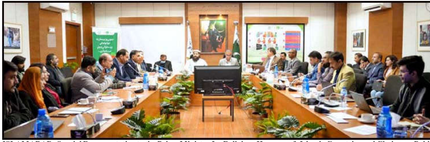
ISLAMABAD: Special Representative to the Prime Minister for Religious Harmony & Islamic Countries and Chairman Pakistan Ulema Council, Hafiz Tahir Mahmood Ashrafi is being briefed while visiting National Emergency Operations Centre.