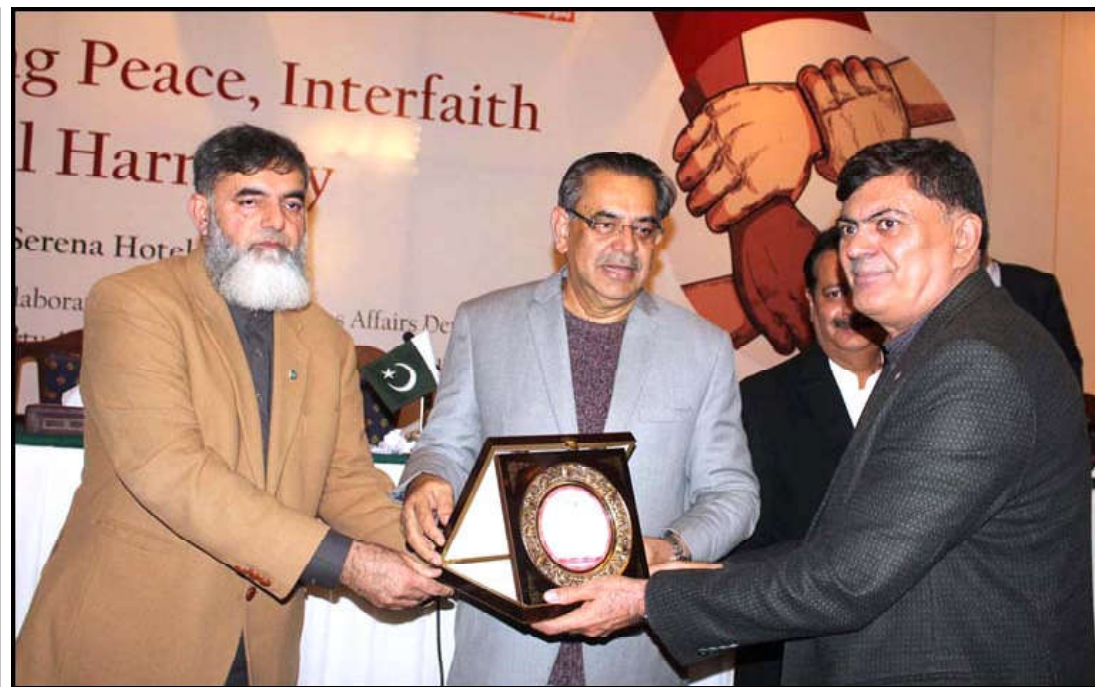
QUETTA: Federal Minister for Religious Affairs and Interfaith Harmony Aneeq Ahmed distributing shields and awards among the participants of seminar.

Complaints can be sent through fax or email, and promptly addressed by trained personnel. The control room stays in touch with relevant Returning Officers (ROs) and District Returning Officers (DROs), urging individuals to use the helpline via complaints@ecp.gov.pk or WhatsApp at 0327-5050610. Another helpline at 111-327-000 operates from 8 am to 6 pm for complainants' convenience.