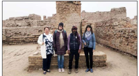
MOHENJO DARO: A tourist delegation from Hungary are visiting and expressed keen interest in the historical ruins of the World Heritage Monuments of Mohenjo Daro during foggy weather of winter season, in Mohenjo Daro.