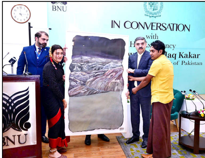
LAHORE: Students of BNU present Caretaker Prime Minister Anwaar-ul-Haq Kakar with a painting as a souvenir.