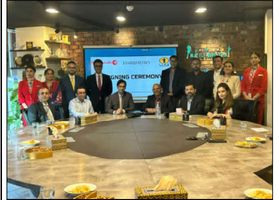
confirm their bookings by completing the payment process, offering unmatched flexibility and convenience.

transaction. At the core of this partnership is a dedication to providing Fly Jinnah customers with a seamless booking experience. What sets this partnership apart is the array of payment channels available to