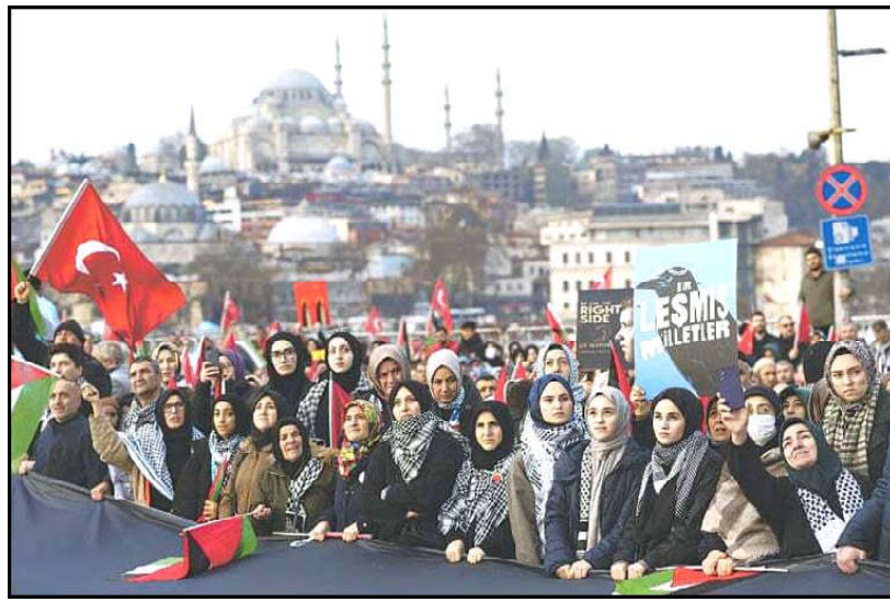
ISTANBUL: Tens of thousands of people demonstrate to show solidarity with the Palestinian people amid the Gaza crisis, at the Galata Bridge.

On New Year's Eve, the Chinese leader exchanged greetings with Russian President Vladimir Putin as well.