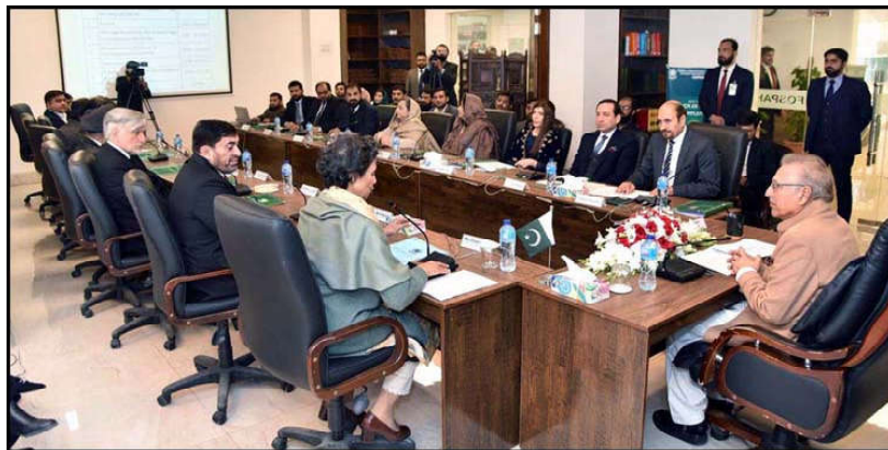
ISLAMABAD: President Dr Arif Alvi chairing a meeting during his visit to the Federal Ombudsman Secretariat for Protection Against Harassment at Workplace (FOSPAH) Head Office.

while the rest had been decided. The President called for taking appropriate legislative measures at the federal and provincial levels to ensure the protection of women's property rights, besides discouraging the transfer of property by women to their family members due to pressures. He said that he was conducting personal hearings of the Ombudspersons' cases to expedite the process of justice. He stated that highlighting important decisions of FOSPAH in harassment and women's property cases through media would help increase awareness about the role of the Ombudsman. He said that police at the local level needed to improve their response to women's complaints in property cases, adding that police officials should be educated about the provisions of the Enforcement of Women's Property Rights Act, 2020.