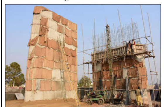
ISLAMABAD: Laborers are busy during the construction of "Yadgar-e-Dastoor" in the memorandum of the completion Golden Jubilee of Constitution of Pakistan outside Parliament House in Federal Capital.