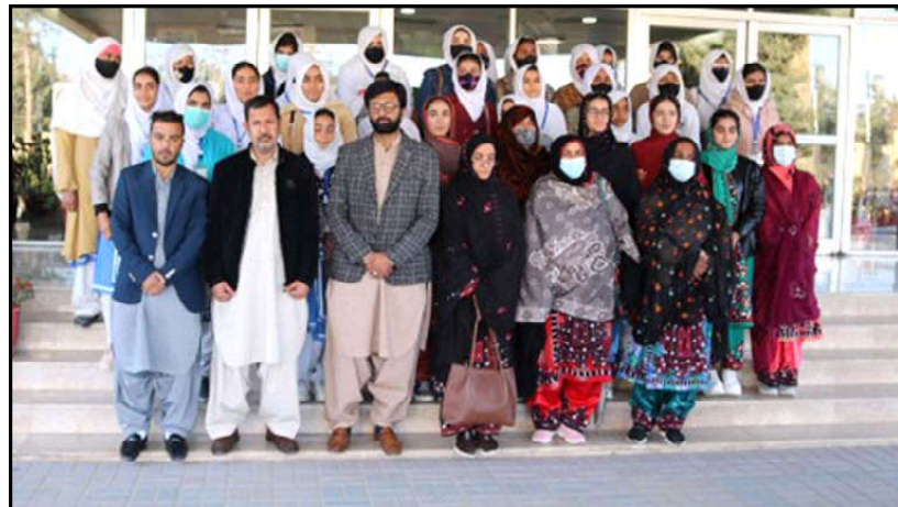
QUETTA: A group photo of student of Turbat during their visit of Balochistan Assembly