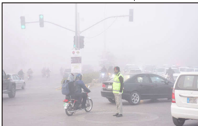
ISLAMABAD: Dense fog blanket the different areas early in the morning as an unexpected turn of weather events Pakistan is facing extreme challenges, causing disruptions in the daily lives of People.