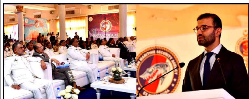
KARACHI: Caretaker Federal Minister for Climate Change, Ahmed Irfan Aslam addresses to participants during opening ceremony of the BARRACUDA XII Exercise, held at Headquarters Pakistan Maritime Security Agency (PMSA)