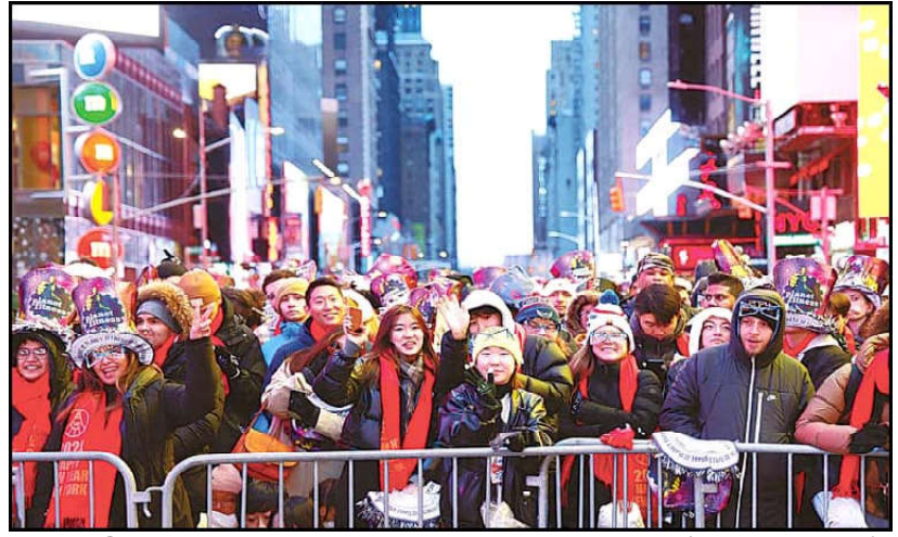
NEW YORK: Revellers get ready to celebrate the New Year's Eve Ball drop in Times Square.

"At the end of a year, have the courage to ask how many lives have been torn apart in armed conflicts, how many deaths?" the 87-year-old pontiff said.