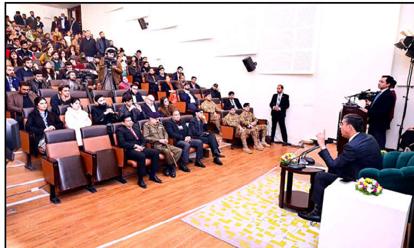
LAHORE: Caretaker Prime Minister Anwaar-ul-Haq Kakar in an interactive session with the students of Beaconhouse National University.

A sanitization operation is currently underway to eliminate any other terrorists found in the area, as the security forces of Pakistan are determined to eradicate the menace of terrorism from the country.