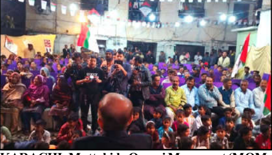
KARACHI: Muttahida Qaumi Movement (MQM-P) Senior Deputy Convener, Dr. Farooq Sattar addresses to his supporters during public gathering meeting as a part of Election Campaign in connection of the General Election 2024 coming ahead, held at Jama Clothes Market area in Karachi.

cultural objects to Pakistan, The Pak-US agreeand this agreement simpliment commits both parties fies the process. Since 2001, the United States to work together to counter looting and trafficking of government has supobjects, promote a clean market for Pakistani art and ported 35 cultural heritage preservation projects across Pakistan with more antiquities in the United than $8.4 million USD. States, and increase oppor-