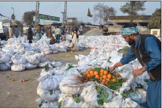
SARGODHA: Vendors displaying orange to attract the customers in front of market.

He assured that the PTA would continue to focus on improving coverage, access and quality of services to telecommunications and promote ease of doing undergoing business and attract more investment.