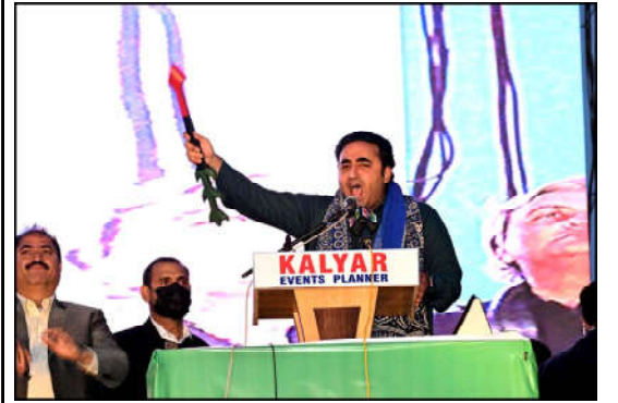
MULTAN: Peoples Party (PPP) Chairman, Bilawal Bhutto Zardari addresses to his supporters during public gathering meeting as a part of Election Campaign in connection of the General Election 2024 coming ahead, in Multan.

Bilawal also lauded the sacrifices made by the military and police to eradicate terrorism but pointed out, "The resurgence of terrorism today is a consequence of the social division sown by old politicians. It's time to bury the politics of hatred."