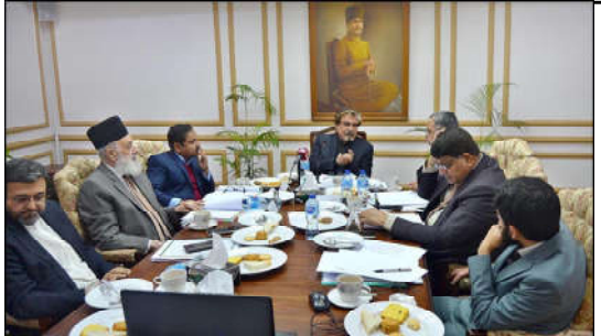
LAHORE: Caretaker Federal Minister for National Heritage and Culture Jamal Shah presiding over the Governing Body meeting of Iqbal Academy Pakistan at Aiwan-e-Iqbal.

underpasses in the city, criticising the unconventional lighting that malfunctioned on the first day. The court also stressed the urgency for water conservation and observed that there were predictions about water scarcity by 2026-2027, envisioning a future where water tankers become a common sight in Lahore. The court addressed the provincial law officer and asked what steps had been taken by the Water and Sanitation Agency for installing water meters. To which, a member of the Judicial Water and Environment Commission stated that a one-year timeline had been given for installing water meters.