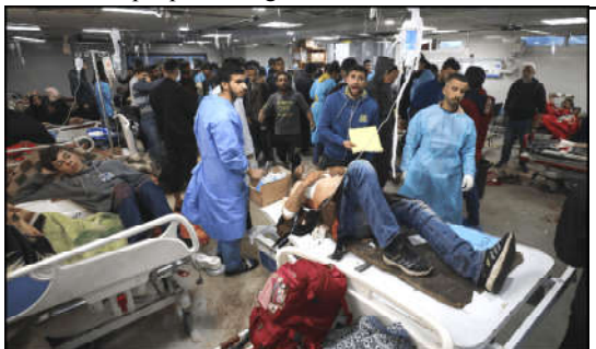
Injured people receive treatment in Gaza City's Al-Shifa hospital, following a reported Israeli strike, that according to Gaza's Health Ministry, killed at least 20 and wounded more than 150 as they waited for humanitarian aid.

other supplies in Gaza. It was not immediately known which one was operating in the area at the time of the incident. The UN refugee agency for Palestinian refugees, UNRWA, and the UN World Food Program both said they were not involved. Israeli troops and tanks pushed into Gaza City shortly after the ground invasion began in October and have been battling Palestinian militants there for nearly two months. The military says it has largely dismantled Hamas in northern Gaza but is still facing pockets of resistance, and large swaths of Gaza City and surrounding areas have been reduced to rubble by Israeli bombardment.