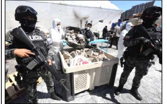
Ecuadorian authorities place drug packages in a container, as part of the more than 20 tons of seized drugs to be destroyed at an undisclosed location, in Ecuador.

Monitoring Desk ISTANBUL: Canada and Turkey have reached a deal to restart Canadian exports of drone parts in exchange for more transparency on where they are used, and it would take effect after Ankara completes its ratification of Sweden's NATO bid, two sources told Reuters. After 20 months of delay, Turkey moved swiftly this week to endorse Sweden's membership in the Western military alliance, including a parliamentary vote and presidential sign-off, leaving Hungary as the sole ally yet to ratify it. Turkey is expected to send the final documents to Washington as soon as Friday, which would clear the way for Canada to immediately lift the export controls that it adopted in 2020, the two sources said, requesting anonymity. The agreement was reached in early January after months of talks, said one person familiar with the process. A second person familiar with the plan said the sides agreed it would take effect after Sweden's ratification was complete. Turkey's foreign ministry declined to comment. Canadian Foreign Ministry spokesperson Charlotte MacLeod told Reuters that while the export controls currently remained in place, Ottawa aimed to resolve the issue with Turkey given its status as a NATO ally.