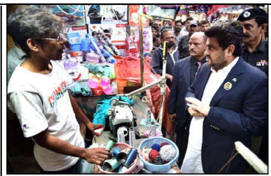
KARACHI: Governor Sindh Kamran Tessori talking with shopkeeper during his visit Shama Shopping Center and Resham Bazaar of Shah Faisal Colony.

As per sources of ministry of petroleum prices of oil have increased by 4.37 dollar per barrel in international markets during the last 12 days. The oil price has been enhanced from 77.78 per dollar to 82.15 dollar per barrel in international markets. The price of petrol is likely to scale up Rs 7 per liter and diesel Rs 5 per liter from February 01. OGRA and ministry of petroleum have started working about the prices of petroleum products.