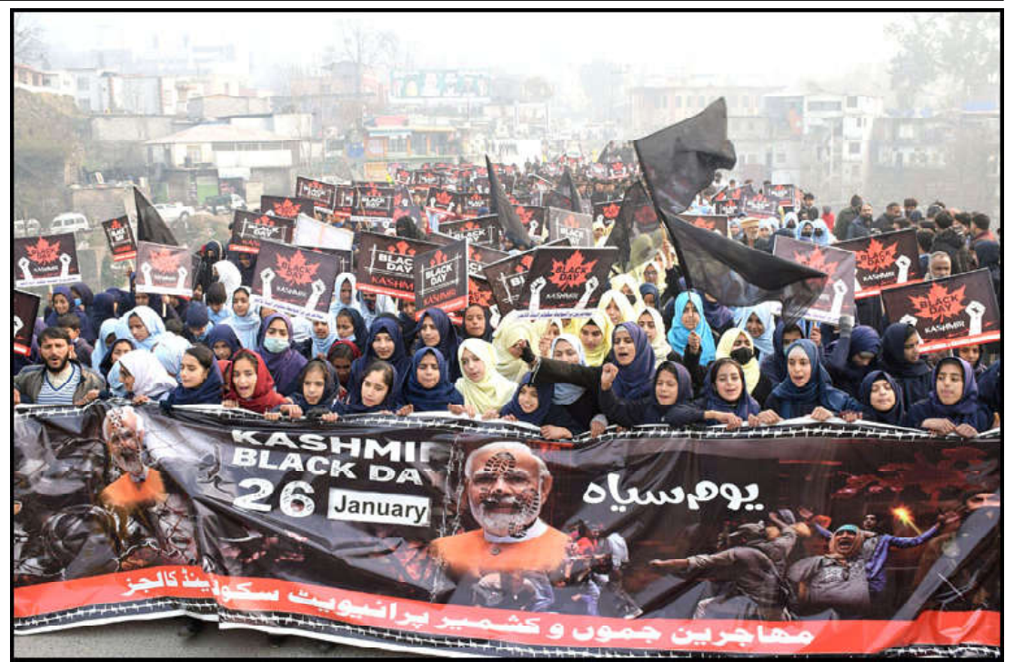
MUZAFFRABAD: Students of school and college hold placards during protest as they observe Indian Republic Day as Black Day during an anti-Indian protest in the city, to show their solidarity with people of Indian-administered Kashmir.

violated international law and relevant United Nations Security Council resolutions of Kashmir, he added. The ambassador said that Kashmir issue should be resolved properly through peaceful means, in accordance with the UN Charter, the relevant Security Council resolutions and bilateral agreements. It was important for the international community to speak about these human rights violations in Jammu and Kashmir, because its silence would only embolden India to continue its policy of violating the human rights, he added.