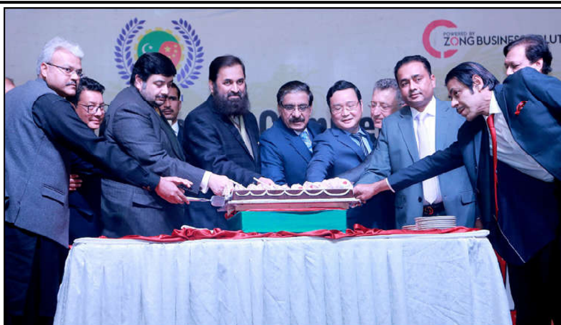
LAHORE: Governor Punjab Muhammad Baligh-ur-Rehman and others cutting cake on the eve of new Chinese year organized by Pakistan China Joint Chamber of Commerce and Industry.