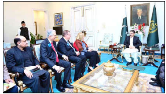
ISLAMABAD: A delegation of Rotary International calls on Caretaker Prime Minister Anwaar-ul-Haq Kakar.

He said that Karachi Metropolitan Corporation (KMC) is running by the PPP and its mayor and we are fulfilling the promises we have made. Mayor Karachi Barrister Murtaza Wahab said sports facilities have also been provided for children in Fatima Jinnah Park, public welfare works are being done in every area of the city. The Mayor Karachi said that there will be further improvement in the coming times.