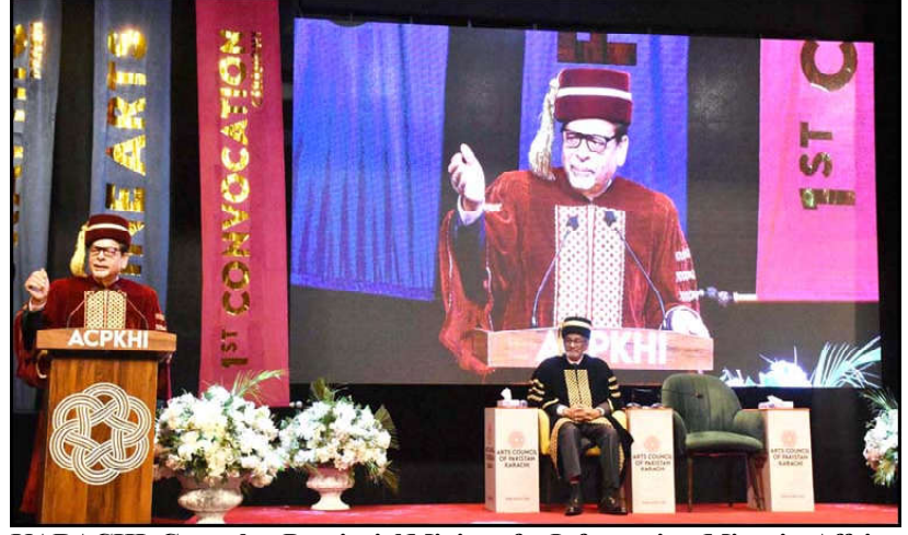
KARACHI: Caretaker Provincial Minister for Information, Minority Affairs, Social Protection and President Arts Council of Pakistan Karachi, Muhammad Ahmed Shah addressing during first Arts Council Academies Convocation 2024 organized by Arts Council of Pakistan, Karachi.