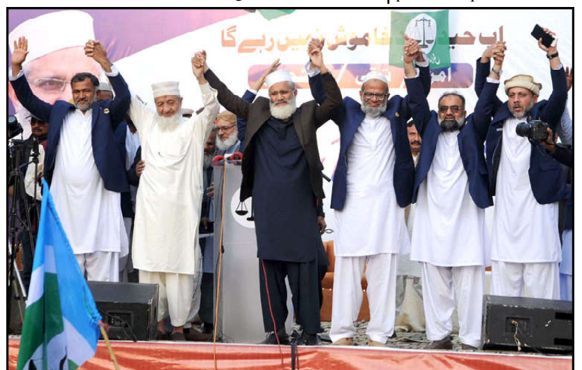
HYDERABAD: Ameer Jamaat-e-Islami Siraj ul Haq rising hands with party leaders to showing solidarity during a public meeting (Jalsa) in the city.

In the meeting, held detailed discussion regarding the whole polling process and security measures for the general elections. The DC South was briefed on the foolproof security plan for all polling stations and election constituencies situated in the jurisdiction of district South.