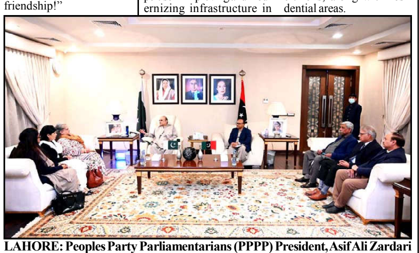
exchanging views with a delegation of Christian Community during meeting held at Bilawal House in Lahore.