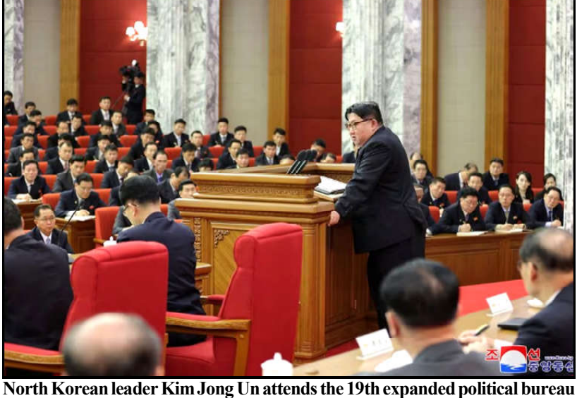
meeting of the 8th Central Committee of the Workers' Party of Korea in Pyongyang, North Korea.

"What will determine the future of Israel and Palestine is whether or not there's hope. And the twostate solution has to be that