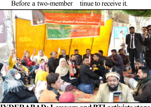
HYDERABAD: Lawyers and PTI activists stage a protest sit-in against illegal raids on the houses of their candidates for National and Provincial assembly seats and arrest of their relatives outside Sessions Court.

tions regarding government compensation for the families of missing persons were heard. The representative from the Sindh Home Department informed the court that objections from certain individuals led to the discontinuation of compensation. Justice Phalputo remarked that those with objections should refrain from contributing, emphasizing that families seeking compensation for missing persons should con-