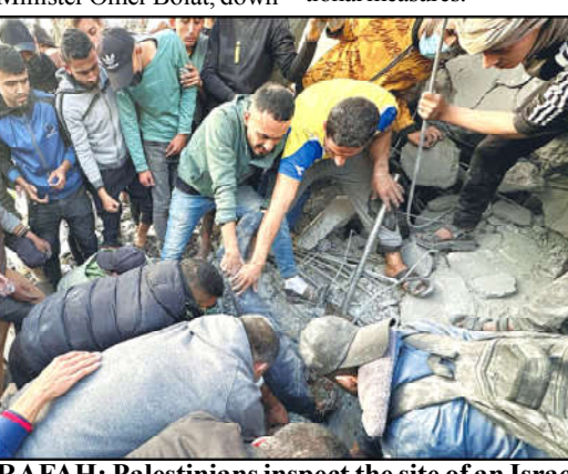
RAFAH: Palestinians inspect the site of an Israeli strike on a mosque, amid the ongoing agression in the southern Gaza Strip.

Turkey, a NATO ally, and Iran currently have four border crossings between them. One of those gates, between the Gurbulak-Bazergan regions, has been under construction since 2021. "While we have left behind the pandemic, the restrictive effect of sanctions lingers," Erdogan said, adding that Turkey would not cut its economic ties with Iran because of the international measures