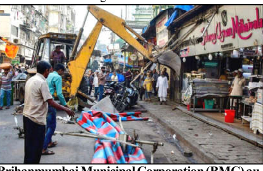
Brihanmumbai Municipal Corporation (BMC) authorities demolishing structures on the facade of an eatery near Minara mosque in Mumbai.

'The departure of the @USNavy's Gunston Hall from Norfolk marked the (official) start of #SteadfastDefender24."