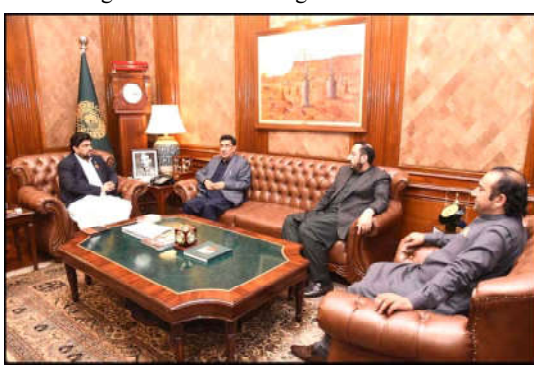
KARACHI: Governor Sindh Kamran Khan Tessori meeting a delegation of Ministers from Gilgit-Baltistan at the Governor House.

He said that Pakistan was the safest country in the world for minorities and the Constitution of Pakistan also protected the fundamental rights of every person belonging to any re-