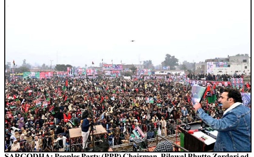
SARGODHA: Peoples Party (PPP) Chairman, Bilawal Bhutto Zardari addresses to his supporters during public gathering meeting regarding Election Campaign in connection of the General Election 2024 coming ahead,