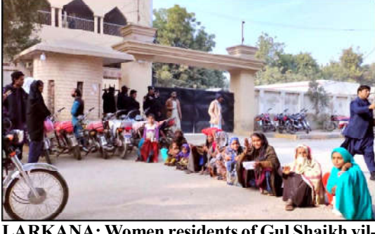
LARKANA: Women residents of Gul Shaikh village are holding protest demonstration for acceptance of their demands outside the SSP Office build-

sons are not serious. The own then it is more easy to trace him.