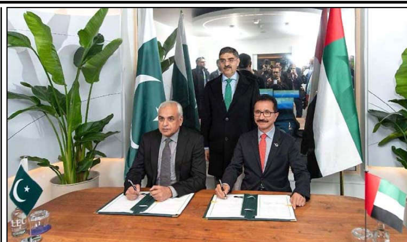
DAVOS: Caretaker Prime Minister, Anwaar-ul-Haq Kakar witnessing Federal Minister for Communications, Railways, & Maritime Affairs Shahid Ashraf Tarar and Government of Dubai inked more than $3 billion investment pact on cooperation in Railways, Economic Zones and Infrastructure at the World Economic Forum.

Pakistan Railways is Pakistan's national, state-owned railway company, owning and operating nearly 8,000 route-km of railway across the country, from Peshawar in the northwest to Karachi in the south. The Qasim International Container Terminal, a second framework agreement was signed with Pakistan's Ministry of Maritime Affairs to dredge the navigation channel.