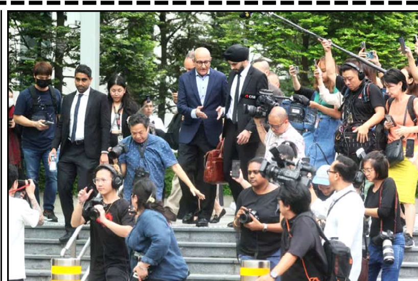
S. Iswaran, Singapore's former transport minister, arrives at the State Courts in Singapore.

erated, while flying the flag of the Marshall Islands. "There were no injuries and some damage reported," CENTCOM said, adding that the ship was "seaworthy and continuing underway." The Houthi has carried out dozens of drone and missile attacks in the Red Sea since the beginning of the Israel-Hamas war in October. The militant group has vowed to continue until the war ends and the blockade of Gaza is lifted. The increased risk of attack has forced major shipping firms to respond by avoiding the Suez Canal, the fastest cargo route from Asia to Europe. The traffic route normally accounts for 15% of the world's commercial shipping.