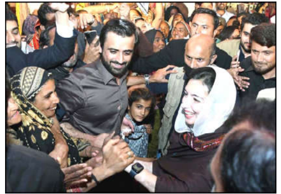
TANDO ALLAHYAR: Peoples Party (PPP) leader, Aseefa Bhutto Zardari interacts with supporters during public gathering meeting regarding the election campaign in connection of the General Election 2024, held at Liaquat Gate area in Tando Allahyar.

missiles, Wei said. The PAF has long been using weapons and equipment procured from China, including J-10C medium fighter jets, JF-17 light fighter jets, HQ-9BE long-range surface-to-air missile systems, HQ-16FE mid-to-long-range surface-to-air missile systems and the YLC-8E anti-stealth 3D surveillance radar systems. Pakistan will have no difficulties integrating the FC-31 into its combat systems, and the stealth aircraft will in return significantly enhance its military capabilities by a generation, experts said. The FC-31 will allow the PAF to enjoy a generational gap over its rivals with fast delivery, while Pakistan's main rival will not likely get stealth fighter jets anytime soon, Wei said.