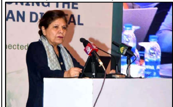
ISLAMABAD: Minister for Finance, Revenue and Economic Affairs, Dr. Shamshad Akhtar is delivering her keynote address to Digital Transformation-Envisioning the Pakistan Digital Stack workshop.

Talking to APP here on Monday, he said that out of the total released funds, an amount of Rs429.97 million had spent so far on different development schemes during the period under review for achieving sustainable agriculture growth and economic development of the country. The government has allocated Rs8.850 billion for the Ministry of National Food Security and Research in its PSDP 2023-24 for different projects relating to agriculture and livestock sectors' development in the country, he added.