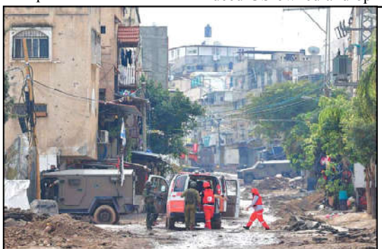
Israeli forces search a Red Crescent ambulance during a raid in Tulkarm, occupied West Bank.

ships in the Red Sea and retaliatory U.S. strikes have ratcheted-up tensions in the Middle East as the Gaza war rages on. The attacks by the Iran-allied Houthis, which they say are in support of Palestinians, target a route that accounts for about 15% of the world's shipping traffic and acts as a vital conduit between Europe and Asia. Hundreds of large vessels have rerouted along the southern tip of Africa, adding 10-14 days of travel, to avoid drone and missile attacks by the Houthis. "Ships are diverting away from the Red Sea and re-routing around the coast of South and West Africa.