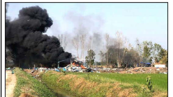
Smoke rising after an explosion at a fireworks factory near Sala Khao township in Thailand's Suphan Buri province.

to the rollout of new funds for broadband internet, is Biden's fourth this month to an anticipated battleground state in the 2024 presidential election. It comes as Biden's re-election campaign, launched nearly nine months ago, revs up into general-election mode with hires across a series of the states where voting preferences can swing to either party. Since 1980, North Carolina has only backed one Democrat in a presidential election: Barack Obama in 2008. But Biden's loss there in 2020 was narrower than Obama's in 2012 and Hillary Clinton's in 2016.