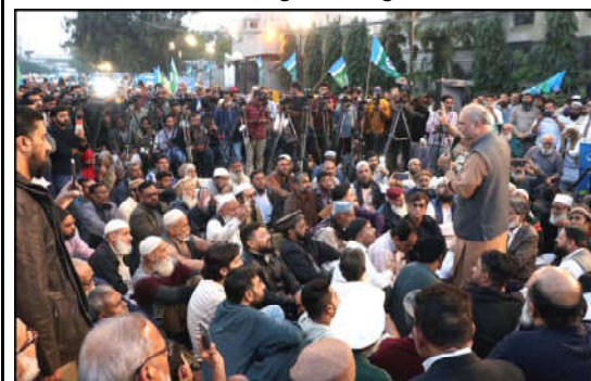
KARACHI: Leaders and supporters of Jamat-e-Islami (JI) are holding protest demonstration against prolonged sui-gas load shedding during winter season, held outside SSGC Head-Office building in Karachi.

urged all candidates to adhere strictly to the code of conduct to maintain the integrity of the electoral Process. Deputy Commissioners (DCs) of Sukkur, Khairpur and Ghotki districts gave their detailed briefing to all electoral representatives regarding the code of conduct in their respective districts. Wing Commander Rangers and SSP Sukkur addressed the candidates on matters related to law enforcement during the elections, emphasizing the importance of respecting the law and order to ensure a peaceful and orderly electoral process.