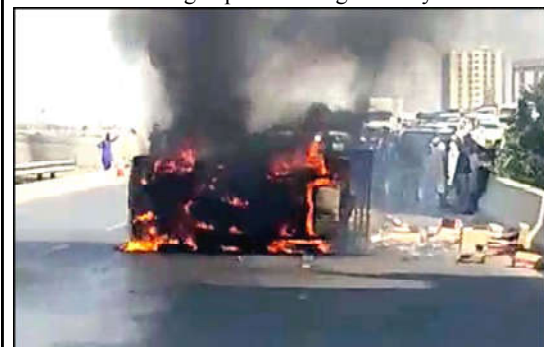
KARACHI: View of huge fire flames rise from burning vehicle after traffic accident, at Lyari Expressway Garden in Karachi.