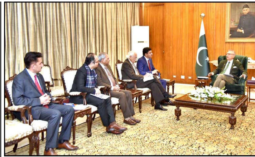
ISLAMABAD: A delegation of Kashmir Education Foundation called on President Dr. Arif Alvi at Aiwan-e-Sadr.