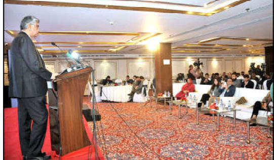
ISLAMABAD: Caretaker Federal Minister for Information & Broadcasting and Parliamentary Affairs Murtaza Solangi addressing the two-day conference for Civic Hackathon "Problem Identification".

The minister informed the delegation that under CPEC, Pakistan has completed the project of generating more than 2,640 MW he added.