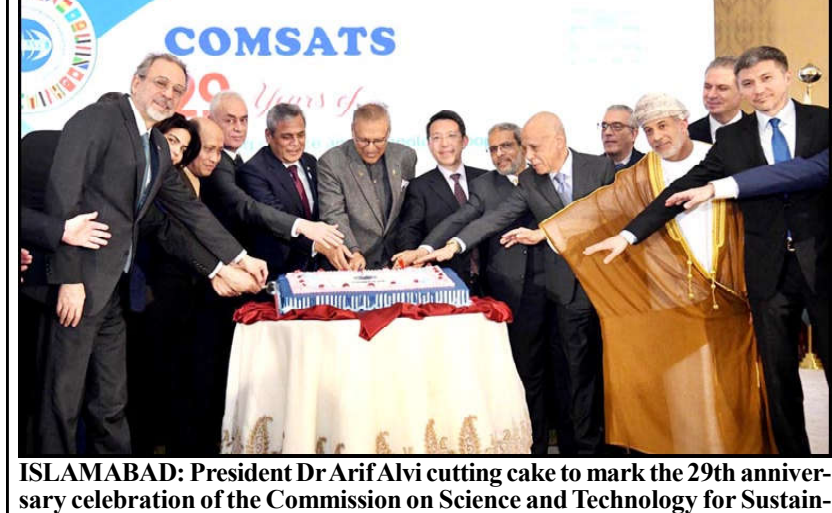
sary celebration of the Commission on Science and Technology for Sustain-able Development in the South (COMSATS), at Aiwan-e-Sadr.

The president cited the agri-advancement of the Netherlands, which through a smaller country. became the second largest exporter of agri-products in the world.