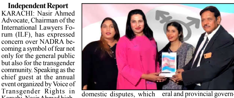
NADRA exploits, leading to corruption and the flourishing of an agent mafia. He urged NADRA to revise its policies in light of these issues. Additionally, he called for the implementation of separate counters for transgender and the alloca-

He informed that the ongoing Rolling Work Plan (RWP) in Sindh will be continued next year for which an amount of $7 million has