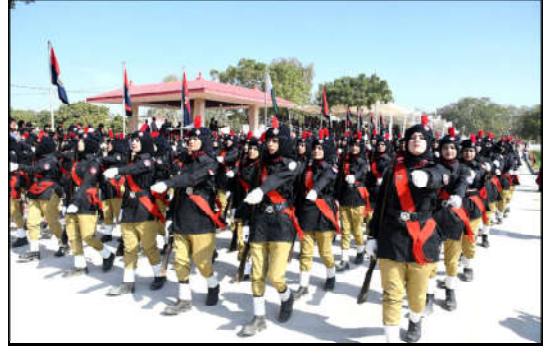
KARACHI: Female police march during the passing-out ceremony at Saeedabad Police Training Centre, in Provincial Capital.

meeting The discussed observations the mega housing scheme.