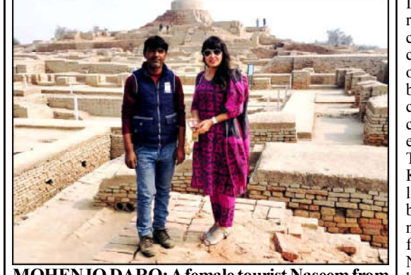
Iran is visiting and expressed keen interest in the historical ruins of the World Heritage Monuments of Mohenjo Daro.

and Evaluation (DG M&E) and Human Resource Management Information System (HRMIS) of School Education department to been earmarked.