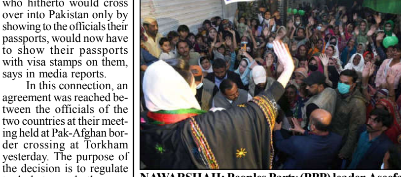
NAWABSHAH: Peoples Party (PPP) leader, Aseefa Bhutto Zardari addresses to her supporters during corner meeting regarding the election campaign in connection of the General Election 2024, ĥelď at Taj Colony in Nawabshah.