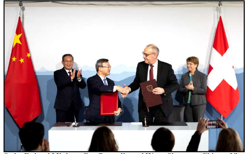
Swiss Federal Minister Guy Parmelin and Wang Shouwen, Chinese Vice Minister of the Ministry of Commerce shake hands after signing a joint statement of the free trade agreement, next to Swiss President Viola Amherd and Prime Minister of the People's Republic of China, Li Qiang during an official visit in Kehrsatz near Bern, Switzerland.

never renounced force to bring it under its control responded to Lai's election.