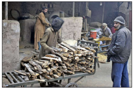
LAHORE: A vendor is unloading the woods from handcart to use as fuel at traditional mud oven at Misri Shah area of the Provincial Capital.