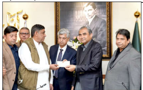
LAHORE: Caretaker Chief Minister Punjab Mohsin Naqvi presenting special grants cheques to President and General Secretaries of 44 Press Clubs.