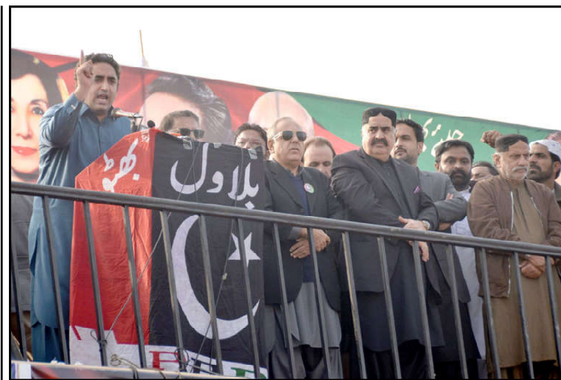
DERAALLAH YAR: Chairman of the Pakistan People's Party (PPP) Bilawal Bhutto Zardari addressing during political gathering (Jalsa).

the polls so that I save you, the public, and the future of Pakistan from those people," Bilawal said. Taking another swipe at Nawaz, the PPP chief said the former premier was a coward as he vowed to defeat the PML-N in their home ground of Lahore. "I'm also contesting from Lahore. I will strike them inside their house," he asserted, adding that the PML-N feared the public. "They fear what the public will do to them if they step out," he said. Bilawal said there was no 'bat' in the February 8 election and the contest would be between the 'tiger' and the 'arrow', the electoral symbols for the PML-N and the PPP, respectively.