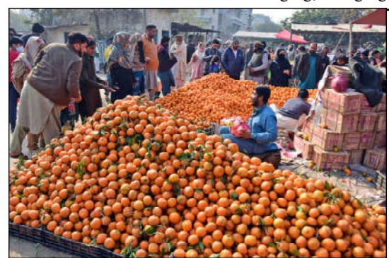
ISLAMABAD: People are busy buying Kinnow in Sunday weekly bazaar at sector G-10 in the Federal Capital.