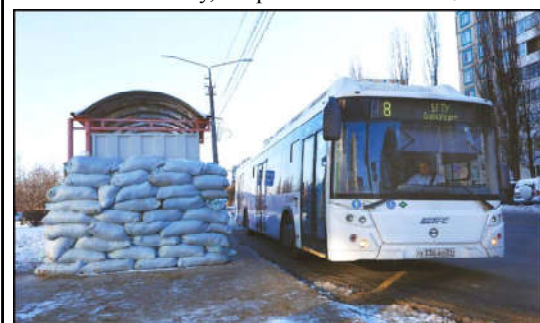
A bus stops at a place protected with sandbags in Belgorod, the main city in Russia's south-western region which has come under shelling by Ukraine over the past week.

Monitoring Desk COPENHAGEN: A volcano in southwest Iceland erupted on Sunday, the country's meteorological office said, making it the fifth eruption on the Reykjanes peninsula since 2021. A coast guard helicopter has been sent to assess the situation and the exact location, the Civil Protection agency said. The eruption began north of the fishing town of Grindavik but it was still not clear exactly where the lava.