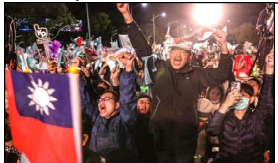
Taiwan voters elected Lai Ching-te to be their next president despite warnings from China that he would take the island closer to war.