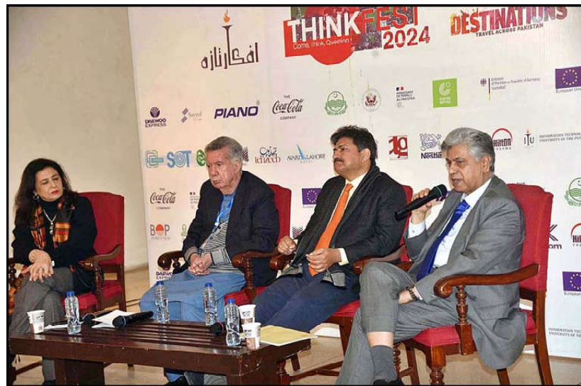
LAHORE: Caretaker Federal Minister for Information and Broadcasting, Murtaza Solangi addressing a Seminar (Muzakara) organized by Think Fest at Al Hamra Hall.