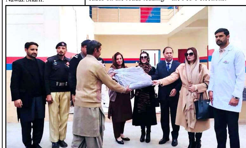
MUZAFFARABAD: Special Assistant to Prime Minister for Human Rights and Women Empowerment Mushaal Hussein Mullick Distributing Winter Kits among the prisoners of Central Jail.

Experts said that the air becomes heavier in the winter, causing poisonous particles in the atmosphere to move downwards and making the atmosphere polluted. As a result, a layer of polluted particles, including large amounts of carbon and smoke, covers an area. The smoke produced by factories or by burning coal, garbage, oil or tyres, enters the atmosphere and its impact appears at the onset of the winter and remains till the end of the season, experts said. Although southwestern winds blowing from the sea in Karachi, work as a filter for the air, these winds remain mostly suspended during the winter, experts said.