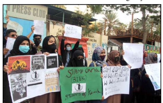
KARACHI: Students holds placards during protest in favor of their demands outside press club in Provincial Capital.

The body was shifted to Jinnah Hospital. As identity of deceased could not be ascertained, the body was moved to mortuary.