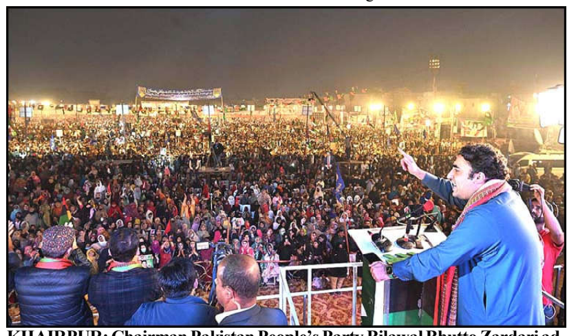
KHAIRPUR: Chairman Pakistan People's Party Bilawal Bhutto Zardari addressing to public gathering during Election Campaign.

The veteran PML-N leader said that motorway would be constructed upto Kharian with an estimated Rs86 billion and the road would lead to Rawalpindi afterward.