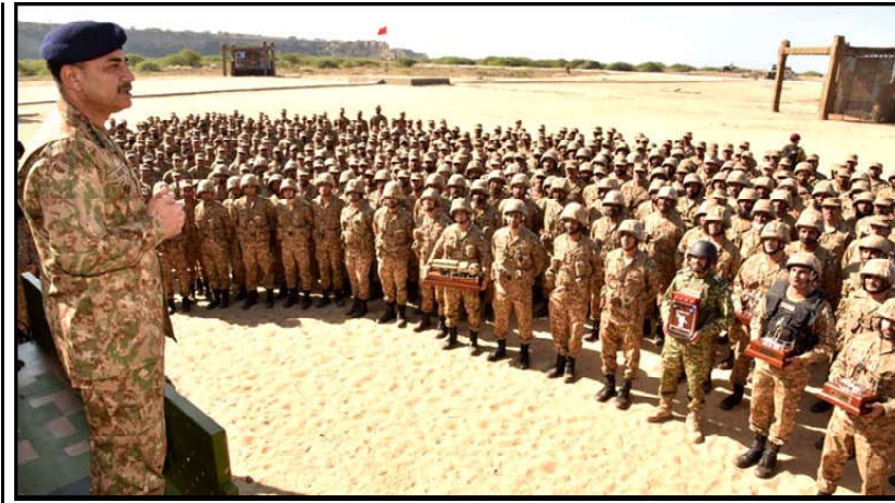
Chief of the Army Staff, General Syed Asim Munir interacting with the officers and troops at the occasion of witnessing firing of different air defence weapon systems during Exercise Al-Bayza-III, 2024 at Sonmiani.