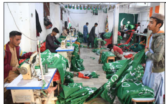
KARACHI: Workers prepare different political parties flags and banners ahead of the forthcoming general election in Provincial Capital.

She said launching of NCGCL was a far reaching institutional reform that is being launched, adding the purpose of this transformative step was to facilitate smoother capital investment paths for small businesses.