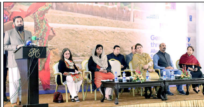
LAHORE: Governor Punjab Muhammad Balighur-Rehman addressing the ceremony regarding Women Empowerment organized by National Commission on Status of Women.

He said that the performance and skills of women are much better than men in many fields. Governor Punjab said that the governments that started institutions like Commission on Status of Women and projects like Women on Wheels to empower women should be appreciated. Governor Punjab said that the Government of Pakistan and many institutions of the Government of Punjab are active for women's welfare, economic independence and poverty alleviation by providing women with easy loans.