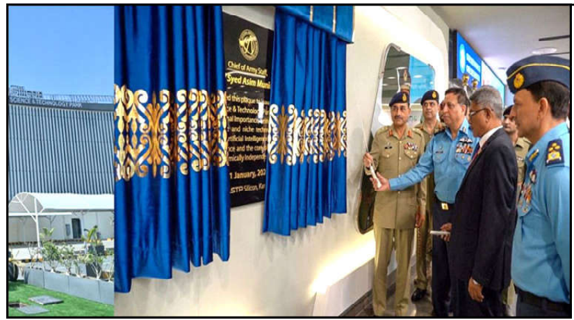
KARACHI: Chief of Army Staff General Syed Asim Munir inaugurating the second chapter of National Aerospace Science and Technology Park Silicon.