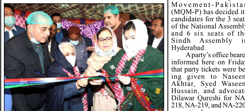
NAWABSHAH: Peoples Party (PPP) Leader, Aseefa Bhutto Zardari inaugurating the Free Medical Eye Camp, in Nawabshah on Friday, January 12, 2024. Former Sindh Health Minister, Dr. Azra Fazal Pechuho is also present.

The decision aligns with the commitment to promote Sindh as a premier tourist destination, ensuring that visitors receive expert guidance, contributing to the overall growth and positive perception of tourism in the province.