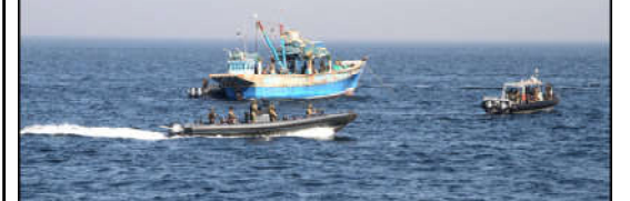
KARACHI: A view of demo anti narcotics operation being conduct during Exercise Sea Guard 24 in Arabian Sea.