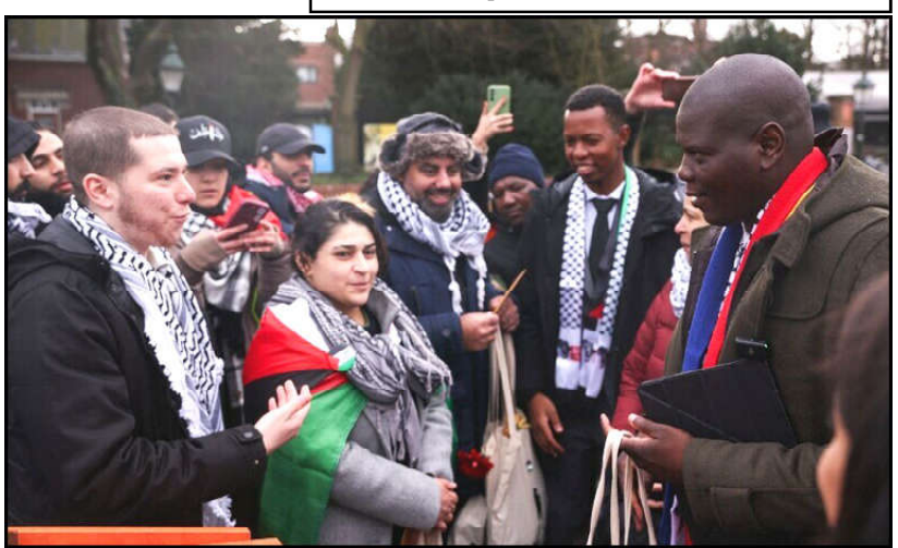
South Africa's Minister of Justice Ronald Lamola stands near pro-Palestinian protesters after addressing the media near the International Court of Justice (ICJ), on the day judges hear a request for emergency measures by South Africa to order Israel to stop its military actions in Gaza, in The Hague, Netherlands.

The proposed sale of the missile system to Kosovo comes during tensions in the region.