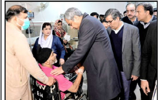
LAHORE: Caretaker Chief Minister Punjab Mohsin Naqvi enquiring about the health of patient sitting on a wheel chair during his visit to (New Emergency) Punjab Institute of Cardiology.

He also enquired about the well-being of a patient in a wheelchair, lifting a fallen file from the floor and placing it back on the wheelchair. The patient expressed gratitude to the CM for his gesture. He also addressed the complaint of a patient from Gujrat about delayed scheduling for angiography. Ordering immediate action, he instructed the MS to expedite the angiography procedure. The health secretary and others were also present.