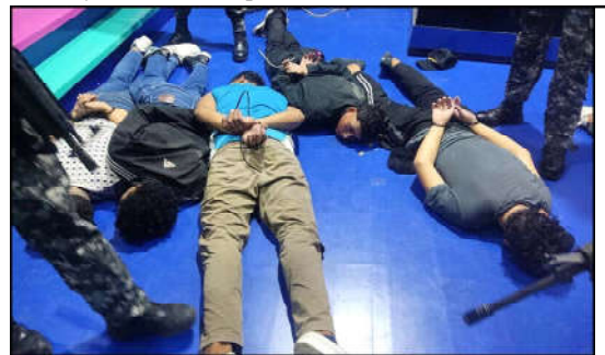
People accused of invading and taking over television station TC with weapons and forcing staff to lie and sit down, lie handcuffed on the floor in Guayaquil, Ecuador.