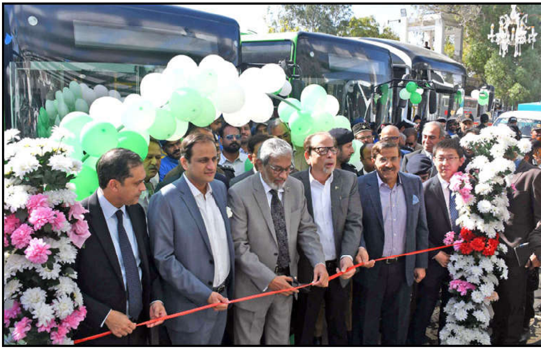
KARACHI: Caretaker Chief Minister of Sindh Maqbool Baqir cut the ribbon along with others during the launching ceremony of 30 green buses of "Peoples City Bus Project" outside Quaid Mausoleum in Provincial Capital.