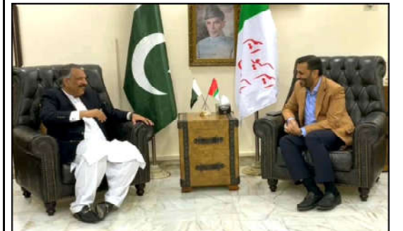
KARACHI: Muttahida Qaumi Movement (MQM-P) Senior Deputy Convener, Mustafa Kamal exchanging views with Ijaz-ul-Haq, Chief of Qaumi Yakehti Ittehad during meeting held at Pakistan House in Karachi.