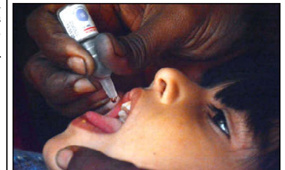
KARACHI: A lady health worker is administering anti-polio drops to a child during the anti-polio campaign in Korangi area.