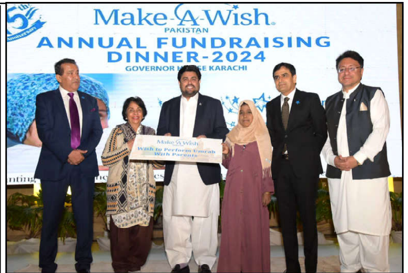
KARACHI: Governor Sindh Kamran Khan Tessori giving away Umrah ticket to patient with her parents from Make A Wish.

minister said the government is determined to resolve the transport issue of the city and an agreement has also been signed with National Radio and Telecommunication Corporation in this regard. It is pertinent to mention here that the intra-district People's Bus Service project was launched in Karachi in June 2022 by the government of Sindh during the PPP's tenure. The buses were imported from China.