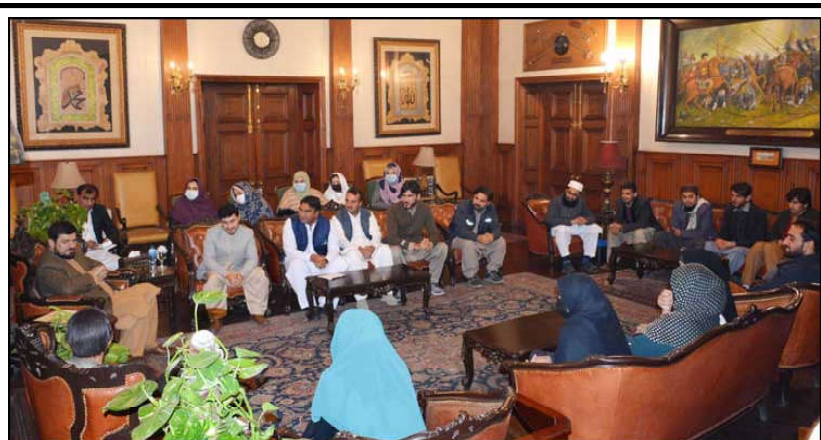
PESHAWAR: A representative delegation of Lecturers appointed under a Project in Government Colleges meeting with Governor Khyber Pakhtoonkhwa Haji Ghulam Ali.

RAWALPINDI (APP): In a major development, the Rawalpindi police have launched regular school classes catering specifically to the transgender population of the city. The classes, conducted at Islamia Higher Secondary School in Liaquat Bagh, have garnered support from the district administration and the Education Department. A spokesperson for the Rawalpindi police told media on Wednesday that 52 transgender individuals had been enrolled in these special classes, emphasizing the significance of providing education as a fundamental right. This initiative is aligned with the broader efforts of the Rawalpindi police, which recently established Pakistan's inaugural Transgender Protection Center, he added. The spokesperson highlighted the multifaceted approach of the Transgender Protection Center, which extends beyond education.