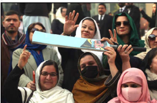
PESHAWAR: Tehreek-e-Insaf (PTI) Lawyers are celebrating after the Peshawar High Court verdict in favor of the party intra-party elections and electoral symbol of bat, at High Court in Peshawar.

A report compiled by the Provincial Home Department, reviewed by the Sindh Caretaker Minister for Home and Prison, Brig. (Rtd.) Harris Nawaz unveiled significant achievements. Key highlights from the report: Police Actions Against Crime: 932 encounters and the dismantling of 458 gangs. Elimination of 101 dacoits, arrest of 6,458 criminals, and capture of 2 highway robbers and 11 kidnappers. Apprehension of 5,373 proclaimed offenders and 10,344 absconders. Recovery of various firearms and ammunition. Actions Against Narcotics: Execution of 3,657 raids, leading to the arrest of 5,203 accused individuals. Seizure of substantial quantities of ICE, heroin, hashish, and liquor. Crackdown on Smuggling and Electricity Theft: Multiple operations resulting in arrests and the confiscation of smuggled goods, including sugar, urea, diesel, petrol, edible oil, and others. Extensive efforts to curb electricity theft, disconnecting 9,173 connections and confiscating faulty meters, with legal action taken against several accused individuals.