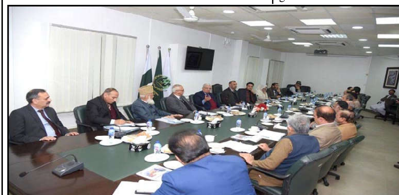
ISLAMABAD: Federal Ombudsman Ejaz Ahmed Qureshi talking with newsmen.

The initial investigations by the local police suggested that the unfortunate incident is believed to have happened two days ago from the consumption of a toxic substance mixed in the food. The police officials claimed that the relative of the deceased family allegedly bought food from Waziristan two days ago.