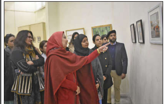
LAHORE: Visitors and staff are taking interest in the pictures during exhibition at Lahore College for Women University regarding the oppression on Palestinian people.

MIRPUR (AJK): (APP): Azad Jammu Kashmir Prime Minister Chaudhry Anwar ul Haq has taken strong notice of the recent cold-blooded murder of a young Kashmiri expatriate by unknown assailants near Islamabad international airport on his return from abroad. The AJK premier expressed his profound grief and sorrow over this tragic incident and extended his heartfelt condolences to the bereaved family. The Prime Minister has also directed the Chief Secretary of Azad Kashmir to contact the IG Punjab police to ensure early arrest of the absconding accused, according to an official handout issued here late Tuesday. It may be mentioned here that the slain youth, hailing from AJK's Dadyal town of expatriates in Mirpur district, was gunned down by unknown attackers near Islamabad international airport on his return from abroad. The AJK premier expressed his profound grief and sorrow over this tragic incident and extended his heartfelt condolences to the bereaved family. The Prime Minister has also directed the Chief Secretary of Azad Kashmir to contact the IG Punjab police to ensure early arrest of the absconding accused, according to an official handout issued here late Tuesday. It may be mentioned here that the slain youth, hailing from AJK's Dadyal town of expatriates in Mirpur district, was gunned down by unknown attackers near Islamabad international airport on his return from abroad.