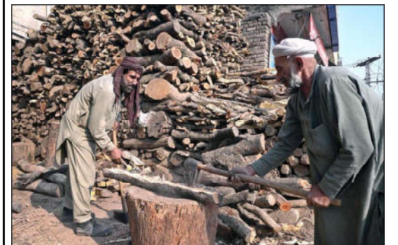
ISLAMABAD: Laborers cutting wood into pieces for selling purpose at his workplace in the Federal Capital.

After Lahore, he said, Business Facilitation Centers (BFCs) were in the final stages of completion in five major cities including Faisalabad. He said the success in election of the Federal Chambers was a manifestation of confidence of the business community in the leadership of UBG.