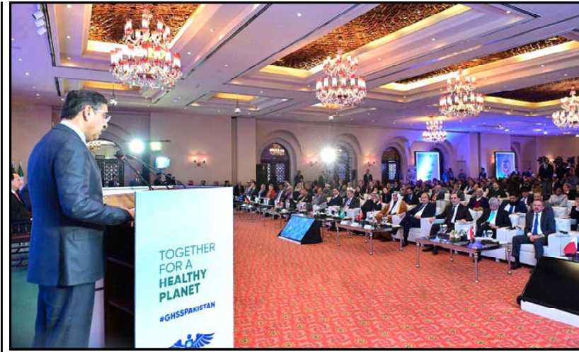
ISLAMABAD: Caretaker Prime Minister Anwaar-ul-Haq Kakar addresses the Global Health Security Summit.

The meeting offered Fateha for the security officials protecting the polio eradication team who were martyred in a terrorist incident in Bajaur.