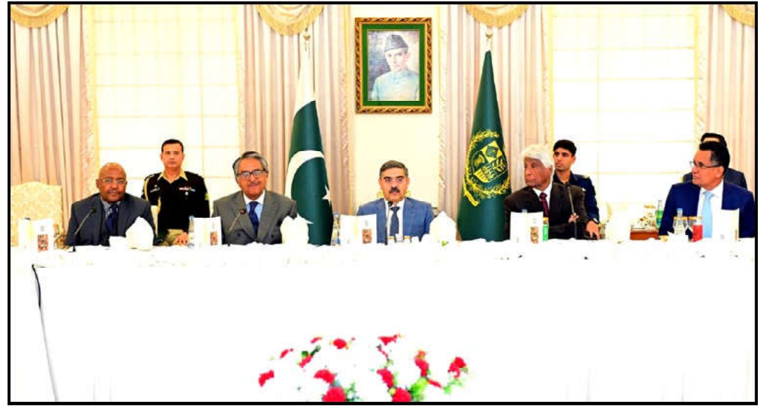
ISLAMABAD: Caretaker Prime Minister Anwaar-ul-Haq Kakar meets a group of Envoys from African and Asian Countries.

He reiterated the government's resolve to respond to any threat, regardless of whether there were elections in the country or not. Asked about the Senate resolution passed recently calling for the postponement of the elections, the prime minister said, "I do not see any legal implications as the Senate resolution is not mandatory."