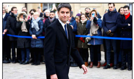
France's newly appointed Prime Minister Gabriel Attal arrives for the handover ceremony with outgoing Prime Minister Elisabeth Borne at the Hotel Matignon in Paris, France.