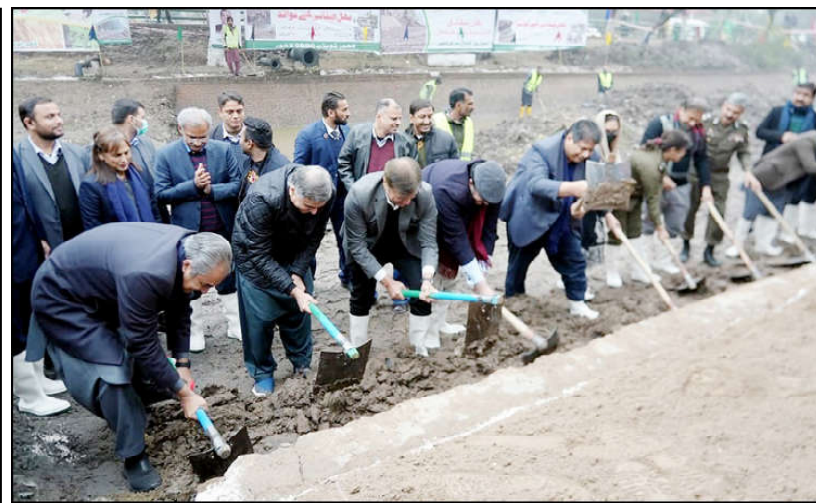
LAHORE: Caretaker Chief Minister Punjab Mohsin Naqvi along with provincial ministers and others high ups formerly inaugurates de-silting of Canals across Punjab.

been trained through LIMS as this drive would be continuously monitored through satellite images and NESPAK would also monitor it as a third party, he added. CM Naqvi mentioned that complaints have been received about the mixing of drainage water in the Lahore canal at some points, adding that a committee comprising MD WASA and DC would probe the matter, as it could not be allowed. He appealed to the citizens to avoid polluting the canal as the government could not do everything all alone.