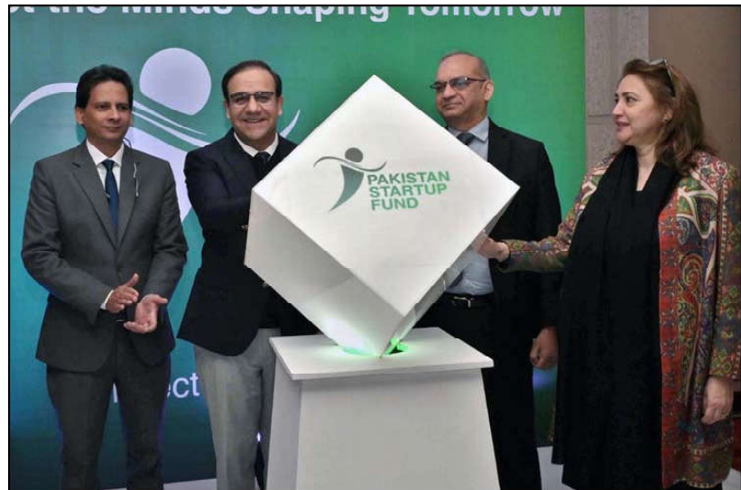
ISLAMABAD: Caretaker Federal Minister for IT & Telecommunication Dr. Umar Saif Launch Pakistan Startup Fund during ceremony organized by Ignite and Ministry of IT & Telecommunication.