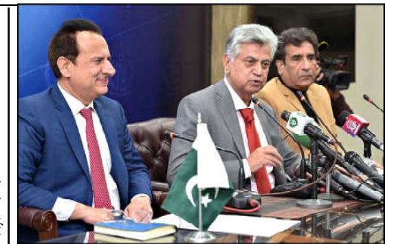
ISLAMABAD: Caretaker Federal Minister for Information and Broadcasting, Murtaza Solangi and Caretaker Federal Minister for Health Dr. Nadeem Jan addressing a press conference at PID Media Center.