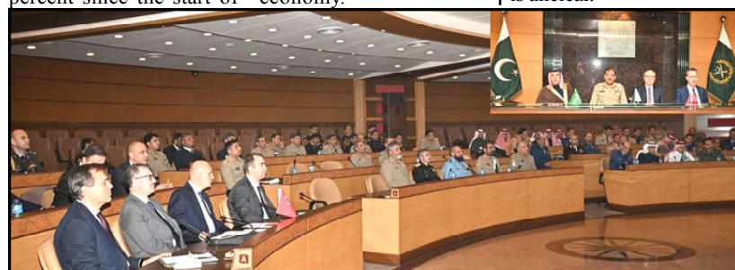
RAWALPINDI: A view of meeting of Trilateral Defence Collaboration between Pakistan, Saudi Arabia and Turkiye.

She informed that EU Delegation in Islamabad has been working to enhance Pakistan's exports through better utilization of GSP Plus, diversifying exports, investing in value-addition, using new technologies and IT solutions for better access to EU Market, besides bringing in the SMEs who are the backbone of any economy.