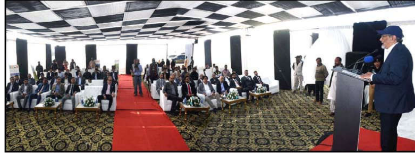
KARACHI: Caretaker Sindh Chief, Justice (Retd) Maqbool Baqar addresses during the Foundation Stone-Laying ceremony of the M9-N5 Link Road Interchange, held at Kathore in Karachi.