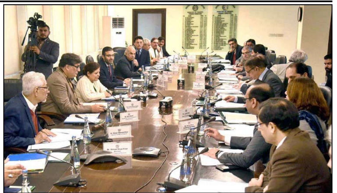
ISLAMABAD: Caretaker Federal Minister for Finance, Revenue and Economic Affairs, Dr. Shamshad Akhtar chairing a meeting of Economic Coordination Committee of the Cabinet.

The ECC approved the funds as a Technical Supplementary Grant (TSG) for up-gradation, technical enhancement and field activities of the Intelligence Bureau with releases on a need basis. The committee considered and approved the summary of National Health Services Regulation and Coordination for the provision of Technical Supplementary Grant (TSG).