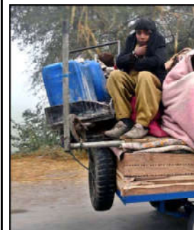
LARKANA: A view of dense fog covering surrounding areas of Road during morning time.