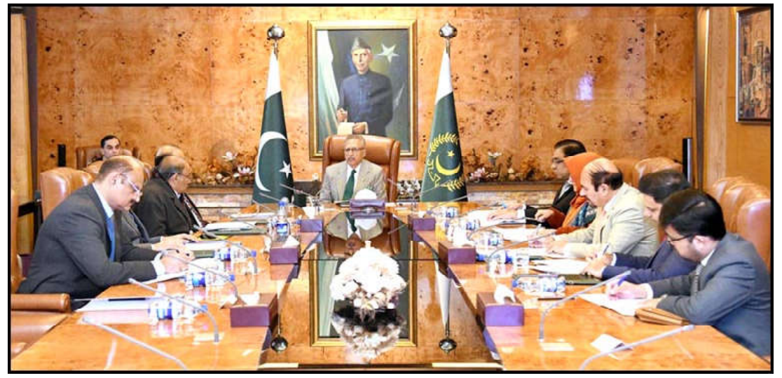
ISLAMABAD: President Dr. Arif Alvi chairing a meeting on implementing employment quota for Persons with Disabilities (PWDs) at Aiwan-e-Sadr.