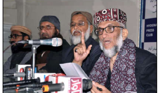
HYDERABAD: Jamiat Ulama-e-Pakistan (JUP) Noorani President, Sahibzada Abul Khair Muhammad Zubair addresses to media persons during press conference held at Hyderabad press club.

missioner Office Larkana division, the total number of male registered voters is 1930896 and female registered voters 1661378. The Larkana and Kamber-Shahdadkot districts with 4 National Assembly and 08 Sindh Assembly seats have the highest number of registered voters which is 1686287 of whom the strength of the male voters is 911309 and female 774978.