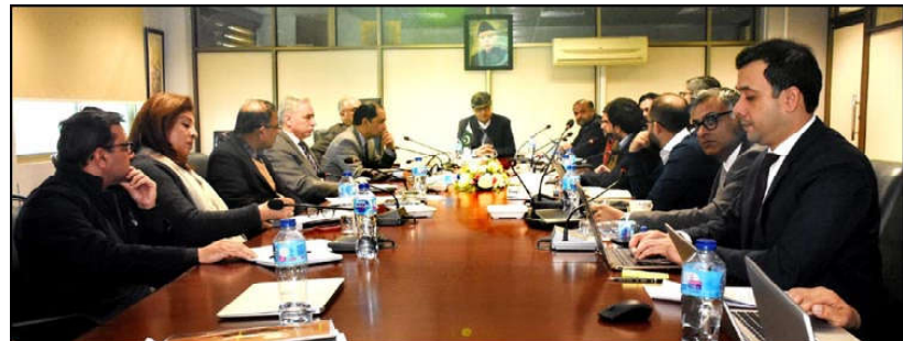
ISLAMABAD: Caretaker Federal Minister for Privatisation, Fawad Hassan Fawad chaired a consultative session with Financial Advisors for divestment of PIACL.