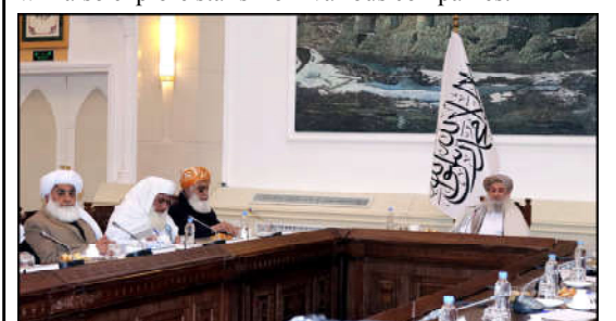
KABUL: Amir Jamiat Ulema-e-Islam (JUI) Maulana Fazlur Rehman meeting with Prime Minister of Afghanistan Mulla Hassan Akhund.

Meanwhile, the International Hajj Expo 2024 commenced in the Saudi city of Jeddah on Monday. During the Expo, additional agreements will be signed to enhance the experience for Hajj pilgrims. A Pakistani delegation will also explore stalls from various companies.