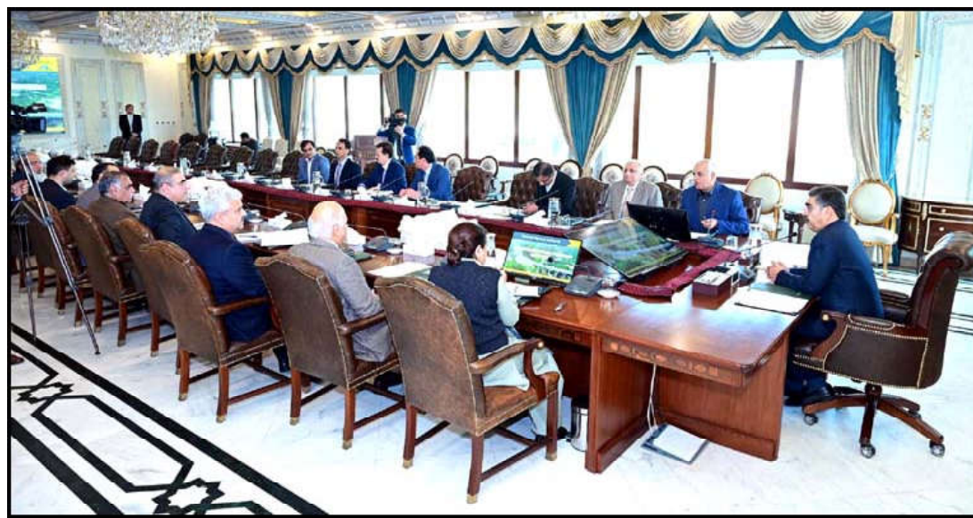
ISLAMABAD: Caretaker Prime Minister, Anwaar-ul-Haq Kakar chairs a meeting on the matters related to National Highway Authority (NHA), in Islamabad.

Ten of the critical injured have been shifted to Peshawar while 12 were under treatment at Bajaur Headquarters Hospital Khar.