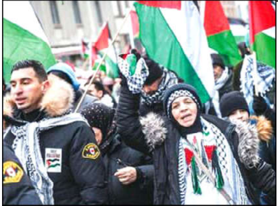
Protesters at the 'All Denmark on the Streets for Palestine Ceasefire Now!' demonstration march from Frederiksberg City Hall to Copenhagen City Hall.

"And that's also been the case for... far too many innocent Palestinian men, women and children."