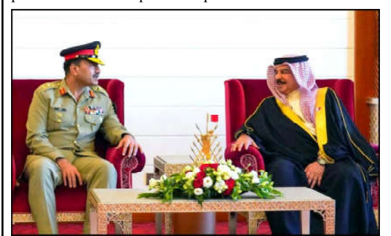
RAWALPINDI: Chief of Army Staff (COAS), General Asim Munir exchanging views with Hamad Bin Isa Salman Al Khalifa, King of Bahrain during meeting held in Bahrain.

Expressing concerns over rising criminal cases, he ordered the IGP to take action against the officers concerned on duty who are unable to maintain law and order situation in their areas. He also directed IGP to immediately recover the abducted persons and present a report without delay. He said that police officers should also take measures regarding security so that next elections could be held in a peaceful environment.