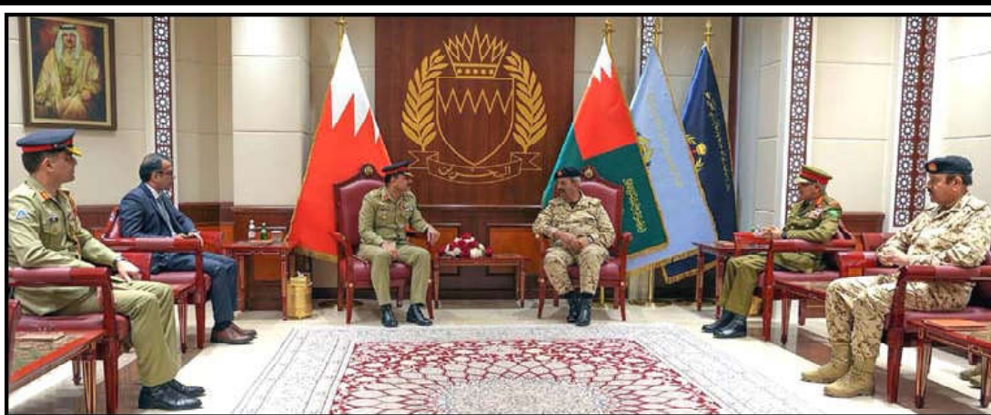
RAWALPINDI: Chief of Army Staff (COAS), General Asim Munir exchanging views with Field Marshal Khalifa Bin Ahmed Al Khalifa, Commander of Bahrain Defence Forces and General Shaikh Mohammad Bin Isa Al Khalifa, Commander of Bahrain National Guard during meeting held in Bahrain.

posed to any country," Akhund was cited in a statement released by Afghan government spokesperson Zabihullah Mujahid. He also highlighted the crucial role of religious scholars in resolving issues and dispelling misunderstandings between Islamabad and Kabul. Fazl was extended an invitation by the interim Afghan government last month, marking his first visit to Afghanistan since the Taliban assumed control in 2021.