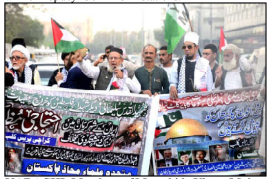
KARACHI: Members of Muttahida Ulema Mahaz Pakistan are holding protest demonstration against Israeli cruel and inhumane acts and express unity with the innocent people of Palestine, held at Karachi press club.

KARACHI (INP): The city's lawyers on Monday staged protest strike after the traffic police booked some lawyers in a case. The lawyers' shutdown the City Courts' gates denying entry to litigators in the court complex. The lawyers' strike has been resulted in deferral of hundreds of cases fixed for hearing by the courts. The prisoners from jails did not transport to courts for hearing of their cases.