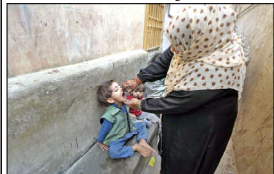
KARACHI: A lady health worker administers Polio drops to a child during Polio eradication campaign in Provincial Capital.

Additionally, topics encompassed the expulsion of illegally residing foreigners, specifically in Sindh, and initiatives to maintain law and order in the region.