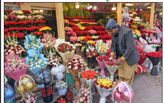
ISLAMABAD: A florist is sparing water on the flowers for preserving their freshness, F-6 Flower Market in Federal.