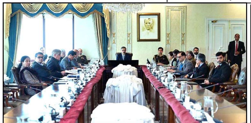
ISLAMABAD: Caretaker Prime Minister Anwaar-ul-Haq Kakar chairs a review meeting regarding Afghan Transit Trade and Anti-Smuggling operations.

International Religious Freedom (USCIRF) as well as public concerns raised by international human rights constituencies about India's maltreatment of religious minorities. This conspicuous omission raises serious questions about the credibility, transparency and objectivity of the entire process," the spokesperson remarked. She said that Pakistan remained convinced that such discriminatory, unilateral and subjective exercises were counterproductive and undermined the shared objective to advance religious freedom globally. "Pakistan strongly believes that the contemporary challenge of religious intolerance, xenophobia and Islamophobia can be best countered through constructive engagement and collective efforts based on mutual understanding and respect. With a similar spirit, Pakistan has bilaterally engaged the US," the spokesperson added.