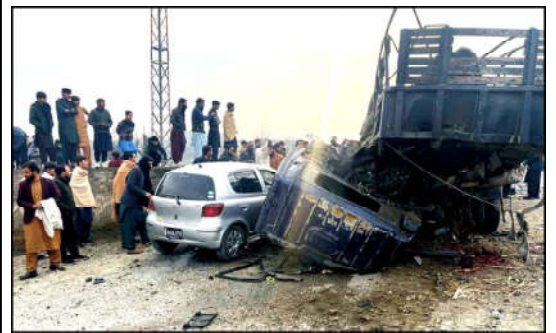
BAJAUR: A view of police van after bomb attack

KARACHI (INP): The rate of street crimes in Karachi has reportedly increased by approximately 11.11 percent in the year 2023 with over 90,000 incidents reported compared to the year 2022 where more than 80,000 cases were reported. Karachi police released the data of street crimes for the year 2023 according to which more than 90,000 incidents were reported in the metropolis.