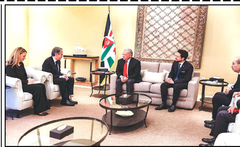
AMMAN: Jordan's King Abdullah II speaks to US Secretary of State Antony Blinken, as the latter arrived in the Middle East to ensure the violence in Gaza does not spread.

An Israeli strike on south Lebanon on Monday killed a senior commander in Hezbollah's elite Radwan force, three security sources told Reuters, the latest in daily clashes across Israel's northern border.