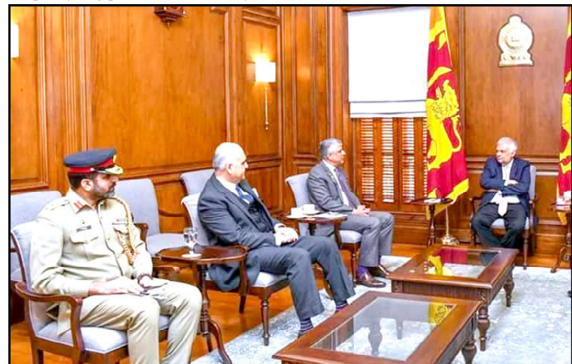
COLOMBO: Secretary Defence Lt Gen (Retired) Hamood Uz Zaman Khan calls on President of Sri Lanka, Ranil Wickremesinghe at Presidential Secretariat Sri Lanka.