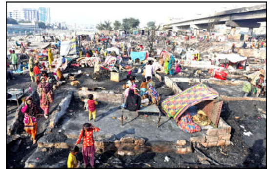
KARACHI: Residents collect their belongings from the burnt debris of their houses after fire broke out shanties in a slum area of Teen Hatti area of the Provincial Capital.

SUKKUR (APP): The two-day conference on "Geopolitics from Below: Affect and Social Sciences," jointly organized by King's College London, UK, and Begum Nusrat Bhutto Women University (BNBWU), Sukkur, started here on Friday at the Begum Nusrat Bhutto Women University Sukkur. The international-level event brought together academia, researchers, and experts to delve into pressing global issues from an interdisciplinary perspective.