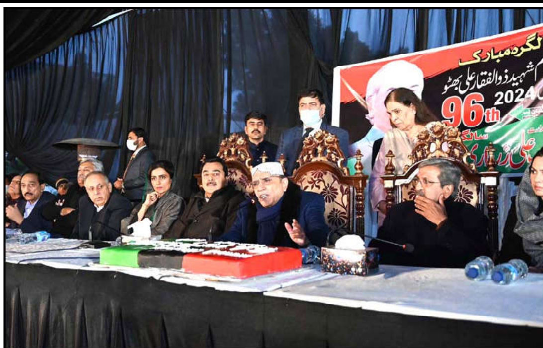
MULTAN: Peoples Party (PPP) Co-Chairman, Asif Ali Zardari addresses during a ceremony on the occasion of 96th birth anniversary of Shaheed Zulfikar Ali Bhutto held at Peoples Secretariat in Multan.

He said national and international experts are taking part in the summit, adding, summit will discuss global pandemic planning responses and its facility for low-and middle-income countries to prevent disproportionate utilization of vaccines between the first and third world. He said effective measures were also being taken to increase the capacity of health sector. To another question, minister said that there is a great deal that Pakistan can contribute to the knowledge and experience of the global community in the fight against pandemics.