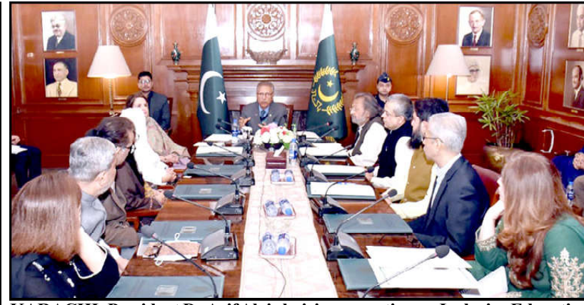
KARACHI: President Dr Arif Alvi chairing a meeting on Inclusive Education for Persons with Disabilities.

"Various groups and political parties have expressed significant reservations regarding anticipated difficulties in ensuring the participation of residents in cold areas during the election process." It noted that the recent incidents, including the foiled attempts on the lives of Jamiaat Ulema-e-Islam-Fazl (JUI-F) chief Maulana Fazlur Rehman and former MNA Mohsin Dawar,