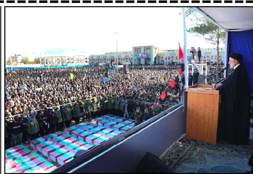
Iran's President Ebrahim Raisi speaks during a funeral ceremony in Kerman, Iran.

People's Republic of Korea recently provided Russia with ballistic missile launchers and several ballistic missiles," said Kirby, using the official name of North Korea. On Dec. 30, he said, "Russian forces launched at least one of these North Korean ballistic missiles into Ukraine," adding that it appeared to have landed in open field. Then on Tuesday Russia launched "multiple" North Korean missiles as part of a broader wave of heavy air strikes, Kirby said. Washington was still assessing the impact of those missiles.