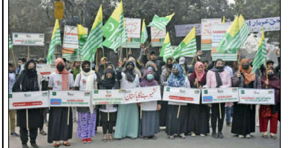
LAHORE: Activists of Youth Forum for Kashmir holds placards and shouting slogans during protest against the Indian oppression, to mark the Self-Determination Day, in Provincial Capital.

Independent Report KAHOTA (APP): Two people lost their lives when a jeep collided with a motorcycle near Kanil, Kahota on Friday here. According to Police, The incident occurred in the jurisdiction of Kahota police station, two lives were tragically lost as a jeep and a motorcycle collided. The collision occurred in the Kanil area, sending shock waves through the community and prompting swift action from the local police.