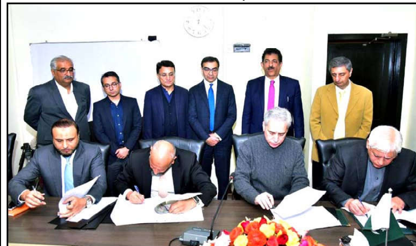
ISLAMABAD: Power Division and K-Electric ink landmark agreements, in the presence of Minister for Energy Muhammad Ali, providing energy security for Karachi held at Power Division in Islamabad.

The firm supply of energy from the National Grid is anticipated to provide affordable power to KE customers.