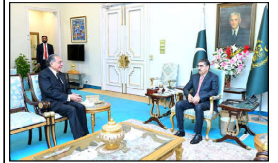
ISLAMABAD: Pakistan's Permanent Representative in UN Mr. Munir Akram calls on caretaker Prime Minister Anwaar-ul-Haq Kakar.

Bilawal pledged to provide Benazir cards to labourers, Kisan cards to farmers, and Jawan cards to the youth, directly addressing the prevailing issues of poverty, inflation and unemployment.