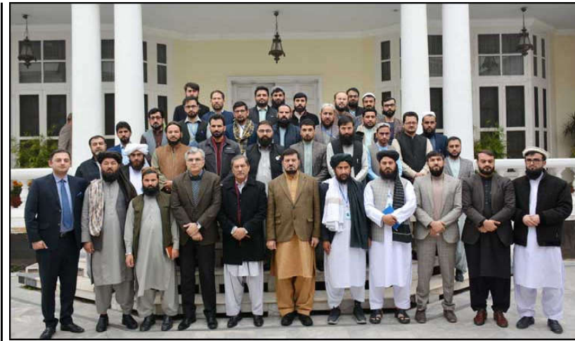
PESHAWAR: Khyber Pakhtunkhwa Governor Haji Ghulam Ali in a group photo with delegation of faculty members of Afghanistan Universities during their visit to Peshawar.

He said that capacity building of Afghan youth would further strengthen peace and led the country on course of progress and prosperity. He also stressed upon faculty members to provide students with knowledge and education enabling them to tap potential of Afghan natural resources.