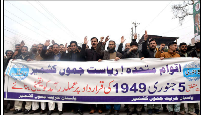
MUZAFFERABAD: Activists of Pasban-e-Hurriyat Jammu and Kashmir holds placards and shouting slogans during protest against the Indian oppression, to mark the Self-Determination Day, in City.