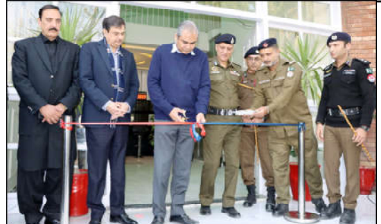
LAHORE: Caretaker Chief Minister Punjab Mohsin Naqvi cutting a ribbon of Police Station (Saddar) under Police Station up gradation project.

education expo. He said that the young generation is the valuable asset of the country, adding that it is important to provide them with proper guidance in the field of education. He said that the purpose of education is to impart knowledge to the youth and make them life-long learner. He said that it is very important to inculcate the habit of reading books among the students. He said that in this age of technology, e-books are also available, but there is no substitute for the satisfaction of reading books traditionally.