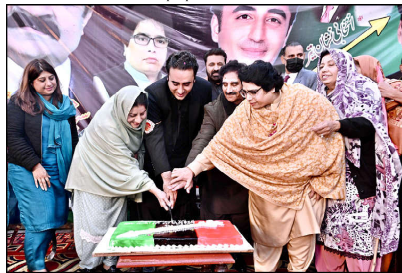
LAHORE: Chairman Pakistan People's Party Bilawal Bhutto Zardari cutting the 96th birthday cake of Shaheed Zulfikar Ali Bhutto at NA 127 Kot Lakhpat Pindi Rajputan.

He said that Britain can help Pakistan in various fields and told the British High Commissioner about the history of Karachi, its culture and de-