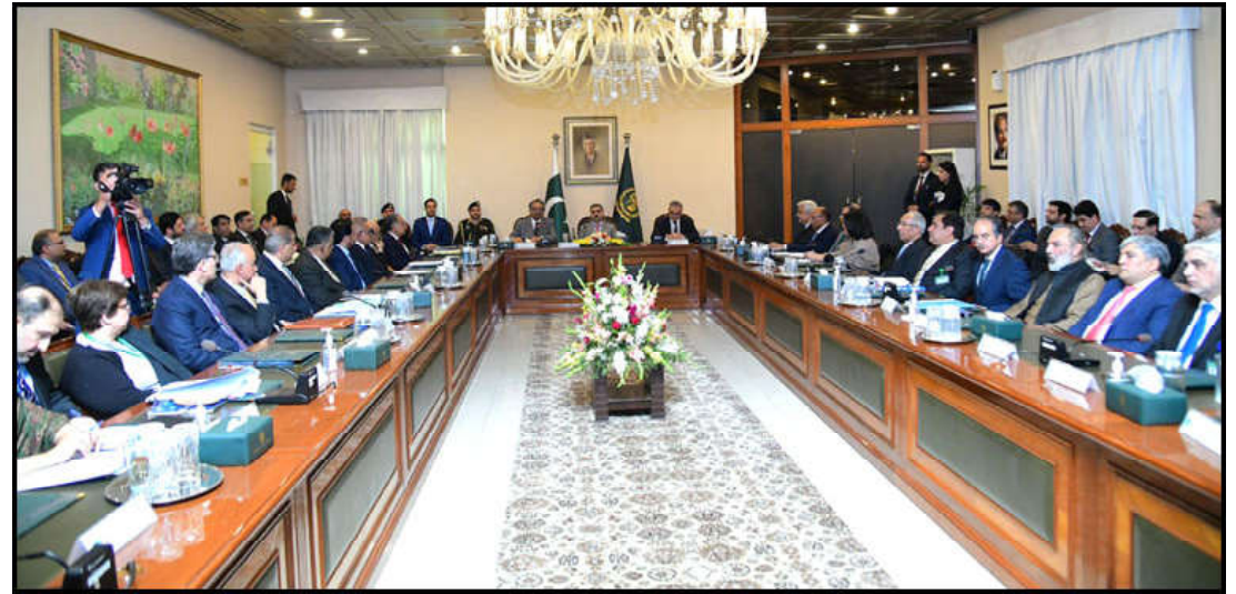
ISLAMABAD: Caretaker Prime Minister Anwaar-ul-Haq Kakar addresses the Envoys' Conference.

In his key-note address, the Prime Minister shared his perspective about the pressing demands on the conduct of Pakistan's foreign policy to align it with present-day imperatives.