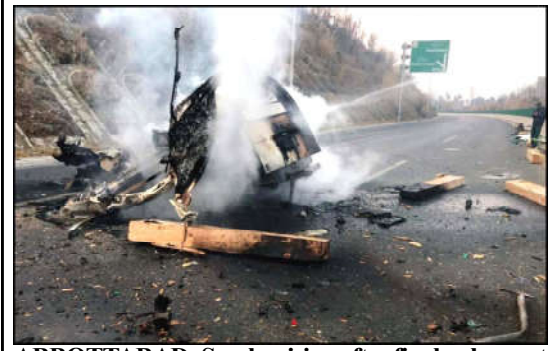
ABBOTTABAD: Smoke rising after fire broken out in a vehicle as the rescue 1122 workers are busy in extinguishing fire, near Qalandarabad interchange in Abbottabad.

The Mayor Karachi told the officials of the companies that the public had high expectations from us, so complete the feasibility study and process of generating energy from waste as soon as possible.