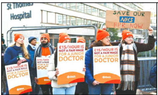
Doctors hold placards calling for better pay, as they stand on a picket line outside London's St Thomas Hospital on the first day of strike action.

tober 2022, taking over from the short-lived Liz Truss after Boris Johnson quit following a series of scandals. Speculation has been mounting about when Sunak will decide to hold the vote, as he tries to drive down inflation that peaked at nearly 11 percent and reboot economic growth. "My working assumption is we'll have a general election in the second half of this year," he told reporters. Sunak refused to rule out holding the poll on May 2 to coincide with local elections but indicated he wanted more time to get the economy back on an even keel. "I want to keep going, managing the economy well and cutting people's taxes. But I also want to keep tackling illegal migration," he said, referring to another key pledge. "So, I've got lots to get on with and I'm determined to keep delivering for the British people."