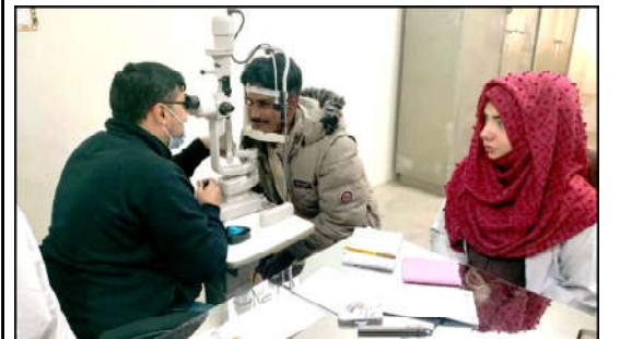
GARHI KHUDA BUX: Patient examine by doctor during the three-day free eye medical camp organized by Peoples Doctors Forum held at Rural Health Centre in Garhi Khuda Bux.