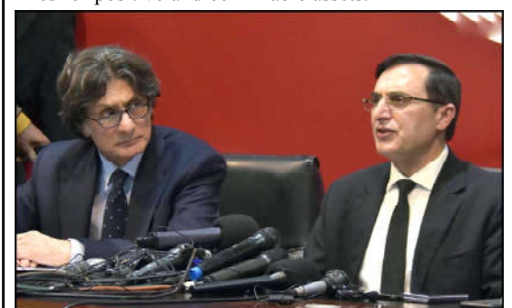
ISLAMABAD: Chairman of Pakistan Tehreek e Insaaf Barrister Gohar Ali Khan speaks during a press conference at party secretariat.

Mayor Karachi Barrister Murtaza Wahab met the editors of newspapers and other journalists and said that newspapers identify the problems of the city which guides us. Through newspapers and electronic channels, we easily communicate our performance to the public. Journalists associated with newspapers, magazines and electronic media are our valuable assets.