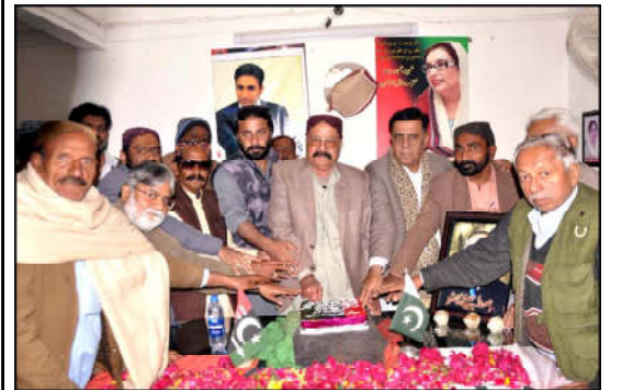
HYDERABAD: Leaders and activists of Peoples Party (PPP) are cutting cake as they are marking 96th Birthday Anniversary of Zulfikar Ali Bhutto, during celebration ceremony held in Hyderabad.

The court remarked we summer Attorney General (AG). The court while issuing notice to AG adjourned the hearing of the case for indefinite period.