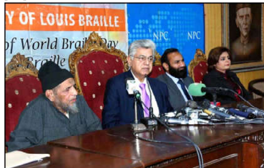
ISLAMABAD: Murtaza Solangi, Caretaker Federal Minister for Information and Broadcasting addressing an event organized by Pakistan Disabled Foundation for special persons at National Press Club.

He said special persons or differently-abled persons also had the right to vote.