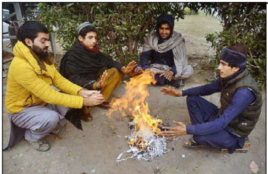
PESHAWAR: Vendors sitting around fire to keep them warm during cold weather in the city.

was "up to two years or with fine, or both" it was increased to "up to three years and shall also be liable to fine up to two hundred thousand rupees. In default of payment of fine additional imprisonment for three months." In schedule II, "may be arrested without warrant "non-bailable" has also been added. With regard to Section 148 the existing punishment was "up to three years or with fine, or both" has been replaced by "up to five years and shall also be liable to fine up to five hundred thousand rupees, which shall not be less than one hundred thousand rupees.