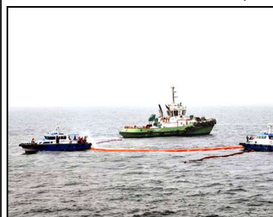
KARACHI: A view of marine oil spill exercise BARRACUDA XII conducted in Arabian Sea held under auspices of Pakistan Navy and Pakistan Maritime Security Agency.