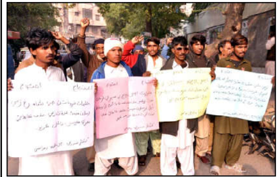
HYDERABAD: Residents of Khathar are holding protest demonstration against drug dealers in their area, at Hyderabad press club.

Across various districts, similar successes were evident. In the Hyderabad range, 1699 accused, 998 proclaimed offenders, and 2111 absconding accused were arrested, accompanied by the elimination of 59 dacoit gangs. Similar efforts in other ranges, such as Mirpurkhas, Shaheed Benazirabad, Sukkur, and Larkana, demonstrated significant arrests, encounter statistics, and gang neutralisations.