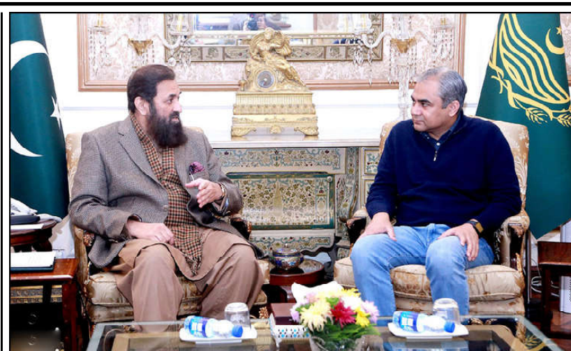
LAHORE: Caretaker Chief Minister Punjab Mohsin Naqvi in a meeting with Punjab Governor Muhammad Baligh-ur-Rehman.

According to the report released by CTD KP, "it says that there was an increase in terror financing cases during the past six years, and 90 terror financing cases were registered in KP during 2022 and 298 in 2023." A total of 960 people were named in terror financing cases, of which 311 were arrested and 44 were killed, reports said. A sum of Rs 13.46 million was recovered in terror financing, and in the Peshawar region, 46 cases in 2022 and 179 cases in 2023 were registered in that regard. One suspect was convicted in 179 cases of terror financing in the Peshawar region last year, and according to CTD, "Cases have also been registered for providing financial support to terrorists."