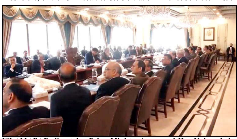
ISLAMABAD: Caretaker Prime Minister Anwaar-ul-Haq Kakar chairs a meeting of 8th meeting of Apex Committee of Special Investment Fa-