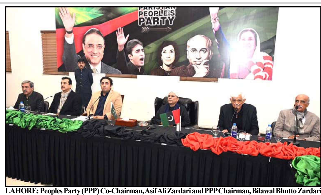
preside over Central Executive Committee (CEC) meeting of the party held at Bilawal House in Lahore.